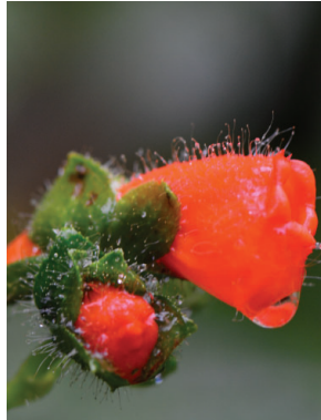
140 Gasteranthus imbaburensis FT