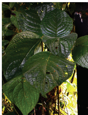
119 Drymonia dodsonii FT