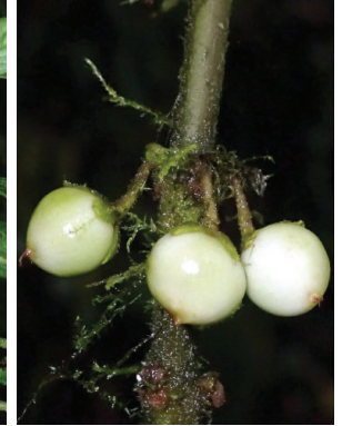
5 Besleria solanoides MP