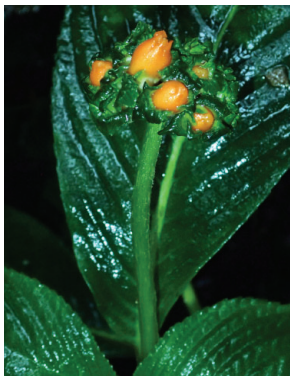
135 Gasteranthus corallinus MP