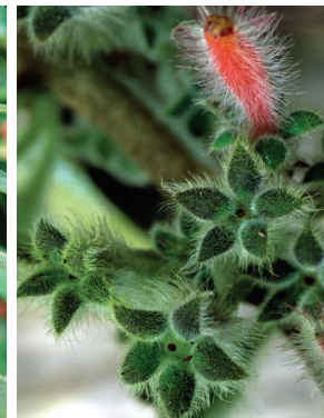
75 Columnnea rileyi JLC