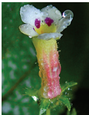
95 Diastema affine MP