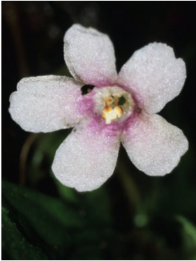
201 Napeanthus apodemus JLC

[fieldguides.fieldmuseum.org] [1323] version 1 2/2021