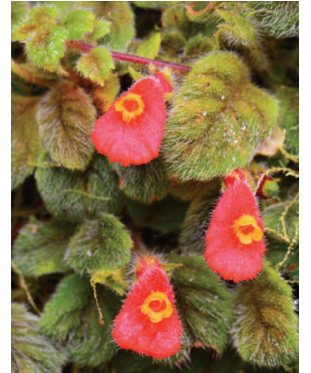
205 Pachycaulos nummularia FT