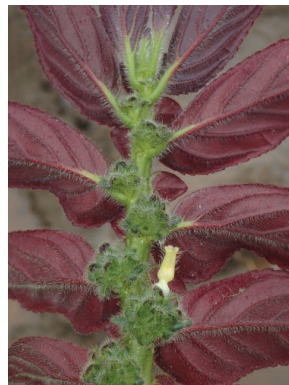
84 Columnnea spathulata MP