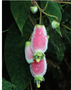
188 Kohleria affinis MP