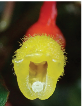
156 Glossoloma herthae MP