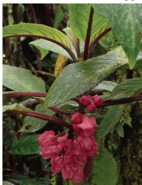
112 Drymonia collegarum MP