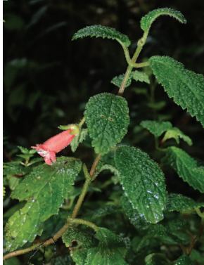
182 Heppiella repens MP