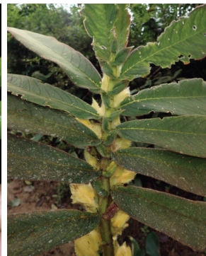
39 Columnnea eburnea MP