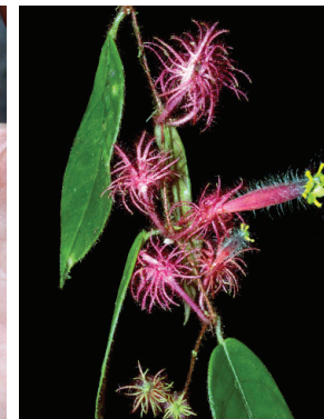
65 Columnnea minor JLC