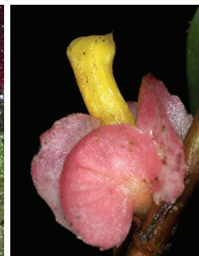
80 Columnnea rubricalyx JLC