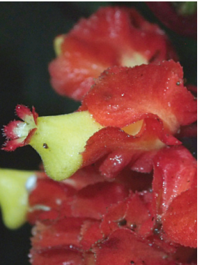
127 Drymonia teuscheri MP