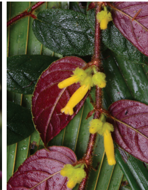
59 Columnea laciniata FT