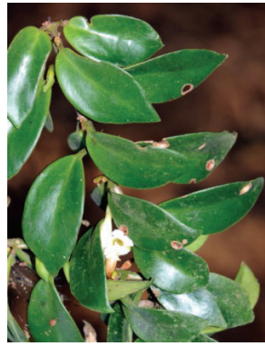
12 Codonanthispiss uleana JLC