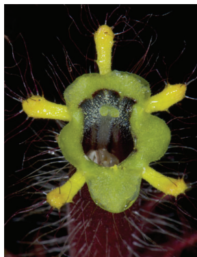
66 Columnnea minor JLC