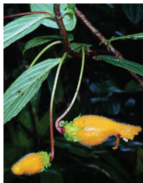
87 Columnnea strigosa MP