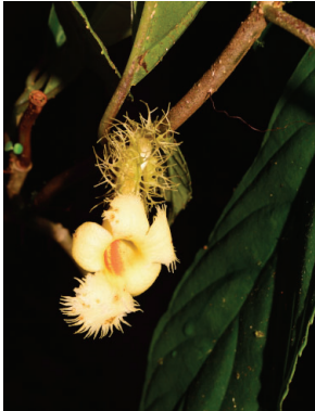
121 Drymonia laciniosa FT

[fieldguides.fieldmuseum.org] [1323] version 1 2/2021