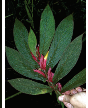
45 Columnea eubracteata JLC