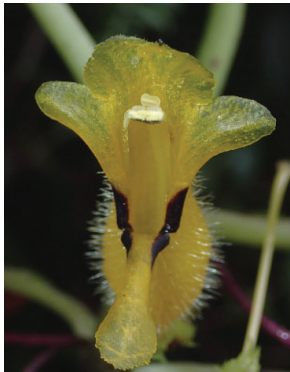
58 Columnea kucyniakii MP