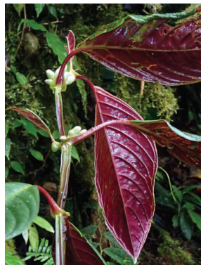
103 Drymonia brochidodroma MP