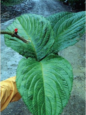
181 Glossoloma subglabrum MP

[fieldguides.fieldmuseum.org] [1323] version 1 2/2021