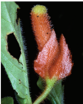
37 Columnnea dissimilis JLC