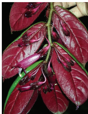
28 Columnnea ciliata MP