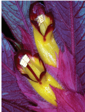
47 Columnea eubracteata JLC