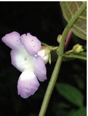
196 Monopyle macrocarpa MP