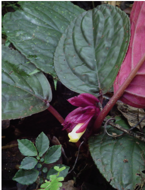
129 Drymonia turrialvae MP