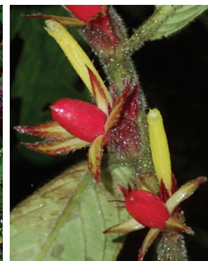
78 Columnnea rubriacuta MP