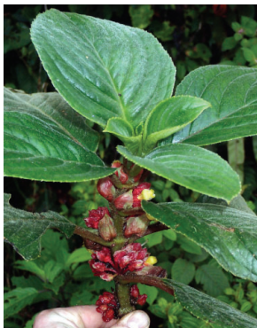
158 Glossoloma ichthyoderma MP