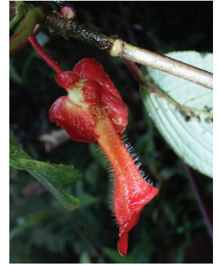
165 Glossoloma oblongicalyx MP