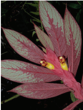
46 Columnea eubracteata JLC