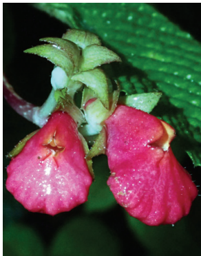
152 Gasteranthus quitensis MP