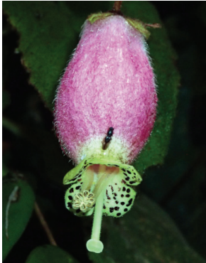
187 Kohleria affinis MP