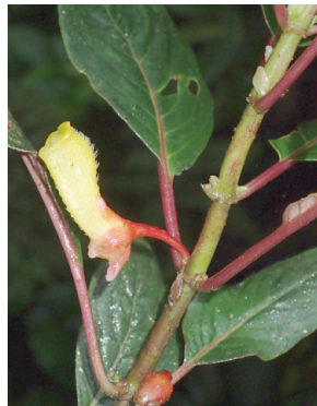
154 Glossoloma herthae MP