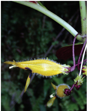
57 Columnea kucyniakii MP