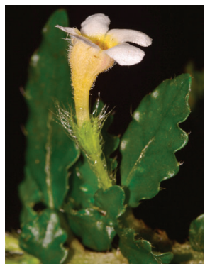
97 Diastema incisum FT