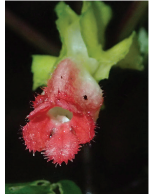
125 Drymonia tenuis MP