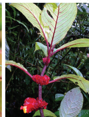
110 Drymonia collegarum MP