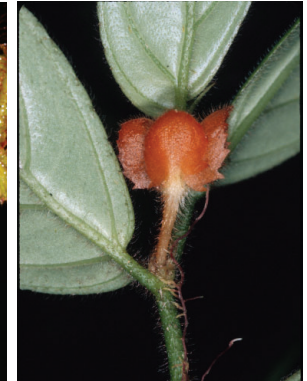
50 Columnea herthae JLC