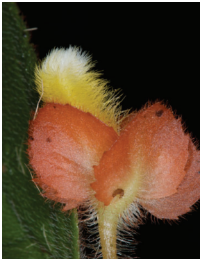
51 Columnea herthae JLC