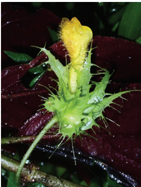
171 Glossoloma purpureum MP