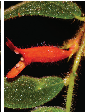
49 Columnea ferruginea FT