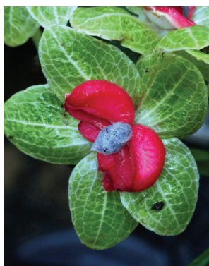
106 Drymonia brochidodroma MP