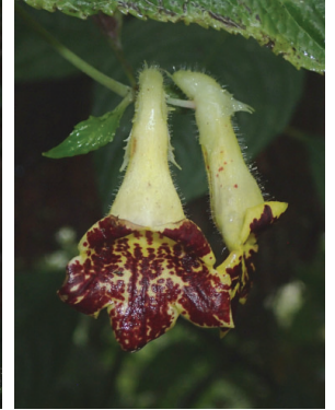
145 Gasteranthus leopardus MP