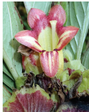
63 Columnnea medicinalis MP