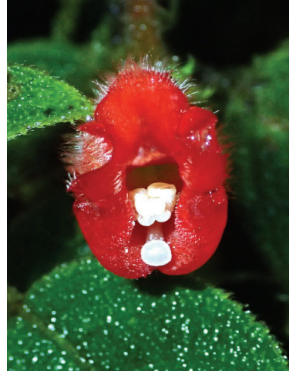
169 Glossoloma penduliflorum MP