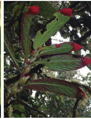
14 Columnnea albovinosa MP