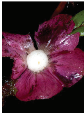
82 Columnnea rubricalyx JLC