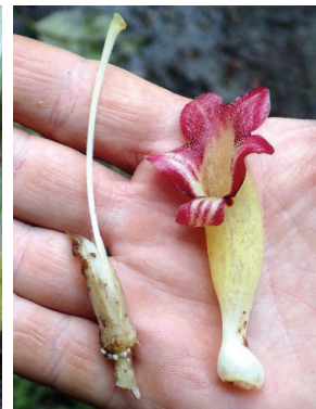
64 Columnnea medicinalis MP