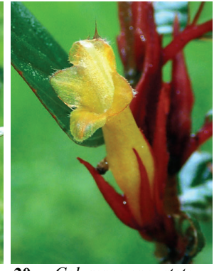
20 Columnnea angustata MP