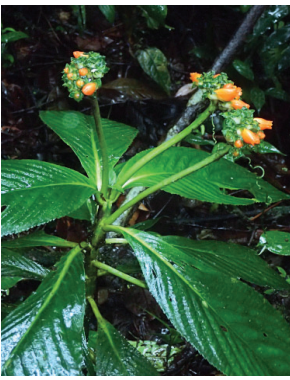
134 Gasteranthus corallinus MP