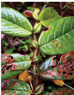
27 Columnnea ciliata MP