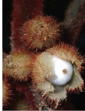
3 Besleria barclayi JLC