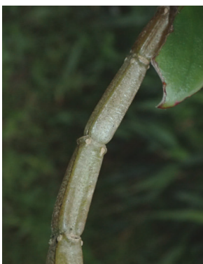
32 Columnnea crassicaulis MP