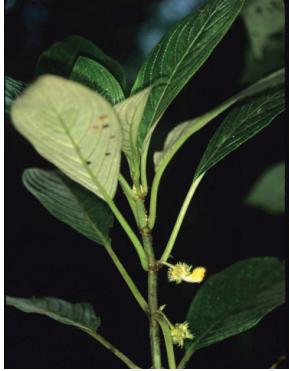
162 Glossoloma medusaeum JLC