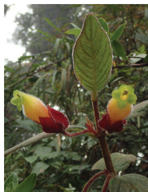
34 Columnnea dielsii MP