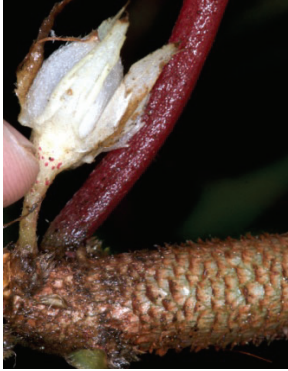
161 Glossoloma ichthyoderma JLC

[fieldguides.fieldmuseum.org] [1323] version 1 2/2021