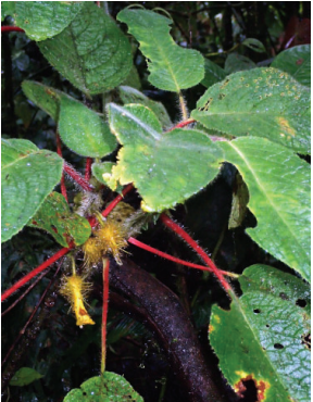
176 Glossoloma sprucei MP