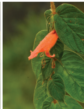
25 Columnnea ceticeps FT