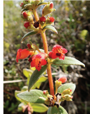
189 Kohleria spicata MP