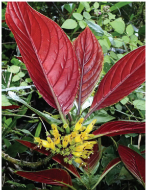
56 Columnea kucyniakii MP