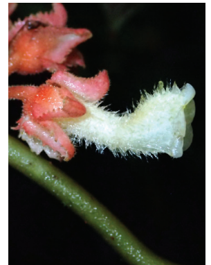
175 Glossoloma scandens MP