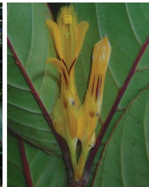
73 Columnnea picta MP