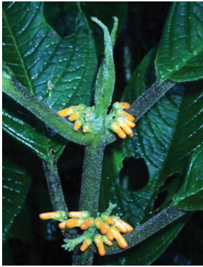
6 Besleria tambensis MP