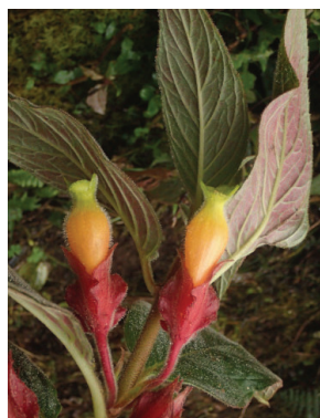
33 Columnnea dielsii MP