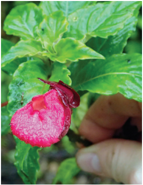
146 Gasteranthus magentatus MP