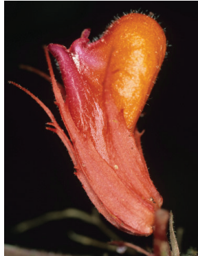
208 Trichodrymonia splendens JLC