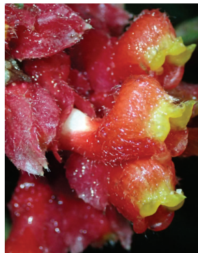
159 Glossoloma ichthyoderma MP