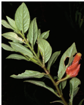
36 Columnnea dissimilis JLC