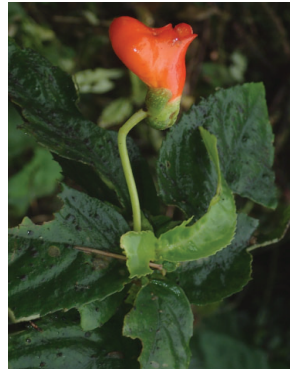
149 Gasteranthus pansamalanus MP