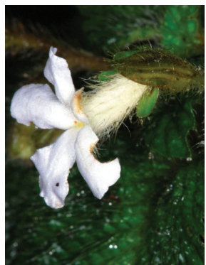
92 Cremosperma verticillatum JLC