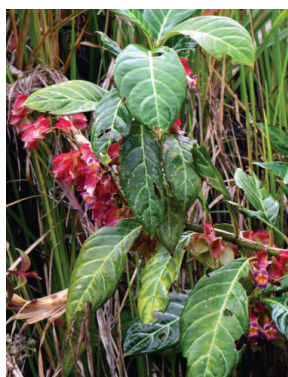
107 Drymonia chiribogana FT