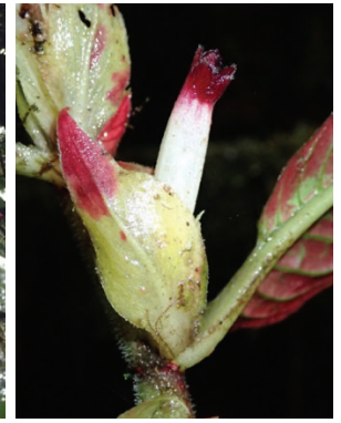
15 Columnnea albovinosa MP