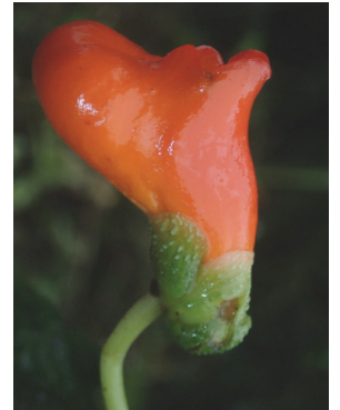
150 Gasteranthus pansamalanus MP