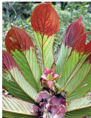
62 Columnnea medicinalis MP