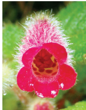
193 Kohleria villosa MP