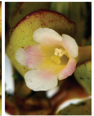
10 Codonanthispiss crassifolia FT