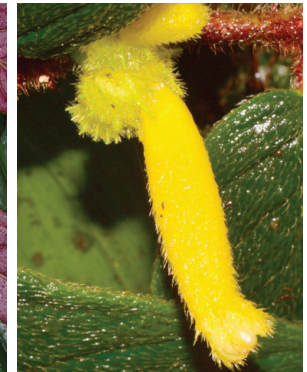
60 Columnea laciniata FT