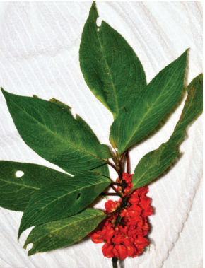
128 Drymonia teuscheri FT