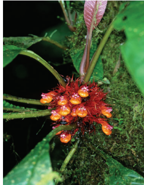
207 Trichodrymonia splendens JLC