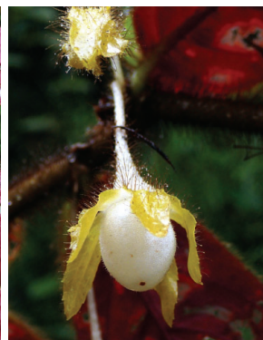
30 Columnnea ciliata MP