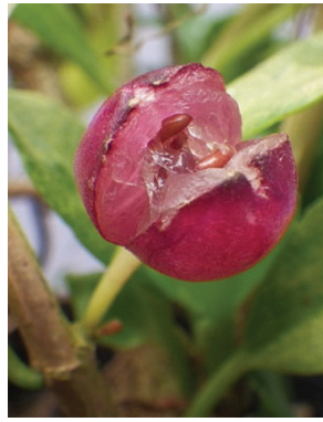
13 Codonanthispiss uleana MP