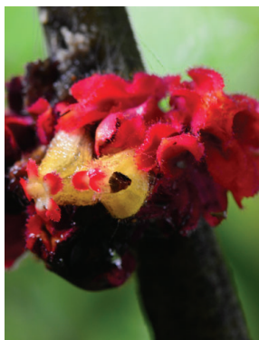
118 Drymonia dodsonii FT