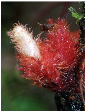
71 Columnnea parviflora JLC