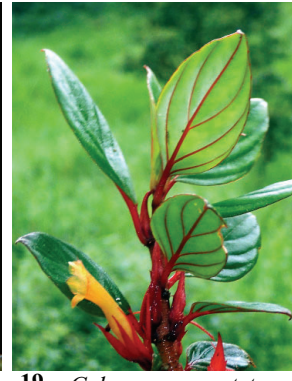
19 Columnnea angustata MP