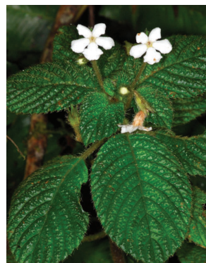
91 Cremosperma verticillatum JLC