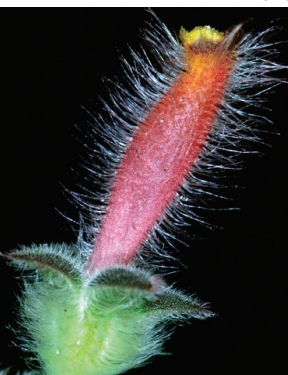
76 Columnnea rileyi JLC