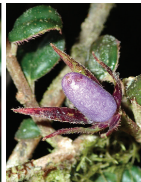
69 Columnnea ovatifolia MP