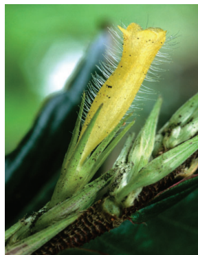
90 Columnnea tandapiana JLC