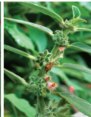
74 Columnnea rileyi JLC