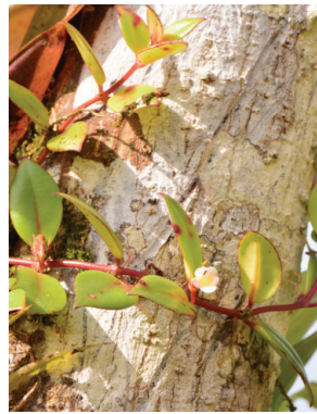
8 Codonanthispiss crassifolia FT