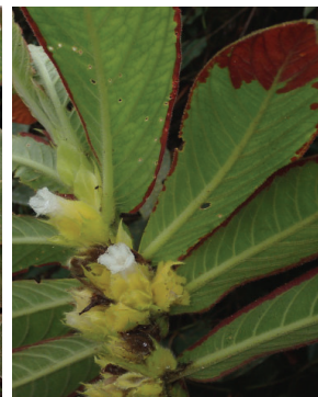
40 Columnnea eburnea MP