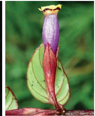
55 Columnea katzensteinii MP