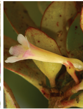
9 Codonanthispiss crassifolia FT