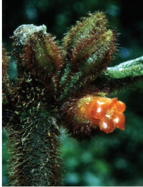
2 Besleria barclayi JLC