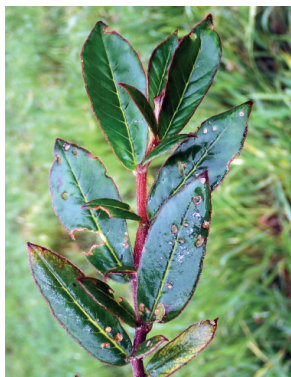
21 Columnnea byrsina MP

[fieldguides.fieldmuseum.org] [1323] version 1 2/2021