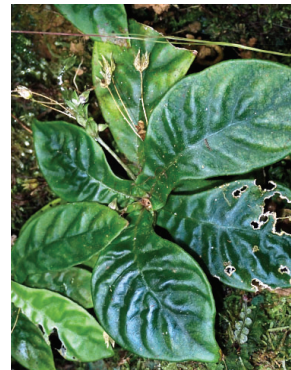
199 Napeanthus apodemus MP