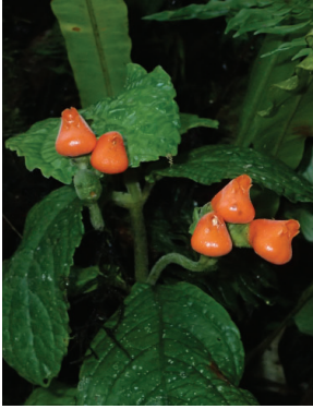
141 Gasteranthus lateralis MP

[fieldguides.fieldmuseum.org] [1323] version 1 2/2021