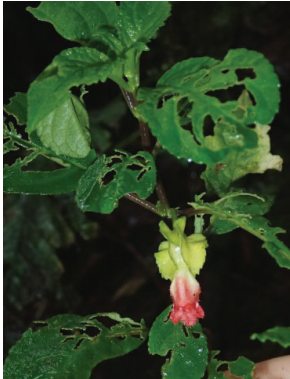
124 Drymonia tenuis MP