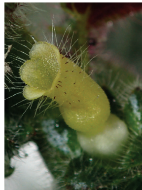
85 Columnnea spathulata MP