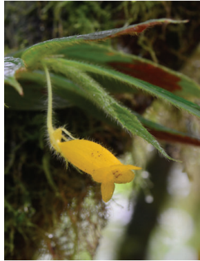
42 Columnea ericae FT