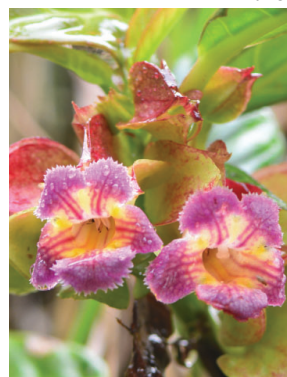
109 Drymonia chiribogana FT