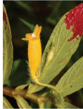
43 Columnea ericae FT