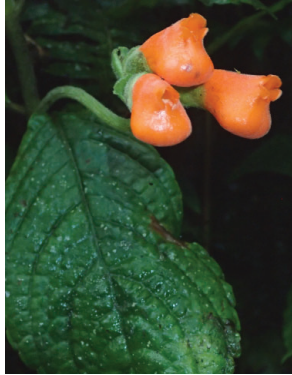
142 Gasteranthus lateralis MP