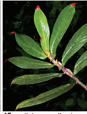
17 Columnnea albovinosa JLC