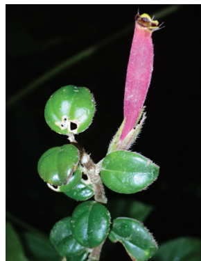
67 Columnnea ovatifolia MP