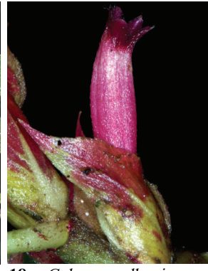
18 Columnnea albovinosa JLC