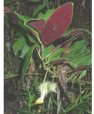
170 Glossoloma purpureum MP