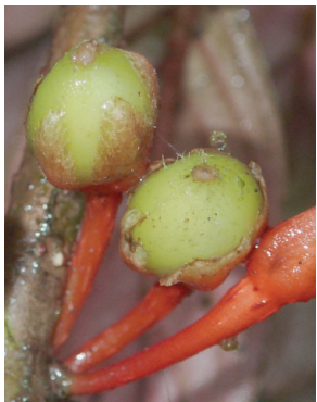
157 Glossoloma herthae MP