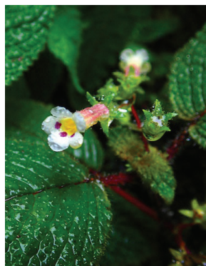
94 Diastema affine MP