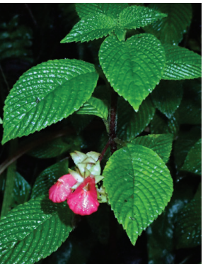
151 Gasteranthus quitensis MP