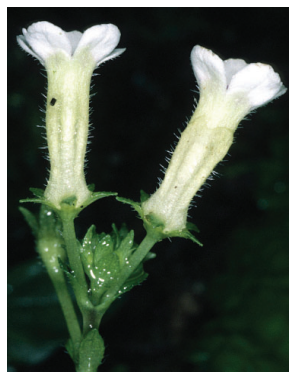
99 Diastema racemiferum JLC