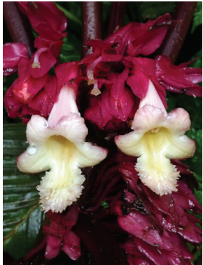
130 Drymonia turrialvae MP