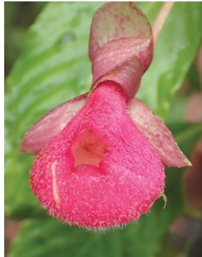
148 Gasteranthus magentatus MP