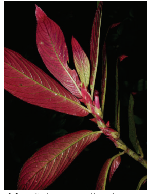
16 Columnnea albovinosa JLC