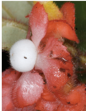
52 Columnea herthae JLC