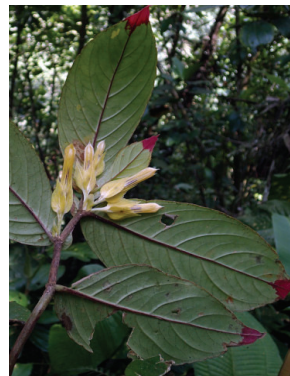
72 Columnnea picta MP