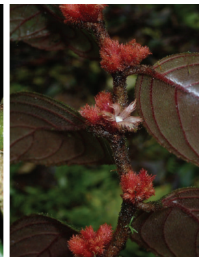
70 Columnnea parviflora JLC