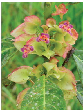
108 Drymonia chiribogana FT