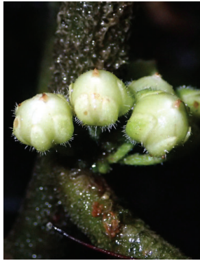
7 Besleria tambensis MP