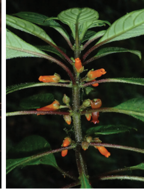
4 Besleria solanoides MP