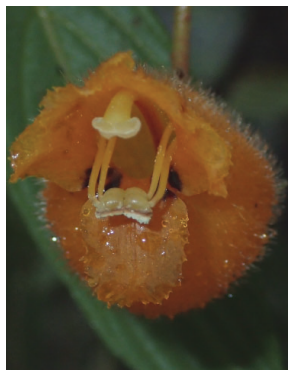
88 Columnnea strigosa MP