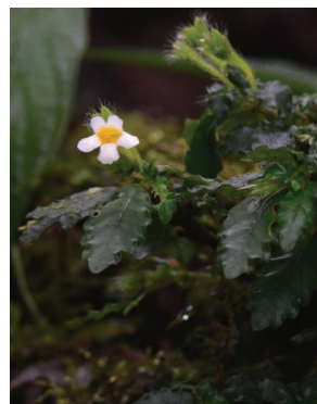
96 Diastema incisum FT