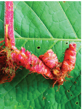
191 Kohleria spicata MP