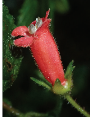
183 Heppiella repens MP