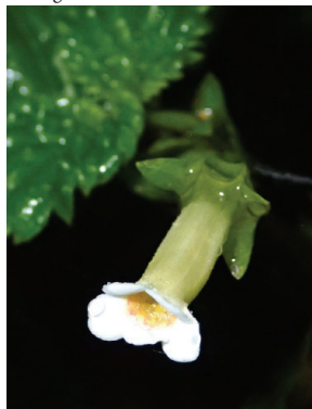
102 Diastema scabrum MP