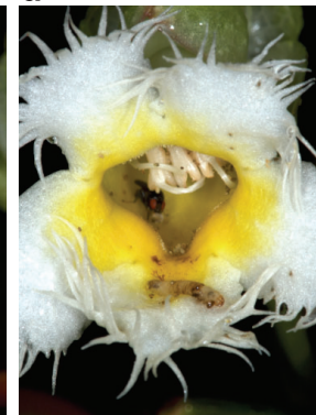
105 Drymonia brochidodroma JLC