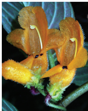
86 Columnnea strigosa MP