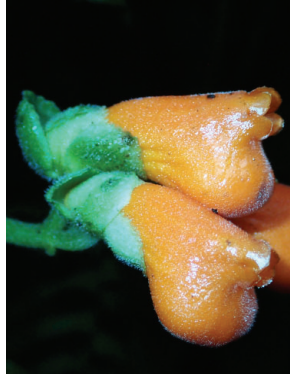
143 Gasteranthus lateralis MP