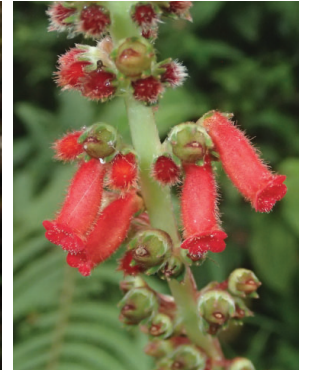
190 Kohleria spicata MP