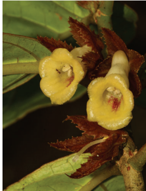
122 Drymonia macrophylla FT