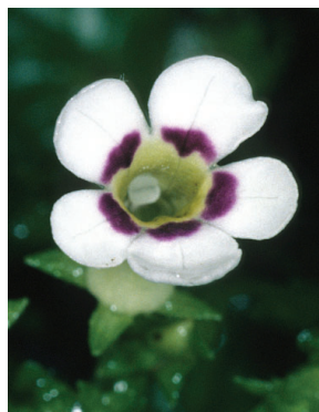
100 Diastema racemiferum JLC