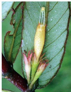
23 Columnnea byrsina MP