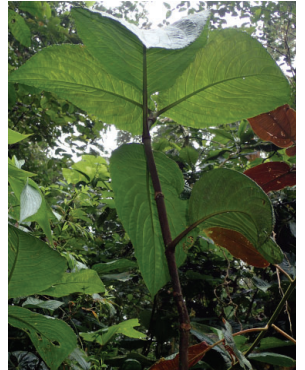
180 Glossoloma subglabrum MP