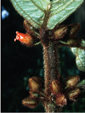
1 Besleria barclayi JLC

[fieldguides.fieldmuseum.org] [1323] version 1 2/2021