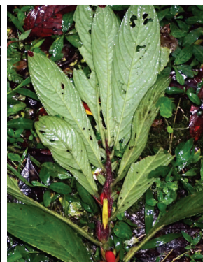
77 Columnnea rubriacuta MP