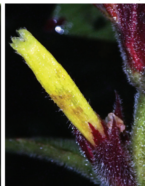
79 Columnnea rubriacuta MP