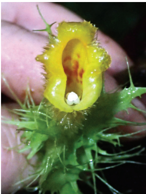
172 Glossoloma purpureum MP