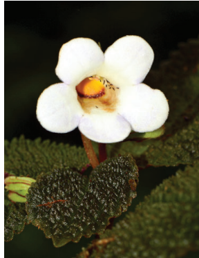
203 Nomopyle dodsonii FT