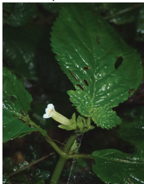
101 Diastema scabrum MP

[fieldguides.fieldmuseum.org] [1323] version 1 2/2021