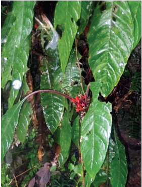
206 Trichodrymonia splendens MP