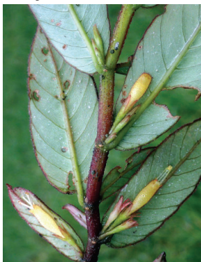
22 Columnnea byrsina MP