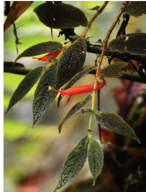
48 Columnea ferruginea FT