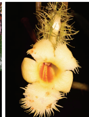
120 Drymonia laciniosa FT