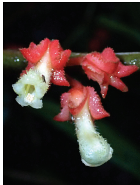
174 Glossoloma scandens MP