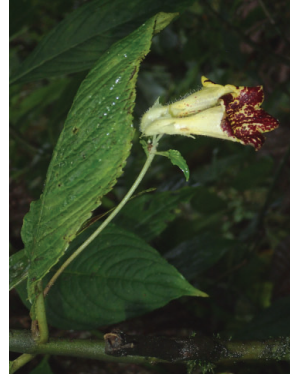
144 Gasteranthus leopardus MP