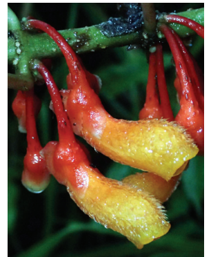
155 Glossoloma herthae MP