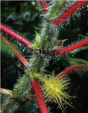
177 Glossoloma sprucei MP