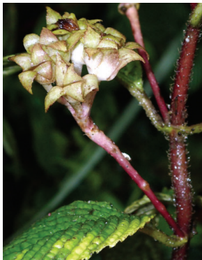
153 Gasteranthus quitensis MP