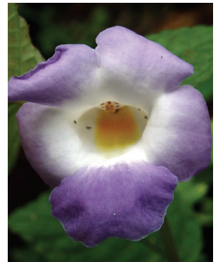
195 Monopyle macrocarpa MP