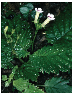
98 Diastema racemiferum JLC