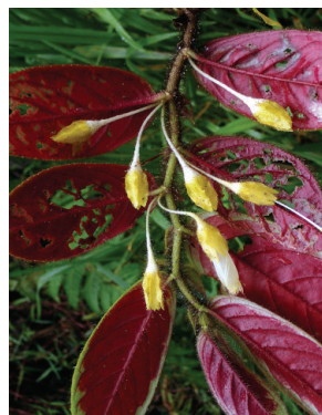
29 Columnnea ciliata MP