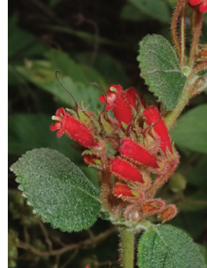
184 Heppiella ulmifolia MP