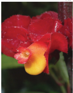
111 Drymonia collegarum MP