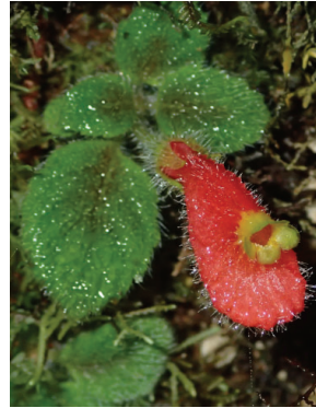
204 Pachycaulos nummularia MP