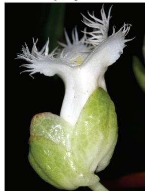
104 Drymonia brochidodroma JLC