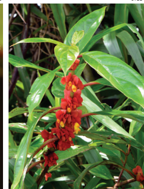
115 Drymonia coriacea FT