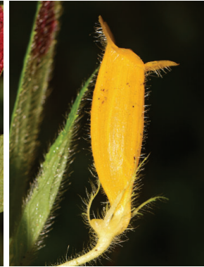
44 Columnea ericae FT