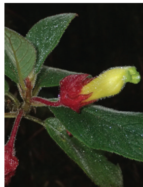
35 Columnnea dielsii MP