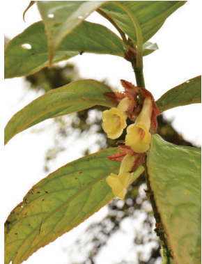
123 Drymonia macrophylla FT