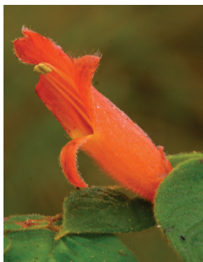
26 Columnnea ceticeps FT