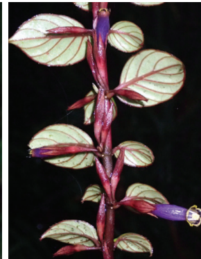
54 Columnea katzensteinii MP