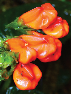
138 Gasteranthus crispus FT