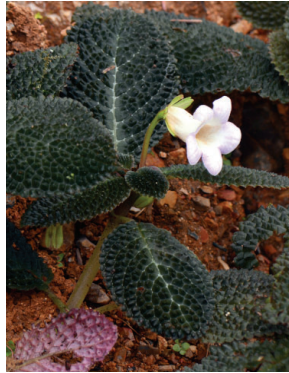
202 Nomopyle dodsonii FT