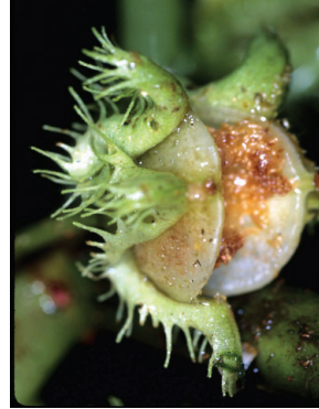
164 Glossoloma medusaeum JLC