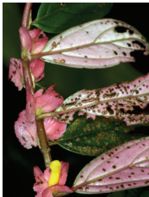
81 Columnnea rubricalyx JLC

[fieldguides.fieldmuseum.org] [1323] version 1 2/2021