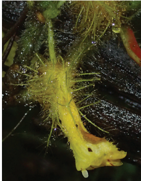
178 Glossoloma sprucei MP