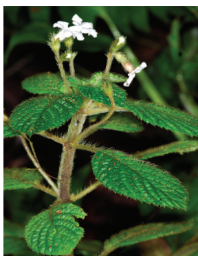
93 Cremosperma verticillatum JLC