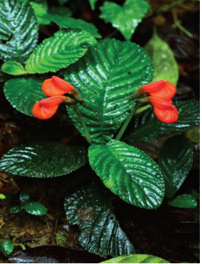
137 Gasteranthus crispus FT