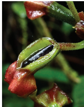
198 Monopyle macrocarpa MP