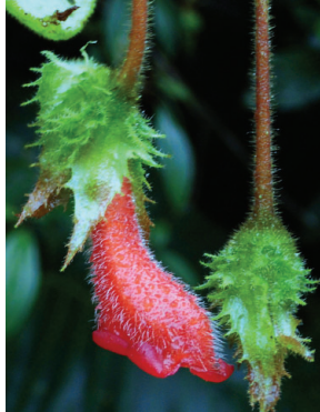
168 Glossoloma penduliflorum MP