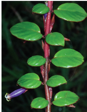
53 Columnea katzensteinii MP