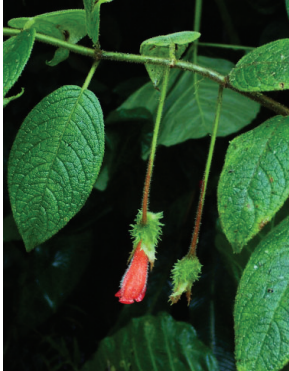
167 Glossoloma penduliflorum MP