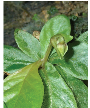
200 Napeanthus apodemus MP