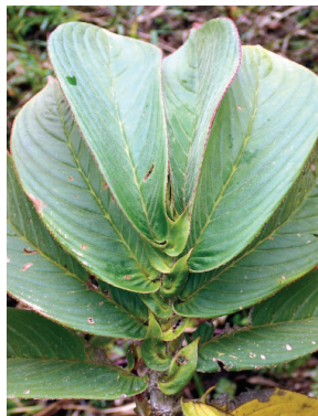
61 Columnnea medicinalis MP

[fieldguides.fieldmuseum.org] [1323] version 1 2/2021