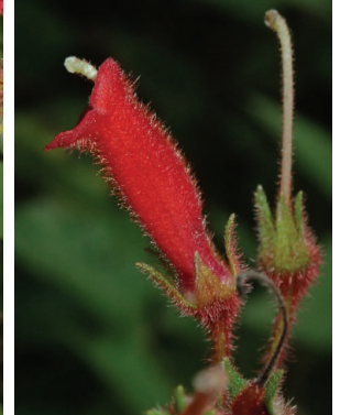
185 Heppiella ulmifolia MP