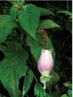
186 Kohleria affinis MP