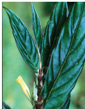
89 Columnnea tandapiana JLC