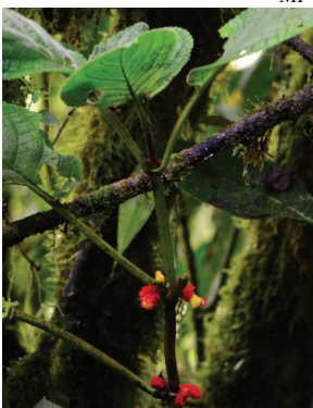
117 Drymonia dodsonii FT