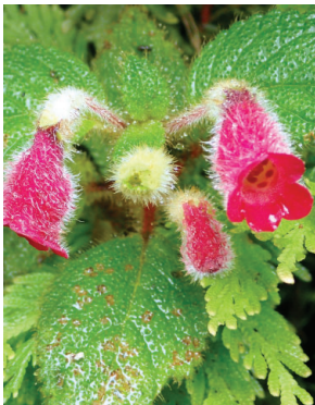
192 Kohleria villosa MP