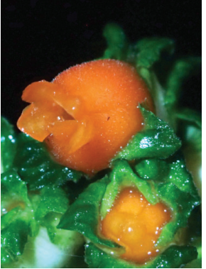
136 Gasteranthus corallinus MP