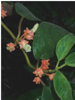
173 Glossoloma scandens MP