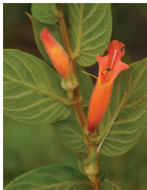
24 Columnnea ceticeps FT