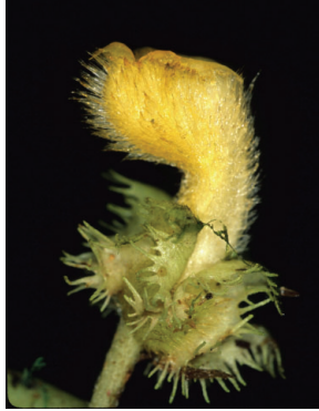
163 Glossoloma medusaeum JLC