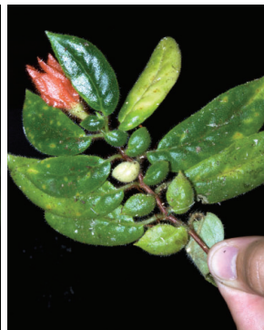
38 Columnnea dissimilis JLC