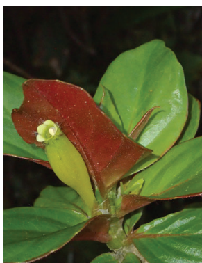
31 Columnnea crassicaulis MP