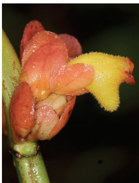
113 Drymonia coriacea JLC