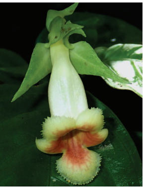
133 Drymonia warszewicziana MP