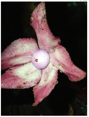
131 Drymonia turrialvae MP