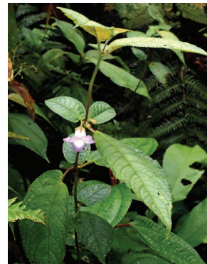
194 Monopyle macrocarpa MP