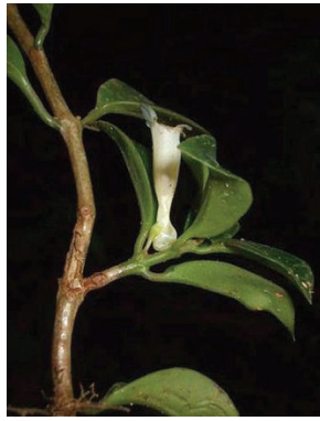
11 Codonanthispiss uleana