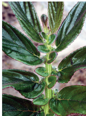
83 Columnnea spathulata MP