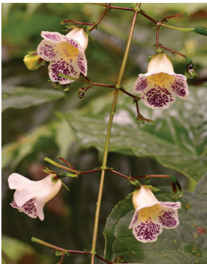
197 Monopyle macrocarpa FT