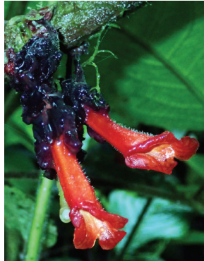
179 Glossoloma subglabrum MP