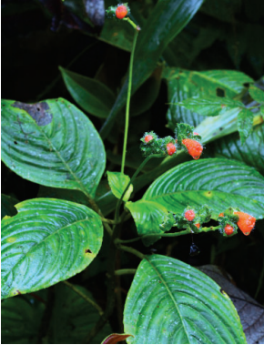
139 Gasteranthus imbaburensis FT