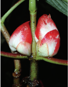
166 Glossoloma oblongicalyx MP