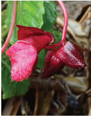
147 Gasteranthus magentatus MP