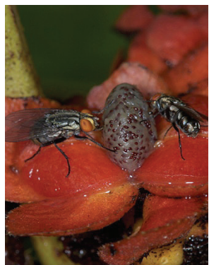
116 Drymonia coriacea JLC