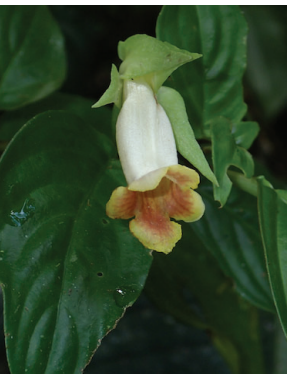
132 Drymonia warszewicziana MP