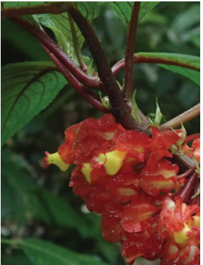
126 Drymonia teuscheri MP