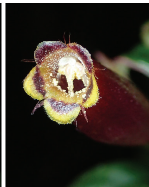
68 Columnnea ovatifolia MP