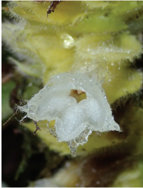
41 Columnea eburnea MP

[fieldguides.fieldmuseum.org] [1323] version 1 2/2021