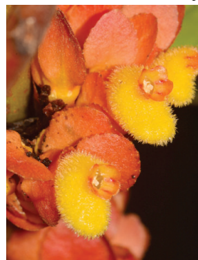
114 Drymonia coriacea FT