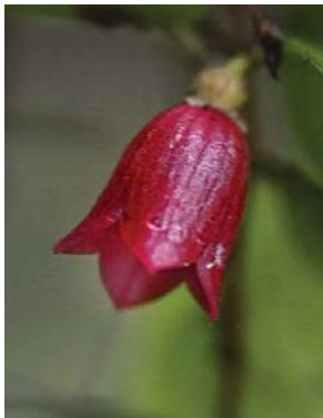
41 Sphyrsperrum dissimile ERICACEAE