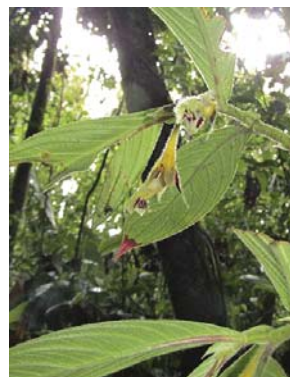
48 Columnea angulata GESNERIACEAE