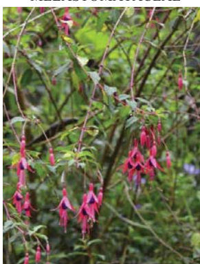
103 Fuchsia magellanica ONAGRACEAE