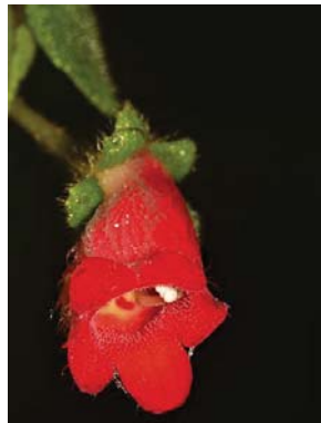
83 Kohleria villosa GESNERIACEAE