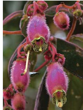
79 Kohleria affinis GESNERIACEAE