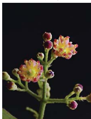
100 Miconia sp. 1 MELASTOMATACEAE