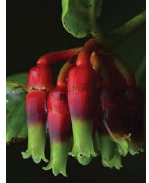
35 Psammisia sodiroi ERICACEAE