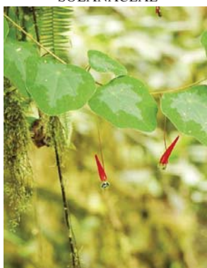
121 Tropaeolum adpressum TROPAEOLACEAE