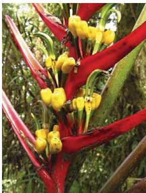
87 Heliconia burleana HELICONIACEAE