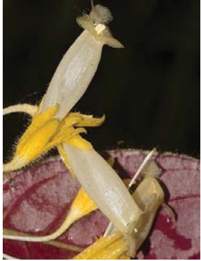
51 Columnea ciliata GESNERIACEAE