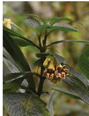
66 Gasteranthus leopardus GESNERIACEAE