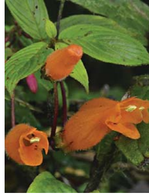
59 Columnea strigosa GESNERIACEAE