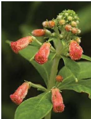
81 Kohleria spicata GESNERIACEAE