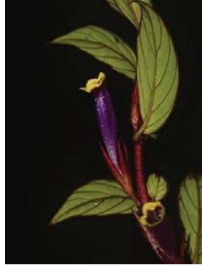
53 Columnea katzensteiniae GESNERIACEAE