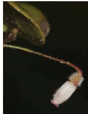
39 Sphyrsperrum buxifolium ERICACEAE