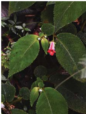
82 Kohleria villosa GESNERIACEAE