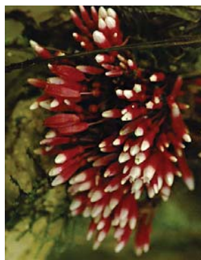
47 Thibaudia inflata ERICACEAE