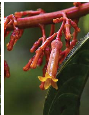
114 Palicourea sodiroi RUBIACEAE