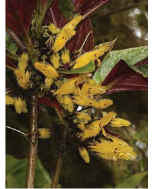
55 Columnea kucyniakii GESNERIACEAE