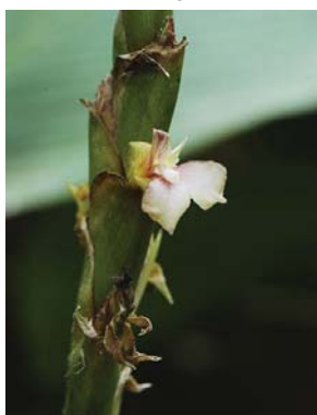
96 Calathea ischnosiphonoides MARANTACEAE