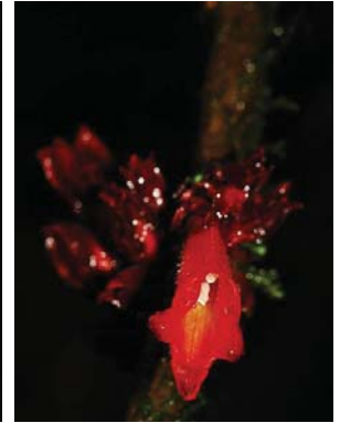
75 Glossoloma subglabrum GESNERIACEAE