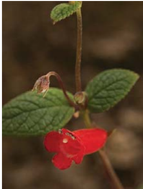
77 Heppiella ulmifolia GESNERIACEAE