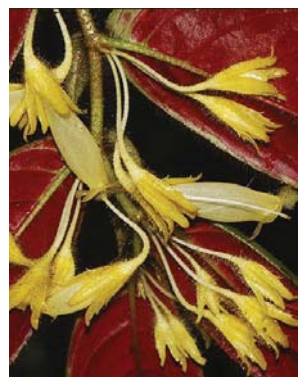
50 Columnea ciliata GESNERIACEAE