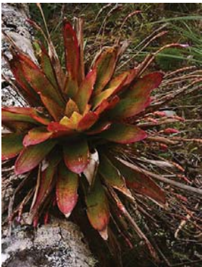
16 Tillandsia complanata BROMELIACEAE