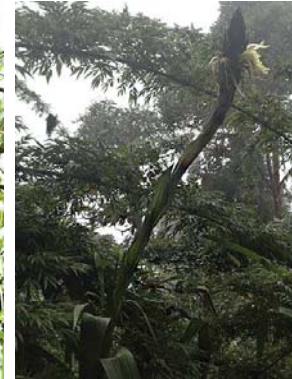
14 Pitcairnia fusca BROMELIACEAE