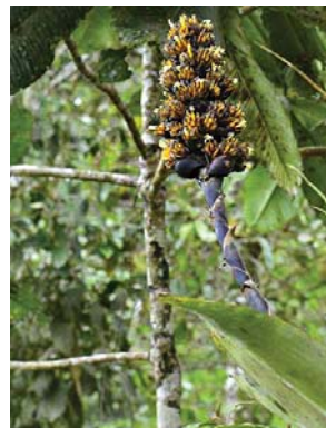
8 Guzmania teuscheri BROMELIACEAE