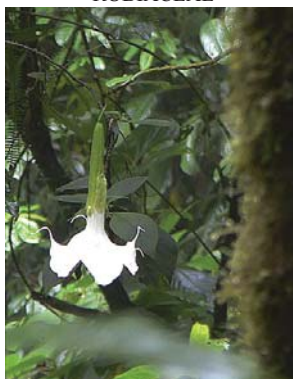
116 Brugmansia candida SOLANACEAE