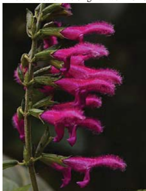
92 Salvia tortuosa LAMIACEAE