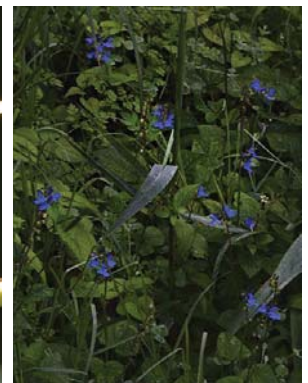
90 Salvia scutellarioides LAMIACEAE