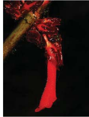
73 Glossoloma subglabrum GESNERIACEAE