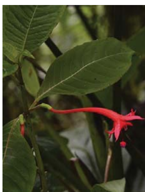
101 Fuchsia macrostigma ONAGRACEAE