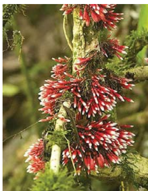
46 Thibaudia inflata ERICACEAE