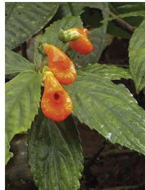
68 Gasteranthus pansamalanus GESNERIACEAE