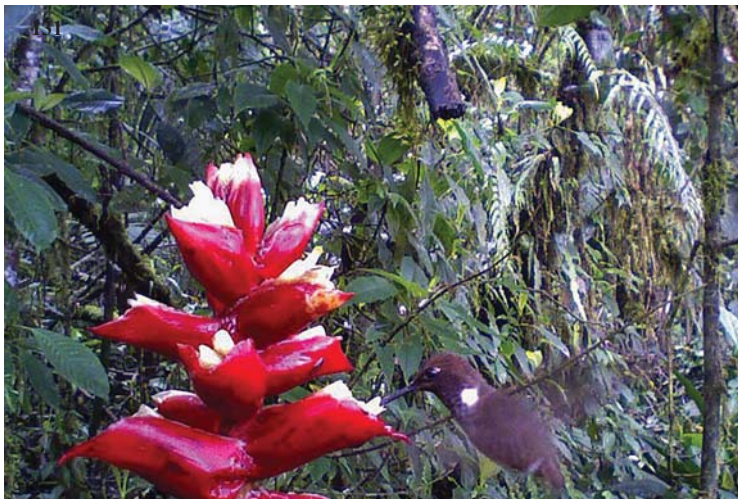
135 Coeligena wilsoni TROCHILIDAE Brown Inca