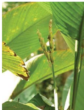
95 Calathea ischnosiphonoides MARANTACEAE