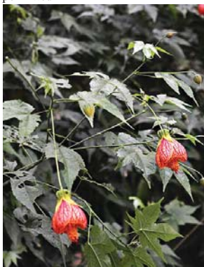
93 Abutilon pictum MALVACEAE