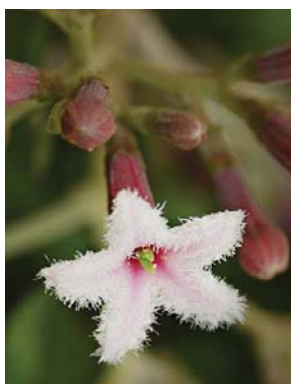
110 Cinchona pubescens RUBIACEAE