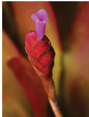
17 Tillandsia complanata BROMELIACEAE