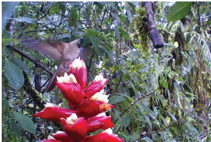
138 Heliodoxa rubinoides ♂ TROCHILIDAE Fawn-breasted Brilliant