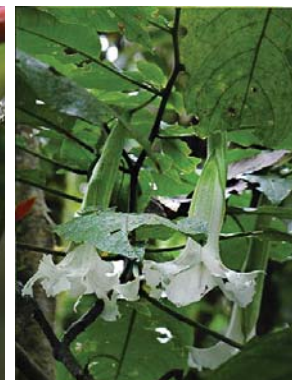
115 Brugmansia candida SOLANACEAE