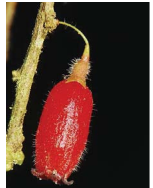
45 Sphyrsperrum sodiroi ERICACEAE