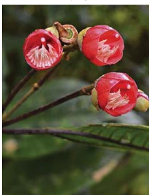
98 Meriania tomentosa MELASTOMATACEAE