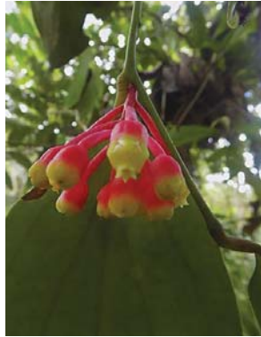
32 Psammisia flaviflora ERICACEAE