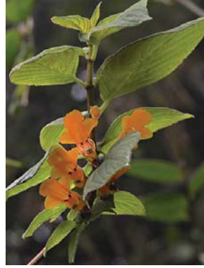
58 Columnea strigosa GESNERIACEAE