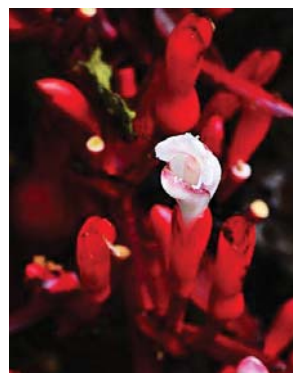
128 Renealmia ligulata ZINGIBERACEAE