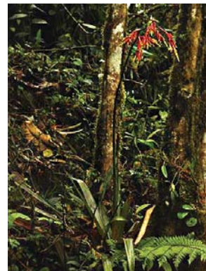
10 Guzmania xanthobracteata BROMELIACEAE