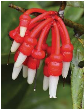
36 Psammisia ulbrichiana ERICACEAE