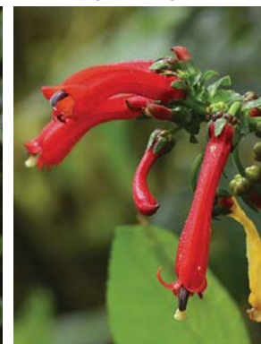
24 Centropogon solanifolius CAMPANULACEAE