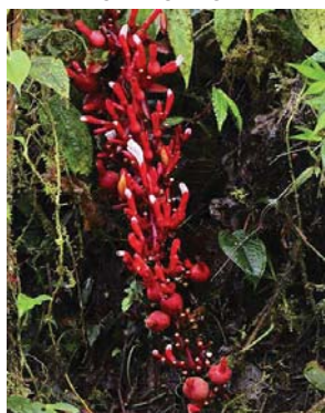
127 Renealmia ligulata ZINGIBERACEAE