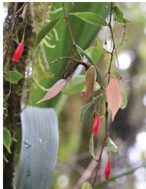
42 Sphyrsperrum grandifolium ERICACEAE