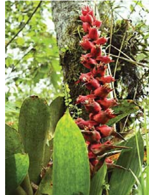
13 Mezobromelia capituligera BROMELIACEAE