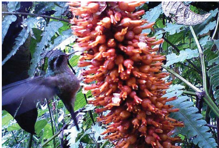
132 Adelomyia melanogenys TROCHILIDAE Speckled Hummingbird