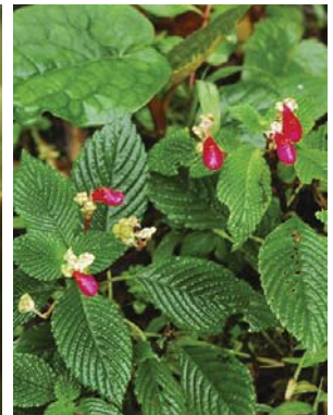
70 Gasteranthus quitensis GESNERIACEAE