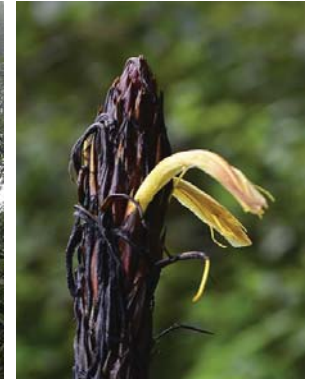
15 Pitcairnia fusca BROMELIACEAE