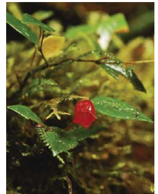
40 Sphyrsperrum dissimile ERICACEAE