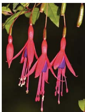
104 Fuchsia magellanica ONAGRACEAE