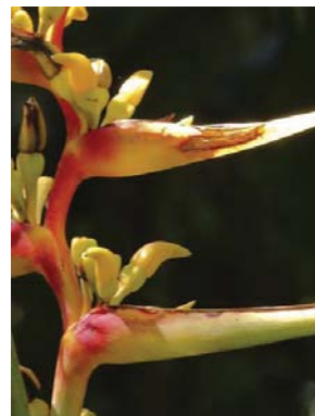
89 Heliconia impudica HELICONIACEAE