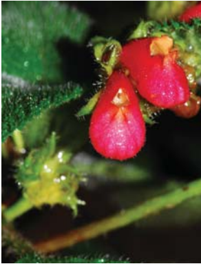
70 Gasteranthus quitensis GESNERIACEAE