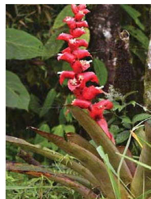
4 Guzmania danielii BROMELIACEAE