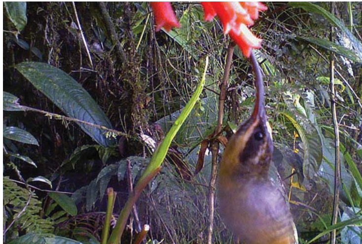
140 Phaethornis syrmatophorus TROCHILIDAE Tawny-bellied Hermit