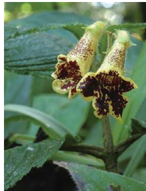
67 Gasteranthus leopardus GESNERIACEAE