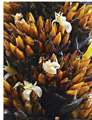
9 Guzmania teuscheri BROMELIACEAE