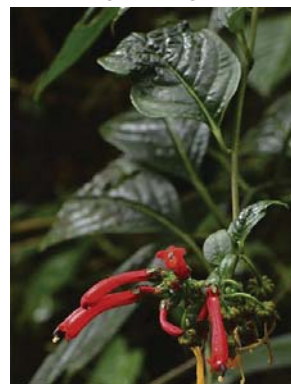
23 Centropogon solanifolius CAMPANULACEAE