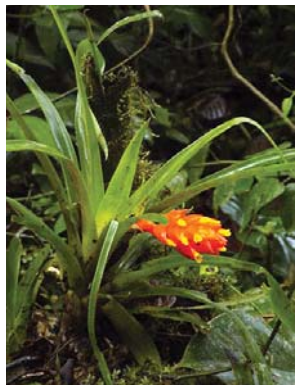
6 Guzmania jaramilloi BROMELIACEAE