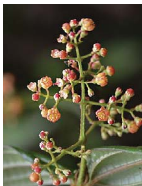
99 Miconia sp. 1 MELASTOMATACEAE