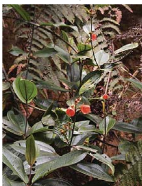
97 Meriania tomentosa MELASTOMATACEAE