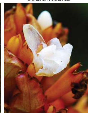
124 Renealmia aurantifera ZINGIBERACEAE