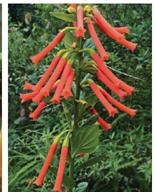
25 Macleania bullata ERICACEAE