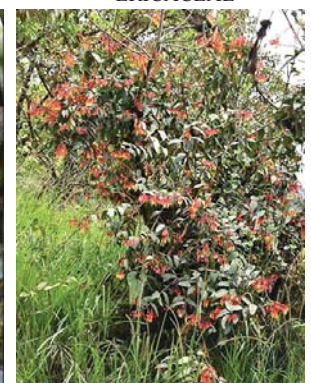
30 Psammisia ecuadorensis ERICACEAE