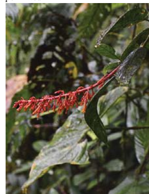
113 Palicourea sodiroi RUBIACEAE