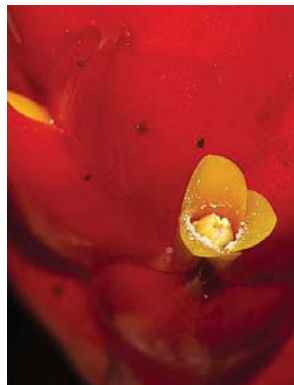
7 Guzmania jaramilloi BROMELIACEAE