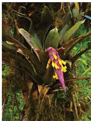
2 Guzmania bracteosa BROMELIACEAE