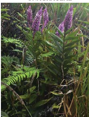
107 Elleanthus smithii ORCHIDACEAE