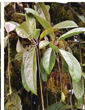
119 Trianaea speciosa SOLANACEAE