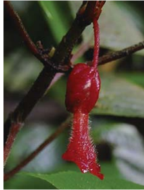
72 Glossoloma oblongicalyx GESNERIACEAE