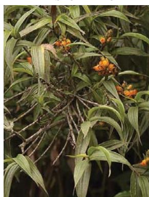
105 Elleanthus aurantiacus ORCHIDACEAE