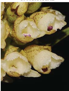
106 Elleanthus aurantiacus ORCHIDACEAE