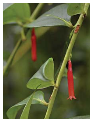
28 Macleania tropica ERICACEAE