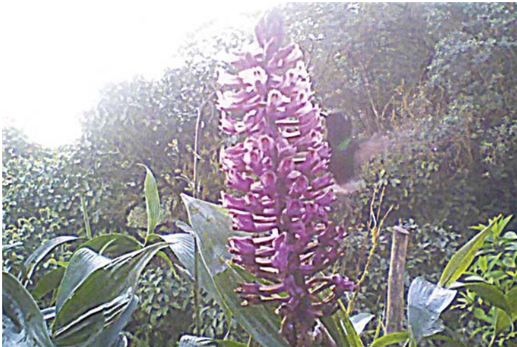
139 Ocreatus underwoodii ♂ TROCHILIDAE Booted Racket-tail