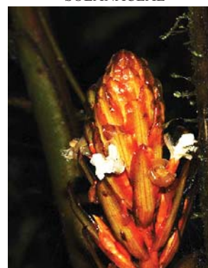
123 Renealmia aurantifera ZINGIBERACEAE