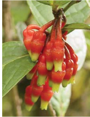
33 Psammisia oreogenes ERICACEAE