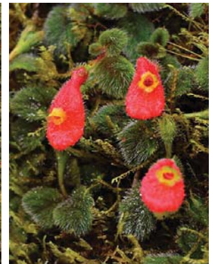
85 Pachycaulos nummularia GESNERIACEAE