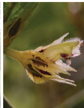
49 Columnea angulata GESNERIACEAE