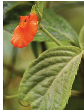
69 Gasteranthus pansamalanus GESNERIACEAE