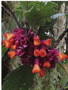
62 Drymonia collegarum GESNERIACEAE