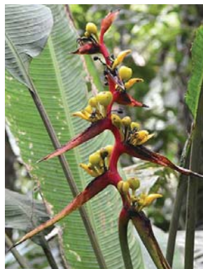
88 Heliconia impudica HELICONIACEAE