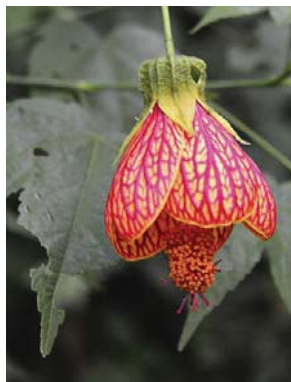
94 Abutilon pictum MALVACEAE