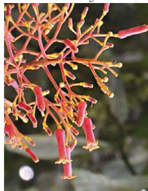
112 Palicourea demissa RUBIACEAE