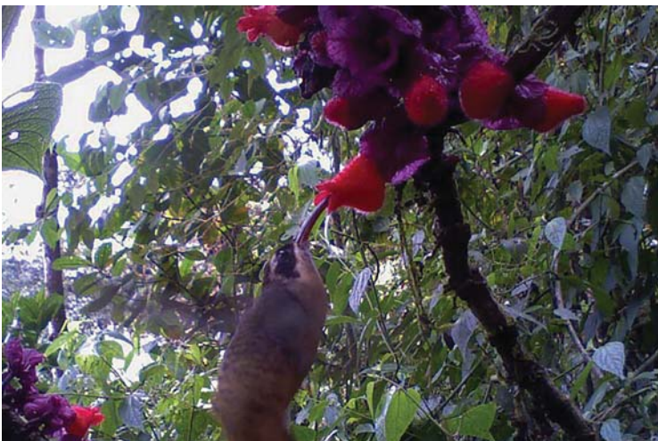
141 Phaethornis syrmatophorus TROCHILIDAE Tawny-bellied Hermit