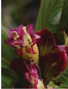
57 Columnea medicinalis GESNERIACEAE