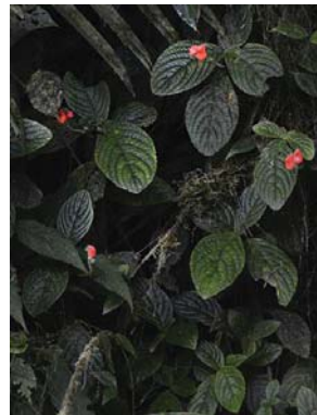
64 Gasteranthus lateralis GESNERIACEAE