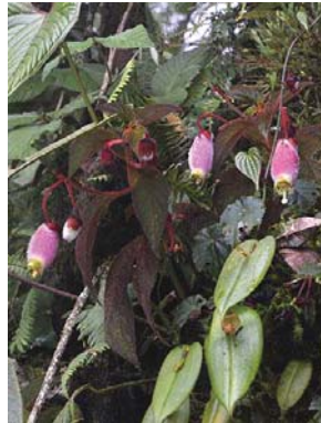
78 Kohleria affinis GESNERIACEAE