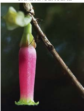
26 Macleania recumbens ERICACEAE