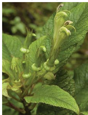
22 Centropogon nigricans CAMPANULACEAE