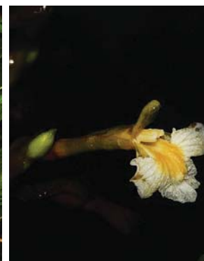
130 Renealmia oligotricha ZINGIBERACEAE