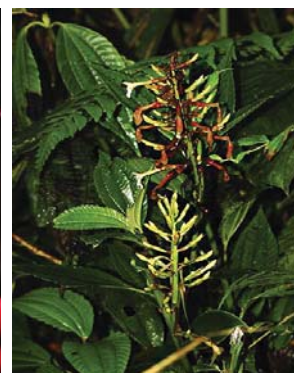
129 Renealmia oligotricha ZINGIBERACEAE