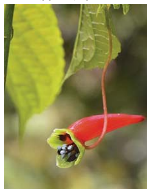
122 Tropaeolum adpressum TROPAEOLACEAE