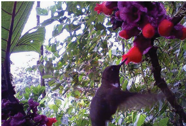
136 Coeligena wilsoni TROCHILIDAE Brown Inca