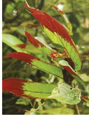
56 Columnea medicinalis GESNERIACEAE