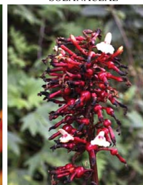
125 Renealmia fragilis ZINGIBERACEAE