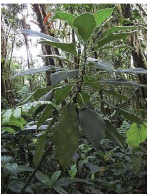
21 Centropogon nigricans CAMPANULACEAE