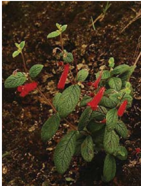
76 Heppiella ulmifolia GESNERIACEAE