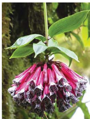
1 Bomarea pardina ALSTROEMERIACEAE

Puyucunapi Reserve has an experimental restoration project run by Mindo Cloud Forest Foundation (MCF). The property encompasses 200 hectares of a heterogeneous habitat consisting of remnants of cloud forest patches embedded in a matrix of pastureland. At this site, MCF Foundation keeps a greenhouse in which several native tree species are propagated, with the aim to restore former pasture land and connect patches of remnant vegetation. The farm stretches over an elevation gradient of 1800 to 2200 meters of elevation and is surrounded by many other reserves in the study area. In the course of our Ecology of Plant Hummingbird Interactions Project (EPHI) we sampled hummingbird and hummingbird-visited plants, and their interactions. We have recorded 11 species of hummingbirds visiting 74 species of plants. We hope that the information presented in this guide may help guide future restoration projects at this site. We thank the Tellkamp family and MCF Foundation for granting access to their land, and Pedro and Maikol Carlosama for their continuous support during our field activities.