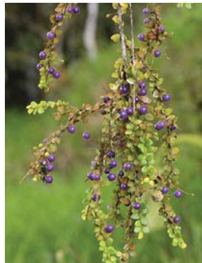
38 Sphyrsperrum buxifolium ERICACEAE