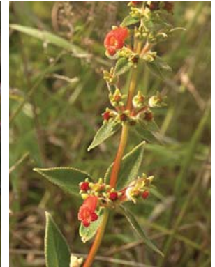
80 Kohleria spicata GESNERIACEAE