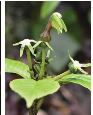
20 Burmeistera lutosa CAMPANULACEAE