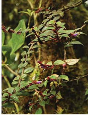
52 Columnea katzensteiniae GESNERIACEAE