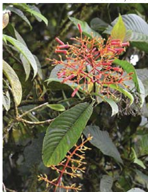
111 Palicourea demissa RUBIACEAE

[fieldguides.fieldmuseum.org] [1483] version 1 8/2022