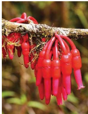
37 Psammisia ulbrichiana ERICACEAE