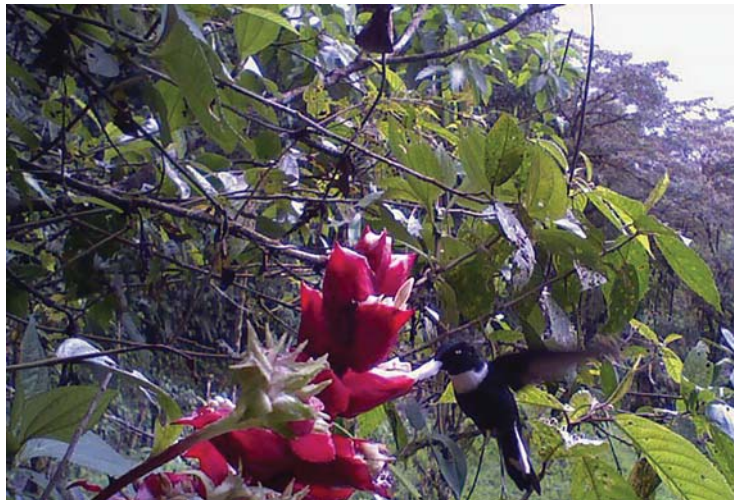
134 Coeligena torquata ♂ TROCHILIDAE Collared Inca