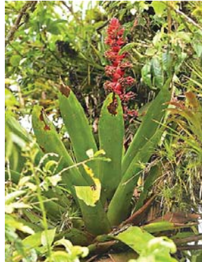
12 Mezobromelia capituligera BROMELIACEAE