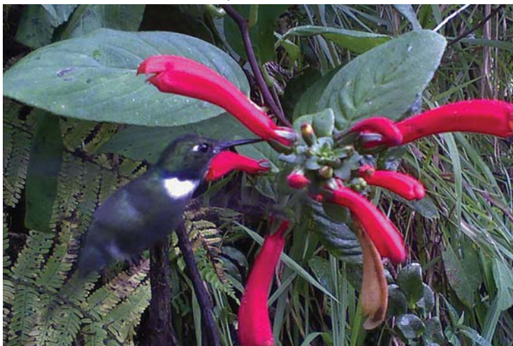
142 Schistes albogularis TROCHILIDAE Choco Daggerbill