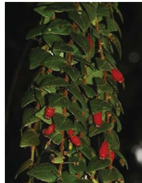
44 Sphyrsperrum sodiroi ERICACEAE