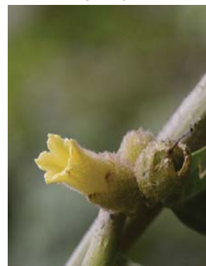
118 Cuatresia exiguiflora SOLANACEAE