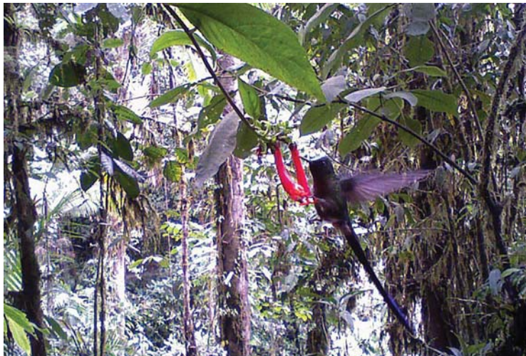
133 Aglaiocercus coelestis ♂ TROCHILIDAE Violet-tailed Sylph