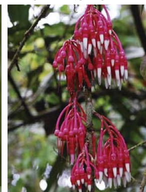
29 Psammisia aberrans ERICACEAE