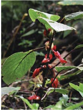
71 Glossoloma oblongicalyx GESNERIACEAE