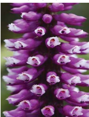
108 Elleanthus smithii ORCHIDACEAE