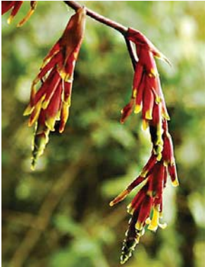
11 Guzmania xanthobracteata BROMELIACEAE