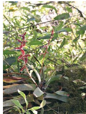
18 Tillandsia truncata BROMELIACEAE