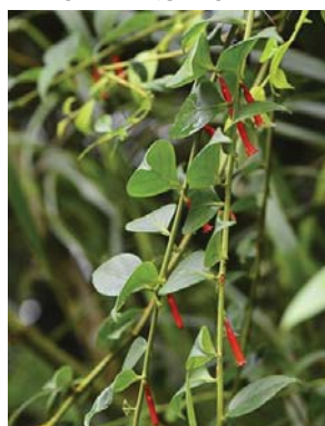
27 Macleania tropica ERICACEAE