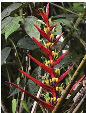
86 Heliconia burleana HELICONIACEAE