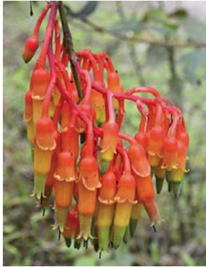
31 Psammisia ecuadorensis ERICACEAE