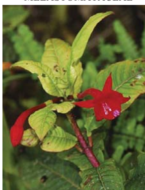
102 Fuchsia macrostigma ONAGRACEAE