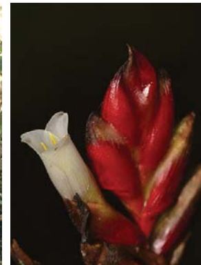
19 Tillandsia truncata BROMELIACEAE