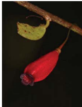
43 Sphyrsperrum grandifolium ERICACEAE