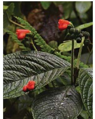
65 Gasteranthus lateralis GESNERIACEAE