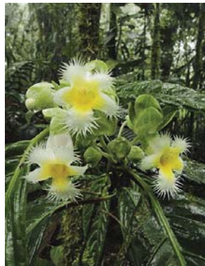
61 Drymonia brochidodroma GESNERIACEAE