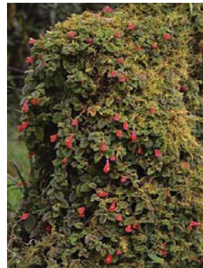
84 Pachycaulos nummularia GESNERIACEAE