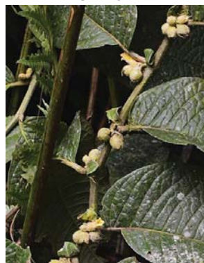
117 Cuatresia exiguiflora SOLANACEAE