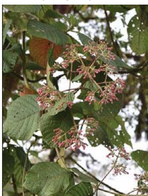
109 Cinchona pubescens RUBIACEAE