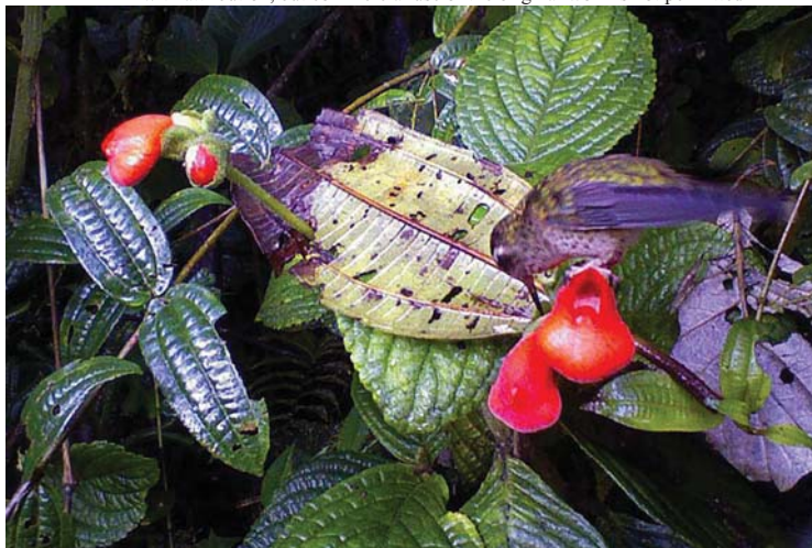
131 Adelomyia melanogenys TROCHILIDAE Speckled Hummingbird

[fieldguides.fieldmuseum.org] [1483] version 1 8/2022