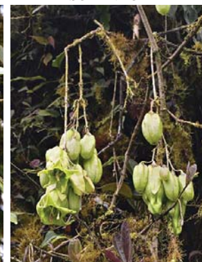
120 Trianaea speciosa SOLANACEAE