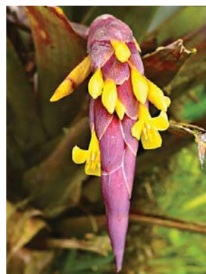
3 Guzmania bracteosa BROMELIACEAE