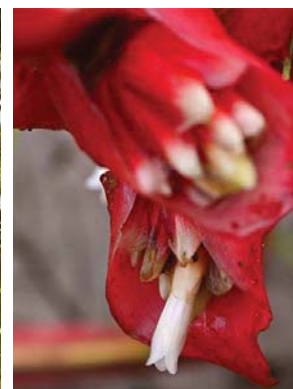
5 Guzmania danielii BROMELIACEAE