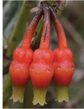
34 Psammisia oreogenes ERICACEAE