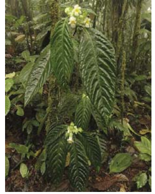
60 Drymonia brochidodroma GESNERIACEAE