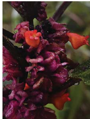
63 Drymonia collegarum GESNERIACEAE