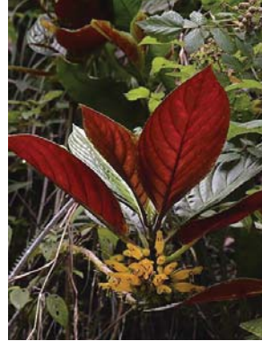
54 Columnea kucyniakii GESNERIACEAE