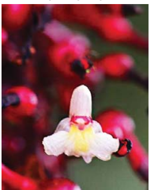
126 Renealmia fragilis ZINGIBERACEAE