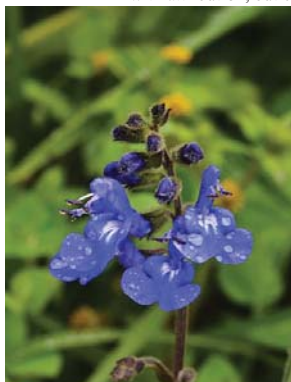
91 Salvia scutellarioides LAMIACEAE

[fieldguides.fieldmuseum.org] [1483] version 1 8/2022