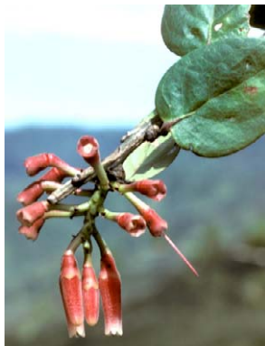
188 Macleania benthamiana