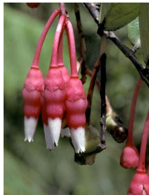
270 Psammisia chionantha