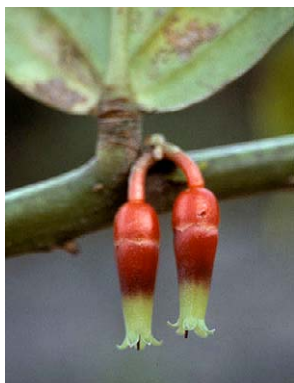
317 Psammisia sodiroi