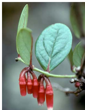
196 Macleania coccoloboides