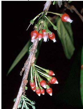
323 Satyria leucostoma