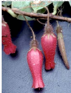
241 Oreanthes ecuadorensis

[RRC@fmnh.org] [www.fmnh.org/plantguides/] Rapid Color Guide # 203 versión 1. 12/2007