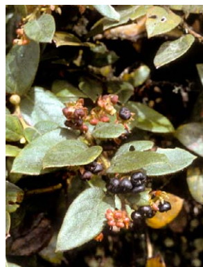
169 Gaultheria glomerata