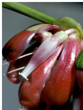
28 Cavendishia cuatrecasatii