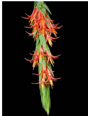
100 Ceratostema rauhii