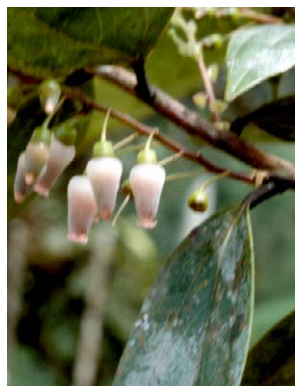
46 Cavendishia palustris