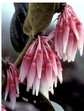
253 Orthaea secundiflora