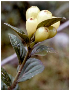
194 Macleania bullata