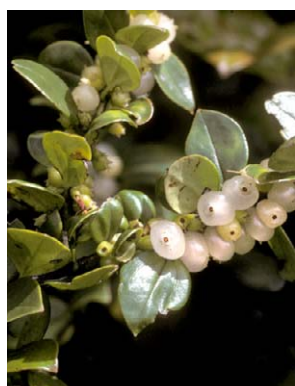
116 Disterigma alaternoides