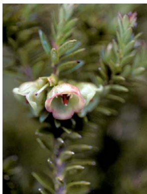
127 Disterigma codonanthum