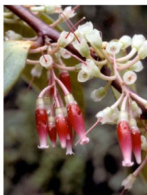
246 Orthaea coriacea