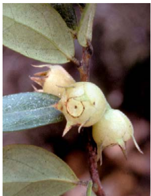
234 Macleania salapa