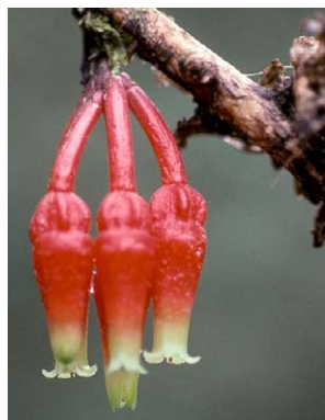
306 Psammisia oreogenes