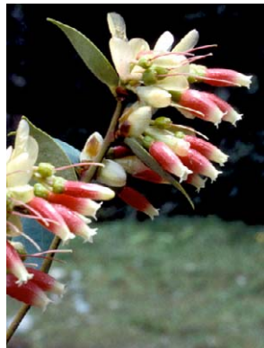
19 Cavendishia bracteata