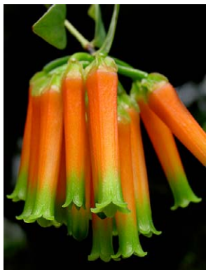
212 Macleania macrantha