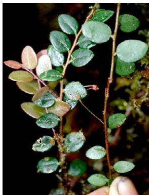
332 Sphyrropermum buxifolium