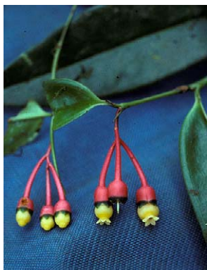
276 Psammisia dolichopoda