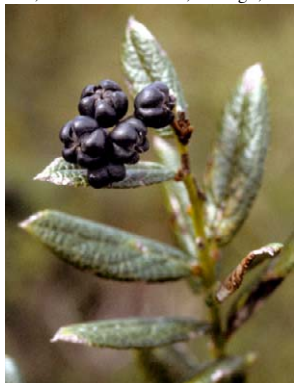
182 Gaultheria sclerophylla var. sclerophylla