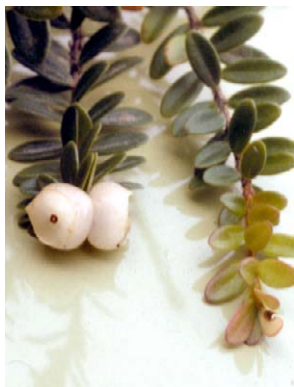
132 Disterigma dumontii