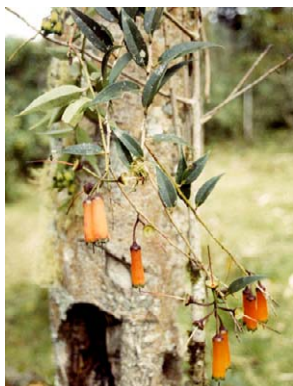
88 Ceratostema oyacachiensis