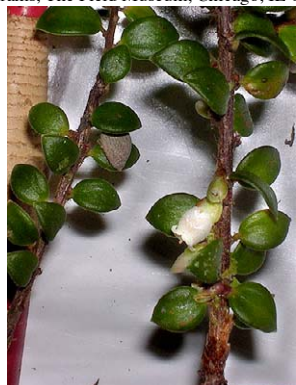
142 Disterigma noyesiae