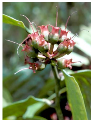
29 Cavendishia cuatrecasatii