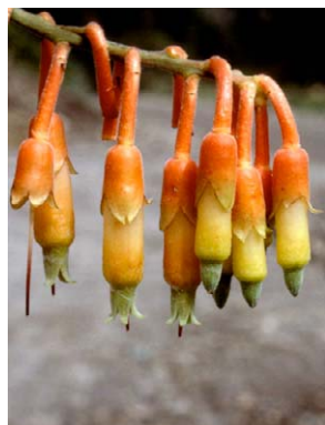
280 Psammisia ecuadorensis