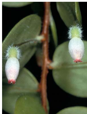
334 Sphyrropermum buxifolium