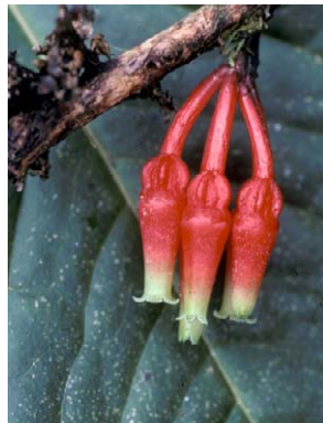
305 Psammisia oreogenes