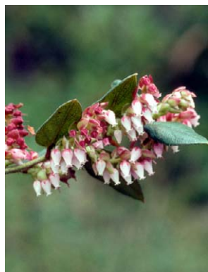
166 Gaultheria glomerata