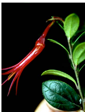
55 Ceratostema alatum