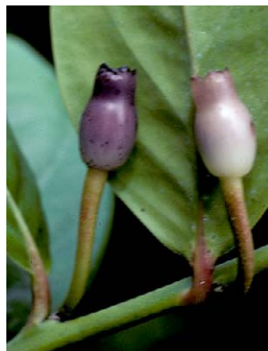
371 Thibaudia harlingii