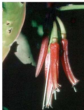
326 Satyria panurensis