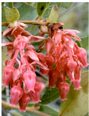
159 Gaultheria erecta