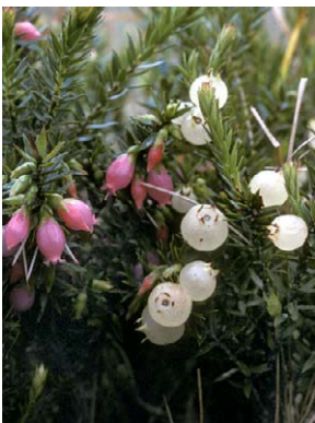
135 Disterigma empetrifolium