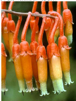
285 Psammisia ferruginea