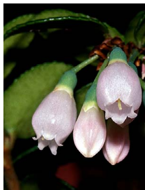
399 Vaccinium floribundum