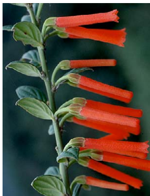
192 Macleania bullata