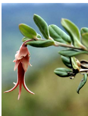
60 Ceratostema bracteolatum