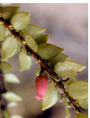
119 Disterigma balslevii