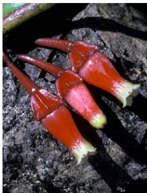
214 Macleania maldonadensis