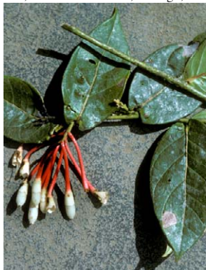
382 Thibaudia pachyantha