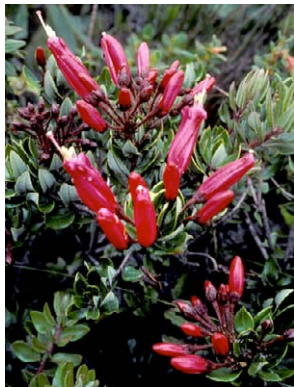
17 Bejaria resinosa