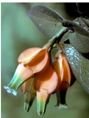
220 Macleania pentaptera