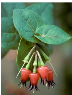
57 Ceratostema amplexicaule