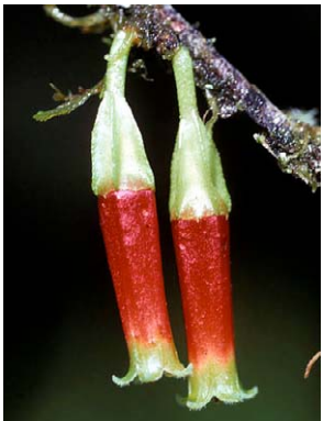
225 Macleania recumbens