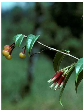
327 Satyria panurensis