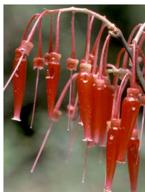
251 Orthaea oriens