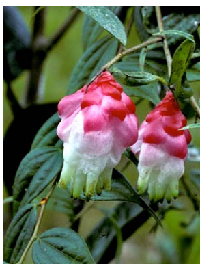
53 Cavendishia venosa