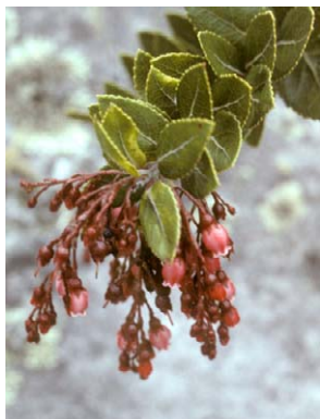
392 Vaccinium crenatum