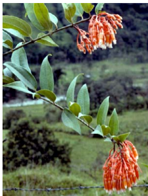
295 Psammisia guianensis