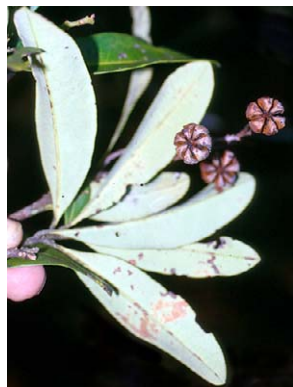
15 Bejaria aestuans