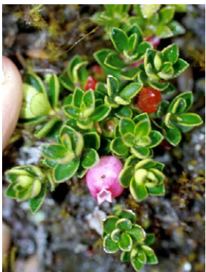
134 Disterigma empetrifolium