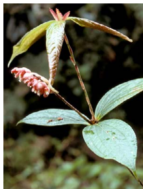
9 Anthopterus verticillatus