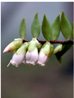
129 Disterigma cryptocalyx