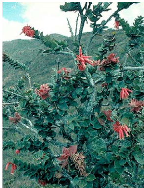
97 Ceratostema pubescens