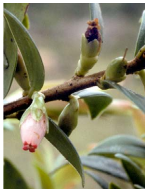
151 Disterigma stereophyllum