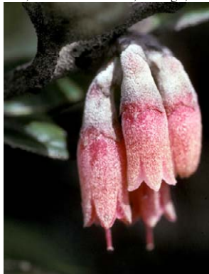
202 Macleania farinosa