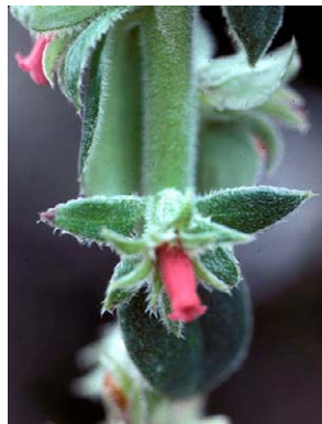
390 Thibaudia steyermarkii