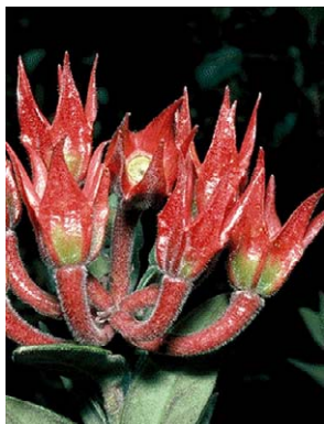
72 Ceratostema lanceolatum