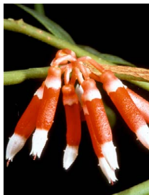
310 Psammisia pauciflora