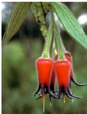
73 Ceratostema lanigerum