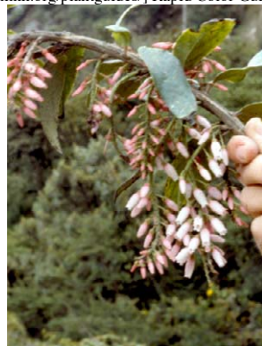
364 Thibaudia floribunda