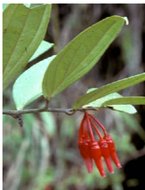
318 Psammisia ulbrichiana