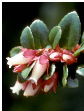
375 Thibaudia jorgensenii