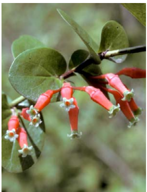
235 Macleania smithiana