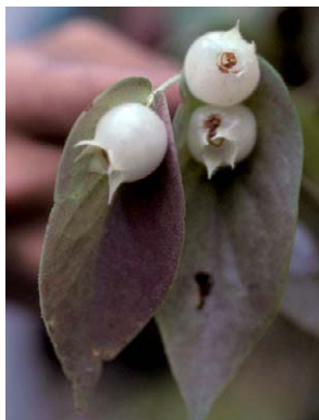
93 Ceratostema pendens