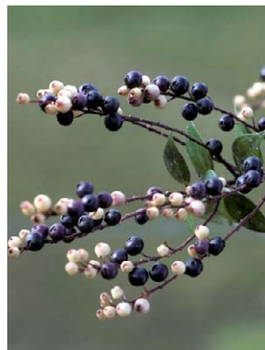
34 Cavendishia isernii var. isernii