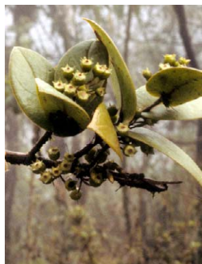
106 Diogenesia amplexens