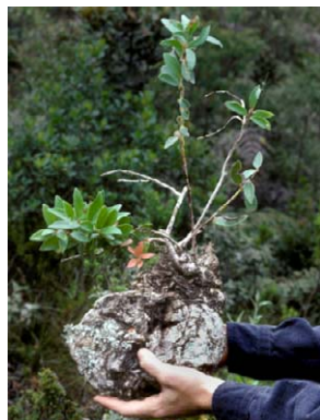
75 Ceratostema loranthiflorum