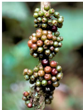
373 Thibaudia inflata