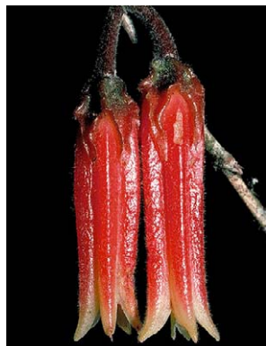
71 Ceratostema lanceolatum