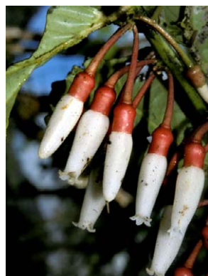
380 Thibaudia martiniana