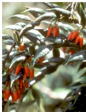
356 Themistoclesia epiphytica