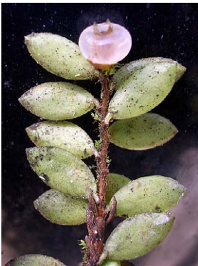
140 Disterigma micranthum