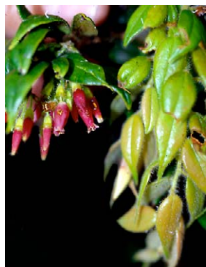
357 Themistoclesia epiphytica