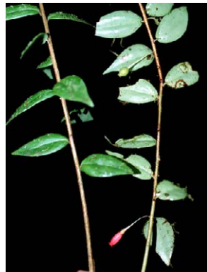
340 Sphyrropermum cordifolium