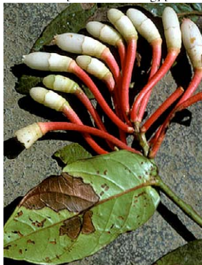
383 Thibaudia pachyantha