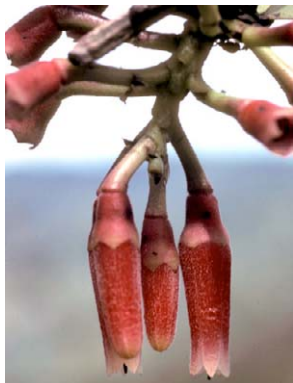
190 Macleania benthamiana