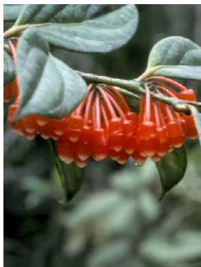
292 Psammisia graebneriana