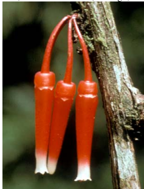
322 Satyria grandifolia