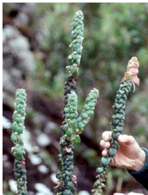
388 Thibaudia steyermarkii