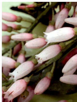
366 Thibaudia floribunda