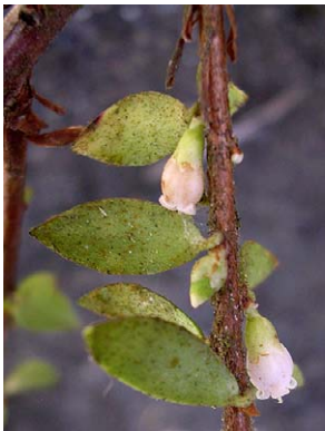
138 Disterigma micranthum