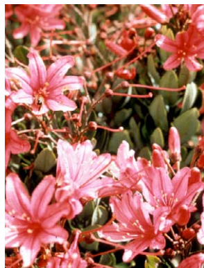
14 Bejaria aestuans