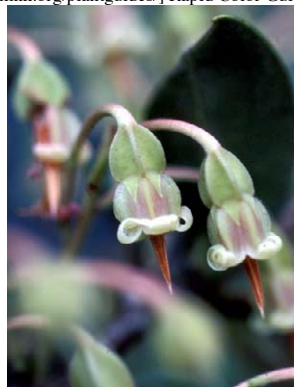
4 Anthopterus molauii