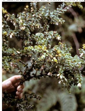
141 Disterigma noyesiae

Photos by J. L. Luteyn, except where noted. Produced by: R. B. Foster & T. Wachter, with support from the Andrew Mellon Foundation and the Gordon & Betty Moore Foundation. © J. L. Luteyn [jluteyn@nybg.org] NYBG, Bronx, NY 10458-5126 USA Web page for Ericaceae: www.nybg.org/bsci/res/lut2 ; support from the National Science Foundation. © Environmental & Conservation Programs, The Field Museum, Chicago, IL 60605 USA. [RRC@fmnh.org] [www.fmnh.org/plantguides/] Rapid Color Guide # 203 version 1. 12/2007