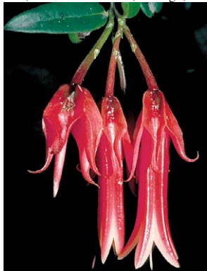
82 Ceratostema megalobum