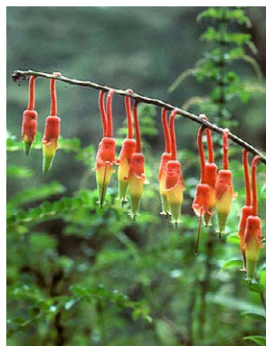
279 Psammisia ecuadorensis