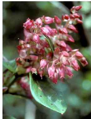
180 Gaultheria rigida