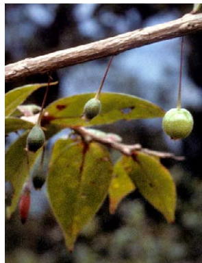
346 Sphyrsopermum grandifolium