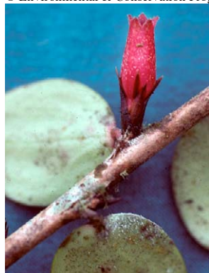
121 Disterigma bracteatum