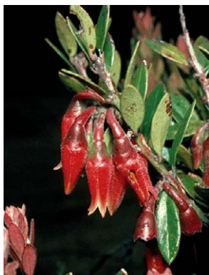
206 Macleania hirtiflora