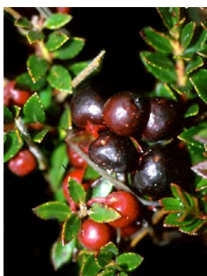
257 Pernettya prostrata