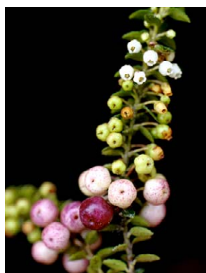
256 Pernettya prostrata