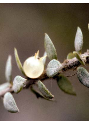
120 Disterigma balslevii