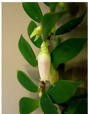
149 Disterigma pseudokillipiella