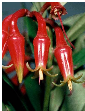
76 Ceratostema loranthiflorum