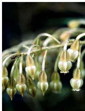
6 Anthopterus revolutus