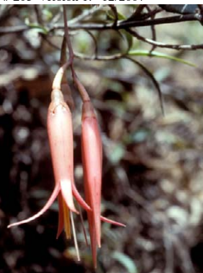
105 Ceratostema ventricosum