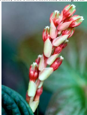
2 Anthopterus cuneatus