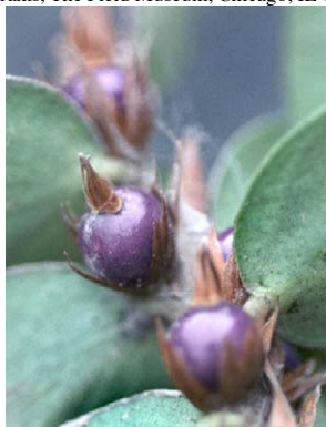
122 Disterigma bracteatum