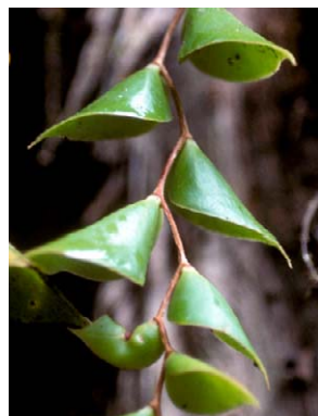
360 Themistoclesia recondata