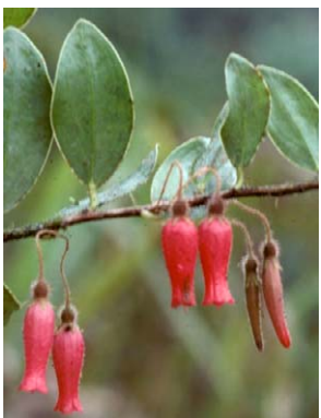
240 Oreanthes ecuadorensis