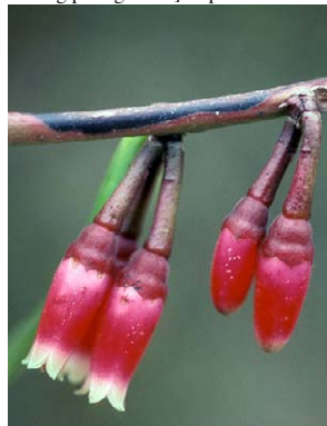
304 Psammisia montana