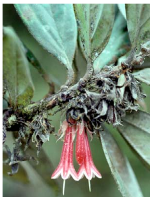
67 Ceratostema fasciculatum