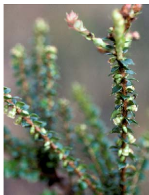
111 Disterigma acuminatum