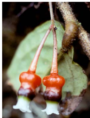
275 Psammisia debilis var. ecuadorensis