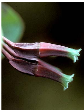
200 Macleania ericae