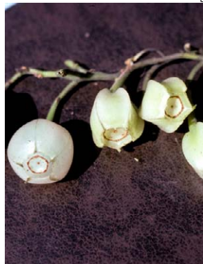
221 Macleania pentaptera