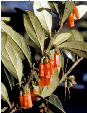
223 Macleania poortmanii