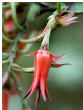
95 Ceratostema peruvianum