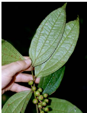
312 Psammisia roseiflora