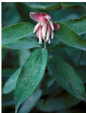
47 Cavendishia pubescens