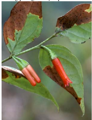
224 Macleania recumbens