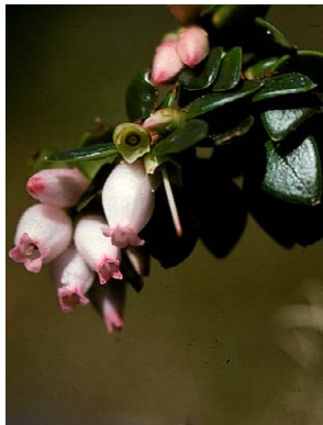
137 Disterigma humboldtii