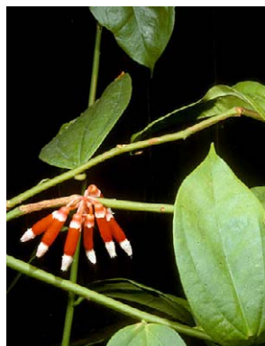
309 Psammisia pauciflora