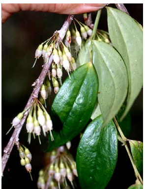
108 Diogenesia floribunda