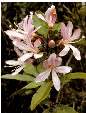
13 Bejaria aestuans