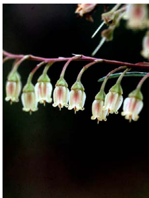
8 Anthopterus schultzeae