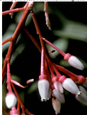
362 Thibaudia albiflora