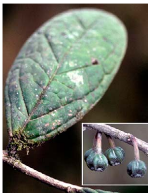
307 Psammisia oreogenes