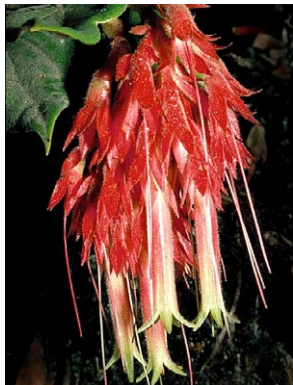
98 Ceratostema pubescens