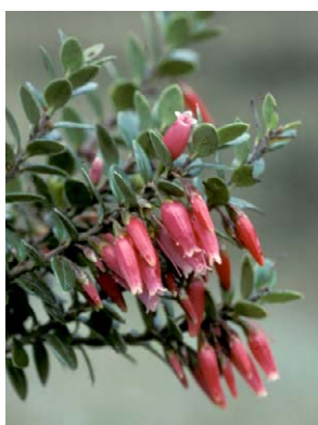
260 Plutarchia ecuadorensis