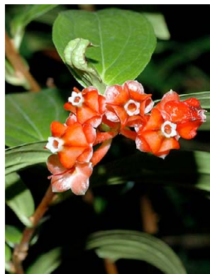
11 Anthopterus wardii