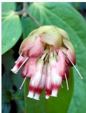
27 Cavendishia cuatrecasatii