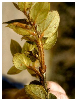
168 Gaultheria glomerata