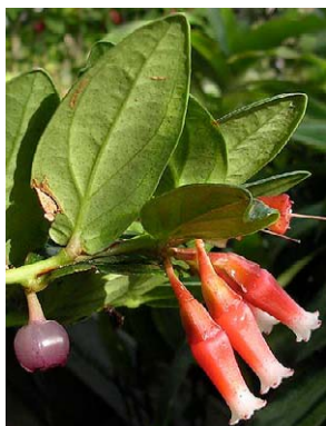
198 Macleania cordifolia