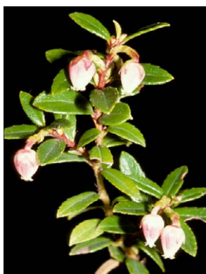
255 Pernettya prostrata