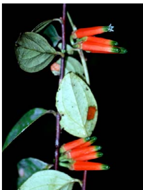
210 Macleania macrantha