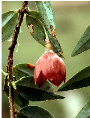
337 Sphyrropermum campanulatum