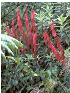
249 Orthaea oriens