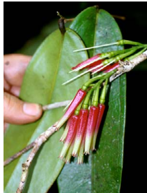
325 Satyria panurensis