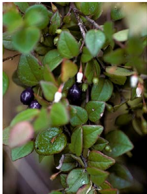
338 Sphyrropermum cordifolium