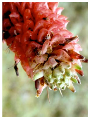
40 Cavendishia micayensis