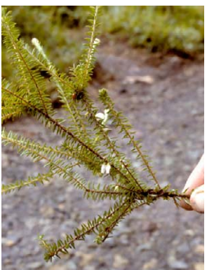
113 Disterigma agathosmoides