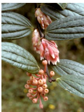
247 Orthaea fimbriata