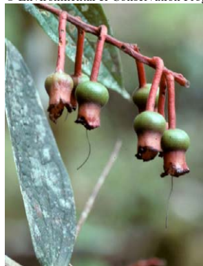
281 Psammisia ecuadorensis