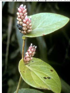
24 Cavendishia complectens var. striata