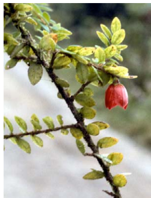
131 Disterigma dumontii