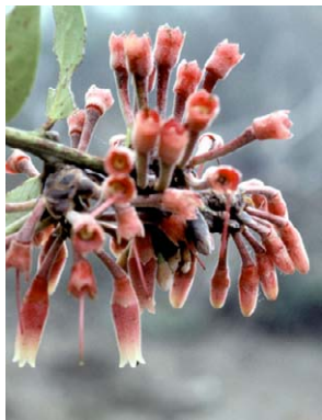
189 Macleania benthamiana