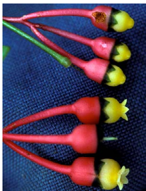
277 Psammisia dolichopoda