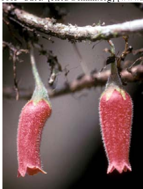
243 Oreanthes fragilis