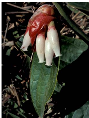
48 Cavendishia pubescens