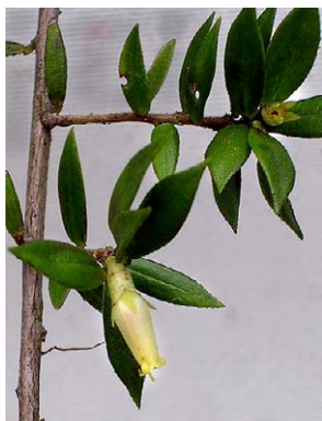
148 Disterigma pseudokillipiella