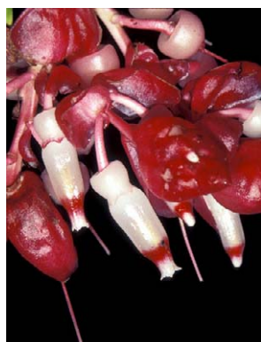
51 Cavendishia tarapotana var. tarapotana