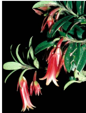
85 Ceratostema oellgaardii