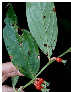
316 Psammisia sodiroi