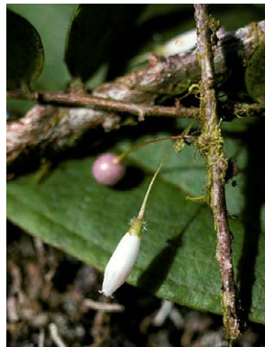
339 Sphyrropermum cordifolium