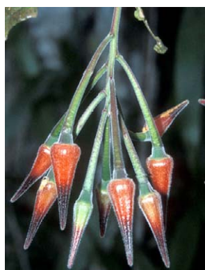
56 Ceratostema amplexicaule