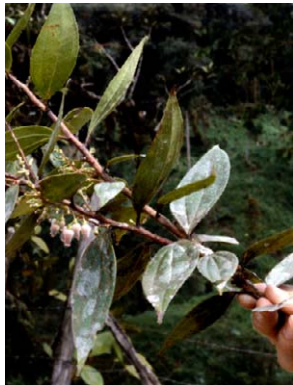
45 Cavendishia palustris