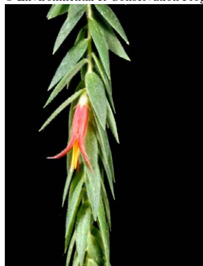
101 Ceratostema rauhii