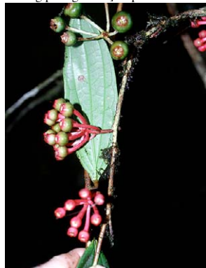
264 Psammisia aberrans