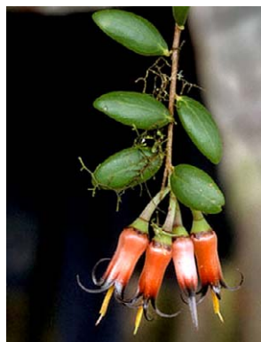
69 Ceratostema glans