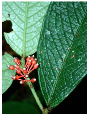
268 Psammisia caloneura