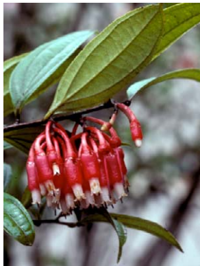
297 Psammisia guianensis