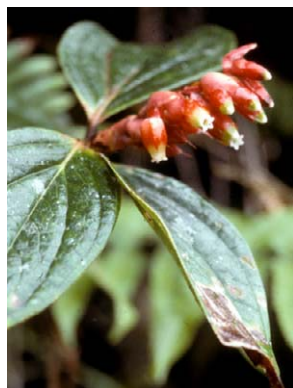
10 Anthopterus verticillatus