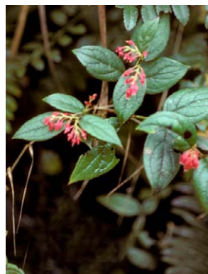
170 Gaultheria insipida