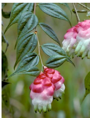
52 Cavendishia venosa