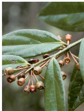
294 Psammisia graebneriana