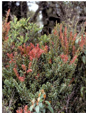
385 Thibaudia parvifolia