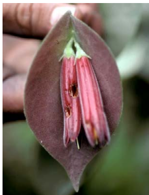
92 Ceratostema pendens