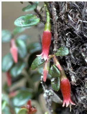
387 Thibaudia parvifolia