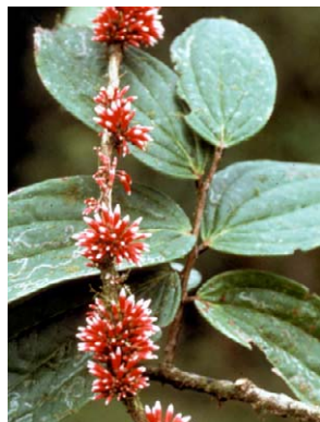
372 Thibaudia inflata