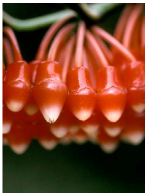
293 Psammisia graebneriana