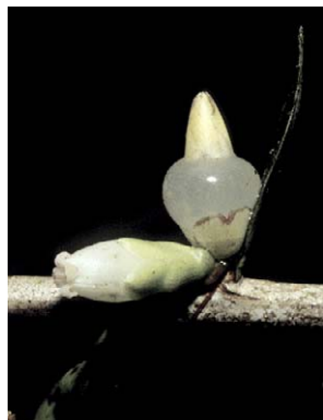
152 Disterigma stereophyllum