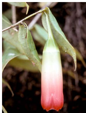
329 Semiramisia speciosa