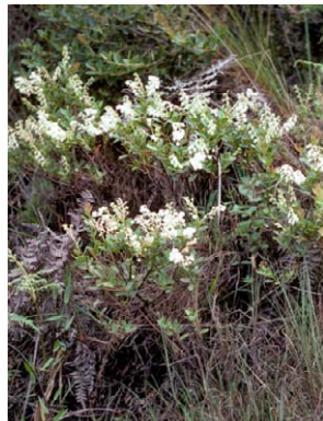
176 Gaultheria reticulata