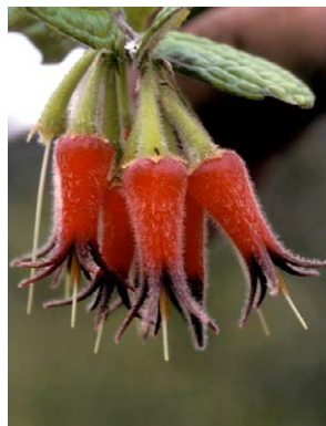
74 Ceratostema lanigerum