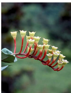
59 Ceratostema amplexicaule