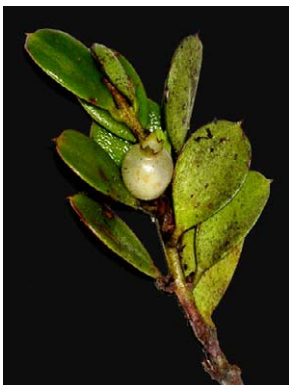
155 Disterigma utleyorum