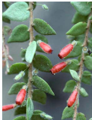
349 Sphyrsopermum sodiroi