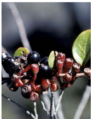
229 Macleania rupestris