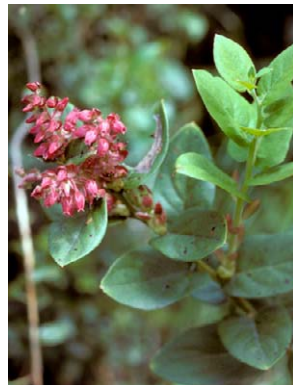
179 Gaultheria rigida