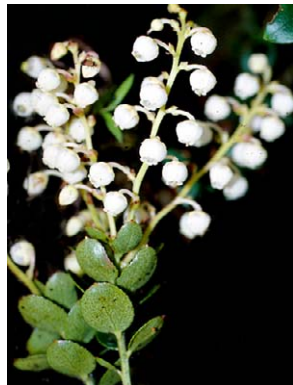
178 Gaultheria reticulata