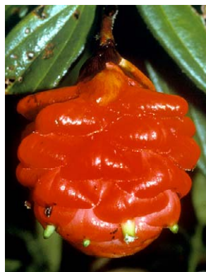
38 Cavendishia micayensis