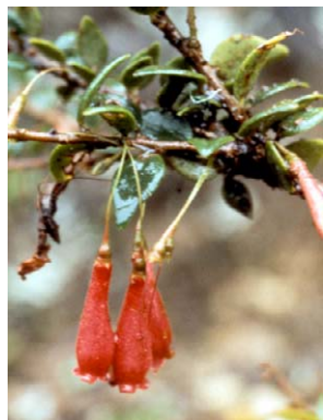
331 Sphyrropermum boekei