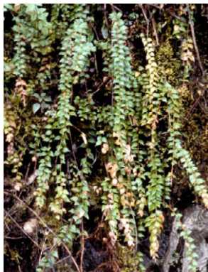
348 Sphyrsopermum sodiroi