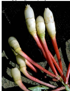
384 Thibaudia pachyantha