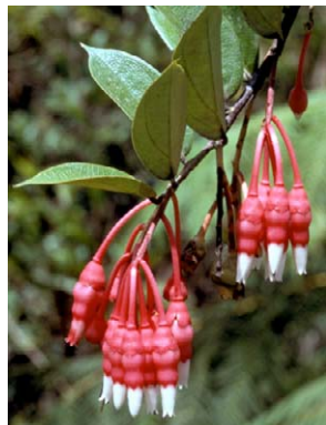
269 Psammisia chionantha