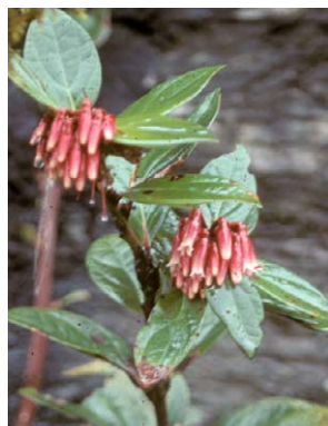
226 Macleania rupestris