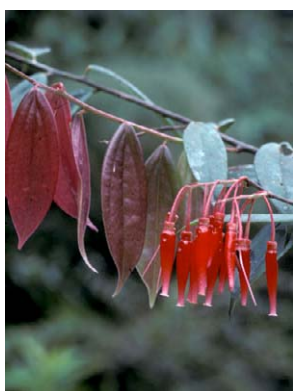
250 Orthaea oriens