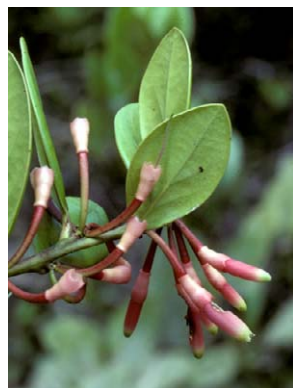
369 Thibaudia harlingii