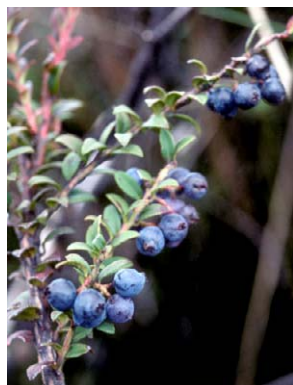
400 Vaccinium floribundum