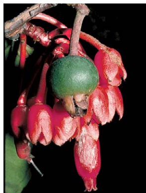
289 Psammisia fissilis