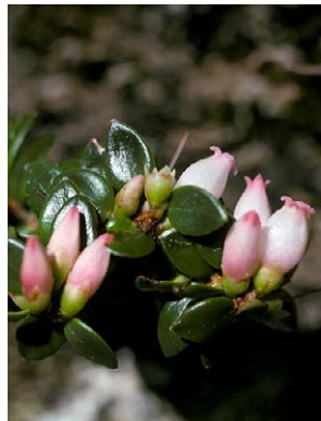
136 Disterigma humboldtii