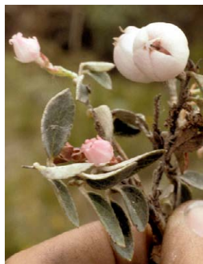
157 Gaultheria amoena