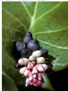
25 Cavendishia complectens var. striata