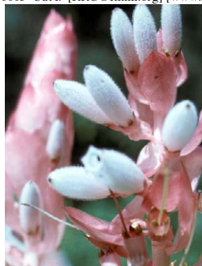
23 Cavendishia callista