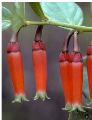
239 Macleania stricta