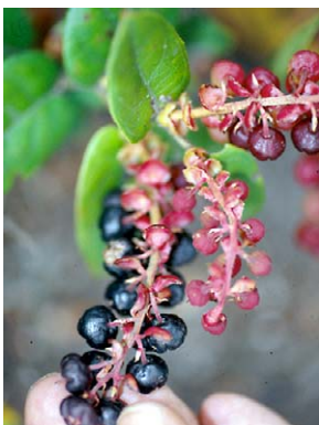
160 Gaultheria erecta