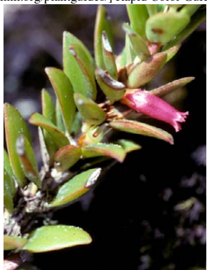
144 Disterigma pentandrum