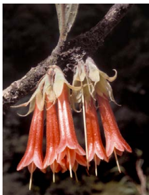
68 Ceratostema fasciculatum