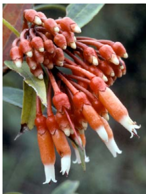
287 Psammisia fissilis