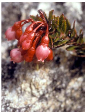
393 Vaccinium crenatum