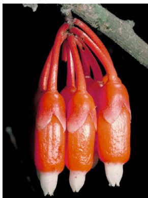
288 Psammisia fissilis