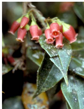
354 Themistoclesia dependens