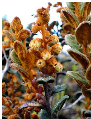
172 Gaultheria lanigera var. lanigera