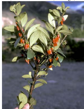
222 Macleania poortmanii