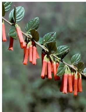
191 Macleania bullata