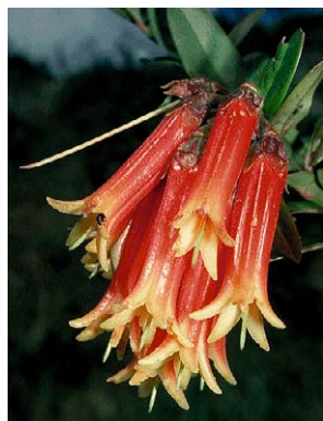
66 Ceratostema campii