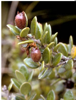
261 Plutarchia ecuadorensis