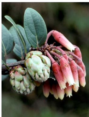
208 Macleania loeseneriana