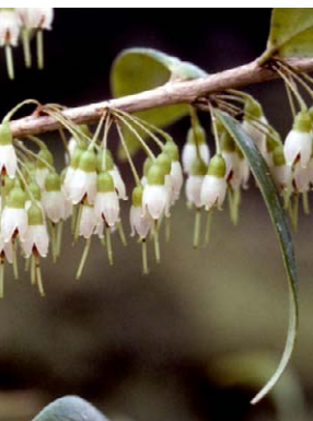
110 Diogenesia floribunda