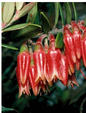
207 Macleania hirtiflora