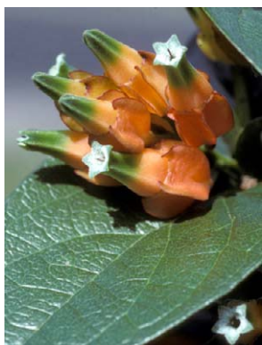
219 Macleania pentaptera