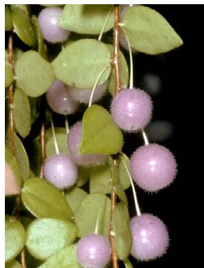
335 Sphyrropermum buxifolium