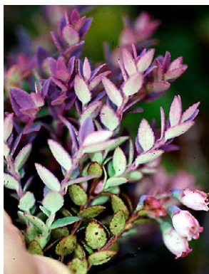
398 Vaccinium floribundum