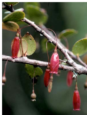
330 Sphyrropermum boekei