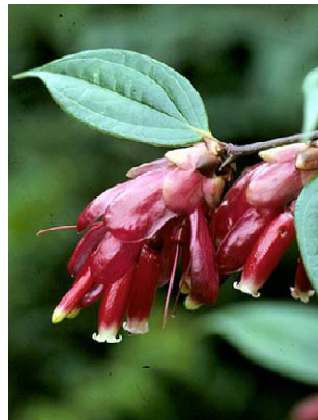
20 Cavendishia bracteata