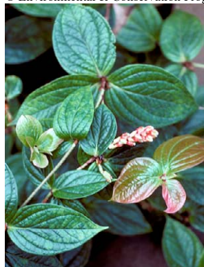
1 Anthopterus cuneatus

© Environmental & Conservation Programs, The Field Museum, Chicago, IL 60605 USA. [RRC@fmnh.org] [www.fmnh.org/plantguides/] Rapid Color Guide # 203 versión 1. 12/2007