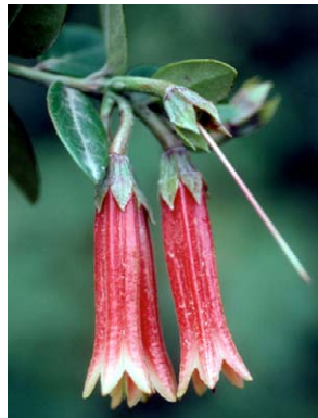
65 Ceratostema campii