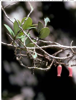
242 Oreanthes fragilis