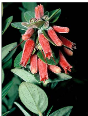
216 Macleania mollis