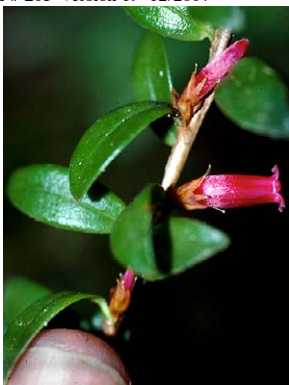
145 Disterigma pentandrum