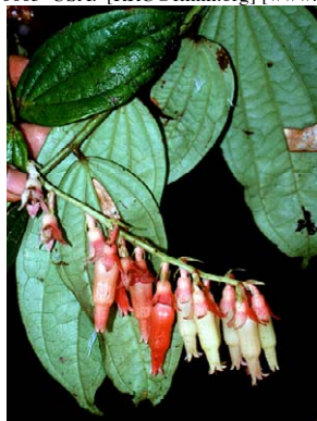
283 Psammisia ferruginea