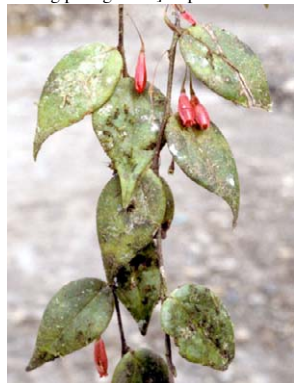
344 Sphyrsopermum grandifolium