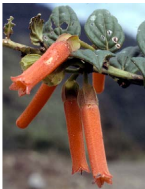
193 Macleania bullata