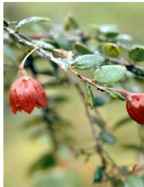
336 Sphyrropermum campanulatum