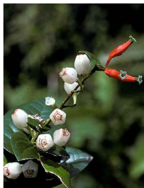
236 Macleania smithiana