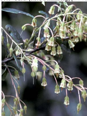
3 Anthopterus molauii