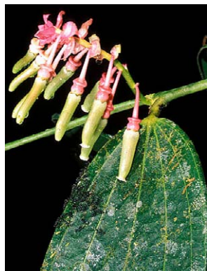
31 Cavendishia grandifolia