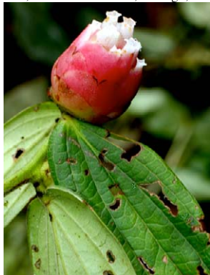
42 Cavendishia nobilis var. capitata