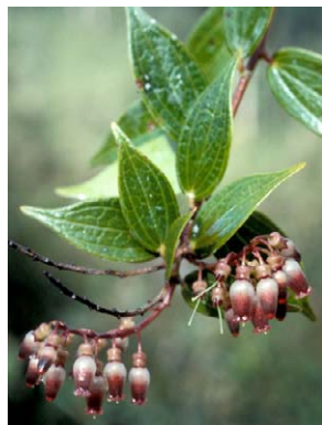
33 Cavendishia isernii var. isernii