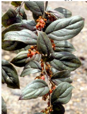
183 Gaultheria strigosa var. strigosa