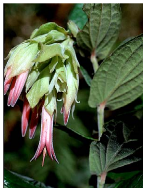
79 Ceratostema megabracteatum