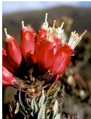
16 Bejaria resinosa