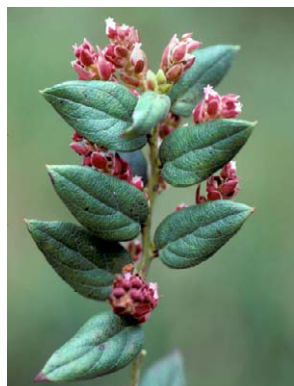
167 Gaultheria glomerata