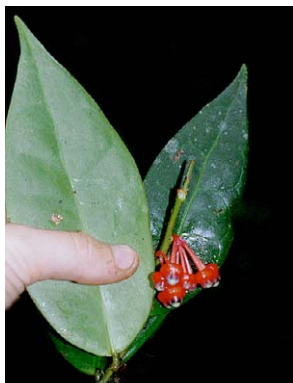
273 Psammisia debilis var. debilis