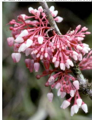
361 Thibaudia albiflora

[RRC@fmnh.org] [www.fmnh.org/plantguides/] Rapid Color Guide # 203 versión 1. 12/2007