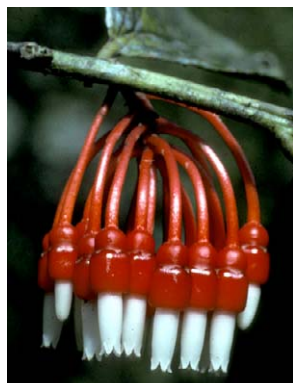
320 Psammisia ulbrichiana