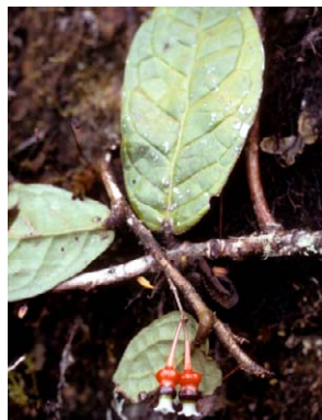
274 Psammisia debilis var. ecuadorensis