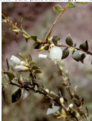
143 Disterigma noyesiae