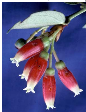
21 Cavendishia bracteata