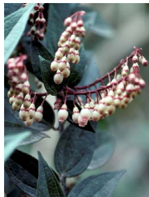
35 Cavendishia isernii var. pseudospicata