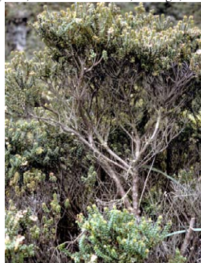
162 Gaultheria foliolosa