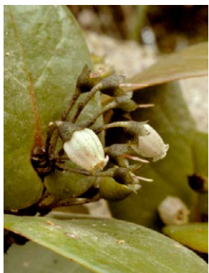
107 Diogenesia amplexens