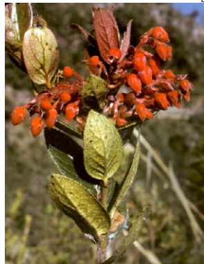
181 Gaultheria sclerophylla var. hirsuta