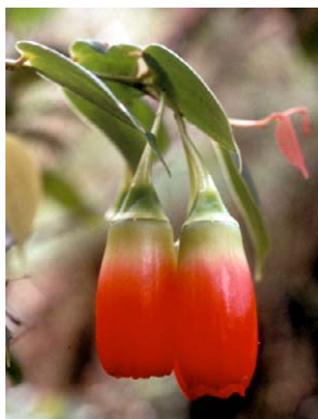
328 Semiramisia speciosa