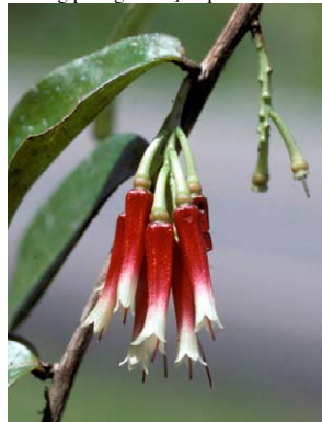
324 Satyria panurensis