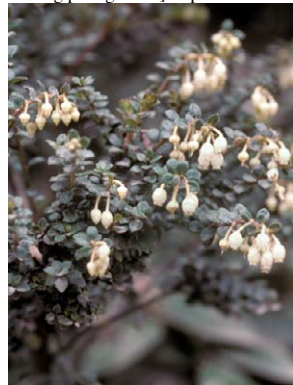
164 Gaultheria foliolosa