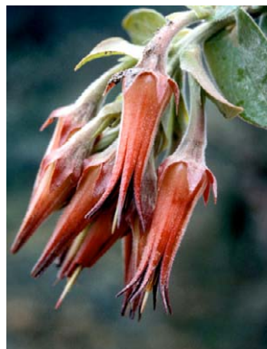
94 Ceratostema peruvianum