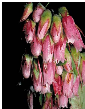
232 Macleania salapa