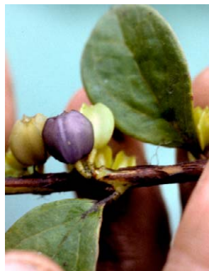
351 Themistoclesia alata