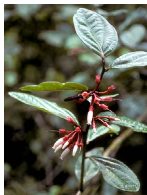
378 Thibaudia martiniana