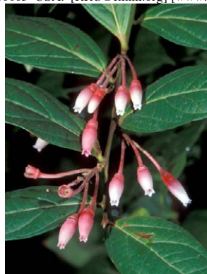
363 Thibaudia ndrei