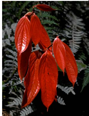
41 Cavendishia nobilis var. capitata

© Environmental & Conservation Programs, The Field Museum, Chicago, IL 60605 USA. [RRC@fmnh.org] [www.fmnh.org/plantguides/] Rapid Color Guide # 203 versión 1. 12/2007