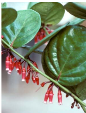
195 Macleania coccoloboides