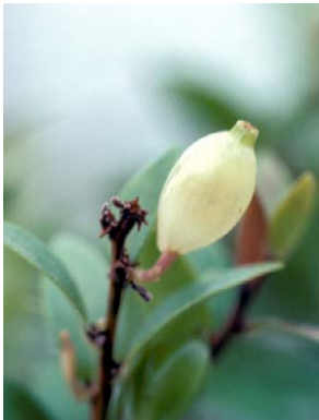
205 Macleania floribunda