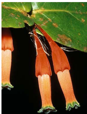
238 Macleania smithiana