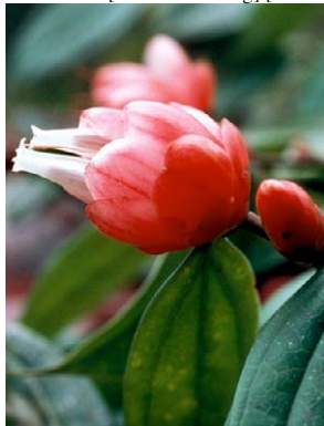
43 Cavendishia nobilis var. capitata