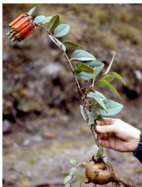
209 Macleania macrantha