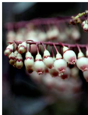
36 Cavendishia isernii var. pseudospicata