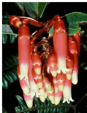
227 Macleania rupestris