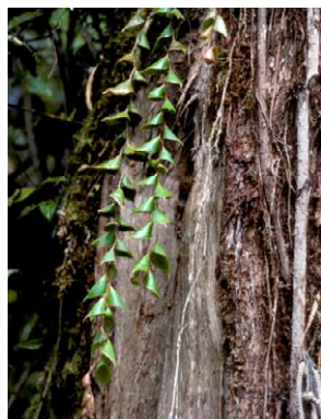
359 Themistoclesia recondata