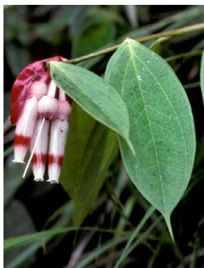
49 Cavendishia tarapotana var. gilgiana