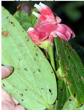
44 Cavendishia nobilis var. capitata