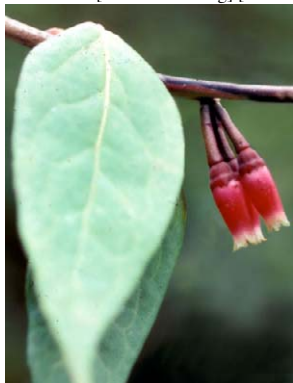
303 Psammisia montana