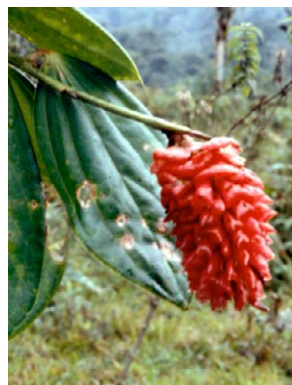
39 Cavendishia micayensis