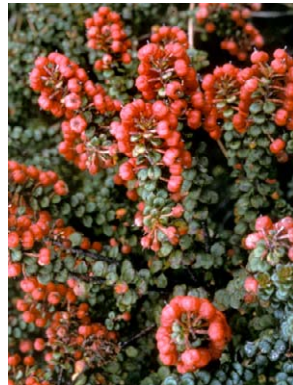
165 Gaultheria foliolosa