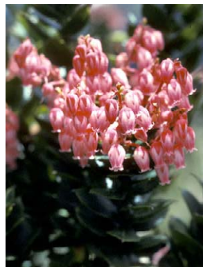
175 Gaultheria megalodonta