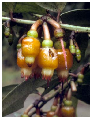
266 Psammisia aurantiaca