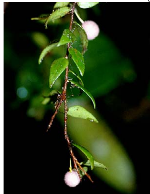
341 Sphyrsopermum cordifolium