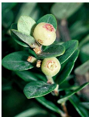
217 Macleania mollis