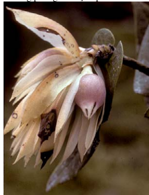
84 Ceratostema nodosum