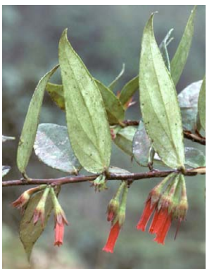
230 Macleania salapa