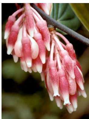
248 Orthaea fimbriata