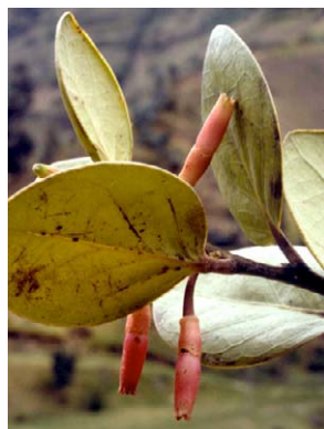
368 Thibaudia harlingii