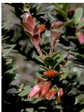
259 Plutarchia ecuadorensis