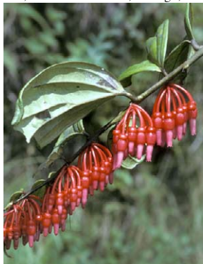
262 Psammisia aberrans