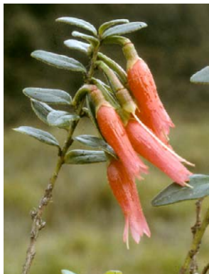
386 Thibaudia parvifolia