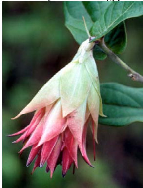
83 Ceratostema nodosum