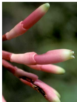
370 Thibaudia harlingii