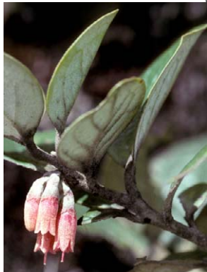
201 Macleania farinosa