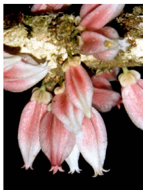
377 Thibaudia litensis