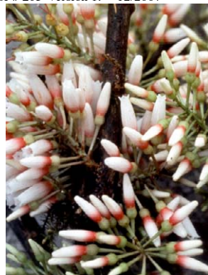
365 Thibaudia floribunda