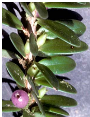
146 Disterigma pentandrum