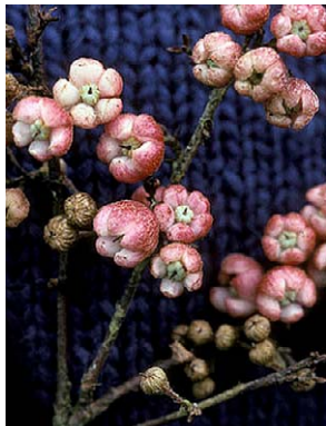
185 Gaultheria strigosa var. strigosa