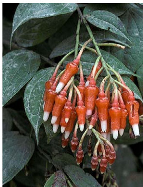
271 Psammisia columbiensis