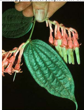
284 Psammisia ferruginea