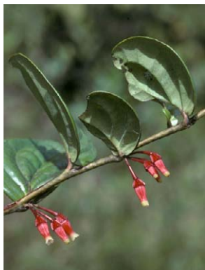
213 Macleania maldonadensis