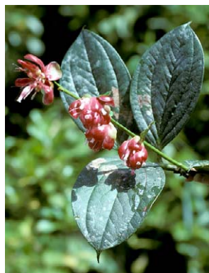
26 Cavendishia cuatrecasatii