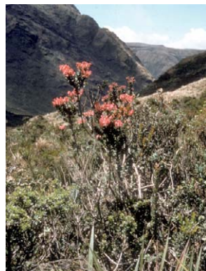
174 Gaultheria megalodonta