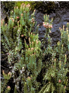
125 Disterigma codonanthum