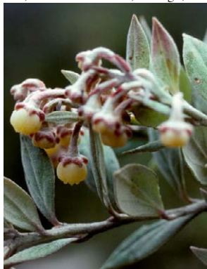
302 Psammisia incana