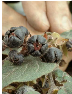
161 Gaultheria erecta

© Environmental & Conservation Programs, The Field Museum, Chicago, IL 60605 USA. [RRC@fmnh.org] [www.fmnh.org/plantguides/] Rapid Color Guide # 203 versión 1. 12/2007