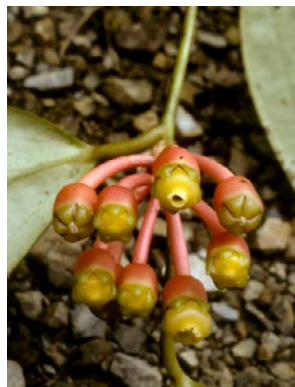
291 Psammisia flaviflora