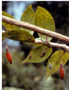
345 Sphyrsopermum grandifolium