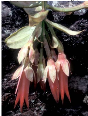
62 Ceratostema calycinum