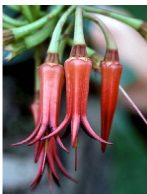
58 Ceratostema amplexicaule