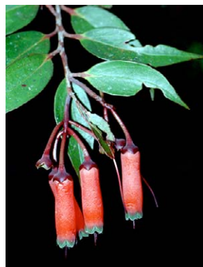
90 Ceratostema oyacachiensis