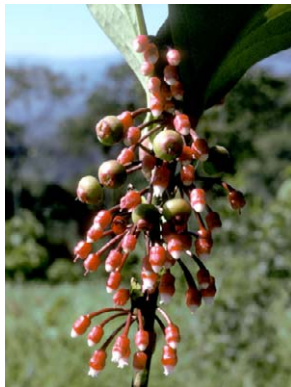
300 Psammisia idalima