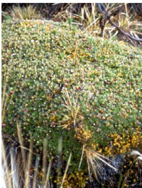
133 Disterigma empetrifolium