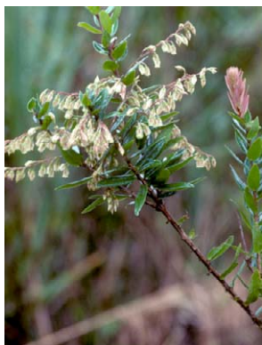
7 Anthopterus schultzeae