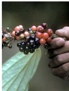
374 Thibaudia inflata