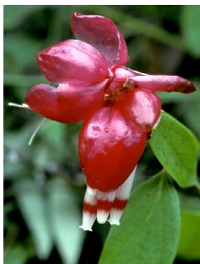
50 Cavendishia tarapotana var. gilgiana