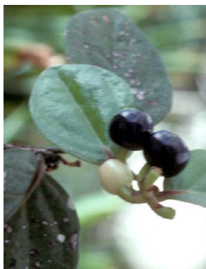
197 Macleania coccoloboides