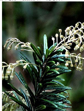
5 Anthopterus revolutus