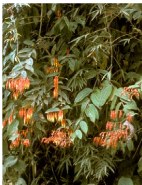
278 Psammisia ecuadorensis