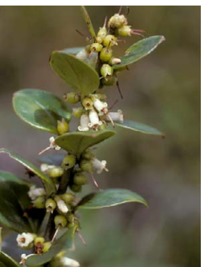
114 Disterigma alaternoides