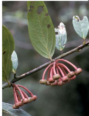
321 Psammisia ulbrichiana

© Environmental & Conservation Programs, The Field Museum, Chicago, IL 60605 USA. [RRC@fmnh.org] [www.fmnh.org/plantguides/] Rapid Color Guide # 203 versión 1. 12/2007