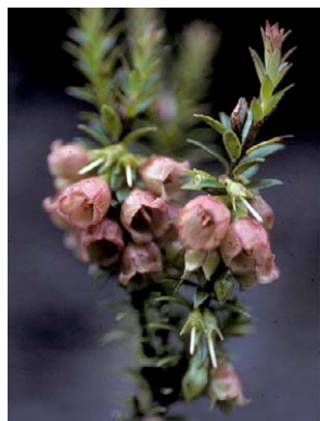
126 Disterigma codonanthum