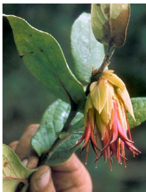
78 Ceratostema megabracteatum