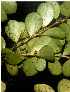
153 Disterigma utleyorum