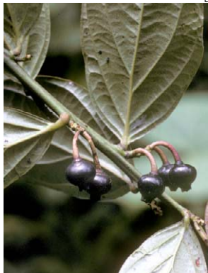
381 Thibaudia martiniana