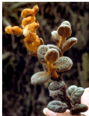
173 Gaultheria lanigera var. lanigera