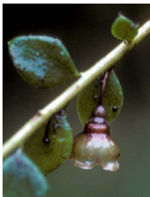
396 Vaccinium distichum