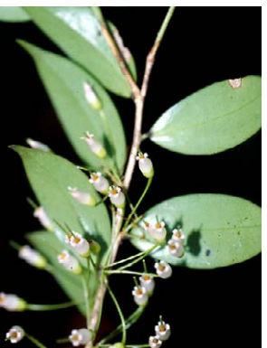
109 Diogenesia floribunda