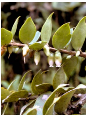
128 Disterigma cryptocalyx