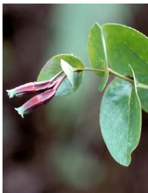
199 Macleania ericae