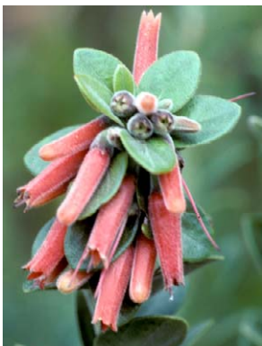
215 Macleania mollis