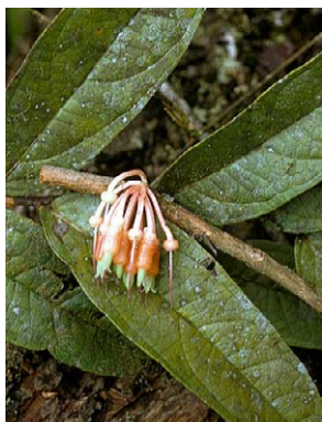
308 Psammisia orientalis