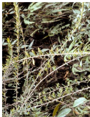
147 Disterigma pseudokillipiella