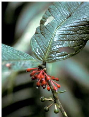
267 Psammisia caloneura