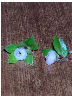
150 Disterigma pseudokillipiella