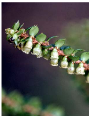
112 Disterigma acuminatum