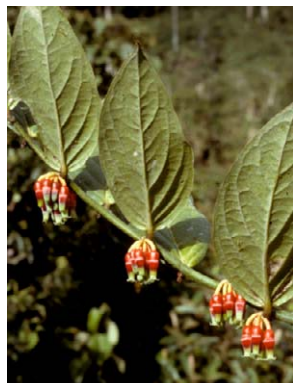
315 Psammisia sodiroi