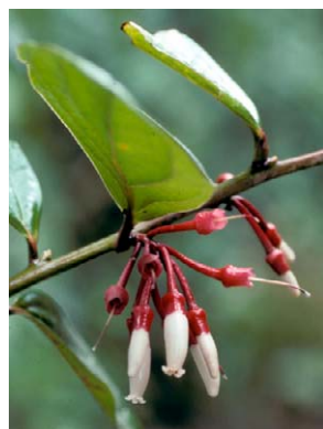
379 Thibaudia martiniana