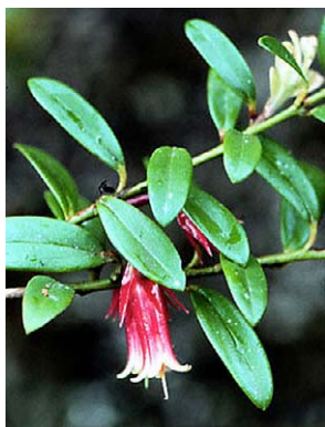
86 Ceratostema oellgaardii