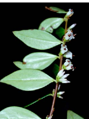
115 Disterigma alaternoides