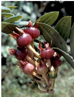
63 Ceratostema calycinum