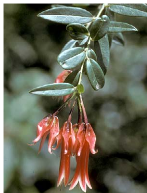
80 Ceratostema megalobum