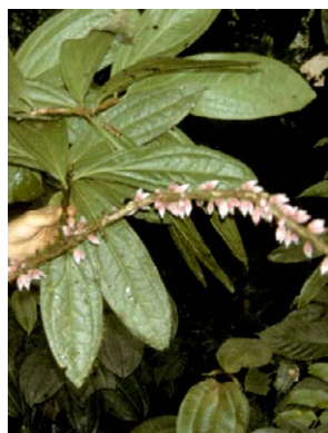
376 Thibaudia litensis