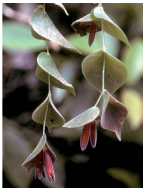
91 Ceratostema pendens