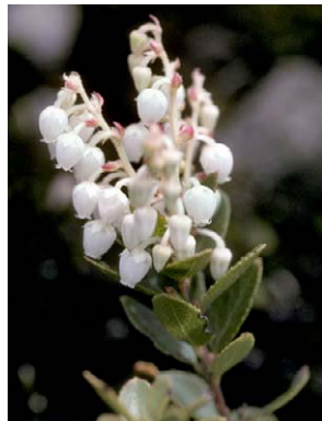
177 Gaultheria reticulata