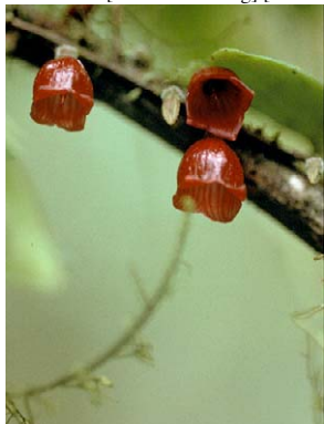
343 Sphyrsopermum dissimile