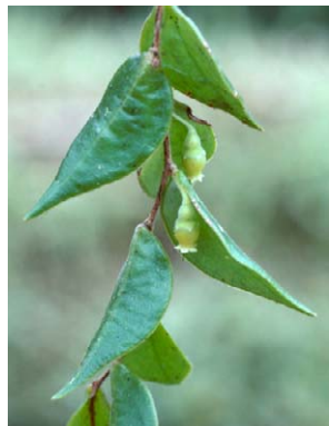
347 Sphyrsopermum haughtii