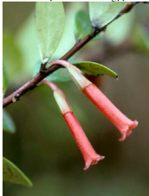
203 Macleania floribunda