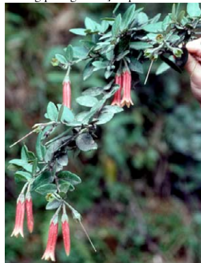
64 Ceratostema campii