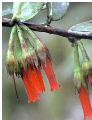
231 Macleania salapa