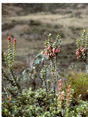
158 Plutarchia ecuadorensis