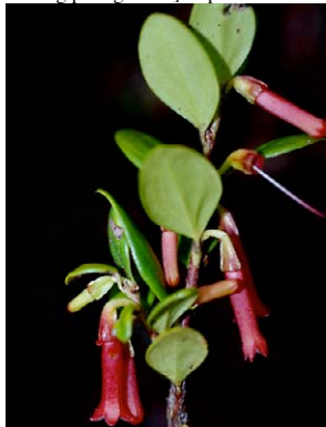
204 Macleania floribunda