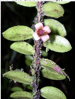
123 Disterigma campii