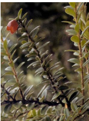
130 Disterigma dumontii