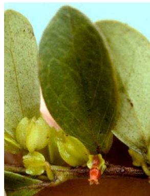
350 Themistoclesia alata