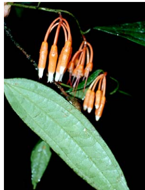
296 Psammisia guianensis