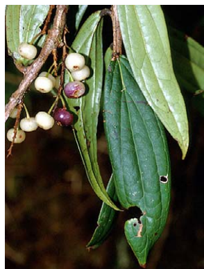
367 Thibaudia floribunda