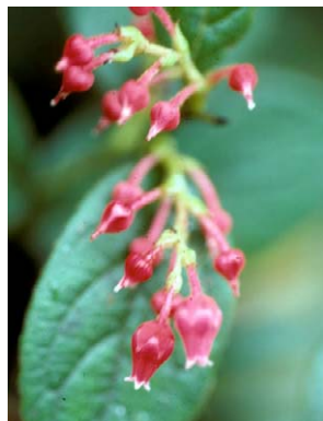
171 Gaultheria insipida