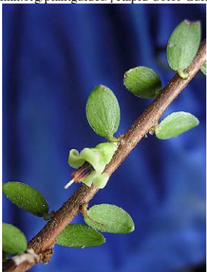
124 Disterigma campii