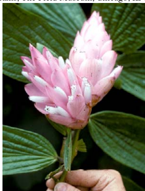
22 Cavendishia callista