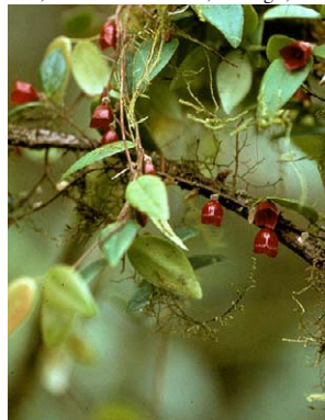
342 Sphyrsopermum dissimile