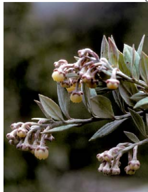
301 Psammisia incana