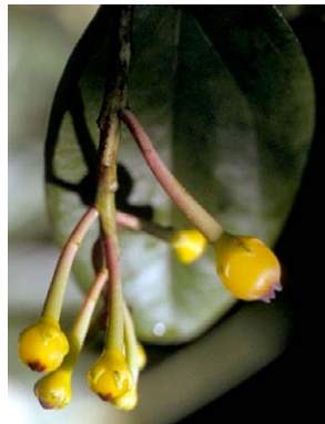
265 Psammisia amazonica