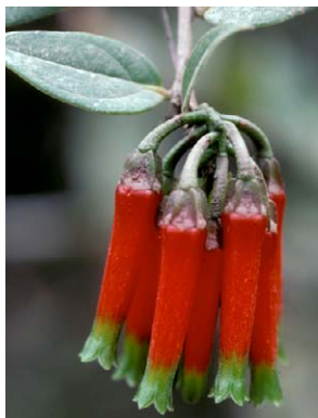
211 Macleania macrantha