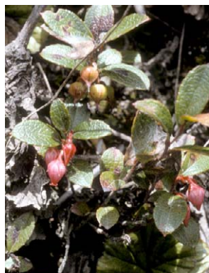
156 Gaultheria amoena