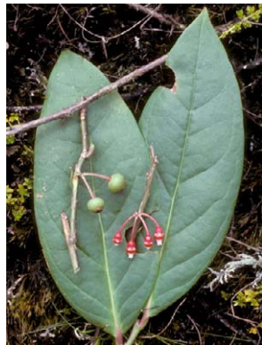
299 Psammisia idalima