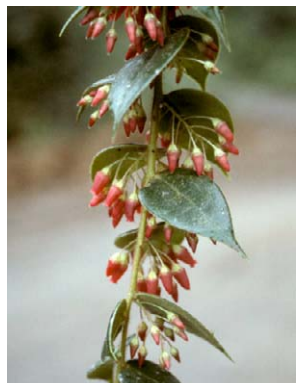
352 Themistoclesia dependens