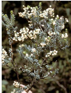
163 Gaultheria foliolosa