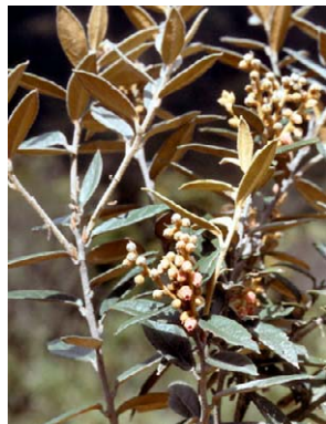
186 Gaultheria tomentosa