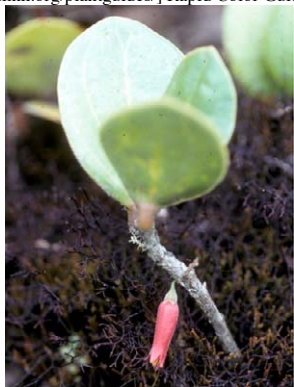
244 Oreanthes hypogaea