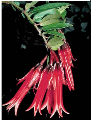
81 Ceratostema megalobum