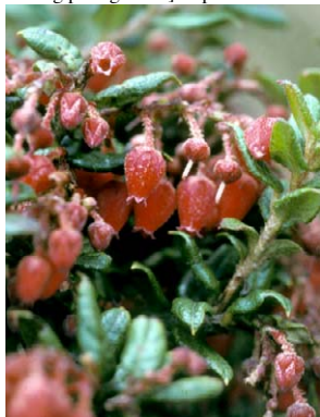
184 Gaultheria strigosa var. strigosa