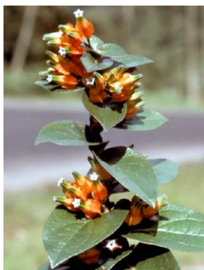
218 Macleania pentaptera