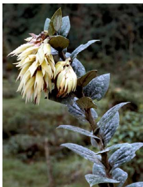
77 Ceratostema megabracteatum