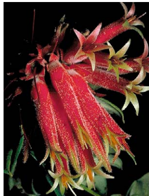
99 Ceratostema pubescens