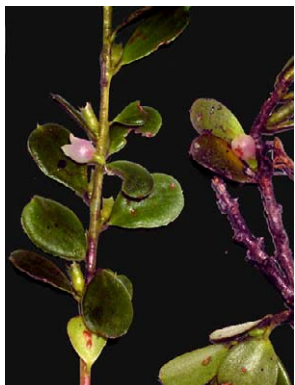
154 Disterigma utleyorum