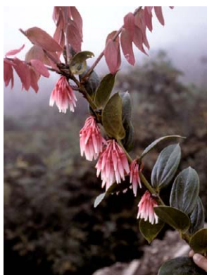
252 Orthaea secundiflora