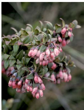
397 Vaccinium floribundum