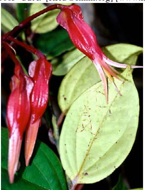
103 Ceratostema reginaldii