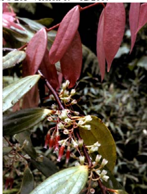
245 Orthaea coriacea