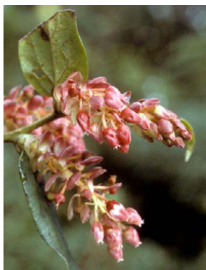
158 Gaultheria erecta