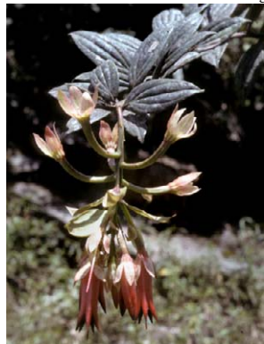
61 Ceratostema calycinum