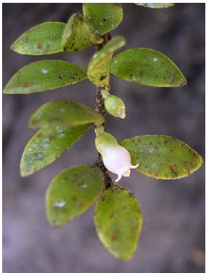
139 Disterigma micranthum