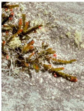
391 Vaccinium crenatum