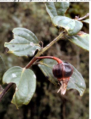
104 Ceratostema reginaldii