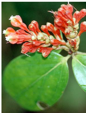
12 Anthopterus wardii