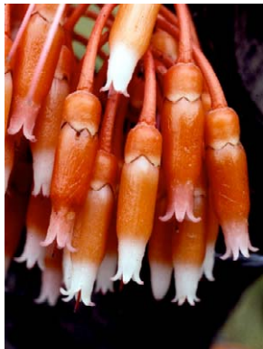
198 Psammisia guianensis