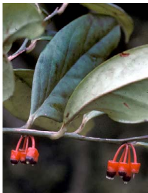
313 Psammisia sclerantha