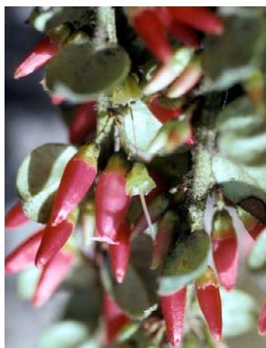
358 Themistoclesia epiphytica