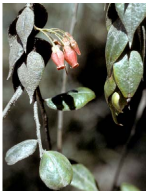
353 Themistoclesia dependens