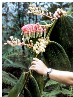
30 Cavendishia grandifolia