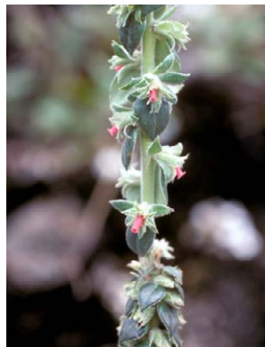
389 Thibaudia steyermarkii