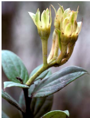
96 Ceratostema peruvianum