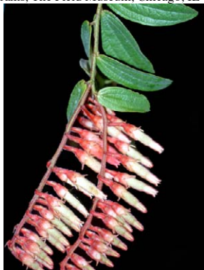
282 Psammisia ferruginea