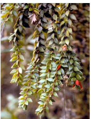
118 Disterigma balslevii