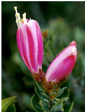
18 Bejaria resinosa