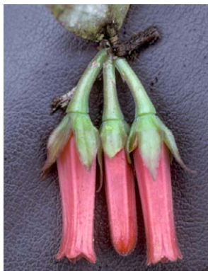
233 Macleania salapa