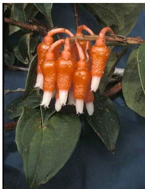
272 Psammisia columbiensis