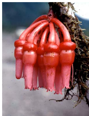
319 Psammisia ulbrichiana