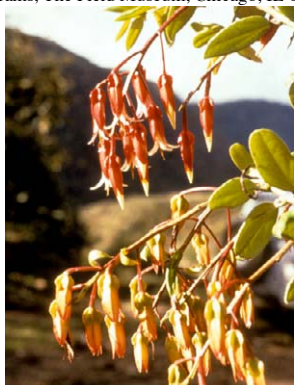
102 Ceratostema reginaldii