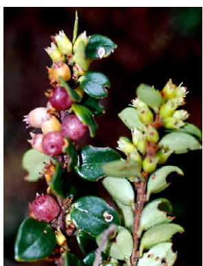
117 Disterigma alaternoides