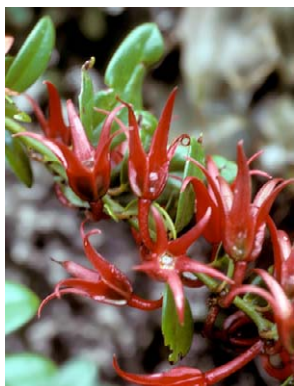
87 Ceratostema oellgaardii