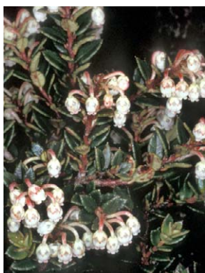
254 Pernettya prostrata