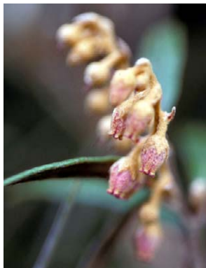
187 Gaultheria tomentosa