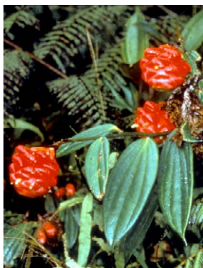
37 Cavendishia micayensis