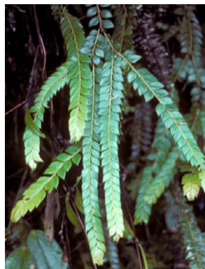
395 Vaccinium distichum