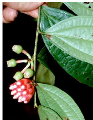
311 Psammisia roseiflora