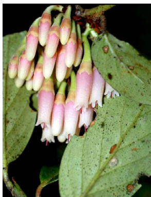
228 Macleania rupestris