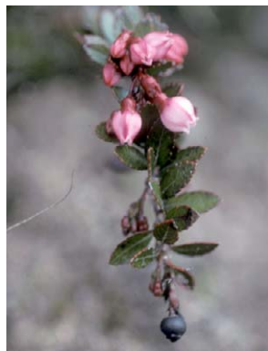
394 Vaccinium crenatum