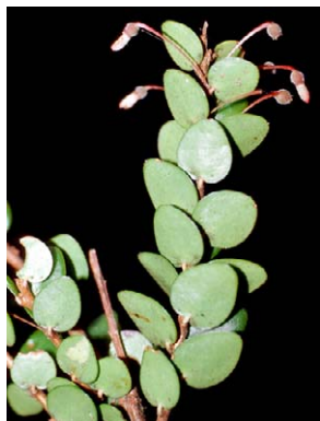
333 Sphyrropermum buxifolium