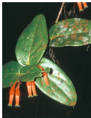
237 Macleania smithiana