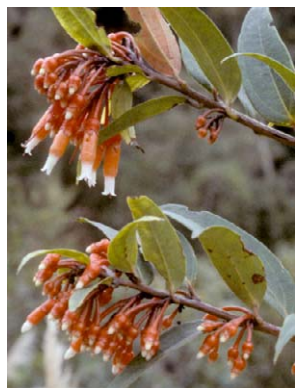
286 Psammisia fissilis