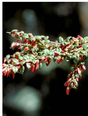
355 Themistoclesia epiphytica