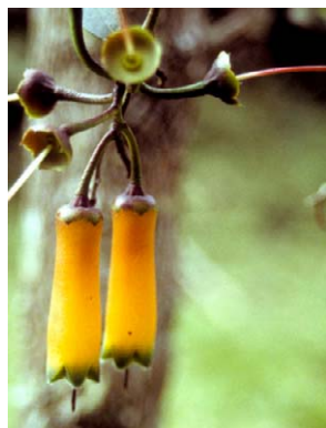
89 Ceratostema oyacachiensis