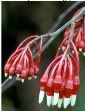
263 Psammisia aberrans