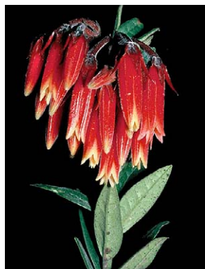
70 Ceratostema lanceolatum