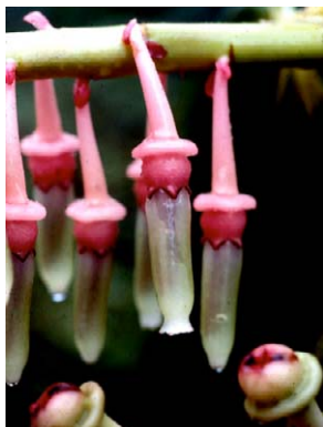
32 Cavendishia grandifolia