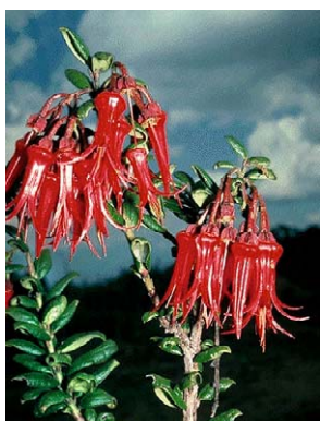
54 Ceratostema alatum