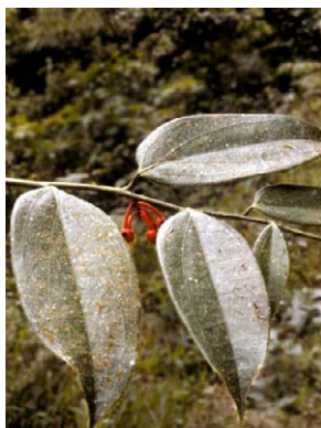
290 Psammisia flaviflora