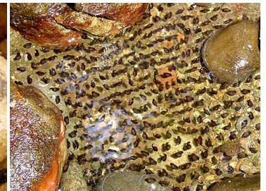
32 Smilisca sordida (eggs) HYLIDAE