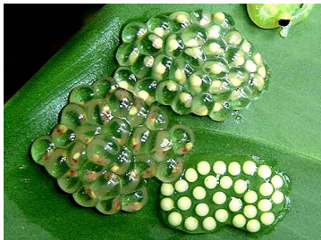
9 H. valerioi (eggs) CENTROLENIDAE