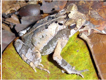
2 Incilius aucoinae <103 mm BUFONIDAE