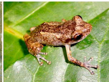
15 Pristimantis cruentus <48 mm CRAUGASTORIDAE