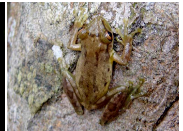
28 Scinax elaeochrous <40 mm HYLIDAE