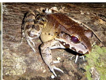
38 Leptodactylus savagei <185 mm LEPTODACTYLIDAE