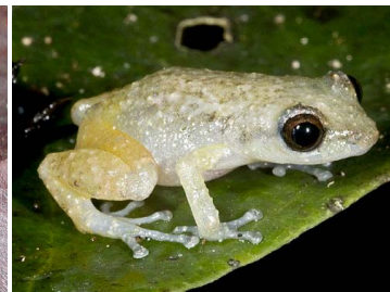
19 Diasporus diastema <24 mm ELEUTHERODACTYLIDAE