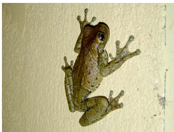
33 Trachycephalus venulosus <114 mm HYLIDAE