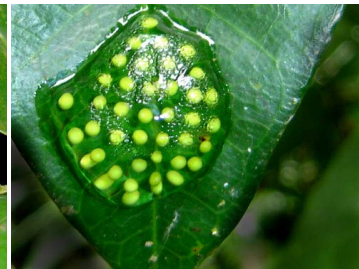
11 Teratohyla pulverata (eggs) CENTROLENIDAE