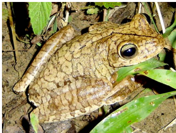
25 Hypsiboas rosenbergi <82 mm HYLIDAE