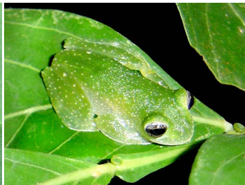
10 Teratohyla pulverata <33 mm CENTROLENIDAE