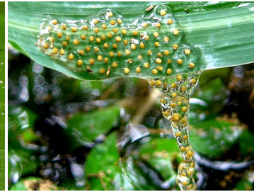
23 D. ebraccatus (eggs) HYLIDAE