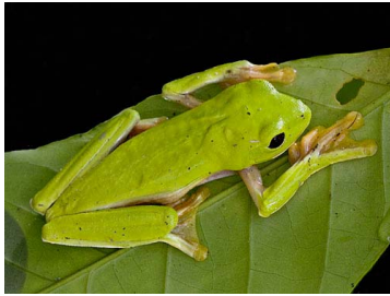
21 Agalychnis spurrelli <68 mm HYLIDAE