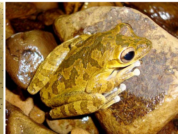
31 Smilisca sordida <64 mm HYLIDAE