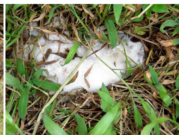
39 Leptodactylus savagei (eggs) LEPTODACTYLIDAE