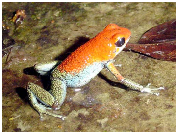
17 Oophaga granulifera <25 mm DENDROBATIDAE