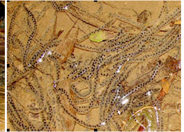
4 Rhinella marina (eggs) BUFONIDAE