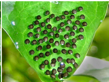
6 Cochranella granulosa (eggs) CENTROLENIDAE