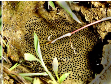
26 Hypsiboas rosenbergi (eggs) HYLIDAE