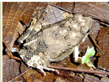
34 Engystomops pustulosus <35 mm LEIUPERIDAE