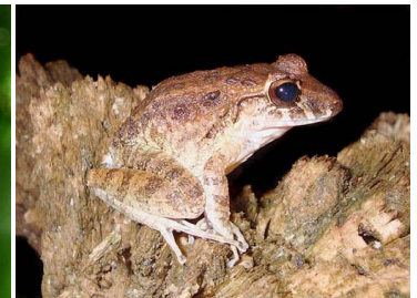
12 Craugastor fitzingeri <103 mm CRAUGASTORIDAE