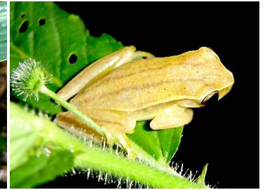
24 Dendropsophus microcephala <31 mm HYLIDAE