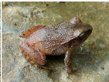
14 Craugastor stejnegerianus <22 mm CRAUGASTORIDAE