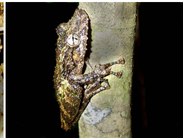
27 Scinax boulengeri <53 mm HYLIDAE