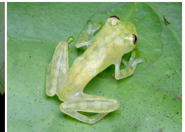
8 Hyalinobatrachium valerioi <26 mm CENTROLENIDAE