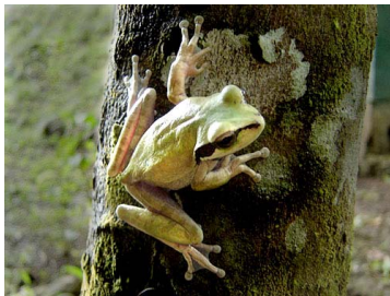
29 Smilisca phaeota <78 mm HYLIDAE