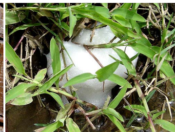
35 E. pustulosus (eggs) LEIUPERIDAE