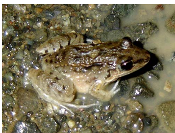
37 Leptodactylus poecilochilus <50 mm LEPTODACTYLIDAE