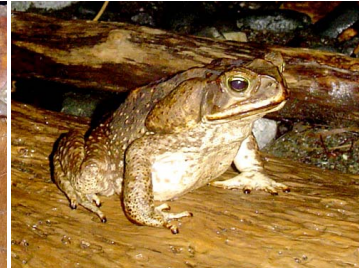
3 Rhinella marina <175 mm BUFONIDAE