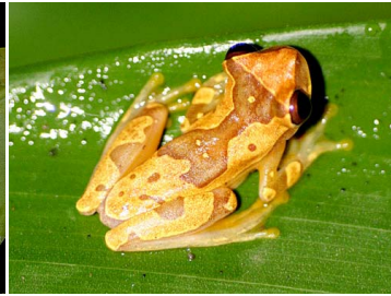
22 Dendropsophus ebraccatus <35 mm HYLIDAE