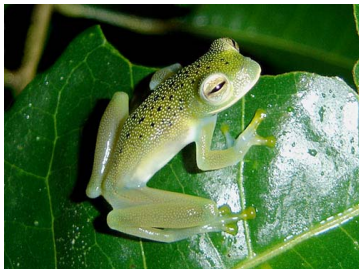
5 Cochranella granulosa <32 mm CENTROLENIDAE