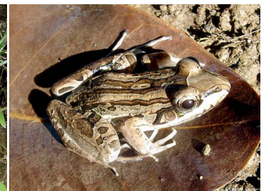
36 Leptodactylus bolivianus <120 mm LEPTODACTYLIDAE