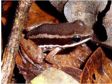
1 Allobates talamancae <25 mm AROMOBATIDAE