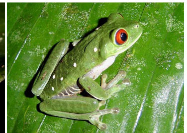
20 Agalychnis callidryas <71 mm HYLIDAE