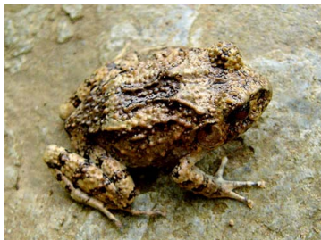
13 Craugastor rugosus <69 mm CRAUGASTORIDAE