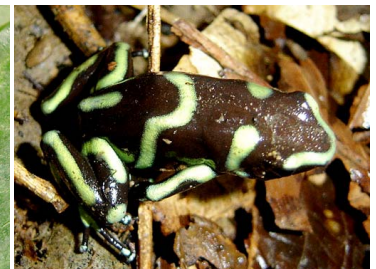
16 Dendrobates auratus <42 mm DENDROBATIDAE