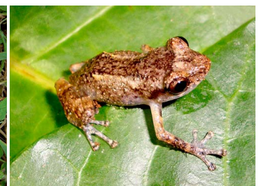
40 Pristimantis cruentus <48 mm STRABOMANTIDAE