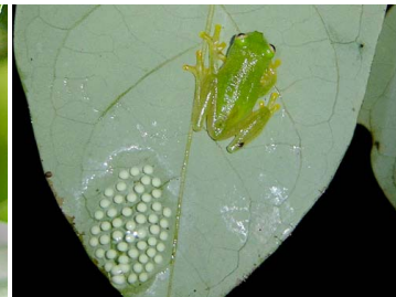
7 Hyalinobatrachium colymbiphllum <29 mm CENTROLENIDAE