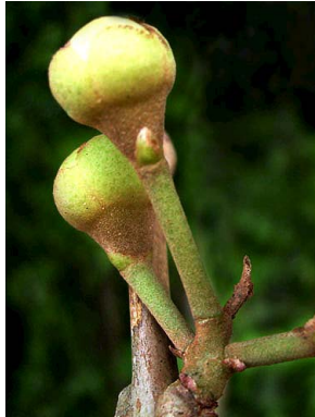
13 Eugenia umbrosa