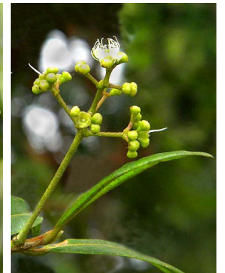
20 Myrcia guianensis