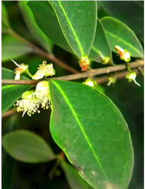
11 Eugenia puniceifolia