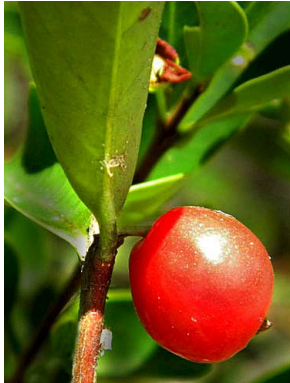
12 Eugenia puniceifolia