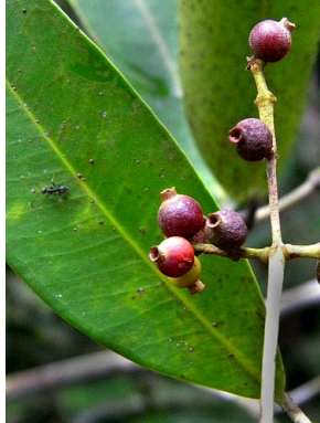
3 Calyptranthes dardanoi