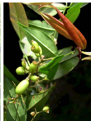
29 Myrcia sylvatica