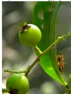
23 Myrcia racemosa