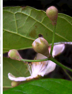
4 Campomanesia dichotoma