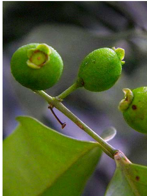
8 Eugenia florida