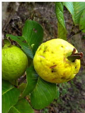
37 Psidium guajava