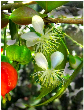
16 Eugenia uniflora