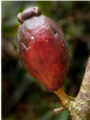
7 Eugenia dichroma