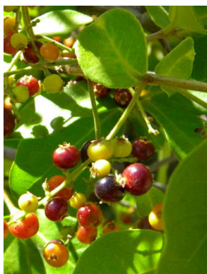
31 Myrcia tomentosa