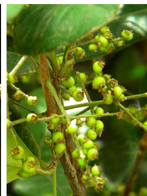
30 Myrcia tomentosa