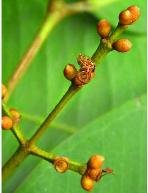
1 Calyptranthes dardanoi

©Environmental & Conservation Programs, The Field Museum, Chicago, IL USA. [rrc@fieldmuseum.org] [http://fieldmuseum/IDtools] Rapid Color Guide #292 version 2 07/2011