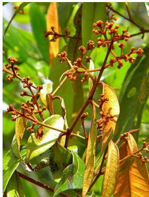
18 Myrcia bergiana