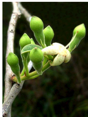
38 Psidium guineense