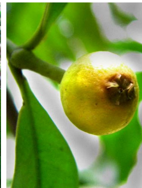
25 Myrcia spectabilis