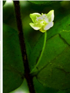
9 Eugenia hirta