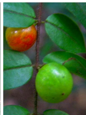
34 Myrciaria ferruginea