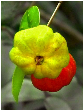
17 Eugenia uniflora