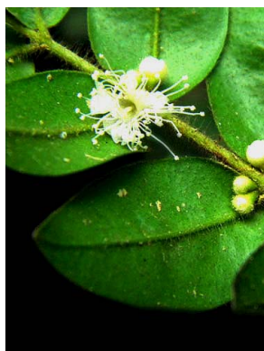
32 Myrciaria ferruginea