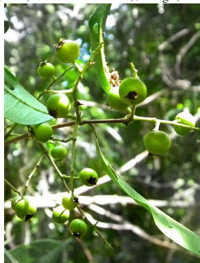
22 Myrcia racemosa