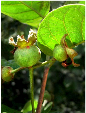
6 Campomanesia dichotoma