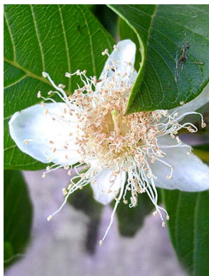
36 Psidium guajava