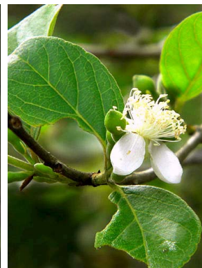
39 Psidium guineense