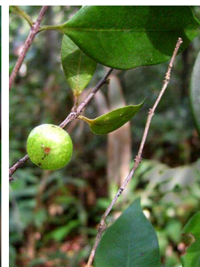
35 Myrciaria floribunda