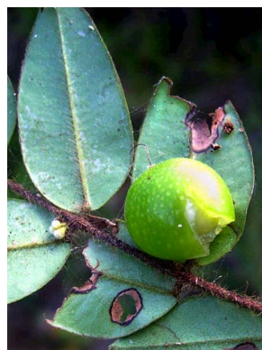
33 Myrciaria ferruginea