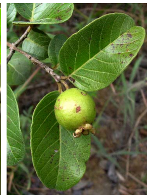
40 Psidium guineense