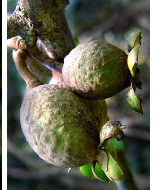
15 Eugenia umbrosa