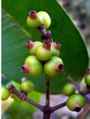
2 Calyptranthes dardanoi