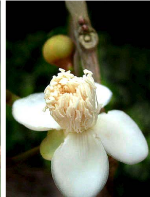
14 Eugenia umbrosa