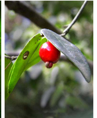
10 Eugenia hirta