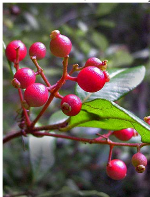
21 Myrcia guianensis

©Environmental & Conservation Programs, The Field Museum, Chicago, IL USA. [rrc@fieldmuseum.org] [http://fieldmuseum/IDtools] Rapid Color Guide #292 version 2 07/2011