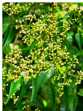
28 Myrcia sylvatica