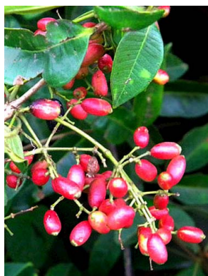
27 Myrcia splendens