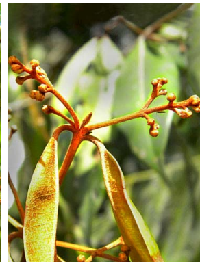
19 Myrcia bergiana