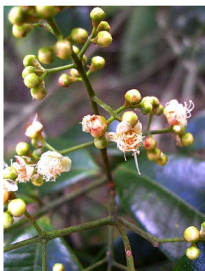
26 Myrcia splendens