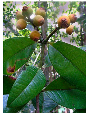
24 Myrcia spectabilis