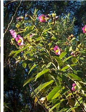
35 Abutilon rufinerve C. Takeuchi