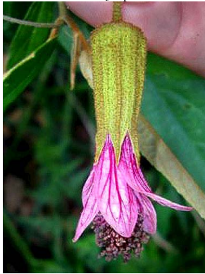
22 Abutilon longifolium V.M. Gonçalves