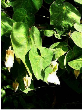
1 Abutilon amoenum C.V. da Silva

Rapid Color Guide # 325 version 1 04/2012