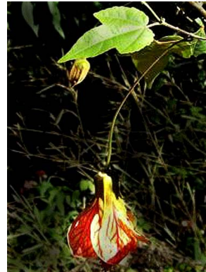
39 Abutilon striatum C. Takeuchi