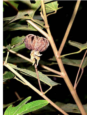
34 Abutilon regnellii C. Takeuchi