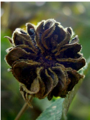
9 Abutilon bedfordianum