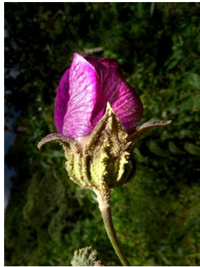
17 Abutilon latipetalum S.E. Martins