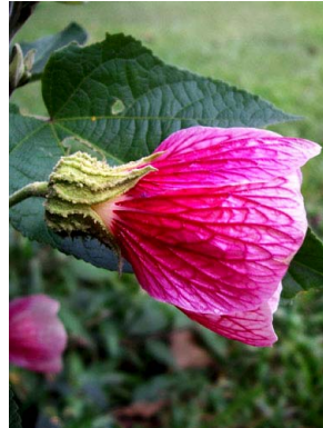
33 Abutilon regnellii C. Takeuchi