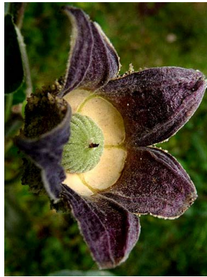
19 Abutilon latipetalum S.E. Martins