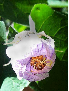
26 Abutilon mouraei C. Takeuchi