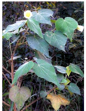
10 Abutilon costicalyx C. Takeuchi