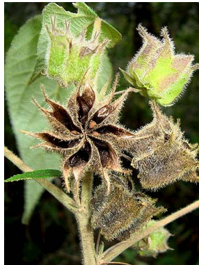
14 Abutilon itatiaiae