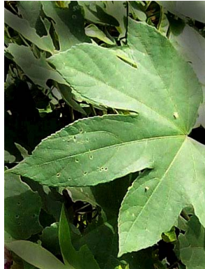
31 Abutilon regnellii C. Takeuchi