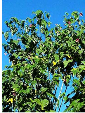
4 Abutilon bedfordianum C. Takeuchi