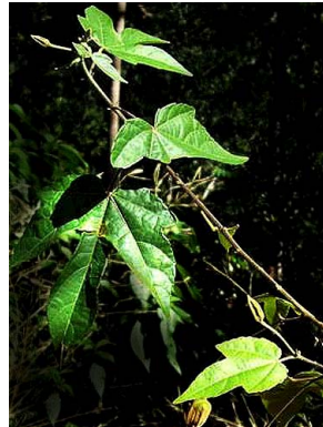
38 Abutilon striatum C. Takeuchi