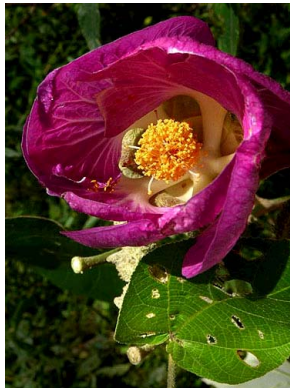
18 Abutilon latipetalum S.E. Martins