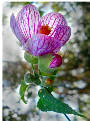
Abutilon bedfordianum C. Takeuchi