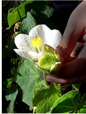
2 Abutilon amoenum C.V. da Silva