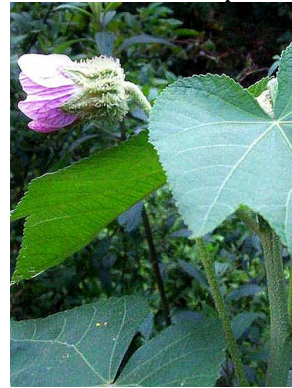
24 Abutilon macranthum C. Takeuchi