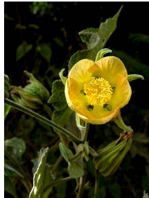
11 Abutilon costicalyx S.E. Martins