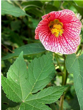
32 Abutilon regnellii C. Takeuchi