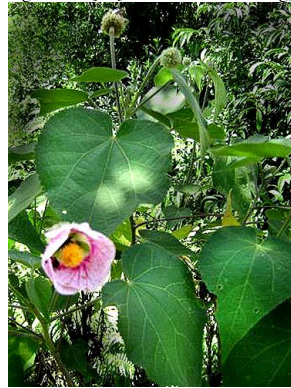
23 Abutilon macranthum C. Takeuchi