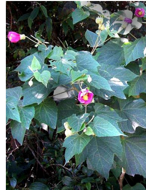
30 Abutilon regnellii C. Takeuchi