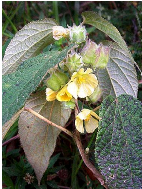
13 Abutilon itatiaiae C. Takeuchi