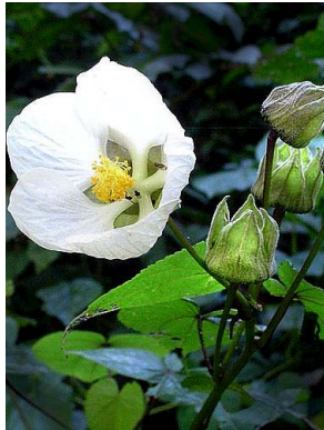
29 Abutilon nigricans S.E. Martins