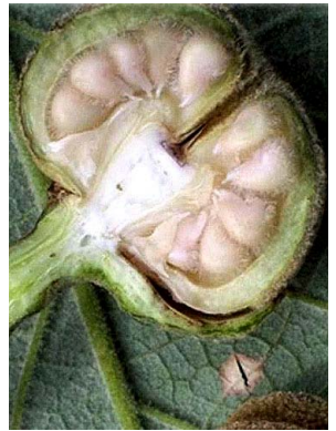
20 Abutilon latipetalum C. Takeuchi