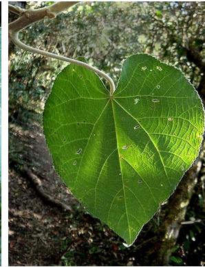
25 Abutilon mouraei C. Takeuchi