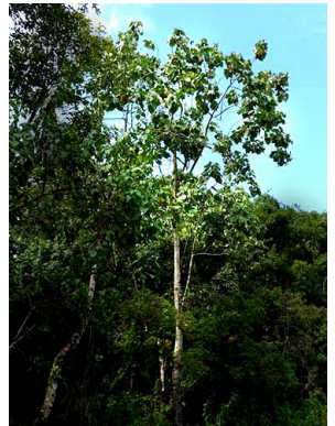
15 Abutilon latipetalum S.E. Martins