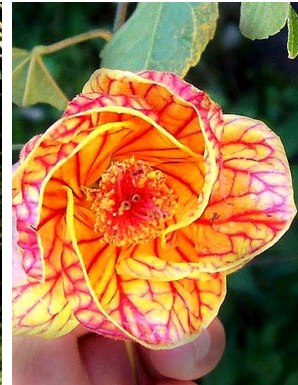
40 Abutilon striatum C. Takeuchi