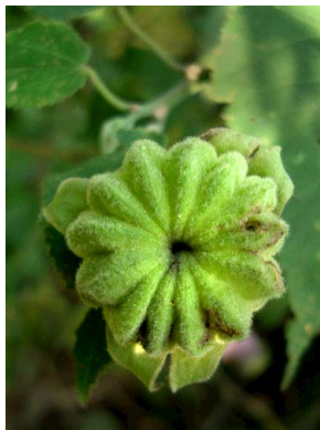
8 Abutilon bedfordianum