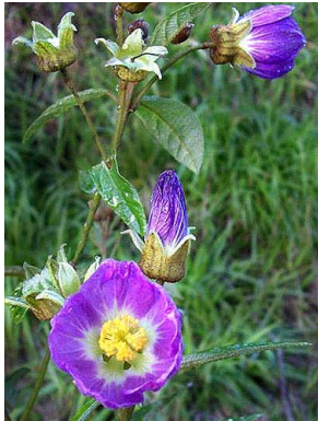
37 Abutilon rufinerve C. Takeuchi