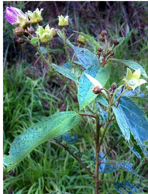
36 Abutilon rufinerve C. Takeuchi