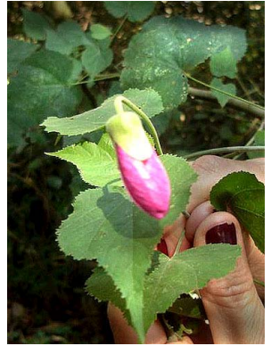
5 Abutilon bedfordianum G.L. Esteves