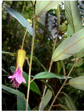
21 Abutilon longifolium V.M. Gonçalves

Rapid Color Guide # 325 version 1 04/2012