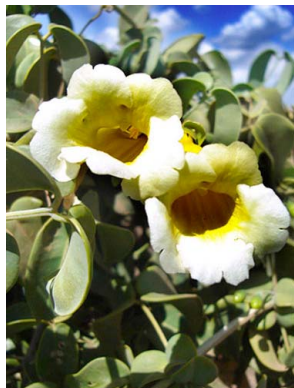
16 Anemopaegma laeve BIGNONIACEAE