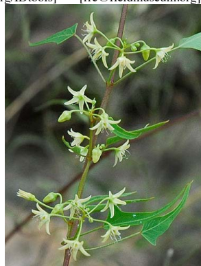
3 Ditassa hastata APOCYNACEAE