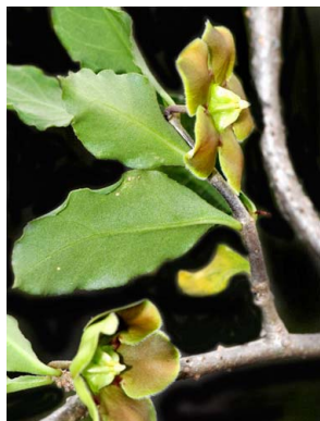
7 Marsdenia megalantha APOCYNACEAE