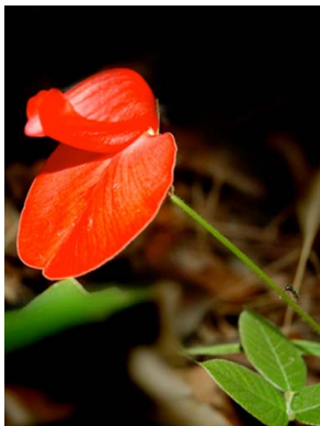
46 Periandra coccinea LEGUMINOSAE