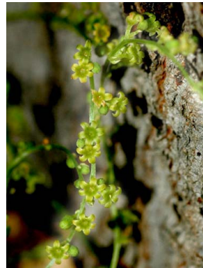
33 Dioscorea campestris DIOSCOREACEAE