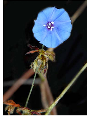
24 Jacquemontia agrestis CONVOLVULACEAE