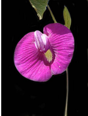
41 Centrosema brasilianum LEGUMINOSAE