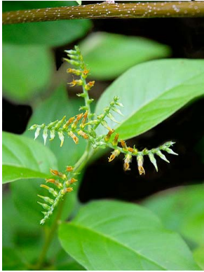
21 Tournefortia rubicunda BORAGINACEAE