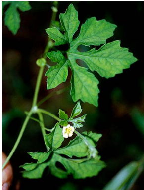
31 Momordica charantia CUCURBITACEAE