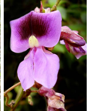
45 Dioclea virgata LEGUMINOSAE