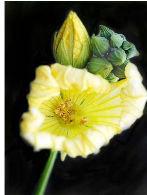
28 Luffa cylindrica CUCURBITACEAE