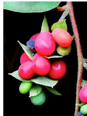
49 Cissampelos glaberrima MENISPERMACEAE