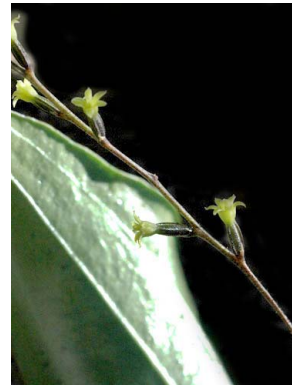
34 Dioscorea campestris DIOSCOREACEAE