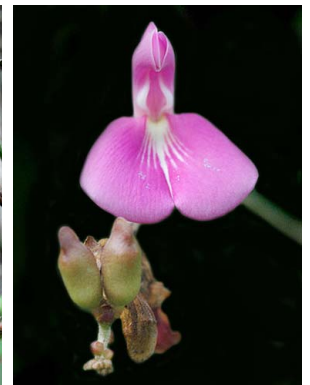
40 Canavalia dictyota LEGUMINOSAE