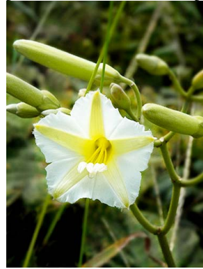
23 Ipomoea marcelia CONVOLVULACEAE