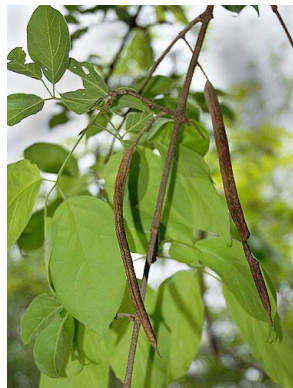
18 Fridericia triplinervia BIGNONIACEAE