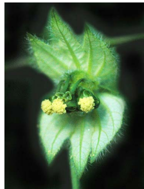
38 Dalechampia scandens EUPHORBIACEAE