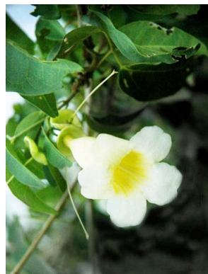
14 Anemopaegma album BIGNONIACEAE