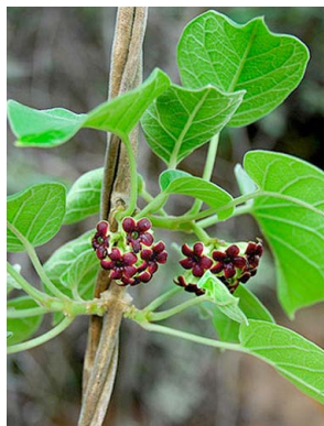
6 Marsdenia altissima APOCYNACEAE