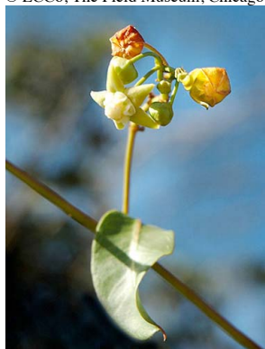
1 Blepharodon bicolor APOCYNACEAE