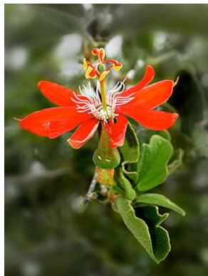
52 Passiflora luetzelburgii PASSIFLORACEAE