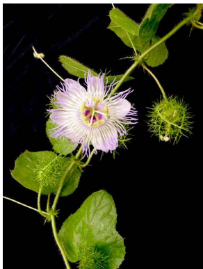
51 Passiflora foetida PASSIFLORACEAE