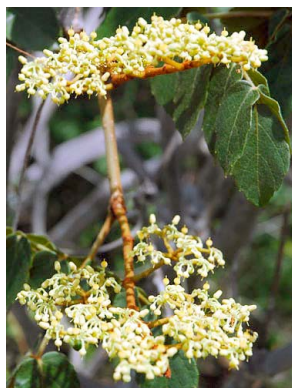
57 Cissus blanchetiana VITACEAE