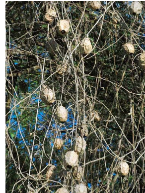
29 Luffa operculata CUCURBITACEAE