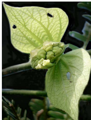
37 Dalechampia brasiliensis EUPHORBIACEAE