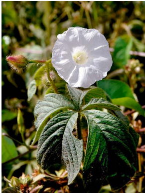
26 Merremia aegyptia CONVOLVULACEAE