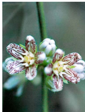
9 Matelea nigra APOCYNACEAE