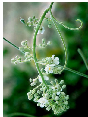
54 Serjania glabrata SAPINDACEAE