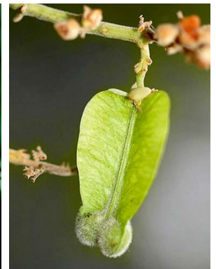
55 Serjania glabrata SAPINDACEAE