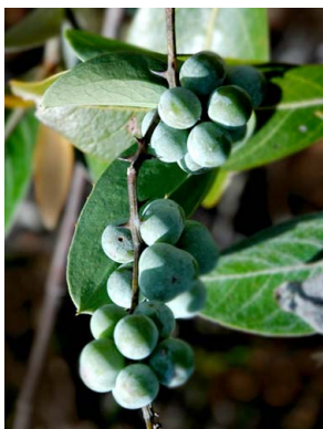
56 Smilax campestris SMILACACEAE