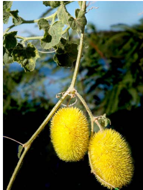
27 Cucumis dipsaceus CUCURBITACEAE