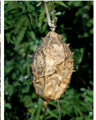
30 Luffa operculata CUCURBITACEAE