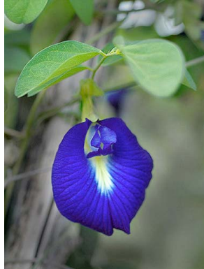
42 Clitoria ternatea LEGUMINOSAE