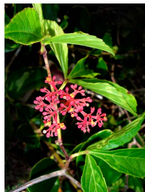
58 Cissus erosa VITACEAE