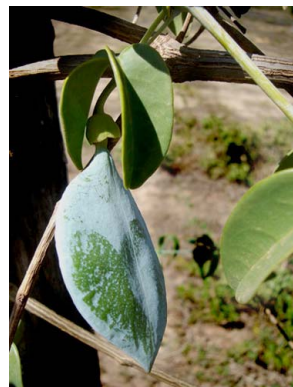
15 Anemopaegma laeve BIGNONIACEAE