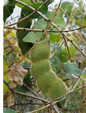
44 Dioclea grandiflora LEGUMINOSAE