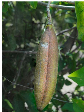
17 Dolichandra quadrivalvis BIGNONIACEAE