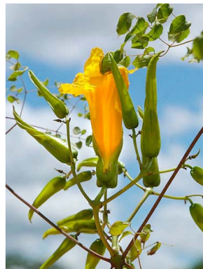
19 Neojobertia candolleana BIGNONIACEAE