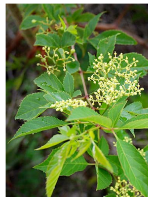
59 Cissus simsiana VITACEAE