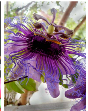
50 Passiflora cincinnata PASSIFLORACEAE