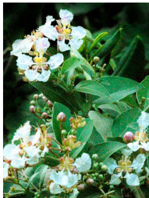
47 Banisteriopsis campestris MALPIGHIACEAE