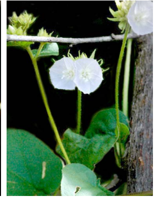
25 Jacquemontia densiflora CONVOLVULACEAE