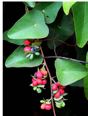
48 Cissampelos glaberrima MENISPERMACEAE