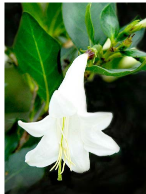
20 Pleonotoma castelnaei BIGNONIACEAE