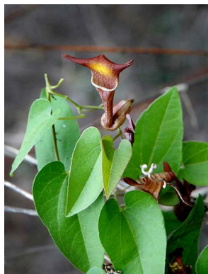
11 Aristolochia birostris ARISTOLOCHIACEAE