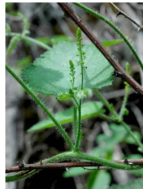
39 Tragia volubilis EUPHORBIACEAE