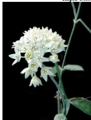
4 Funastrum clausum APOCYNACEAE