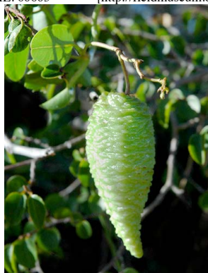
2 Blepharodon bicolor APOCYNACEAE