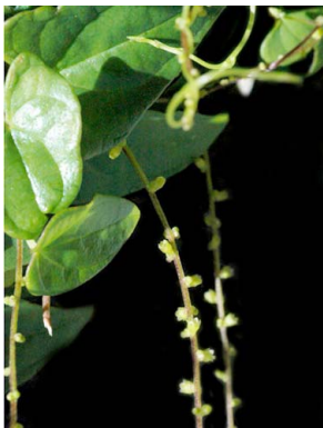
36 Dioscorea leptostachya DIOSCOREACEAE