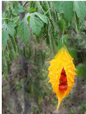
32 Momordica charantia CUCURBITACEAE