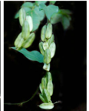
35 Dioscorea campestris DIOSCOREACEAE