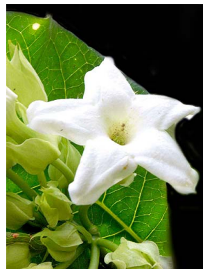
10 Schubertia grandiflora APOCYNACEAE