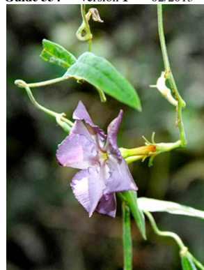
5 Mandevilla leptophylla APOCYNACEAE