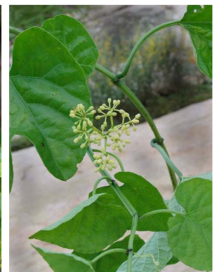
60 Cissus verticillata VITACEAE