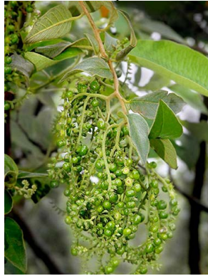
22 Tournefortia salzmannii BORAGINACEAE