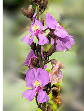
43 Dioclea grandiflora LEGUMINOSAE