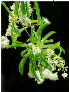
12 Herreria glaziovii ASPARAGACEAE