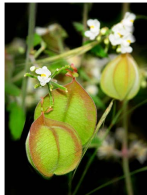
53 Cardiospermum corindum SAPINDACEAE