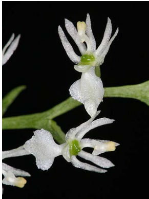
12 Phymatidium delicatulum var. curvisepalum