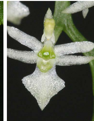
9 Phymatidium delicatulum