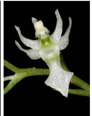
30 Phymatidium microphyllum var. herteri