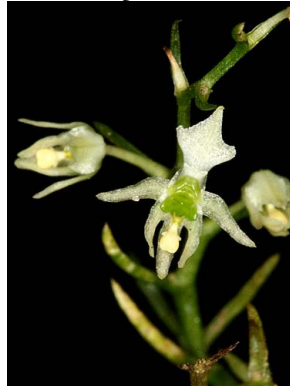
23 Phymatidium mellobaretoi