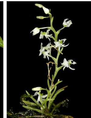
19 Phymatidium hysternanthum Brazil