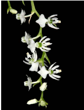
11 Phymatidium delicatulum var. curvisepalum