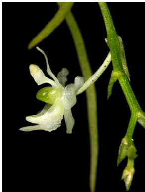
16 Phymatidium falcifolium