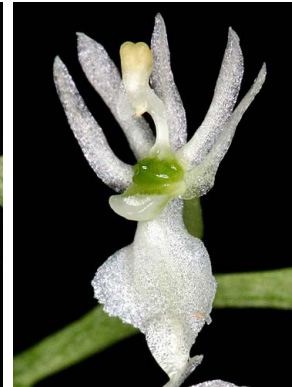
13 Phymatidium delicatulum var. curvisepalum