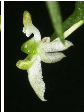
8 Phymatidium delicatulum