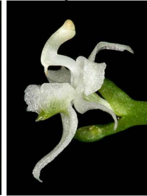
3 Phymatidium aquinoi