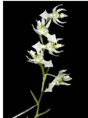
29 Phymatidium microphyllum var. herteri