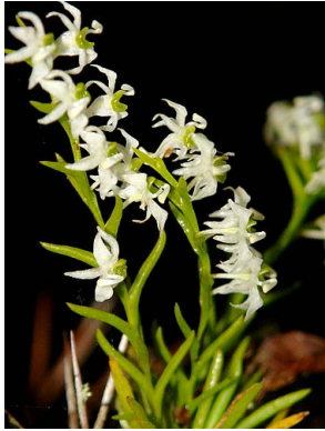
1 Phymatidium aquinoi Brazil

Rapid Color Guide # 555 version 1 04/2014