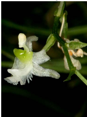
17 Phymatidium falcifolium