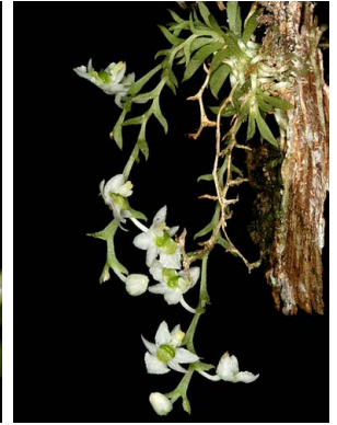
25 Phymatidium microphyllum