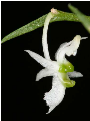
7 Phymatidium delicatulum