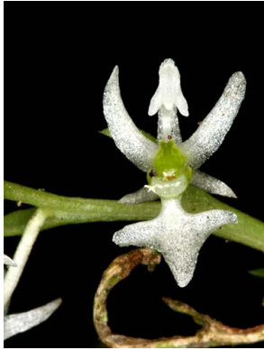
21 Phymatidium hysteroanthum

Rapid Color Guide # 555 version 1 04/2014