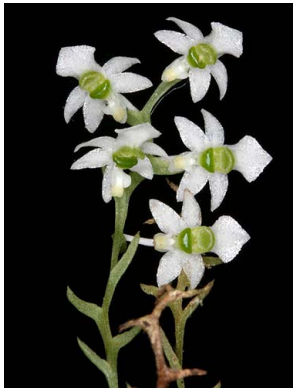
26 Phymatidium microphyllum