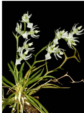
28 Phymatidium microphyllum var. herteri