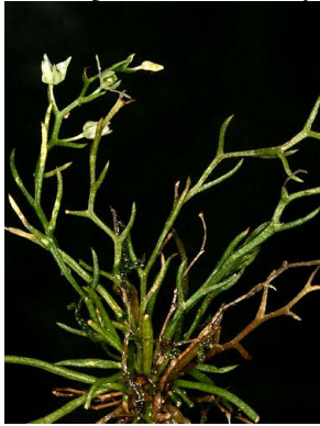
22 Phymatidium mellobaretoi