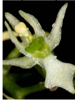
24 Phymatidium mellobaretoi