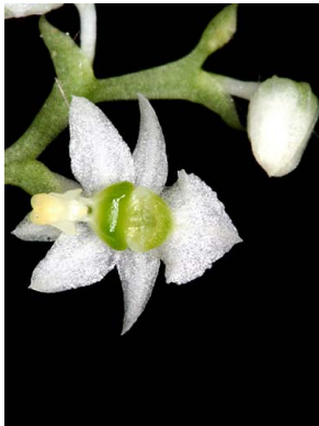
27 Phymatidium microphyllum