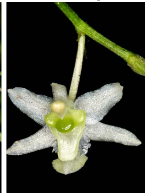
18 Phymatidium falcifolium