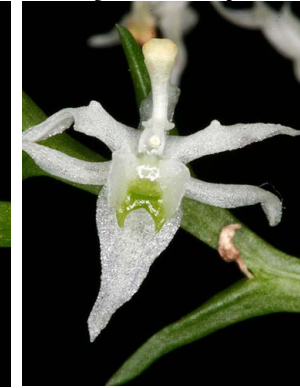
4 Phymatidium aquinoi