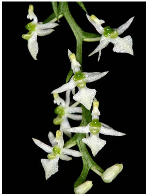
6 Phymatidium delicatulum