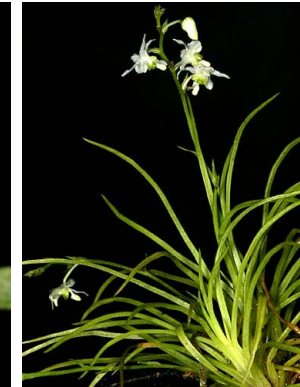
14 Phymatidium falcifolium Brazil, Uruguay