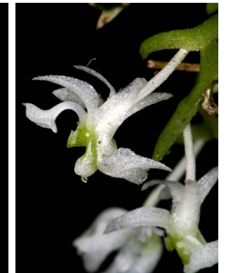
20 Phymatidium hysternanthum