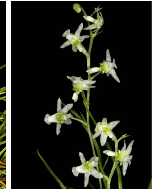
15 Phymatidium falcifolium