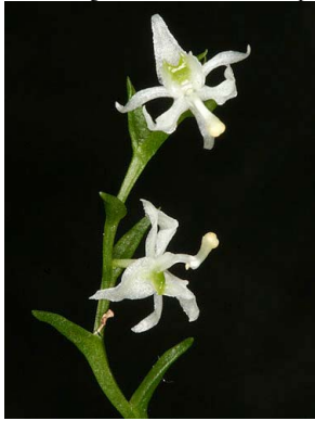
2 Phymatidium aquinoi