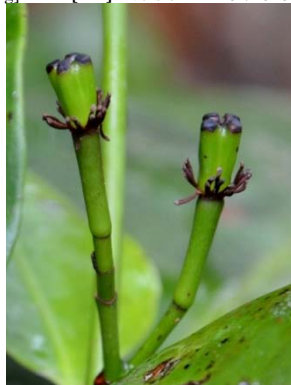
5 Tovomita brevistaminea (♀)