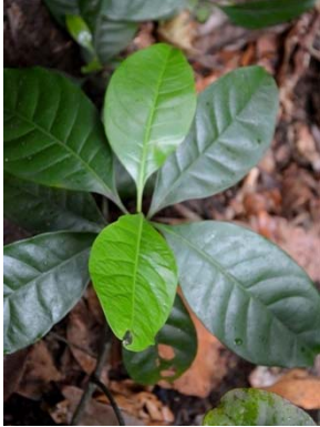
39 Tovomita mangle