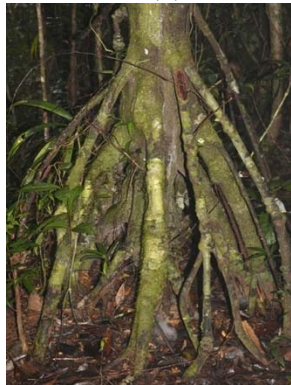
35 Tovomita longifolia