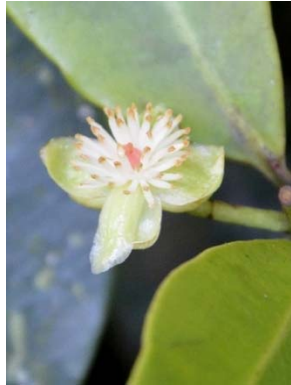
30 Tovomita iaspidis (♂)