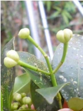
24 Tovomita glazioviana (♂)