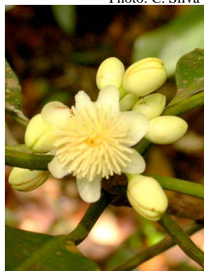
14 Tovomita choisyana (♂)