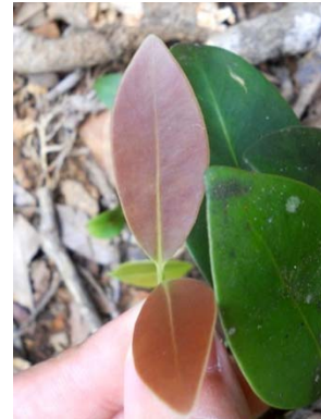
27 Tovomita iaspidis