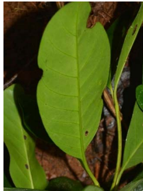
36 Tovomita longifolia