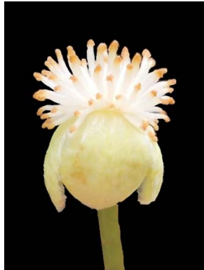
25 Tovomita glazioviana (♂)