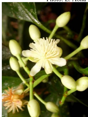
13 Tovomita choisyana (♂)