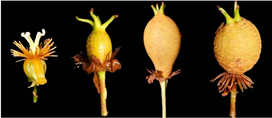
21 Tovomita fructipendula (♀)