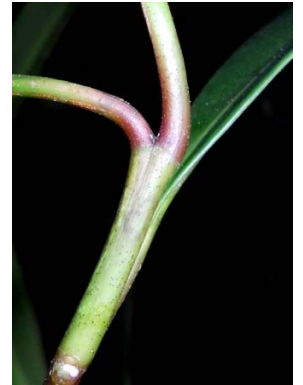
28 Tovomita iaspidis