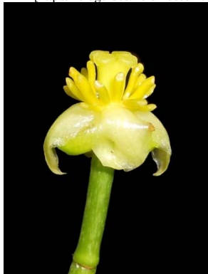
4 Tovomita brevistaminea (♀)