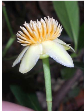
50 Tovomita megantha (♂)