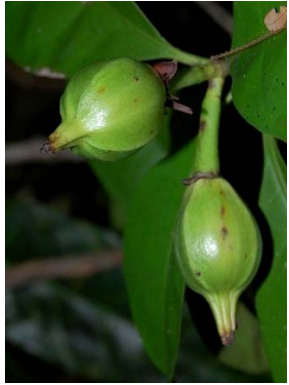
44 Tovomita mangle