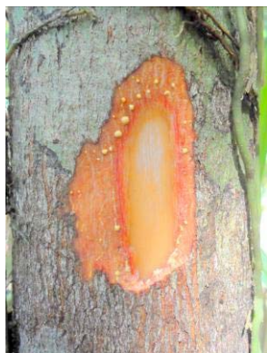
11 Tovomita choisyana