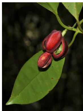
9 Tovomita brevistaminea