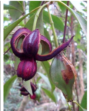
58 Tovomita riedeliana