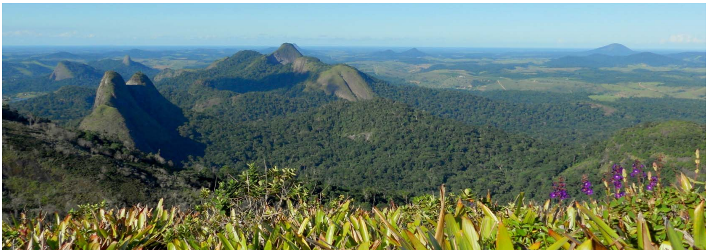
Tijuca National Park, Rio de Janeiro, Brazil