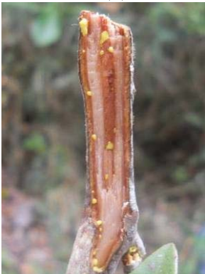
54 Tovomita riedeliana