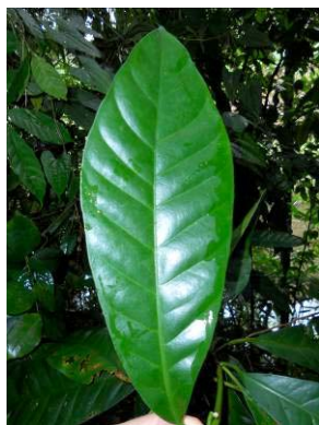
12 Tovomita choisyana