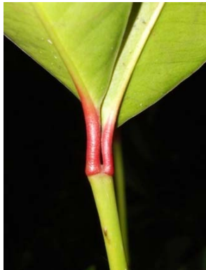
56 Tovomita riedeliana