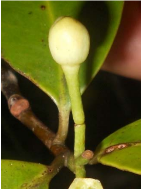
29 Tovomita iaspidis