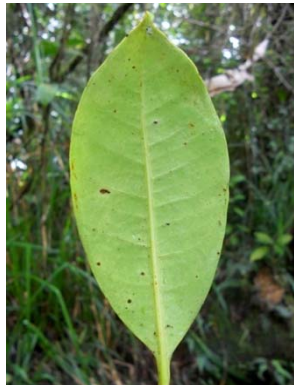
1 Tovomita brevistaminea