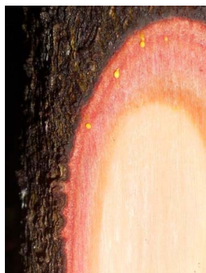
16 Tovomita fructipendula