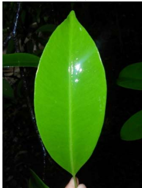
55 Tovomita riedeliana