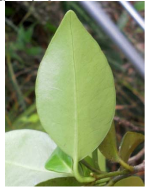
23 Tovomita glazioviana