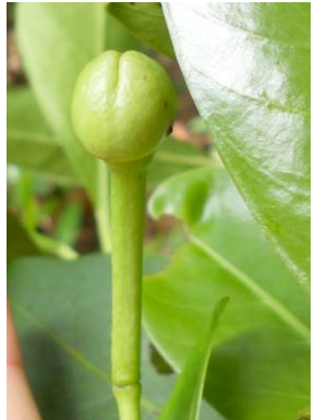
49 Tovomita megantha (♂)