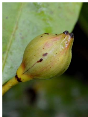
6 Tovomita brevistaminea