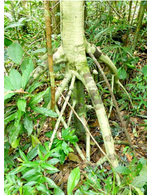
47 Tovomita megantha