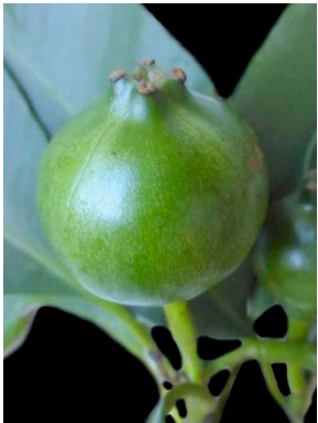
34 Tovomita leucantha