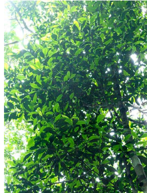
46 Tovomita megantha