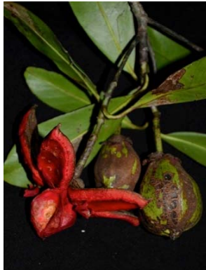
51 Tovomita megantha