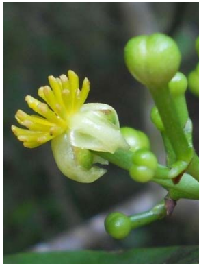
3 Tovomita brevistaminea (♂)