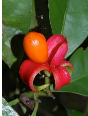
45 Tovomita mangle