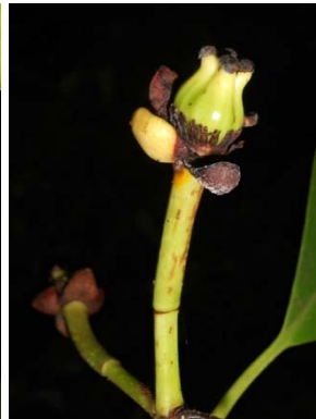
57 Tovomita riedeliana (♀)