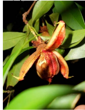
22 Tovomita fructipendula (♀)