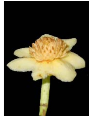
38 Tovomita longifolia (♀)