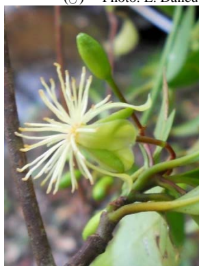
18 Tovomita fructipendula (♂)