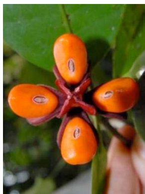
8 Tovomita brevistaminea