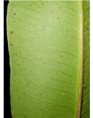
33 Tovomita leucantha