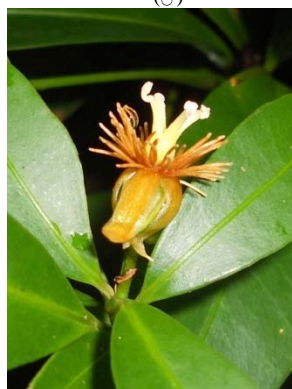
19 Tovomita fructipendula (♀)