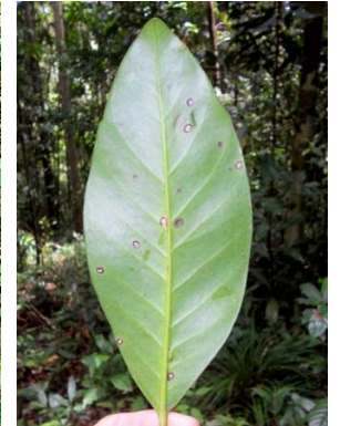
48 Tovomita megantha