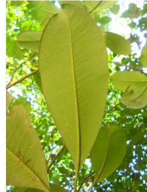
32 Tovomita leucantha