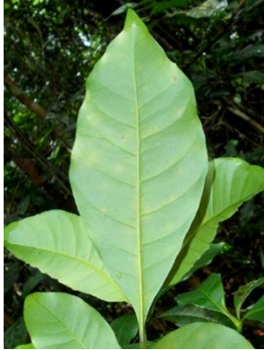
40 Tovomita mangle