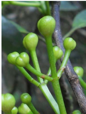
2 Tovomita brevistaminea (♂)