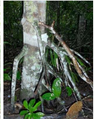
53 Tovomita riedeliana