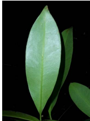
26 Tovomita iaspidis