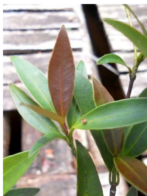
17 Tovomita fructipendula