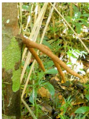
10 Tovomita choisyana