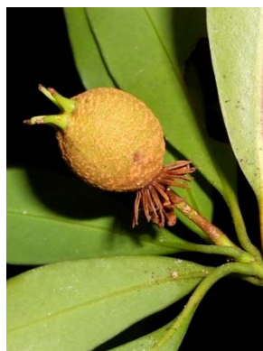
20 Tovomita fructipendula