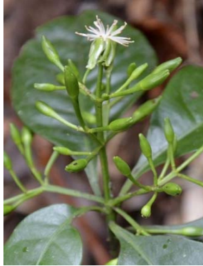
41 Tovomita mangle (♂)