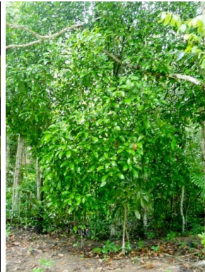
52 Tovomita riedeliana