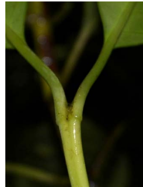
37 Tovomita longifolia