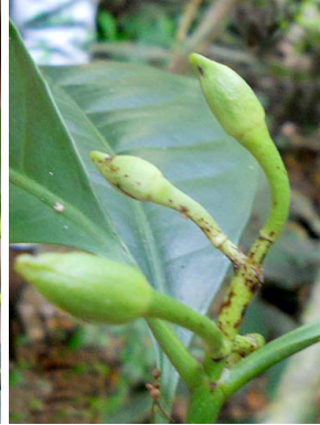
42 Tovomita mangle (♀)