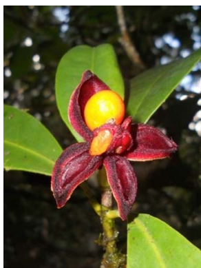
7 Tovomita brevistaminea