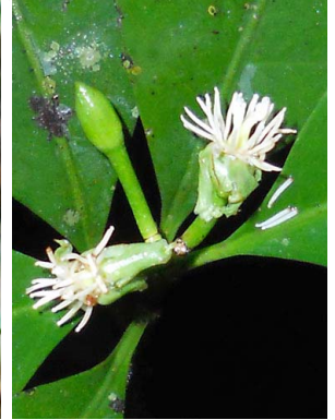
43 Tovomita mangle (♀)