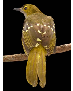
45 Nicator chloris NICATORIDAE