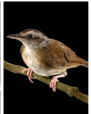
60 Illadopsis cleaveri PELLORNEIDAE