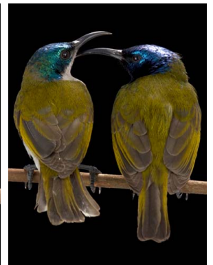
80 Cyanomitra verticalis NECTARINIIDAE