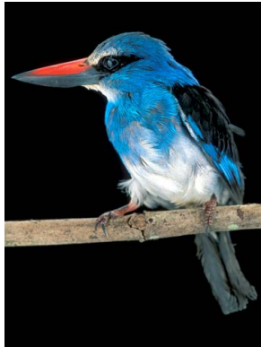
27 Halcyon malimbica ALCEDINIDAE