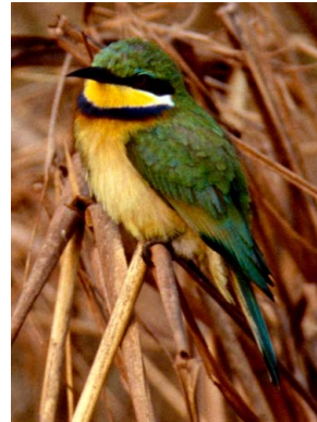
29 Merops variegatus MEROPIDAE