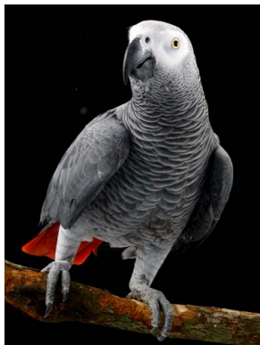
37 Psittacus erithacus PSITTACIDAE