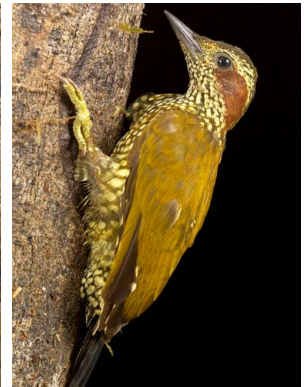
35 Campethera caroli PICIDAE