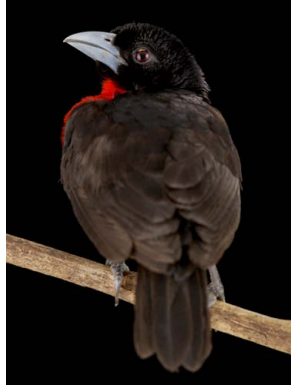
88 Malimbus nitens PLOCEIDAE