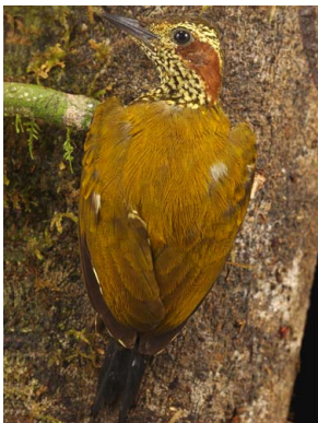
36 Campethera caroli PICIDAE