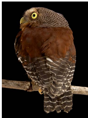
18 Glaucidium sjostedti STRIGIDAE