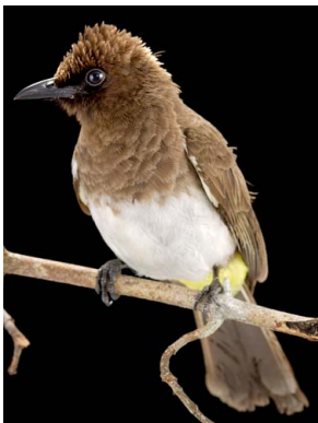
56 Pycnonotus barbatus PYCNONOTIDAE