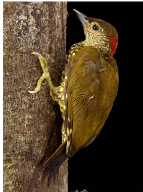
33 Campethera nivosa PICIDAE