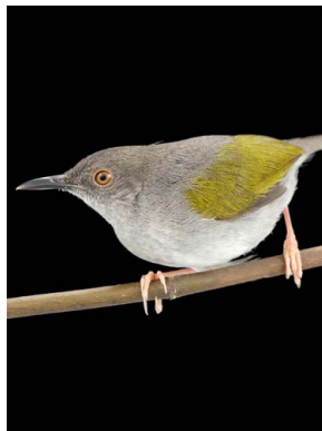
58 Camaroptera brachyura CISTICOLIDAE