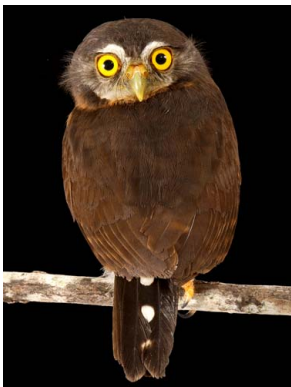
16 Glaucidium tephronotum STRIGIDAE