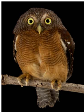
17 Glaucidium sjostedti STRIGIDAE