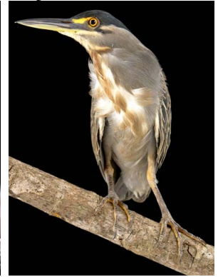
5 Butorides striatus ARDEIDAE