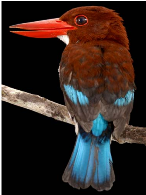
26 Halcyon badia ALCEDINIDAE