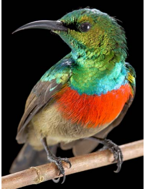
86 Cinnyris chloropygius NECTARINIIDAE