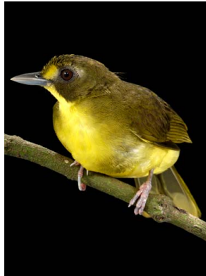
48 Bleda notatus PYCNONOTIDAE