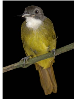
49 Criniger calurus PYCNONOTIDAE