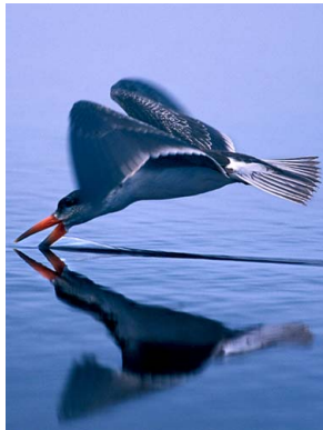
12 Rynchops flavirostris RYNCHOPIDAE