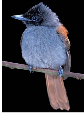
43 Terpsiphone viridis MONARCHIDAE