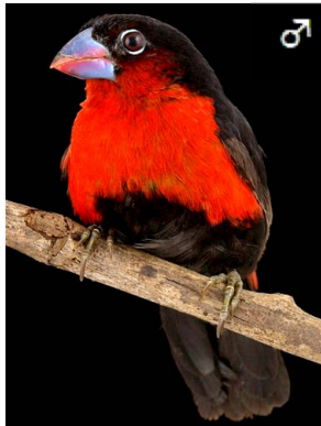
94 Spermophaga haematina ESTRILDIDAE