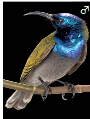
79 Cyanomitra verticalis NECTARINIIDAE