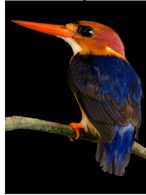
24 Ispidina lecontei ALCEDINIDAE