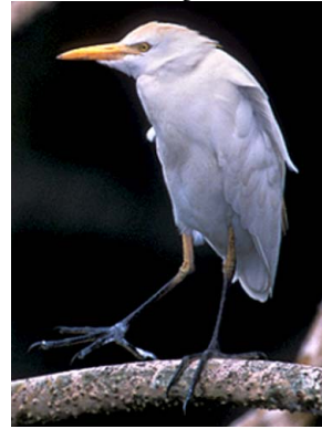
4 Bulbulcus ibis ARDEIDAE