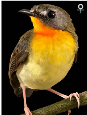
67 Stiphornis pyrrholaemus MUSCIPIDAE