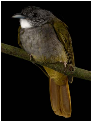
51 Criniger chloronotus PYCNONOTIDAE