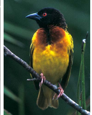
90 Ploceus cucullatus PLOCEIDAE