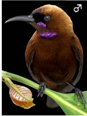
83 Chalcomitra fuliginosa NECTARINIIDAE