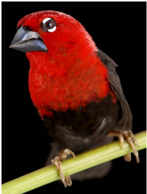
91 Pyrenestes ostrinus ESTRILDIDAE