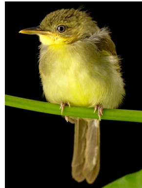
54 Phyllastrephus icterinus PYCNONOTIDAE