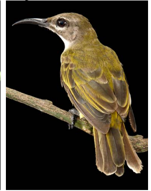
85 Chalcomitra rubescens NECTARINIIDAE