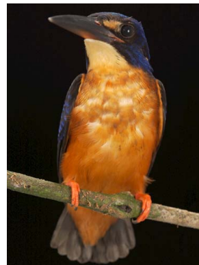
19 Alcedo quadribrachys ALCEDINIDAE