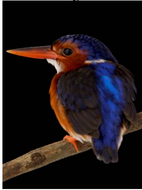
22 Alcedo leucogaster ALCEDINIDAE