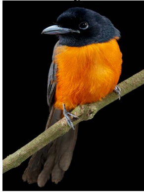
42 Terpsiphone rufiventer MONARCHIDAE