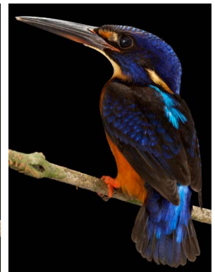
20 Alcedo quadribrachys ALCEDINIDAE