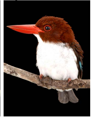
25 Halcyon badia ALCEDINIDAE