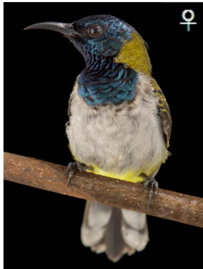
72 Anabathmis reichenbachii NECTARINIIDAE