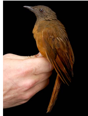
69 Neocossyphus rufus TURDIDAE