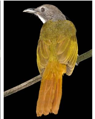
50 Criniger calurus PYCNONOTIDAE