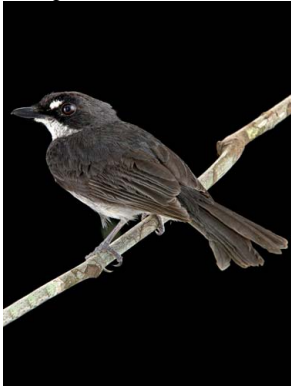
61 Fraseria cinerascens MUSCIPIDAE

[fieldguides@fieldmuseum.org] [869] version 1 03/2017