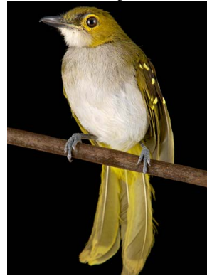
44 Nicator chloris NICATORIDAE