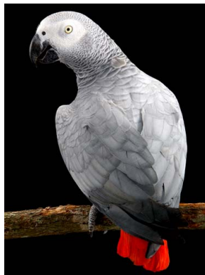
38 Psittacus erithacus PSITTACIDAE