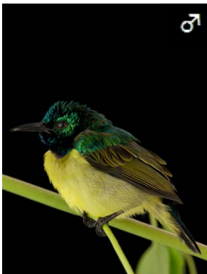
76 Hedydipna collaris NECTARINIIDAE