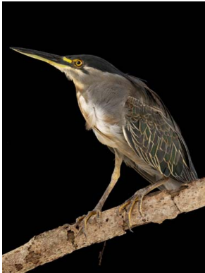
6 Butorides striatus ARDEIDAE