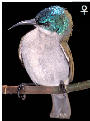
78 Cyanomitra verticalis NECTARINIIDAE