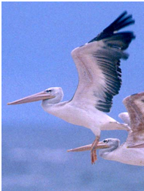
11 Pelecanus rufescens PELECANIDAE