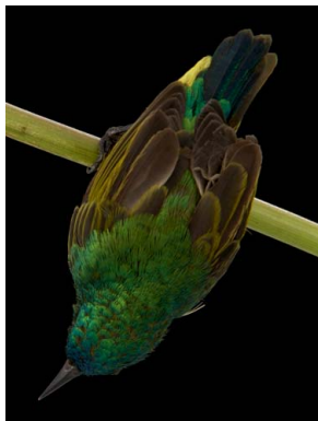
77 Hedydipna collaris NECTARINIIDAE