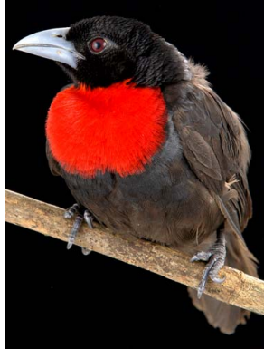
87 Malimbus nitens PLOCEIDAE