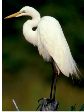
3 Ardea alba ARDEIDAE