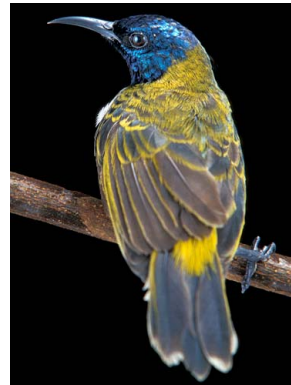
74 Anabathmis reichenbachii 75 NECTARINIIDAE