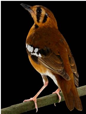
71 Zoothera camaronensis TURDIDAE