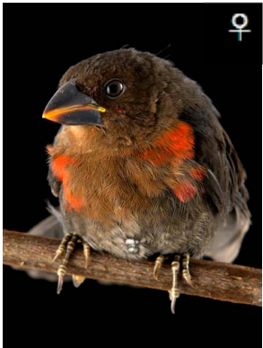
93 Spermophaga haematina ESTRILDIDAE