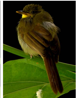
55 Phyllastrephus icterinus PYCNONOTIDAE