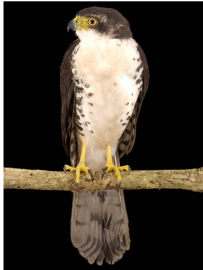
7 Accipiter tachiro ACCIPITRIDAE