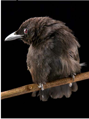
41 Laniarius leucorhynchus MALACONOTIDAE

[fieldguides@fieldmuseum.org] [869] version 1 03/2017