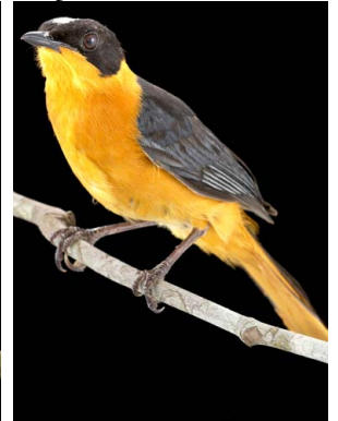
65 Cossypha niveicapilla MUSCIPIDAE