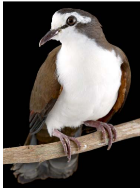
13 Turtur tympanistria COLUMBIDAE