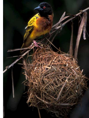
89 Ploceus cucullatus PLOCEIDAE