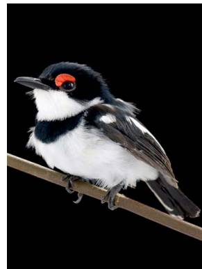
39 Platysteira cyanea PLATYSTEIRIDAE