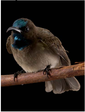
81 Cyanomitra cyanolaema NECTARINIIDAE

[fieldguides@fieldmuseum.org] [869] version 1 03/2017