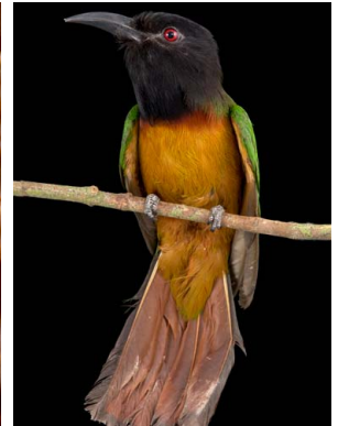
30 Merops breweri MEROPIDAE