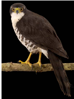
8 Accipiter tachiro ACCIPITRIDAE