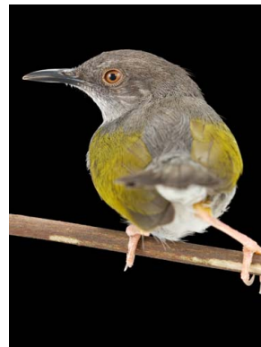
59 Camaroptera brachyura CISTICOLIDAE