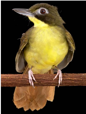
46 Bleda syndactylus PYCNONOTIDAE