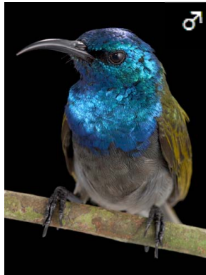
73 Anabathmis reichenbachii NECTARINIIDAE