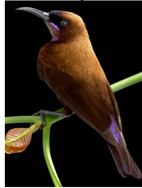
84 Chalcomitra fuliginosa NECTARINIIDAE