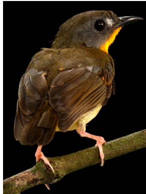
68 Stiphornis pyrrholaemus MUSCIPIDAE