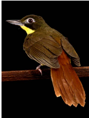
47 Bleda syndactylus PYCNONOTIDAE