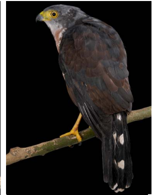
10 Accipiter castanilius ACCIPITRIDAE