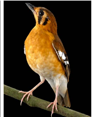
70 Zoothera camaronensis TURDIDAE