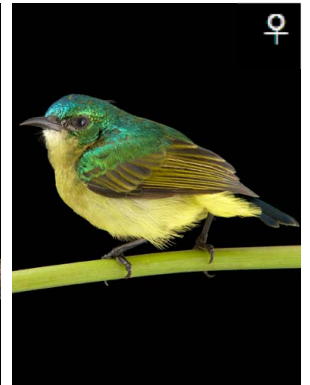
Hedydipna collaris NECTARINIIDAE