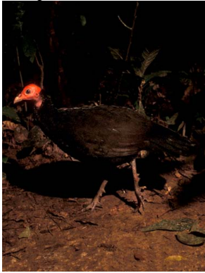
1 Agelastes niger NUMIDIDAE

[fieldguides@fieldmuseum.org] [869] version 1 03/2017