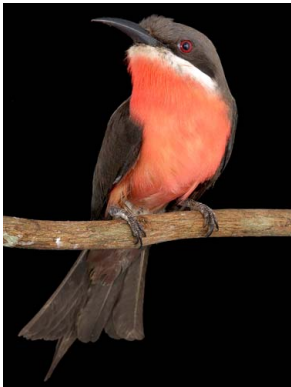
31 Merops malimbicus MEROPIDAE