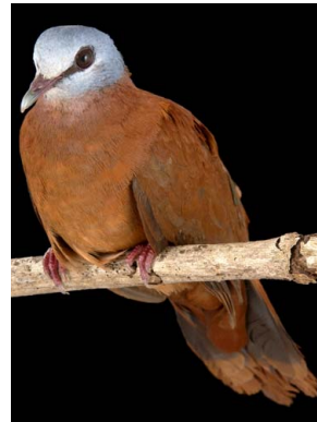
14 Turtur brehmeri COLUMBIDAE