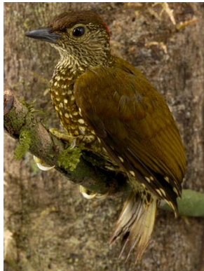
32 Campethera nivosa PICIDAE