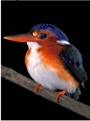
21 Alcedo leucogaster ALCEDINIDAE

[fieldguides@fieldmuseum.org] [869] version 1 03/2017