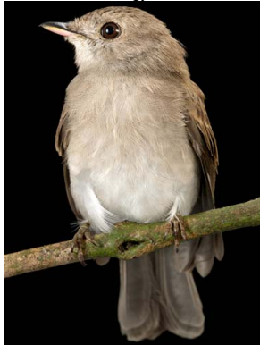
62 Muscicapa olivascens MUSCIPIDAE