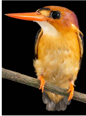
23 Ispidina lecontei ALCEDINIDAE