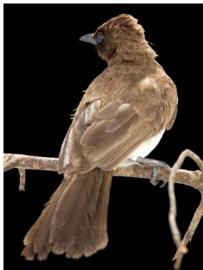
57 Pycnonotus barbatus PYCNONOTIDAE