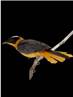
66 Cossypha niveicapilla MUSCIPIDAE