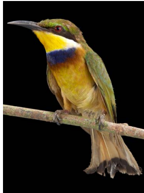
28 Merops variegatus MEROPIDAE