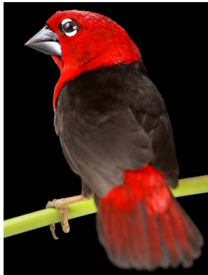
92 Pyrenestes ostrinus ESTRILDIDAE