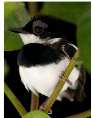
40 Dyaphorophyia castanea PLATYSTEIRIDAE