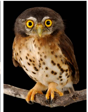
15 Glaucidium tephronotum STRIGIDAE