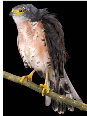
9 Accipiter castanilius ACCIPITRIDAE