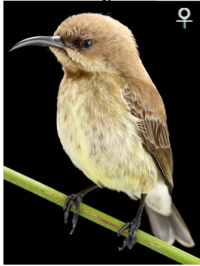
82 Chalcomitra fuliginosa NECTARINIIDAE