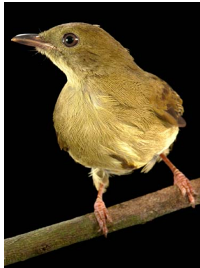
53 Andropadus virens PYCNONOTIDAE