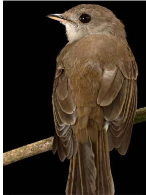
63 Muscicapa olivascens MUSCIPIDAE