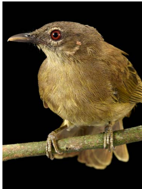
52 Andropadus curvirostris PYCNONOTIDAE