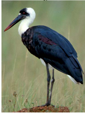
2 Ciconia microscelis CICONIIDAE