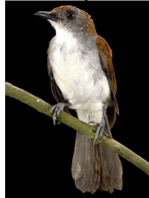
64 Alethe castanea MUSCIPIDAE