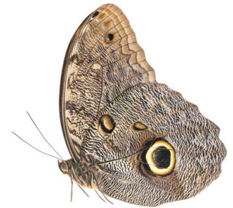
24 Caligo telamonius NYMPHALIDAE Owl butterfly