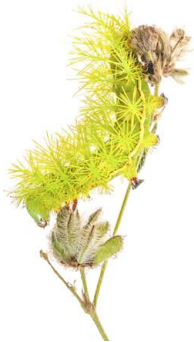
25 Automeris sp. SATURNIIDAE