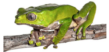
40 Phyllomedusa bicolor HYLIDAE Giant waxy monkey tree frog