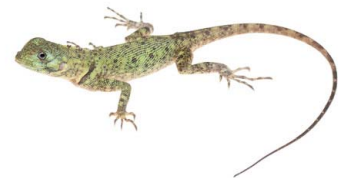
60 Plica umbra TROPIDURIDAE Blue-lipped tree lizard