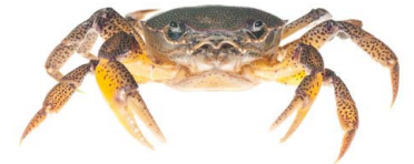
28 Sylviocarcinus pictus TRICHODACTYLIDAE Jaguar river crab