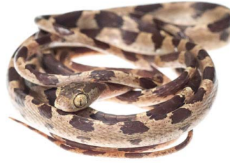
67 Imantodes cenchoa COLUBRIDAE Blunt headed tree snake