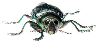
13 Euchroma gigantea BUPRESTIDAE Giant wood ceiba borer