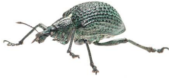
17 Entimus granulatus CURCULIONIDAE Weevil

© Keller Science Action Center, Science and Education, The Field Museum [fieldguides@fieldmuseum.org] [fieldguides.fieldmuseum.org] Rapid Color Guide #974 version 1 1/2018