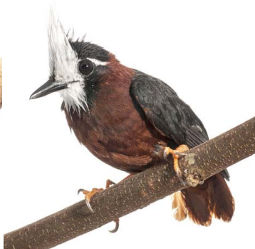
90 Pithys albifrons THAMNOPHILIDAE White-plumed antbird