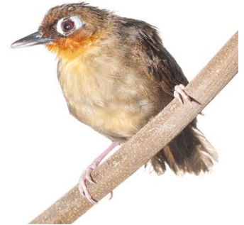
88 Gymnophthalmus rufigula THAMNOPHILIDAE Rufous-throated antbird