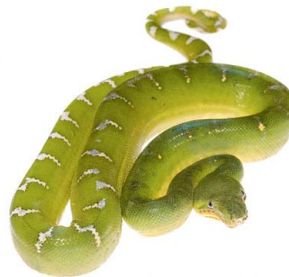
63 Corallus caninus BOIDAE Emerald tree boa