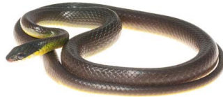
66 Drymoluber dichrous COLUBRIDAE Common glossy racer