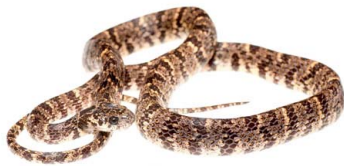
69 Sibon nebulatus COLUBRIDAE Cloudy snail-eating snake