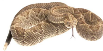
78 Crotalus durissus VIPERIDAE Neotropical rattlesnake