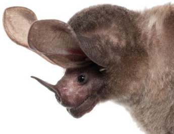
94 Lophostoma silvicolum PHYLLOSTOMIDAE White-throated round-eared bat