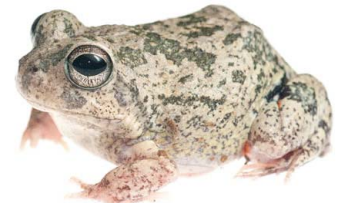
48 Pleurodema brachyops LEPTODACTYLIDAE Colombian four-eyed frog