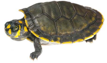
84 Podocnemis unifilis PODOCNEMIDIADAE Yellow-spotted river turtle