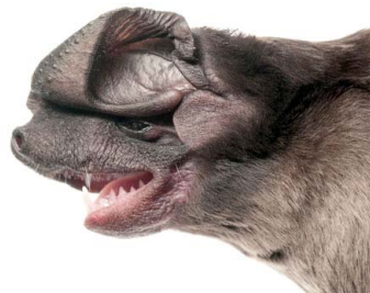
91 Eumops hansae MOLOSSIDAE Sanborn's bonneted bat