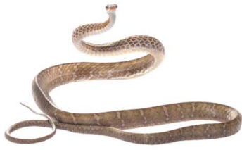
65 Chironius fuscus COLUBRIDAE Olive whipsnake

© Keller Science Action Center, Science and Education, The Field Museum [fieldguides@fieldmuseum.org] [fieldguides.fieldmuseum.org] Rapid Color Guide #974 version 1 1/2018