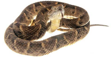
76 Bothrops atrox VIPERIDAE Fer-de-lance