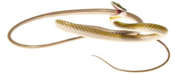
68 Leptophis ahaetulla COLUBRIDAE Parrot snake