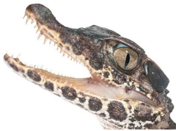
53 Paleosuchus trigonatus ALLIGATORIDAE Smooth-fronted caiman