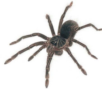
11 Theraphosa stirmi THERAPHOSIDAE Burgundy bird-eater tarantula