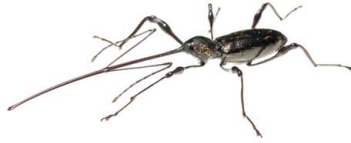
18 Hammatostylus cf. gronovii CURCULIONIDAE Long-snouted Weevil