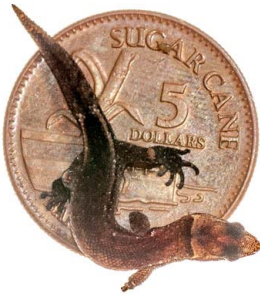
57 Pseudogonatodes guianensis SPHAERODACTYLIDAE Amazon clawed gecko