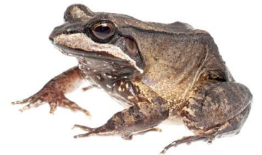
44 Leptodactylus rhodomystax LEPTODACTYLIDAE Loreto white-lipped frog