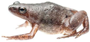
49 Chiasmocleis shudikarensis MICROHYLIDAE

© Keller Science Action Center, Science and Education, The Field Museum [fieldguides@fieldmuseum.org] [fieldguides.fieldmuseum.org] Rapid Color Guide #974 version 1 1/2018