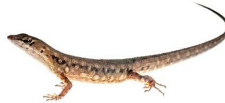
55 Neusticurus bicarinatus GYMNOPHTHALMIDAE Two-faced Neusticurus