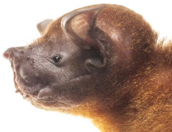
93 Noctilio leporinus NOCTILIONIDAE Greater bulldog bat