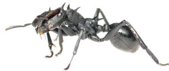
6 Cephalotes atratus FORMICIDAE Gliding ant