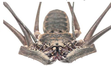
27 Heterophrynus alces PHRYNIDAE Tailless whip scorpion