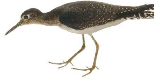
87 Tringa solitaria SCOLOPACIDAE Solitary sandpiper