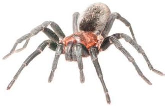
9 Bumba cabocla THERAPHOSIDAE Brazilian redhead