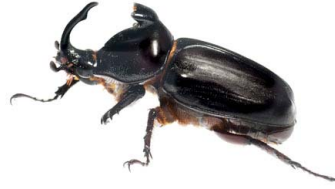
19 Podischnus agenor DYNASTIDAE Scarab beetle