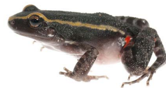
46 Lithodytes lineatus LEPTODACTYLIDAE Gold striped frog