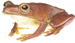
34 Boana boans HYLIDAE Gladiator tree frog