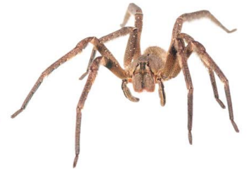
8 Phoneutria sp. CTENIDAE Banana spider