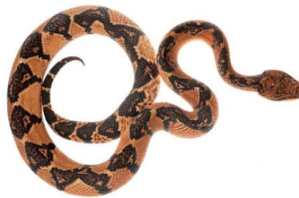
79 Lachesis muta VIPERIDAE Bushmaster