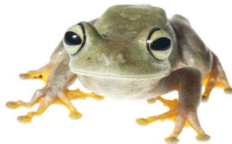
38 Boana xerophylla HYLIDAE Emerald-eyed tree frog