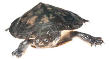
80 Mesoclemmys gibba CHELIDAE Gibba turtle