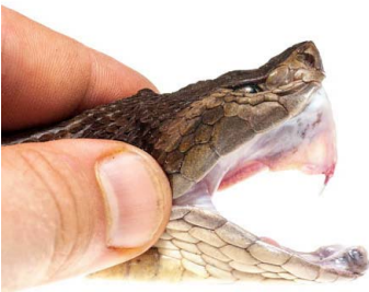
77 Bothrops atrox VIPERIDAE Fer-de-lance