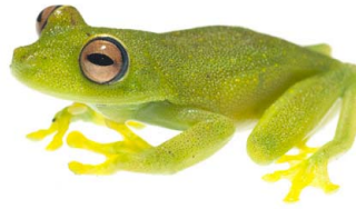
35 Boana cinerascens HYLIDAE Demerara Falls tree frog