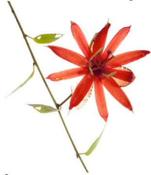
2 Passiflora glandulosa PASSIFLORACEAE Passionflower