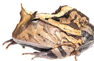
31 Ceratophrys cornuta CERATOPHRYIDAE Surinam horned toad