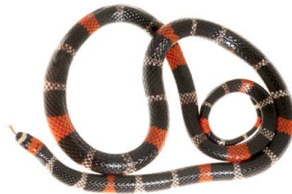
74 Micrurus lemniscatus ELAPIDAE South American coral snake