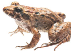
43 Leptodactylus petersii LEPTODACTYLIDAE Peter's jungle frog