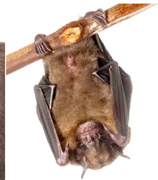
96 Sturnira tildae PHYLLOSTOMIDAE Tilda's yellow-shouldered bat