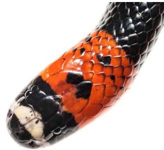
75 Micrurus lemniscatus ELAPIDAE South American coral snake