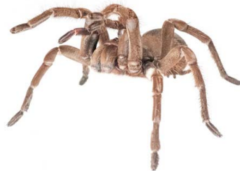
10 Theraphosa stirmi THERAPHOSIDAE Burgundy bird-eater tarantula