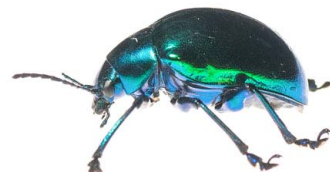
14 Eumolpus sp. CHRYSOMELIDAE Leaf beetle