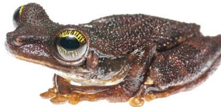
39 Osteocephalus taurinus HYLIDAE Manaus slender-legged tree frog