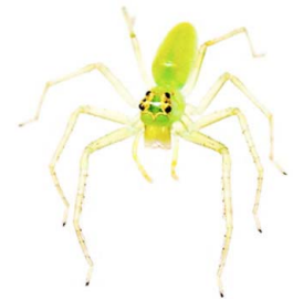
12 Lyssomanes sp. SALTICIDAE Jumping spider