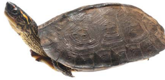
83 Rhinoclemmys punctularia GEOEMYDIDAE South American wood turtle