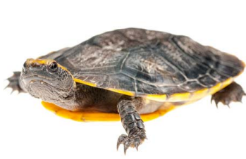
81 Platemys platycephala CHELIDAE Twist neck turtle

© Keller Science Action Center, Science and Education, The Field Museum [fieldguides@fieldmuseum.org] [fieldguides.fieldmuseum.org] Rapid Color Guide #974 version 1 1/2018