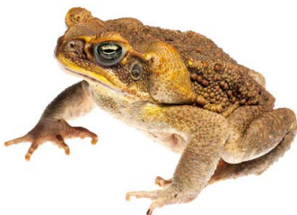
29 Rhinella marina BUFONIDAE Cane toad