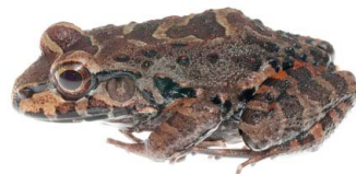
42 Leptodactylus myersi LEPTODACTYLIDAE Myers' thin-toed frog