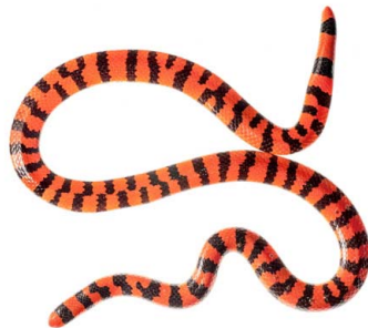
62 Anilius scytale ANILIIDAE Coral pipe snake