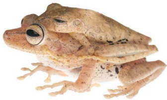
37 Boana fasciata HYLIDAE Gunther's banded tree frog