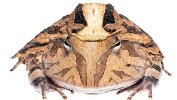
32 Ceratophrys cornuta CERATOPHRYIDAE Surinam horned toad