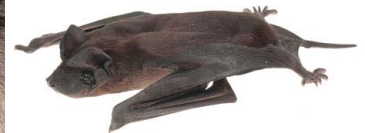
92 Molossus rufus MOLOSSIDAE Black mastiff bat