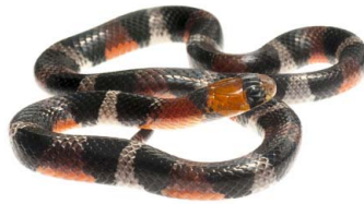
70 Erythrolamprus aesculapii DIPSADIDAE False coral snake