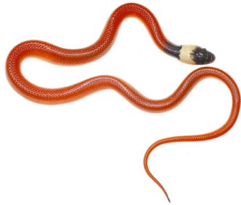
73 Pseudoboa newwiedii DIPSADIDAE Ratonel