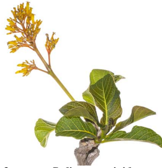
3 Palicourea rigida RUBIACEAE