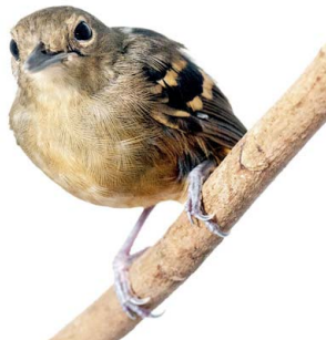
89 Isleria guttata THAMNOPHILIDAE Rufous-bellied antwren