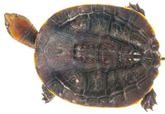
82 Platemys platycephala CHELIDAE Twist neck turtle