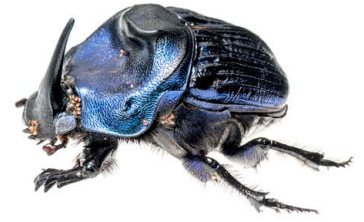
20 Coprophanaeus lancifer SCARABAEIDAE Giant Amazon scarab beetle