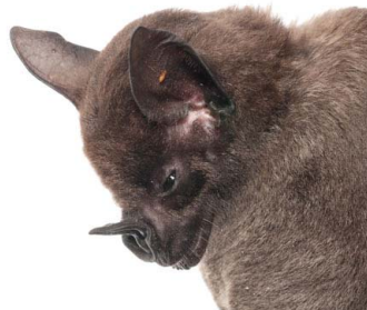
95 Phyllostomus hastatus PHYLLOSTOMIDAE Greater spear-nosed bat