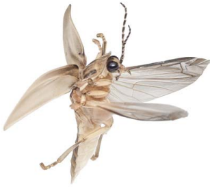
21 LAMPYRIDAE Lightning bug