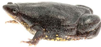
50 Elachistocleis surinamensis MICROHYLIDAE Flashy narrow-mouthed frog