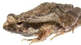
47 Physalaemus cuvieri LEPTODACTYLIDAE Barker frog