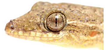
56 Thecadactylus rapicauda PHYLLODACTYLIDAE Turnip-tailed gecko