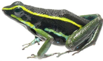
33 Ameerega trivittatus DENDROBATIDAE Three striped poison frog

© Keller Science Action Center, Science and Education, The Field Museum [fieldguides@fieldmuseum.org] [fieldguides.fieldmuseum.org] Rapid Color Guide #974 version 1 1/2018