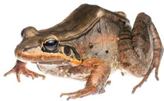
41 Leptodactylus guianensis LEPTODACTYLIDAE