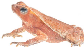
30 Rhinella martyi BUFONIDAE Crested toad