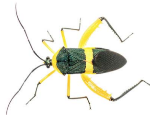
15 Paryphes flavocinctus COREIDAE Leaf footed bug