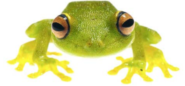
36 Boana cinerascens HYLIDAE Demerara Falls tree frog