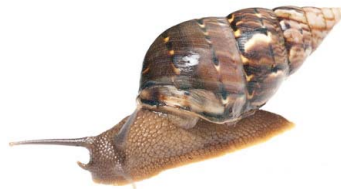
26 Achatina fulica GASTROPODA Terrestrial snail