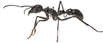
7 Paraponera clavata FORMICIDAE Bullet ant