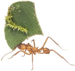
5 Acromyrmex sp. FORMICIDAE Leafcutter ant