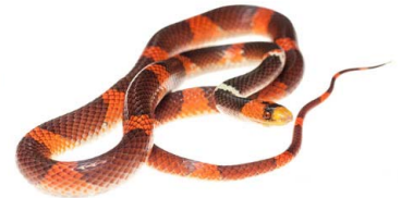
72 Oxyrhopus occipitalis DIPSADIDAE Calico snake