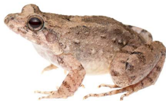
45 Leptodactylus validus LEPTODACTYLIDAE Windward ditch frog