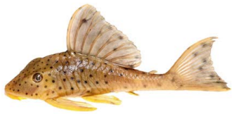
85 Hypostomus macushi LORICARIIDAE Plecostomus