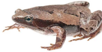
51 Hamptophryne boliviana MICROHYLIDAE Sheep frog