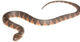
71 Helicops angulatus DIPSADIDAE Calico snake