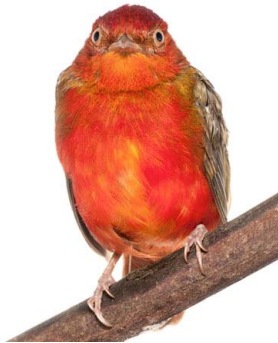
86 Phoenicircus carnifex COTINGIDAE Guianan red cotinga