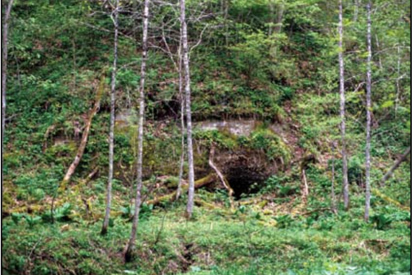
Beaver Creek Valley State Park, Houston County, MN

CTs33b is rare, with nearly all examples present in the PPL. The most common bedrock layers include the Galena Group (Stewartville, Prosser, and Cummingsville Formations), Prairie du Chien Group (Oneota and Shakopee formations), and St. Lawrence, Maquoketa, Dubuque, and Platteville formations. Bedrock layers may also include shales of the Decorah and Glenwood formations. Cliff faces vary from highly fractured with abundant rooting places for vascular plants in some of the limestone formations, to moderately fractured in some of the dolomite formations. Much of the fracture patterning, however, is hidden by lush carpets of bryophytes.