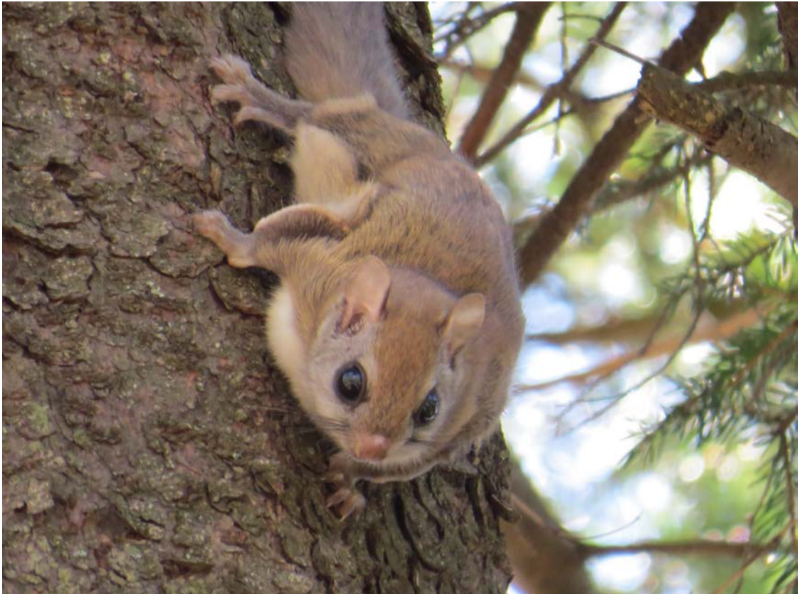
Carolina Northern Flying Squirrel ( Glaucomys sabrinus coloratus )