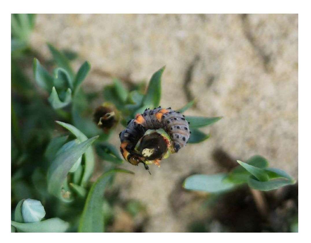
Figure 2. Larvae of a lady beetle (suspected Transverse Lady Beetle). Photo: Logan McLeod, July 21, 2018, Carcross, YT<sup>1</sup>