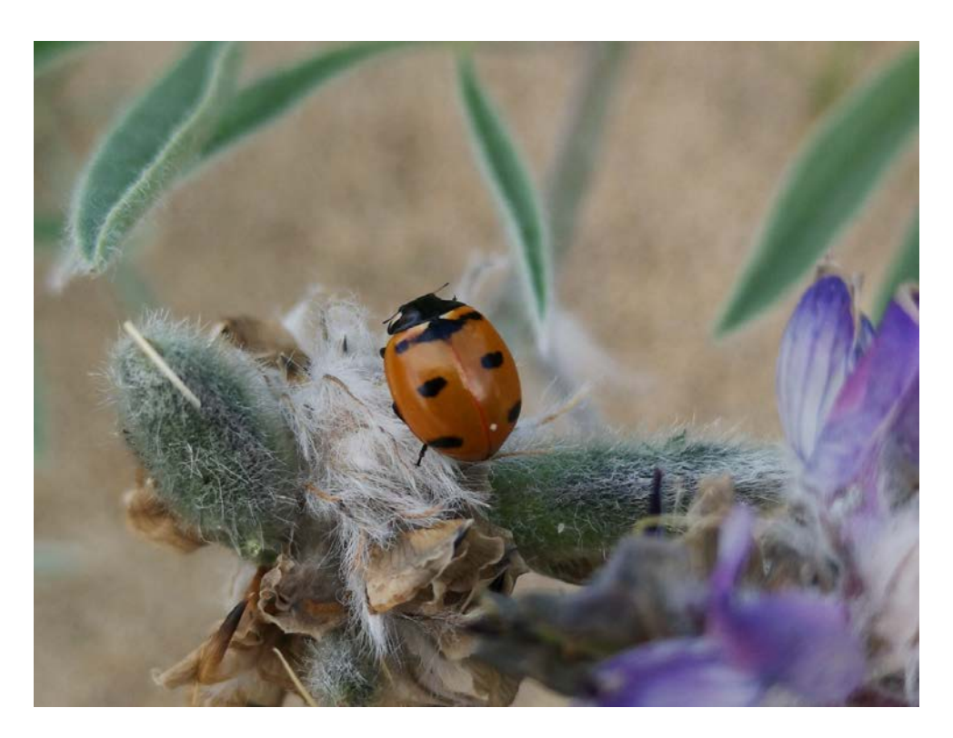
Figure 1. Adult Transverse Lady Beetle.

The eggs, larvae and pupae of Transverse Lady Beetle have not been described. Eggs of the closely related Nine-spotted Lady Beetle ( Coccinella novemnotata ) are elongate, approximately one millimetre in length, yellow to orange in colour, and laid in tightly packed clusters (Hodek et al. 2012). Larvae of Transverse Lady Beetle are thought to be similar to other larvae in the same genera (Rees et al. 1994) that develop through four instars (phases between periods of skin molting in the development of a caterpillar), with the final instar elongate and black with orange spots along the back and sides (Rees et al. 1994, COSEWIC 2016b) (Figure 2). In other closely related Coccinella , the abdomens of larvae have nine segments and have mound-like projections bearing seta (hair-like structures) (Gordon and Vanderberg 1991). As in similar species, the pupae are likely yellow to orange with black markings (Hodek et al. 2012).