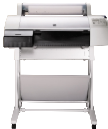
EPSON Stylus Pro 7000 model shown with optional printer stand.