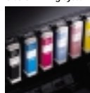
6-color inking system

A Based upon print engine speed only. Total throughput times depend upon front end RIP, file size, printer resolution, ink coverage, networking, etc.