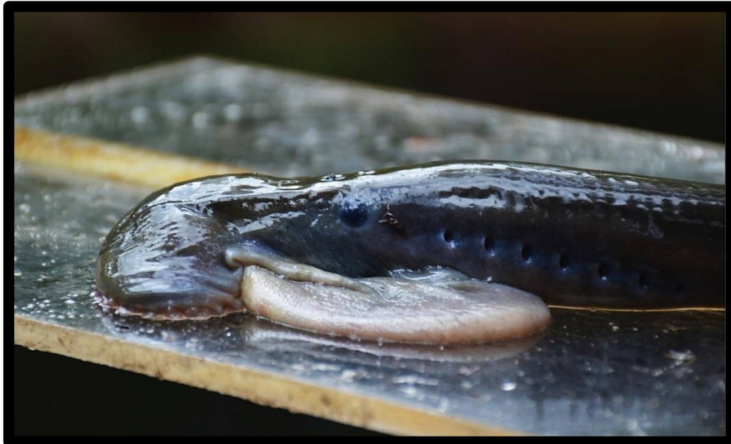
Picture 3. Prior to spawning, which occurs ~15 months after sub-adult lampreys re-enter the rivers as part of an upstream migrant phase, the adult male Pouched Lamprey ( Geotria australis ) develops an enlarged sac-like gular pouch and oral disc. It is remarkable that the purpose of the gular pouch has only recently been elucidated (Baker et al., 2017), and that this semelparous species, which ceases feeding following their re-entry to freshwater habitats from the marine environment, can survive for almost three years without feeding.