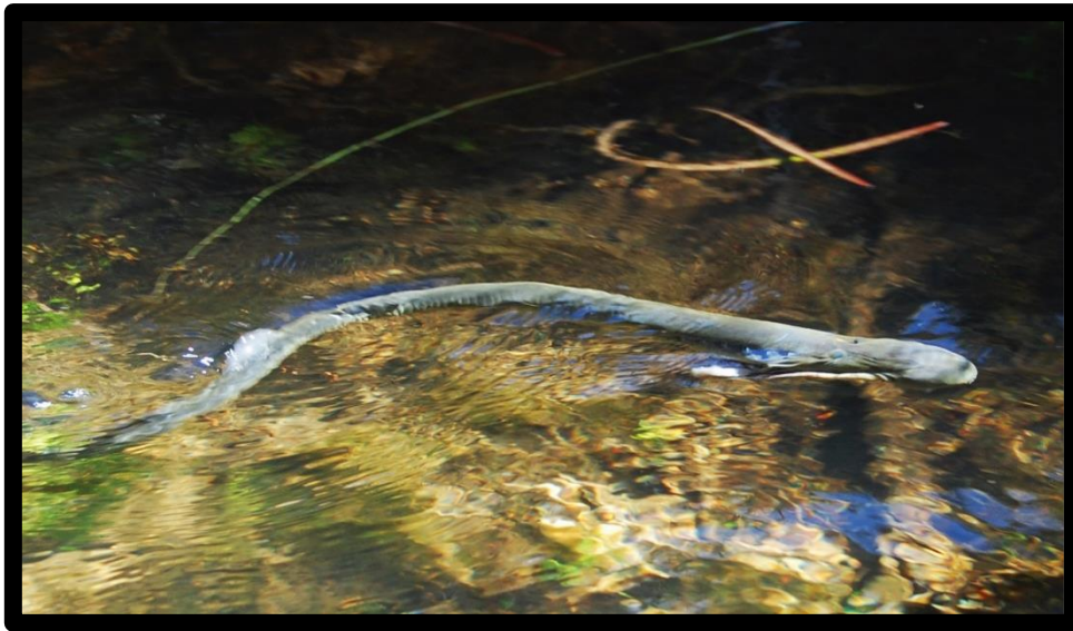
Picture 2. During maturation, the adult male Pouched Lamprey ( Geotria australis ) develops an enlarged gular pouch and oral disc. Following spawning, most lamprey species die fairly quickly (i.e., they are semelparous), however the Pouched Lamprey has been shown to survive for well over a year following spawning (Paton et al., 2020). This enhanced post-spawning survival compared to other lamprey species may be related to the need to use the gular pouch in the caring of the eggs (Baker et al., 2017).