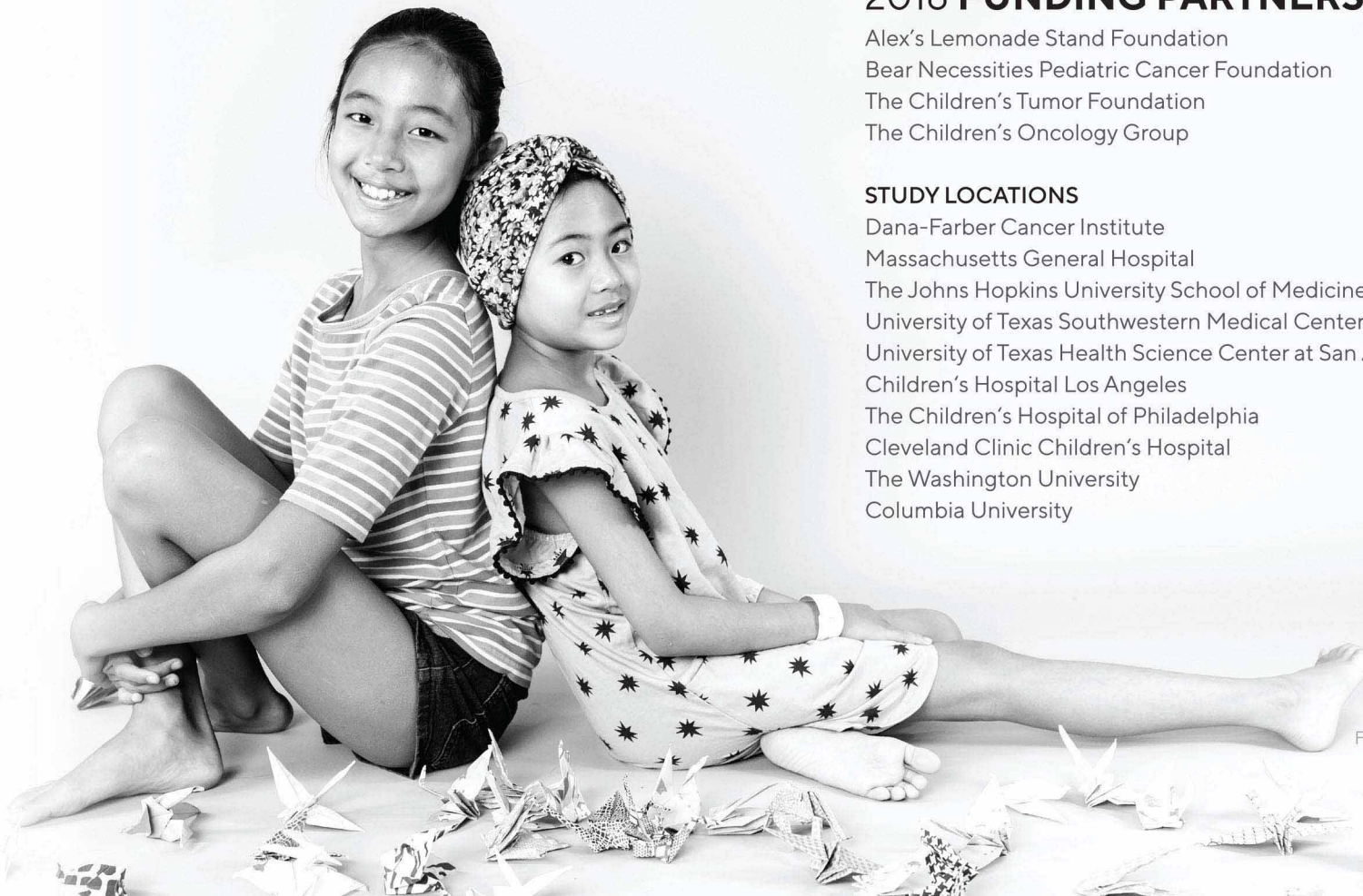
FLASHES of HOPE

Boston, MA Boston, MA Baltimore, MD Dallas, TX San Antonio, TX Los Angeles, CA Philadelphia, PA Cleveland, OH St. Louis, MO New York, NY