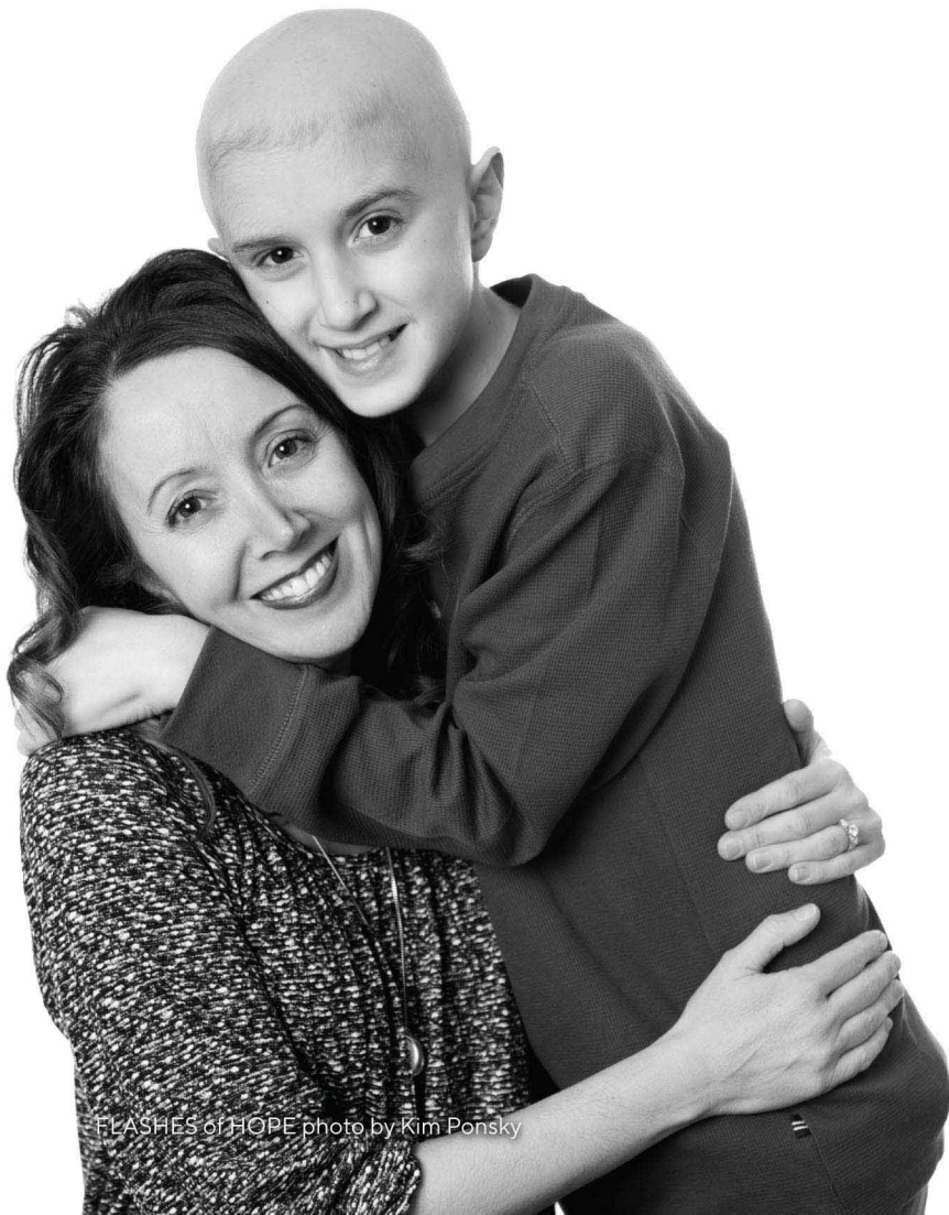
FLASHES of HOPE

We gratefully acknowledge all of our donors and truly appreciate every dollar donated to our organization. Due to space constraints, we are unable to recognize all of our donors in print.