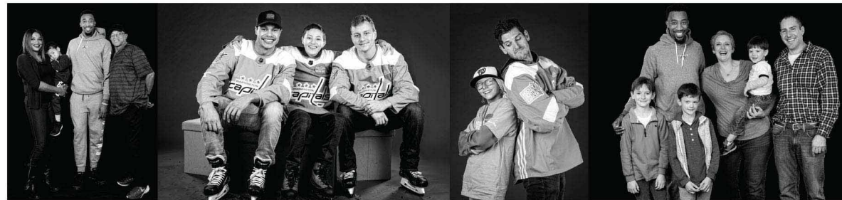
FLASHES of HOPE

Monumental Sports & Entertainment Foundation, the official charity of the Washington Capitals, Mystics and Wizards, donated $25,100. We are also grateful for the long-time support of the Buffalo Sabres Foundation, Columbus Blue Jackets Foundation, Dallas Stars Foundation, Nashville Predators Foundation and the St Louis Blues Foundation. In addition to sponsoring local chapters, the athletes spend time with the kids at photo shoots in the hospitals and in the arenas.