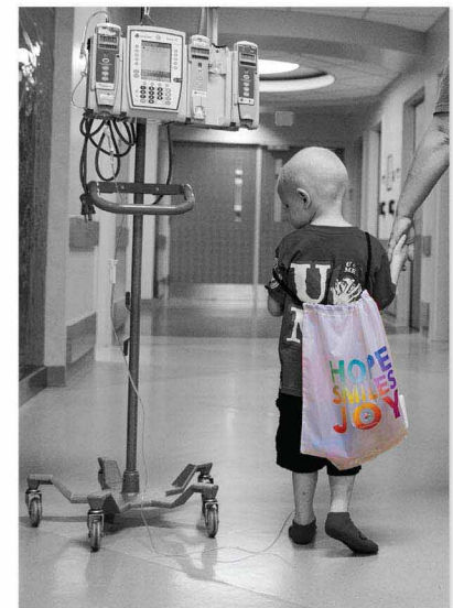
FLASHES of HOPE