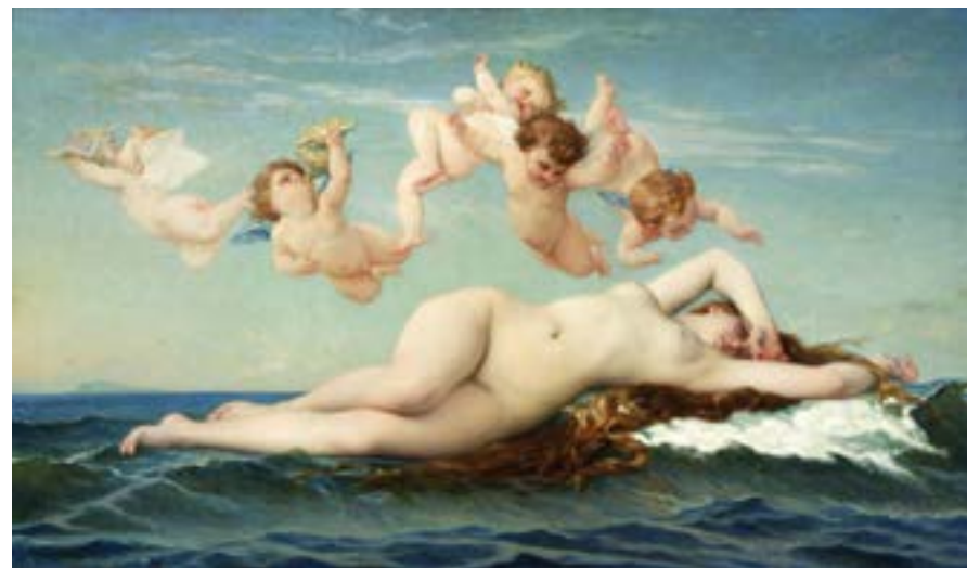
From the exhibition Beauty, Passion & Bliss Alexandre Cabanel French, 1823–1889 and Adolphe Jourdan French, 1825–1889 The Birth of Venus , ca. 1864 Oil on canvas 33 1/2 x 53 1/2 inches The Dahesh Museum Collection

Beauty, Passion & Bliss: 19th-Century Masterworks from the Dahesh Museum of Art 5.17.15 – 8.16.15 Sponsored by The Whiting Foundation Organized by the Dahesh Museum of Art and the Flint Institute of Arts