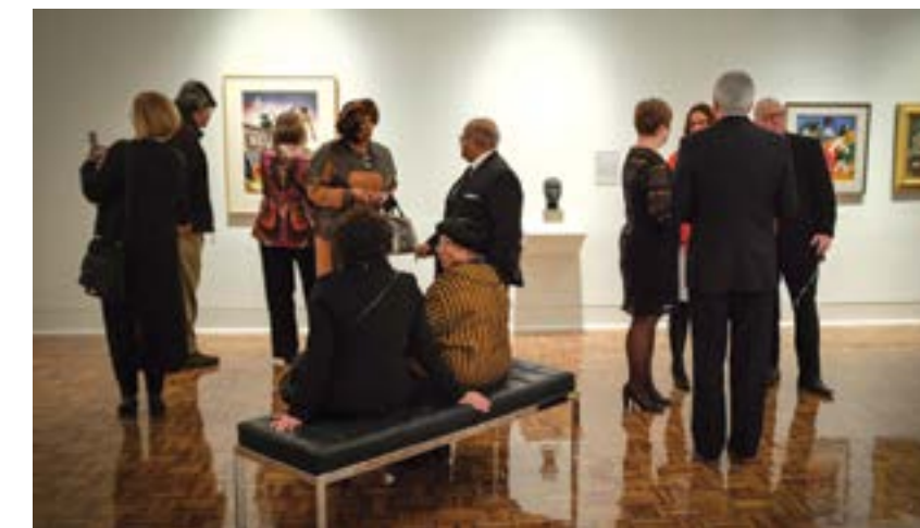
Members preview for the exhibition Common Ground: African American Art from the Flint Institute of Arts, the Kalamazoo Institute of Arts, and the Muskegon Museum of Art

Donors to and members of the FIA provide the foundation for all of the Institute's activities.