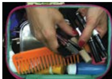
Image copyright of the artist, courtesy of Video Data Bank, www.vdb.org