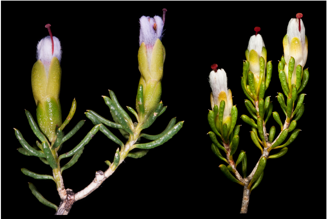
Figure 2. Drummondita billycatting (left; K.R. Thiele 5807) and D. hassellii (right; K.R. Thiele 4487).