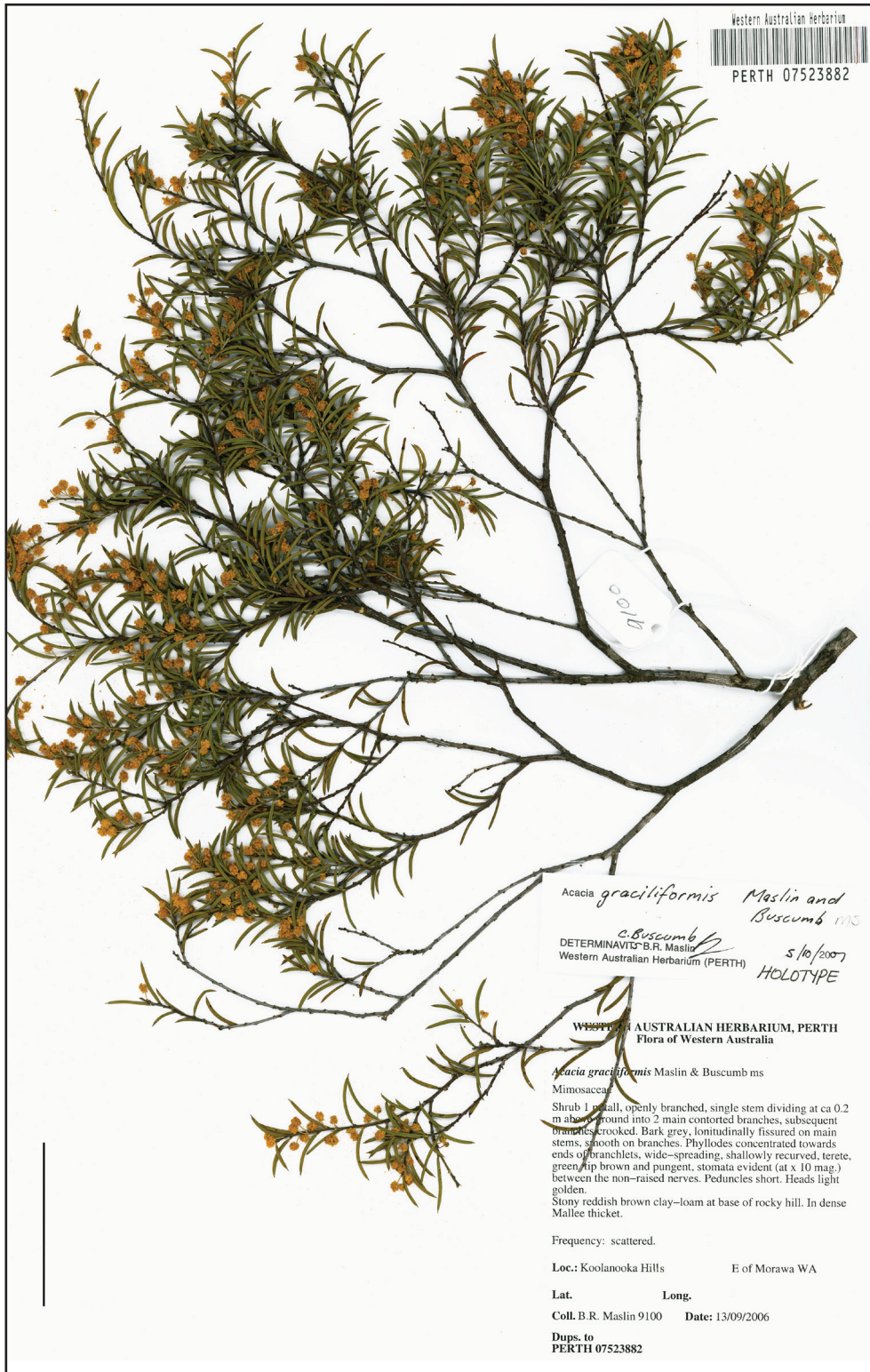
Figure 1. Holotype of Acacia graciliformis (B.R. Maslin 9100), scale = 5 cm.