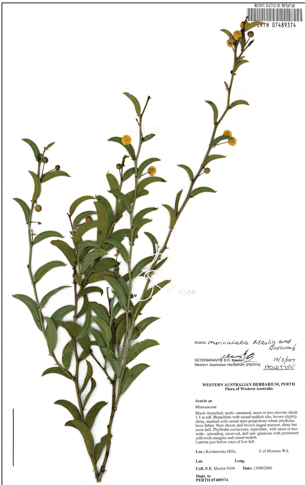
Figure 2. Holotype of Acacia muriculata (B.R. Maslin 9104), scale = 5 cm.