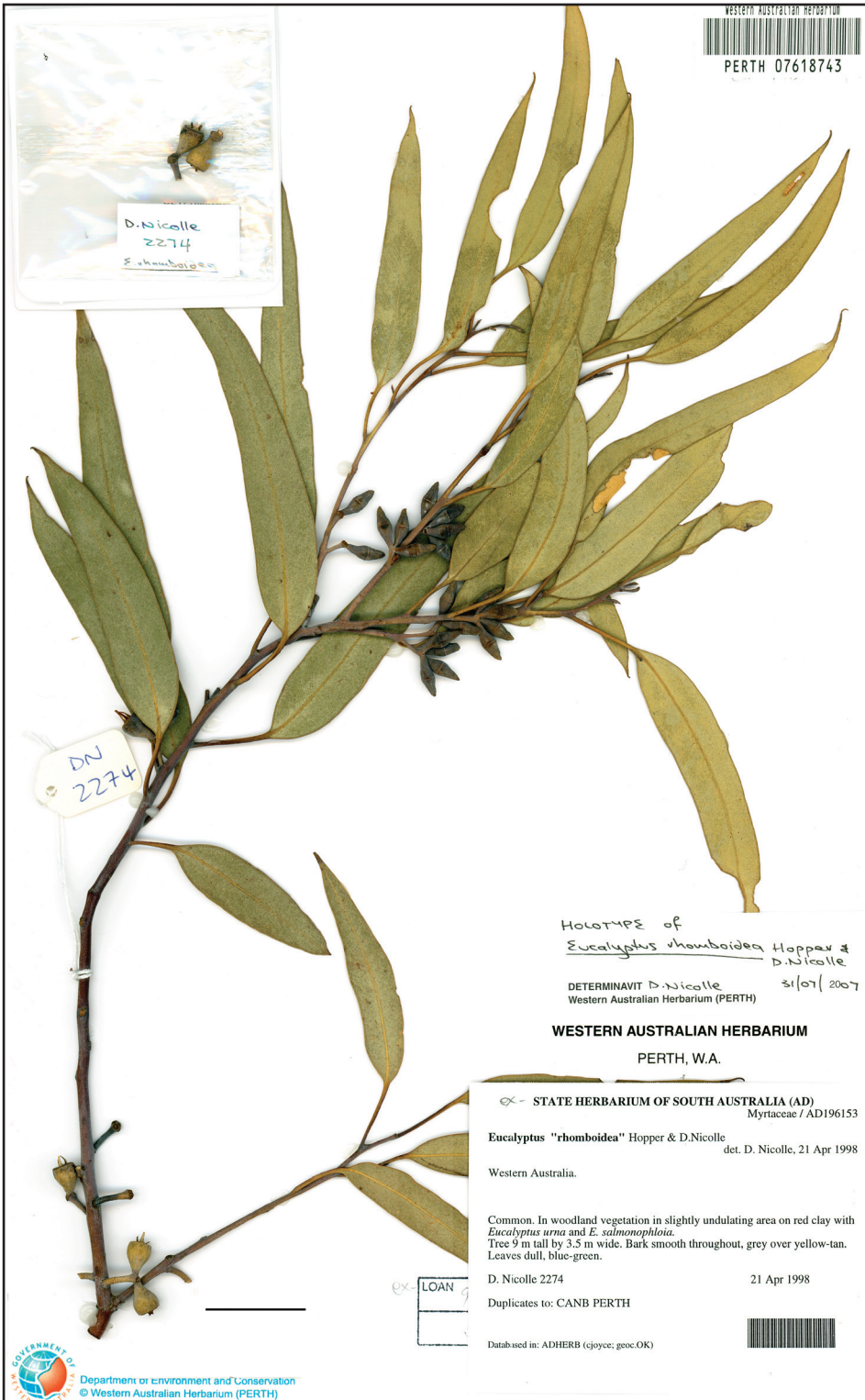
Figure 1. Holotype of Eucalyptus rhomboidea (D. Nicolle 2274), scale = 3cm.