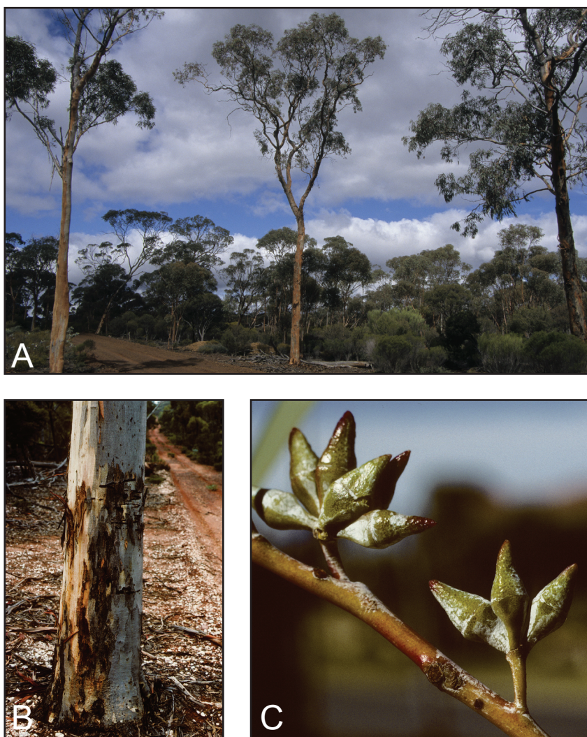
Figure 2. Eucalyptus rhomboidea (S.D. Hopper 7209, PERTH 05229502). A – habit and habitat; B – base of trunk; C – buds.

Distribution and habitat. Known only from level and slightly undulating areas in the Mt Gordon to Mt Glasse area of the Bremer Range between Lake King and Norseman, over a linear range of approximately 15 km (Figure 3). It occurs in low open woodland or tall shrubland vegetation on red clay-loams. Detailed ecological data and a list of associated taxa are included in Tables 1 and 2. Associated eucalypt species include E. cylindriflora Maiden & Blakely, E. eremophila (Diels) Maiden, E. densa Brooker & Hopper subsp. densa , E. olivina Brooker & Hopper, E. pileata Blakely, E. salmonophloia F. Muell., E. tortilis L.A.S.Johnson & K.D.Hill and E. urna D.Nicolle. Acacia deficiens Maslin and Grevillea acuaria Benth. are largely restricted to E. rhomboidea woodlands in the Bremer Range area.