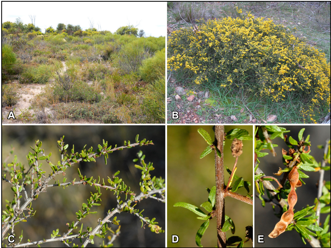
Figure 2. Acacia keigheryi . A – habitat; B – habit showing low-domed growth form; C – branches showing phyllodes fasciculate at mature nodes and single at young nodes near ends of branchlets; D – node showing fasciculate phyllodes in nodose cluster; E – pod.

Conservation status. Acacia keigheryi is to be listed as Priority Three under Department of Parks and Wildlife Conservation Codes for Western Australian Flora (A. Jones pers. comm.).