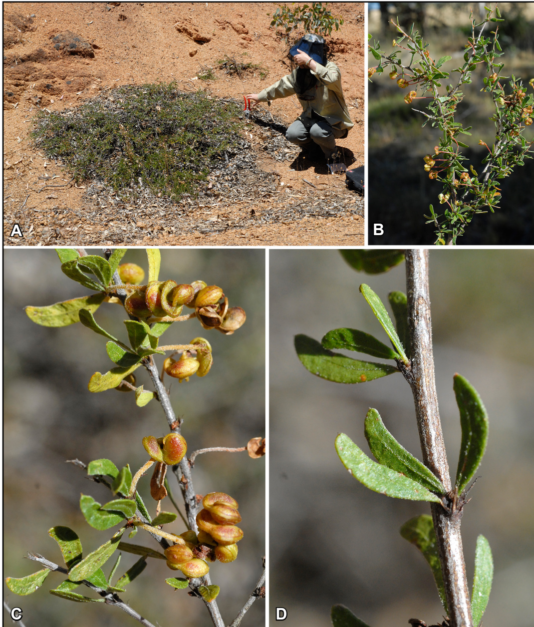
Figure 4. Acacia parkerae . A – prostrate growth form (with Thu Maslin); B – fruiting branch; C – distinctively tightly coiled pods; D – nodes showing fasciculate phyllodes.

oblong-oblongate or obovate, (8–)10–25 mm long, (2–)3–5(–6) mm wide, l:w = 3–5(–6), normally shallowly incurved, 1-nerved, innocuous. Inflorescences simple, peduncles (7–)10–30(–40) mm long, slender, rarely bracteate; heads globular, 22–25-flowered. Bracteoles 1.5–2 mm long, often slightly exerted in mature buds, the laminae triangular-lanceolate and acuminate. Flowers 5-merous; sepals ±free. Pods tightly and sometimes irregularly spirally coiled, 3–4(–5) mm wide, ±nerveless. Seeds not mottled or sometimes very obscurely mottled.