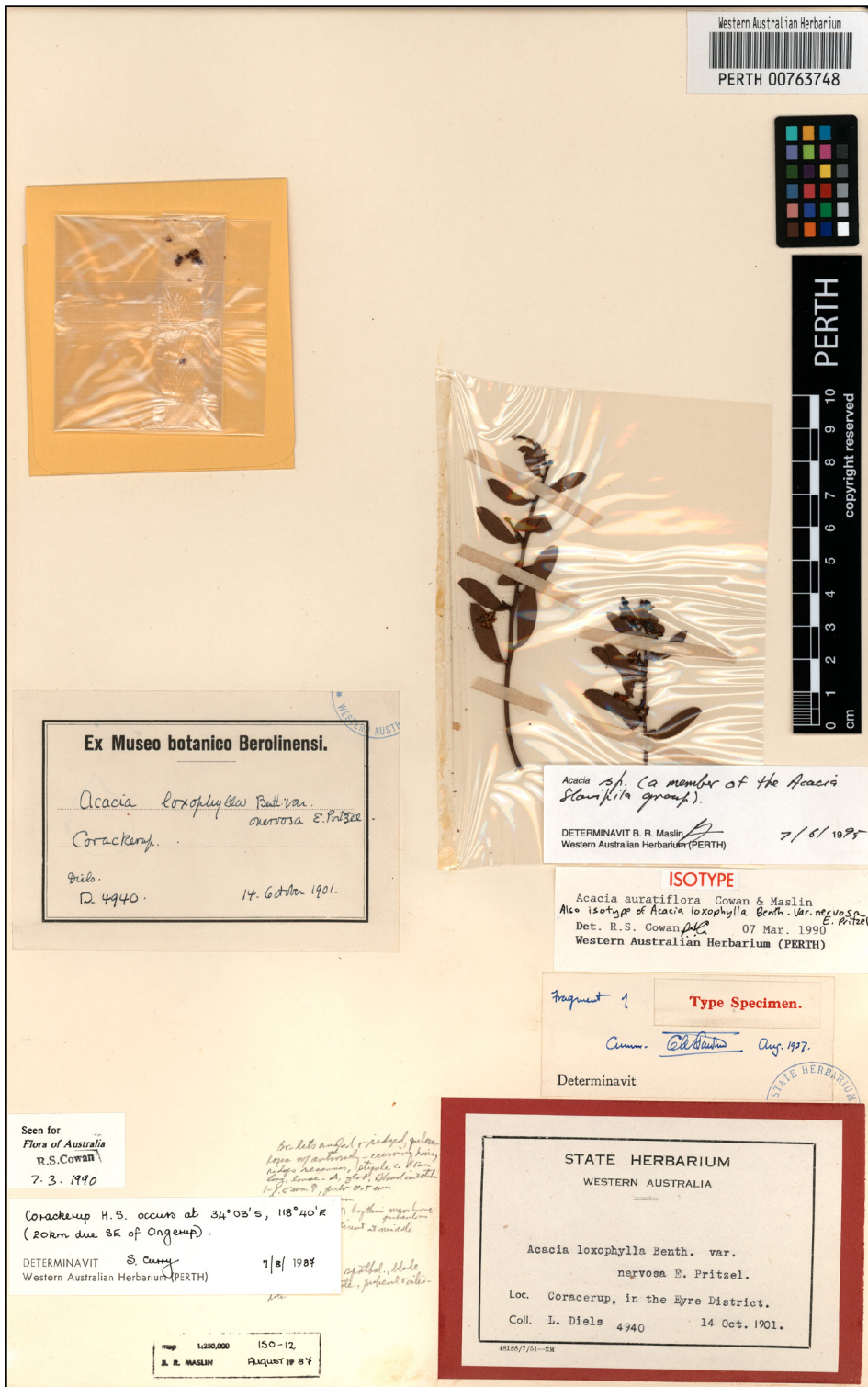
Figure 2. Fragment of Diels 4940 removed by Gardner from type in B in 1937 and later remounted; the B label (in Gardner's hand) appears to have been moved to accommodate the State Herbarium Western Australia label.