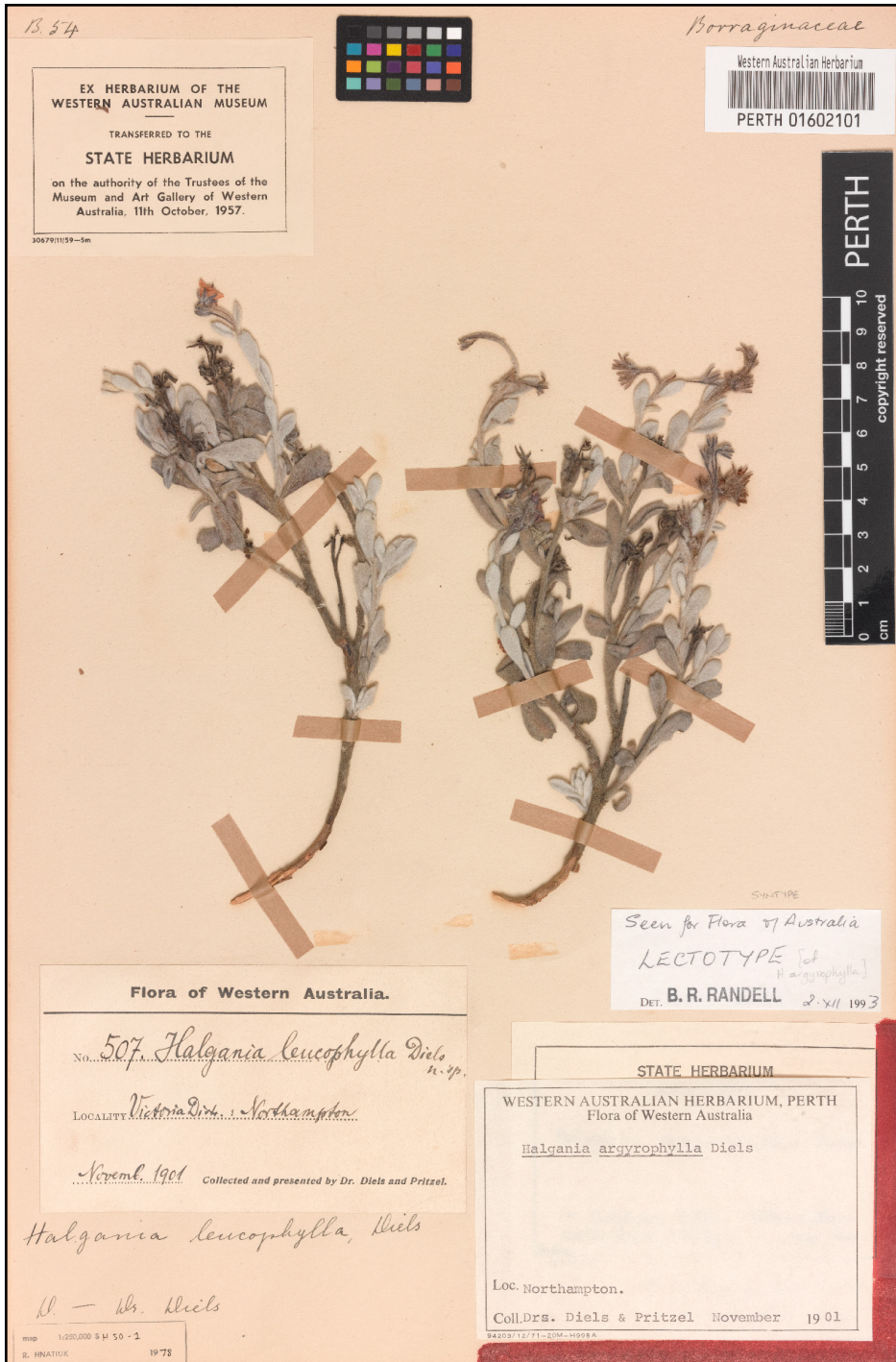
Figure 5. Diels & Pritzel 507 showing one style of hand written script on the original WAM sheets. Note the 'B' prefix on the accession number (B54, top left). These numbers are consistent with entries in the original WAM register of botanical specimens (B1–B134; B1708–1759), with the Diels & Pritzel material being the first entry in the register dated 15 th July 1901. Additional WAM transfer, State Herbarium Western Australia and PERTH labels have been added. The newer style of PERTH label in lower right dates from the 1970s (A.S. George pers. comm.). Note also the manuscript name in Diels' hand.