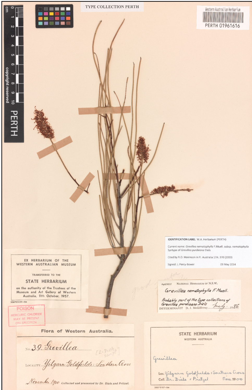
Figure 4. Diels & Pritzel 39, Grevillea purdieana Diels, showing their typical joint label. This sheet lacks WAM accession number and handwritten script. The original sheet was probably discarded in the 1960s when mercuric chloride treatment was applied (A.S. George pers. comm.).