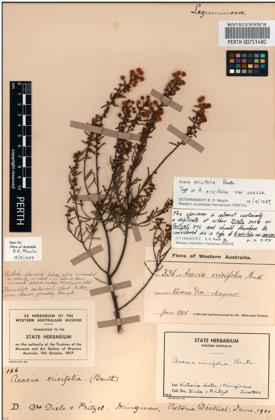
Figure 6. Diels & Pritzel 336 showing the second style of copper plate script on the original WAM sheets. This style lacks the 'B' prefix to the accession number (156, above taxon name) and this sequence does not appear in the WAM botanical register. Note the transfer of the WAM accession number to the lower left hand corner of the State Herbarium Western Australia label.