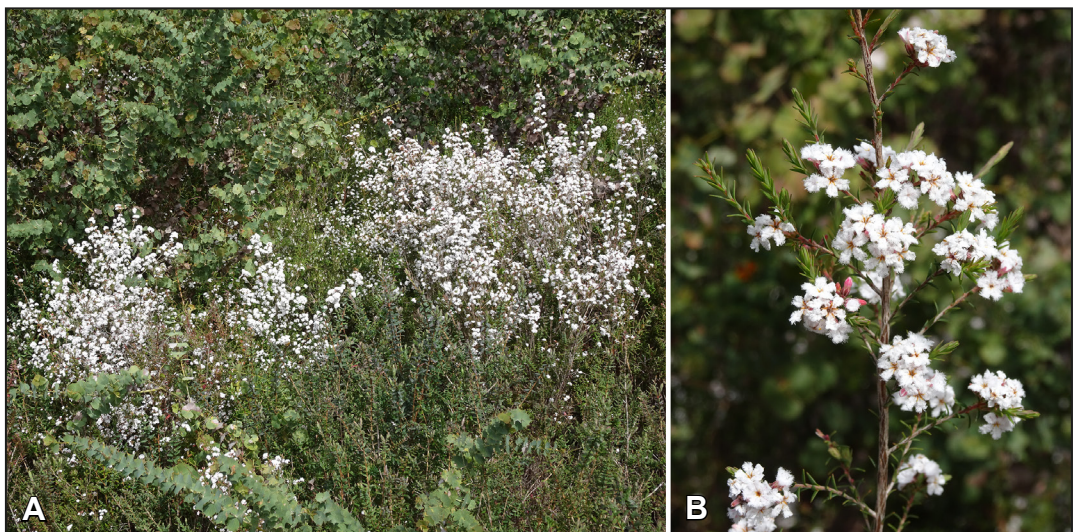
Figure 2. Leucopogon kirupensis in situ. A – plants; B – flowering branchlet. Photographs by Michael Hislop at M. Hislop 4779.