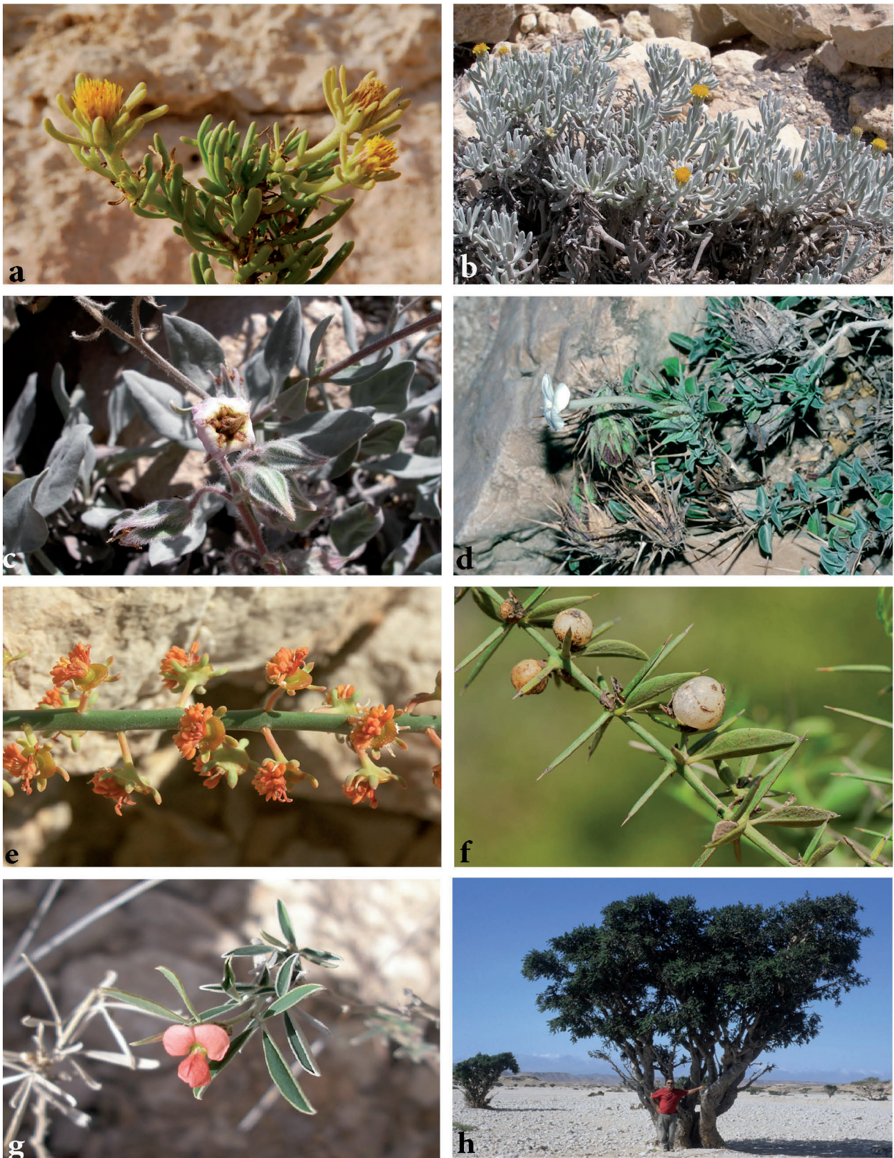
Fig. 3 – a) Iphiona teretifolia Anderb.; b) Pulicaria nobilis Gamal-Eldin; c) Trichodesma cinereum Mosti & Selvi; d) Barleria almughsaylensis Mosti, Raffaelli & Tardelli; e) Ochradenus giffii Thulin; f) Azima tetracantha Lam.; g) Tephrosia pentaphylla (Roxb.) G. Don; h) Boswellia sacra Flueck. (Wadi Dowkah, sito UNESCO).