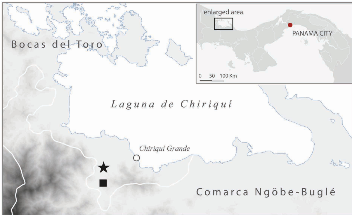
FIGURE 3. Distribution of Cryptochloa stapfii Baldini & Ortiz in Panama. Star: type locality (holotype). Square: Paratype, B. Hammel, G. McPherson & L. Sanders 14746 (MO, PMA).

4). Cryptochloa stapfii grows in an area of very wet tropical forest according to the classification of zones proposed by Holdridge et al. (1971), in association with Miconia ampla Triana (1871: 10, Melastomataceae), Neonicholsonia watsonii Dammer (1901: 179, Arecaceae), Calypstrogyne pubescens de Nevers (1995: 336, Arecaceae), Ichnanthus pallens (Swartz 1788: 23) Munro ex Benth (1861: 414, Poaceae) and Arberella lancifolia Soderstrom & Zuloaga (1985: 25, Poaceae) and others species of the Arecaceae family.