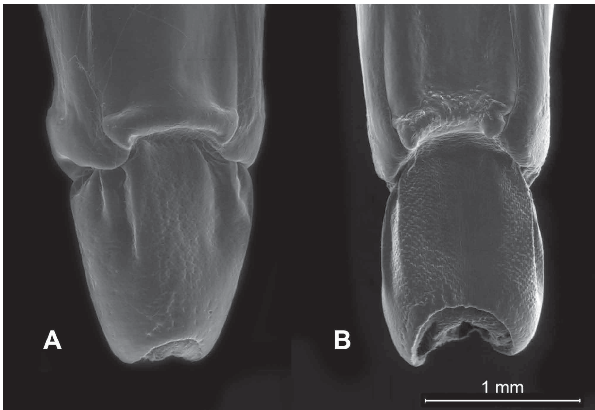
FIGURE 4. Rachillas of the internode of the anthecium (elaiosomes). A. Cryptochloa dressleri B. C. stapfii .