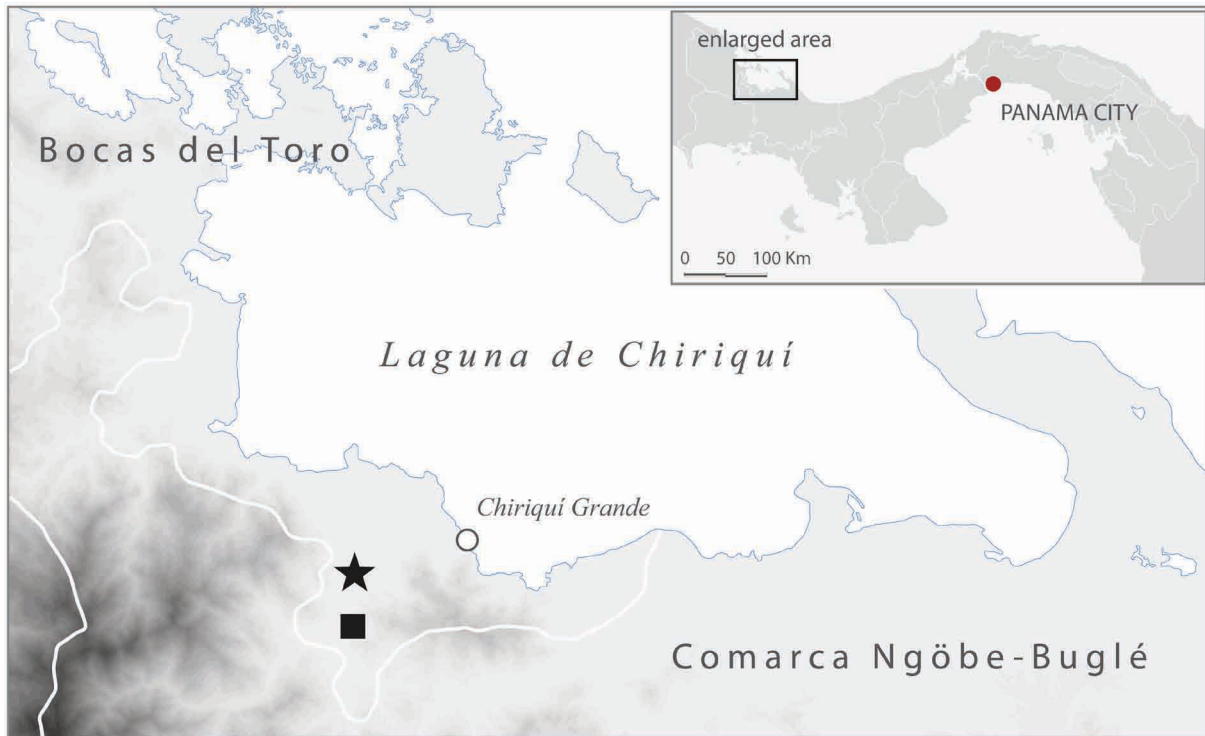
FIGURE 3. Distribution of Cryptochloa stapfii Baldini & Ortiz in Panama. Star: type locality (holotype). Square: Paratype, B. Hammel, G. McPherson & L. Sanders 14746 (MO, PMA).

4). Cryptochloa stapfii grows in an area of very wet tropical forest according to the classification of zones proposed by Holdridge et al. (1971), in association with Miconia ampla Triana (1871: 10, Melastomataceae), Neonicholsonia watsonii Dammer (1901: 179, Arecaceae), Calypstrogyne pubescens de Nevers (1995: 336, Arecaceae), Ichnanthus pallens (Swartz 1788: 23) Munro ex Bentham (1861: 414, Poaceae) and Arberella lancifolia Soderstrom & Zuloaga (1985: 25, Poaceae) and others species of the Arecaceae family.