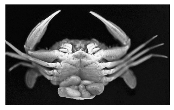
FIGURE 1. Charybdis longicollis parasitized by 6 Heterosaccus dollfusi , collected off Palmahim (Israel).

133.1542, df = 2, 245, P < 0.0001), but the maximal size of both sexes was greater in the Antalya material (Table II). A post-hoc SNK test revealed that the uninfected males were significantly larger than either uninfected females (F and F OV), externaebearing (ME, FE) or morphologically-modified crabs (MI, FI) of either sex in both locations, while the uninfected crabs from Antalya were significantly larger than those collected off Palmahim (t = 2.021, df = 1, 245, P < 0.05). The average and maximal sizes of externae-bearing crabs of both sexes were nearly identical in the Israeli and Antalya material. The average and maximal sizes of externae-bearing females were significantly greater than uninfected females in both localities (externaebearing females vs. uninfected females from Palmahim: t = 7.014, df = 481, P < 0.01; from Antalya: t = 2.473, df = 348, P < 0.02).