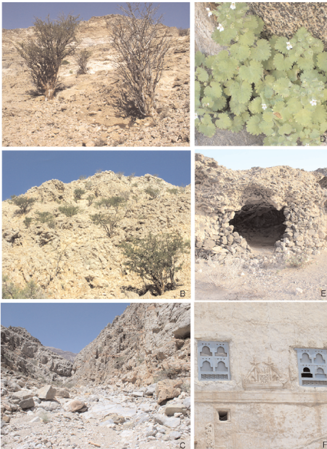
Fig. 2A – Frankincense area above Wadi Atawnt (b1); Fig. 2B – Frankincense areas west of Wadi Rakyut (b2, b3); Fig. 2C– Wadi 14 km west of Hasik (w2); Fig. 2D – Camptoloma villosa inside a shady niche in the rocky wall of the w2 wadi; Fig. 2E – A cave along the sea cliff near Hasik used in the past as frankincense deposit; Fig. 2F – Ancient frankincense storehouse in Sadh.