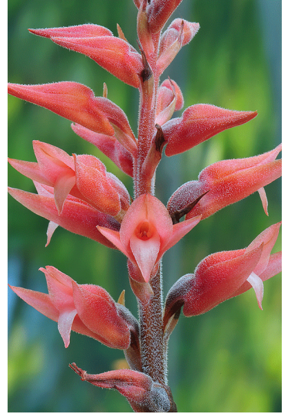
Sacoila lanceolate—Roger Hammer