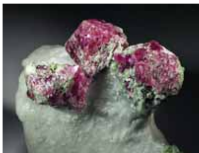
Fig. 18. Chevkinite-(Ce). 6 cm long chevkinite crystal. Arondu, Basha valley, Skardu district, Pakistan. Donation by Dmitry I. Belakovskiy. № 93165.