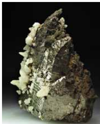
Fig. 11. Tetrahedrite. Crystal (approximately 6 cm across) with epitaxial ingrowths of blocked sphaerite crystals. Chalcopyrite forms epitaxial overgrowths on tetrahedrite and sphaerite. 2 nd Soviet mine, Dalnegorsk. Primorye, Russia. Purchase. № OP-2544.