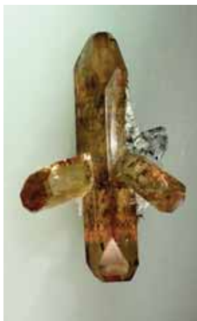
Fig. 7. Calcite pisolites (cave pearl) in calcite "basin". Formed within approximately 7 years in an abandoned mine. Belorechenskoye mine, Adygei republic, Russia. Donation by Mikhail M. Moiseev & Viktor V. Levitskiy. № OP-2501.