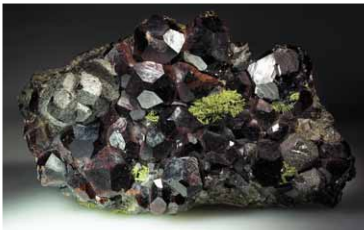
Fig. 10. Andradite. Druse of tetragon-trioctahedral crystals up to 3 cm across. In association with epidote and magnetite. Dashkesan, Azerbaijan. Purchase. № 93056.