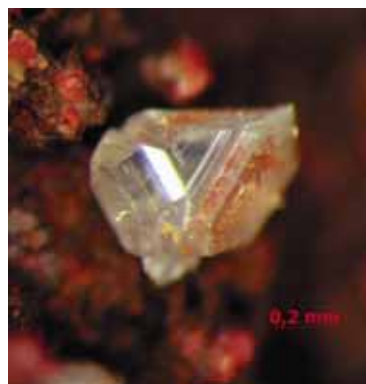
Fig. 4. Twinned crystal of iodargyrite 2H on limonite. Rubtsovsk mine, Altai, Russia. Donation by Igor V. Pekov. Fragment of specimen № 92960.