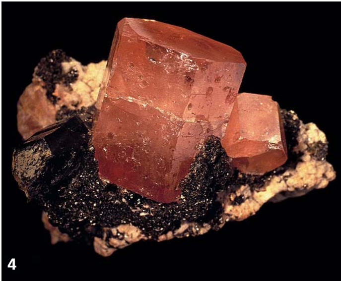
4. Fluorapatite. Pegmatite #66, Akzhailyau, Tarbagatai, East Kazakhstan. Purchase. Size 9 cm. FMM, #91406.