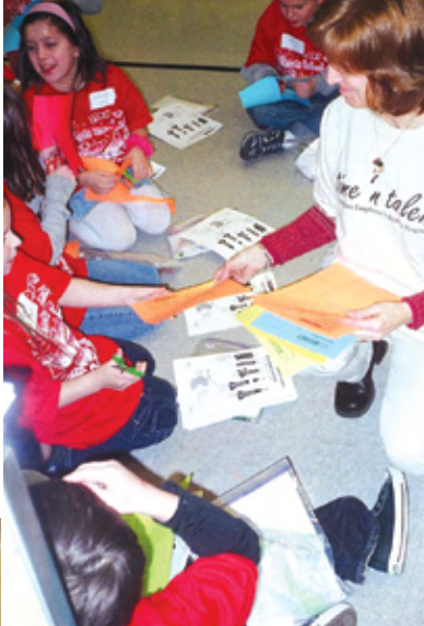
Math and Science Mania