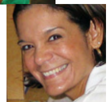
Atlanta Playground Build

These photographs represent just a few of the many programs supported by Nordson.