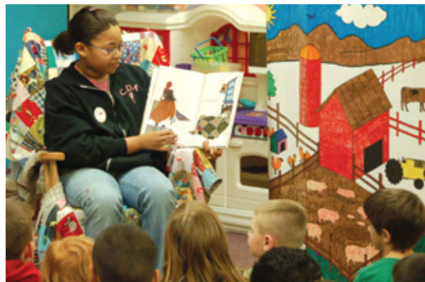
Right to Read

Nordson Corporation Foundation believes that increased exposure to innovative programming spurs the educational development of our youth. We support many organizations that bring inventive programs to students in the communities where we have domestic facilities. The programs featured in this report, FIRST Robotics and Camp Invention, provide outstanding interactive learning opportunities in science and technology.