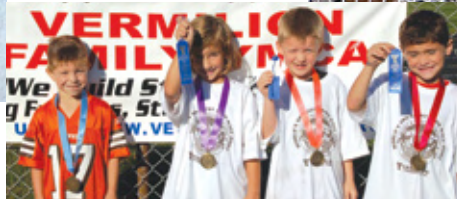
Greatest Kids Race