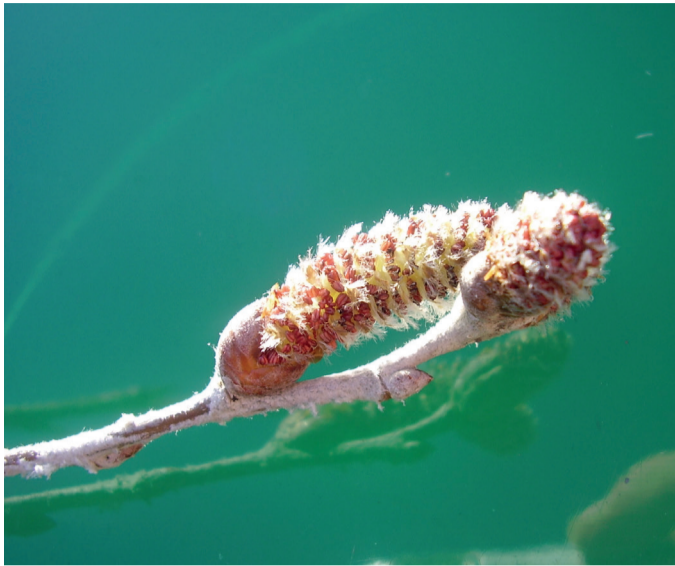
Small branchlet with male catkins floating in the water.