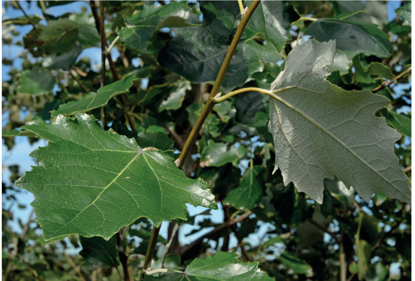
Lobed leaves are shiny dark-green on the upper side and white with dense hairs on the lower one.