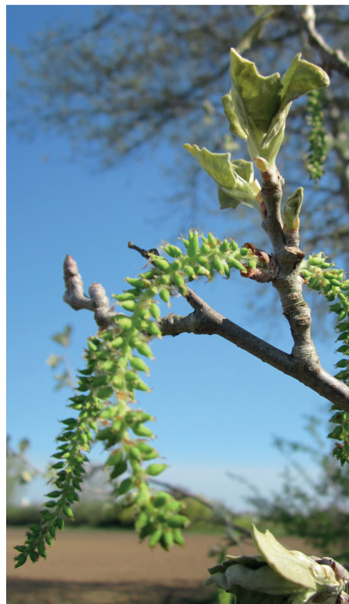
Female catkins maturing after pollination.