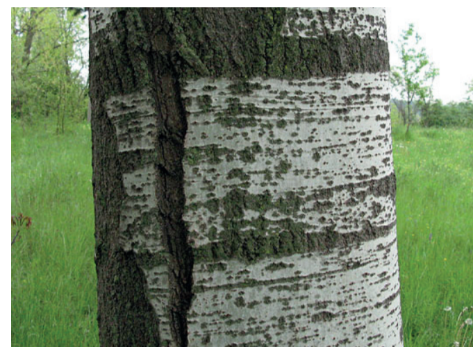
Creamy white bark with small black diamonds.

are established for wood industries, where other poplars do not perform well, for example where the water table is inaccessible or the soil is poor or saline. In such cases, the wood can be used for biomass energy, as pulpwood for paper, for packaging (crates and boxes), pellets and partially as saw-logs. Plant density on pure plantations can be higher than other poplars and the rotation reaches 18-25 years 2,6,15 . It is widely planted as an ornamental tree in parks and gardens, for its attractive double-coloured foliage 2,6 . Poplar leaves could be used as cattle feed and as bio-monitors for soil pollution 15,28 . White poplar is among the group of plants with an important emission of isoprene , which is one of the biogenic volatile organic compounds affecting a complex chain of feedbacks between the terrestrial biosphere and climate, with relevant although not yet completely understood implications under the ongoing climate warming 29-31 . This poplar covers an important ecological role as a component of floodplain forests. These forest ecosystems host a very high diversity of plants and animals, providing corridors through the landscape, sites for water storage and groundwater recharge during floods, opportunities for timber extraction, and diffuse pollution control by recycling nutrients in farmland runoff 32,33 .