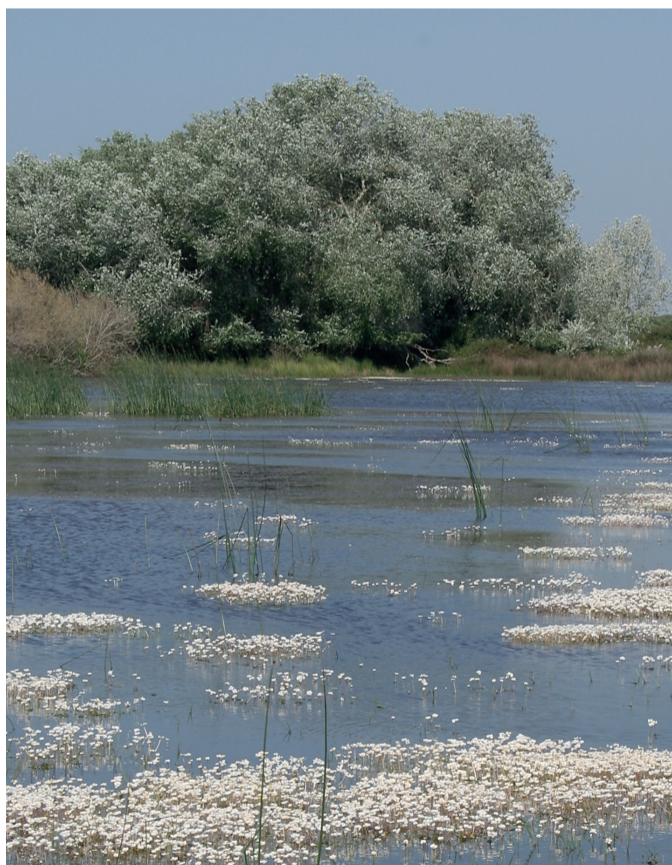
White poplars growing near a lagoon in the Doñana National Park (Andalusia, Spain).