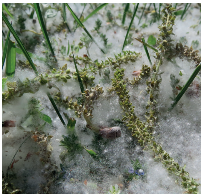
Carpet of fluffy seeds on the grass under white poplars.