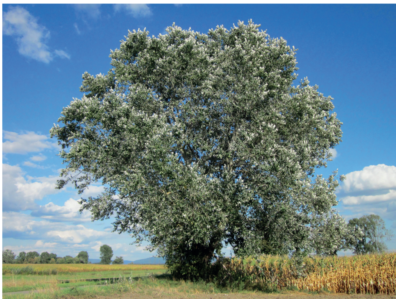
Free-standing trees develop a broad and rounded crown.

Like other poplars, it hosts a large number of insects, but only a few of those need to be controlled especially in plantations. Among the leaf defoliators, the main ones are the moth Hyphantria cunea and the large poplar-leaf beetle Chrysomela populi . Wood diseases can occasionally be caused by the goat moth Cossus cossus and the longhorn beetles of genus Saperda , even if their xylophagous caterpillars are found mainly in other poplar species. The soil