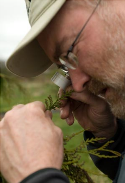
Searching for freshly laid Mayetiola thujae eggs on western redcedar cone scales.

Redcedar cone midge populations should be monitored on an annual basis in seed orchards and controlled when necessary. Redcedar conelet surveys should be performed on a weekly basis from immediately after redcedar pollination is finished (March) until midge egg-laying is completed (late March to early April).