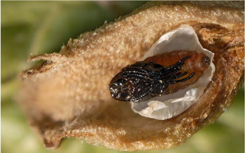
Mature Mayetiola thujae pupa extracted from cocoon. Legs and other features of the adult midge are visible. (D. Manastyrski)

ADULT: Adults emerge from old cones in early spring (March) during redcedar pollination period. After mating, female midges lay eggs on pollen-receptive seed cones. Mosquito-like adults are about 3 mm long, dark grey, and have clear wings with a small number of distinct veins. Many midge species look like this and field identification of redcedar cone midges is difficult unless the adults are reared from redcedar seed cones, captured in traps baited with cone midge sex pheromone, or observed laying eggs on cone scales.