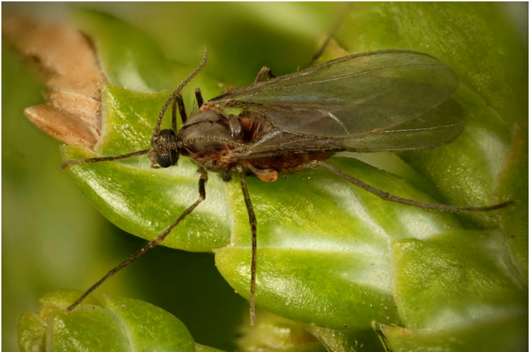
Mayetiola thujae adult on redcedar foliage