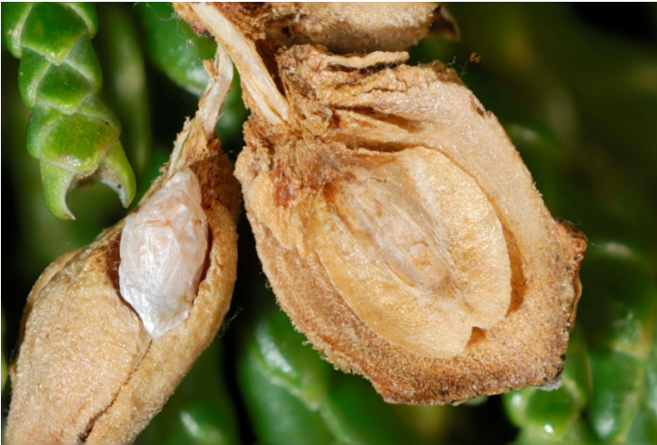
Mayetiola thujae cocoon containing developing pupa (D. Manastyrski)

DAMAGE: Redcedar cone midge larvae feed on scales and seeds throughout individual cones. Each larva is capable of destroying more than one seed.