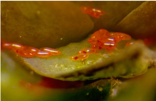
Mayetiola thujae eggs on redcedar cone scale

EGG: Orange-red (vermilion) and cylindrical, about 0.8 mm long by 0.2 mm wide. Contrast with green colour of cones makes redcedar cone midge eggs relatively visible without magnification. Eggs are found on or between cone scales either singly or in groups numbering up to 45.