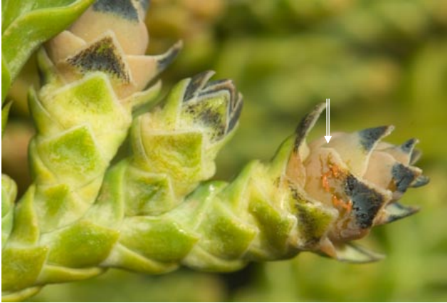
Mayetiola thujae eggs on a redcedar conelet

EGG: Orange-red (vermilion) and cylindrical, about 0.8 mm long by 0.2 mm wide. Contrast with green colour of cones makes redcedar cone midge eggs relatively visible without magnification. Eggs are found on or between cone scales either singly or in groups numbering up to 45.