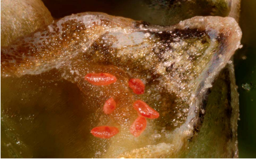
Mayetiola thujae larvae on exposed redcedar cone scale (D. Manastyrski)

LARVA: Eggs hatch in April and developing larvae feed inside cones, each destroying more than one seed. Larvae are shiny orange, segmented maggots, about 3-4 mm long when fully grown. Larvae may be found anywhere within the cone tissue.