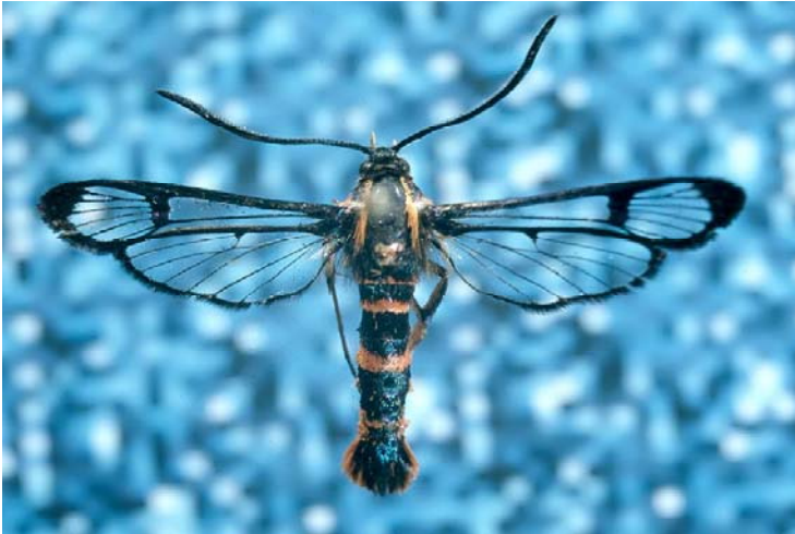
Preserved adult of Synanthedon novaroensis (W. Strong)

HOSTS: Various hard pines, especially lodgepole pine ( Pinus contorta ) and ponderosa pine ( P. ponderosae ) as well as spruces ( Picea spp.), and Douglas-fir ( Pseudotsuga menziesii ).