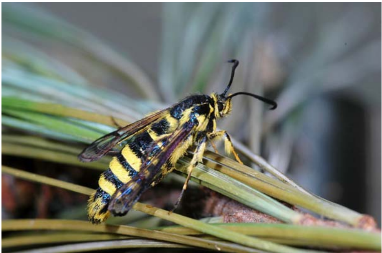
Synanthedon sequoiae adult recently emerged from pitch mass on lodgepole pine (W. Strong)