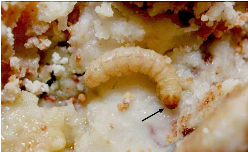
Synanthedon sequoiae larva in an opened pitch mass (arrow indicates head capsule)

LARVA: Young larvae bore into the inner bark and outer sapwood and feed until fall. Larvae overwinter within their feeding tunnels and pitch; feeding resumes in the spring of the following year. Mature larvae are up to 28 mm long and off-white with a reddish-brown head capsule. Larvae spend their entire lives within the cambial tunnels and pitch.