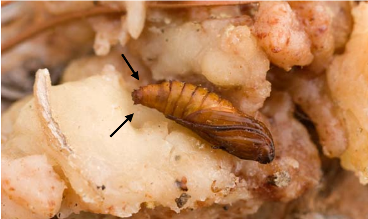
Synanthedon sequoiae pupa dissected from a pitch mass (arrows indicate spines on terminal abdominal segments) (D. Manastyrski)

PUPA: In late spring or early summer, mature larvae pupate in silk-lined chambers just under the surface of the pitch mass. The anterior end of each pupa usually protrudes slightly from the pitch mass to allow easy exit by the adult moth. Pupae are brown with prominent spines across the top of each abdominal segment, about 15-20 mm long. The pupal stage lasts approximately thirty days.