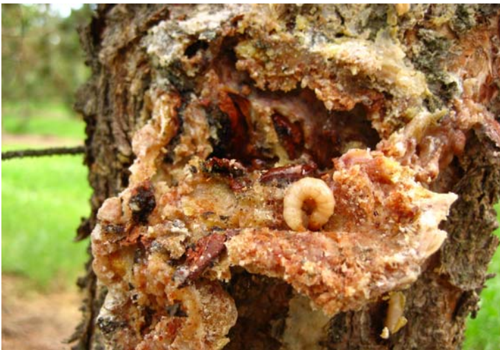
Mature Synanthedon sequoiae larva exposed in a pitch mass on bole of lodgepole pine

IMPORTANCE: Pitch moth attacks on larger trees generally do not affect tree health. However, repeated attacks on smaller trees can impact seed production through breakage or girdling of branches and stems or tree mortality.