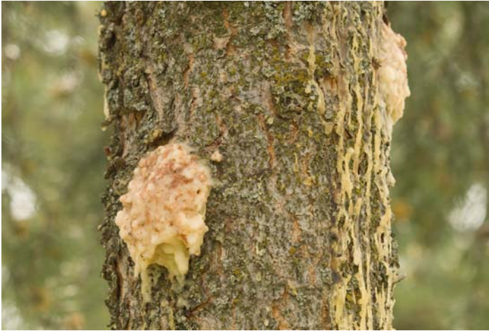
Synanthedon sequoiae pitch masses on a lodgepole pine stem (D. Manastyrski)

IMPORTANCE: Pitch moth attacks on larger trees generally do not affect tree health. However, repeated attacks on smaller trees can impact seed production through breakage or girdling of branches and stems or tree mortality.