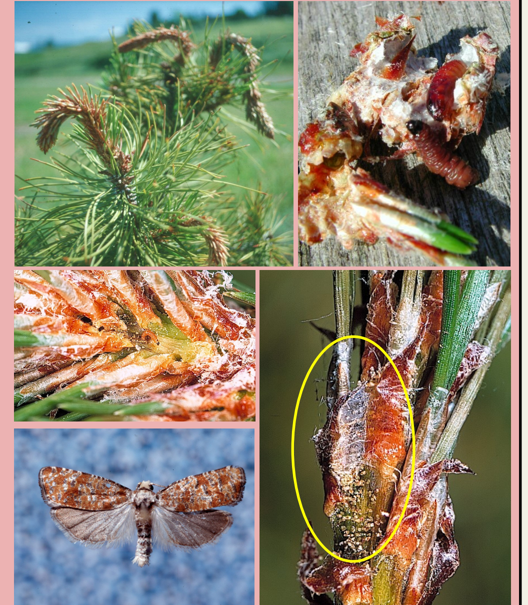
Clockwise from top left: Typical EPSM damage on Pli shoot tips; late instar EPSM larva and pupa; A hibernaculum on a shoot tip visible as window-like pitch and webbing; an adult EPSM; First instar EPSM on a Pli shoot.