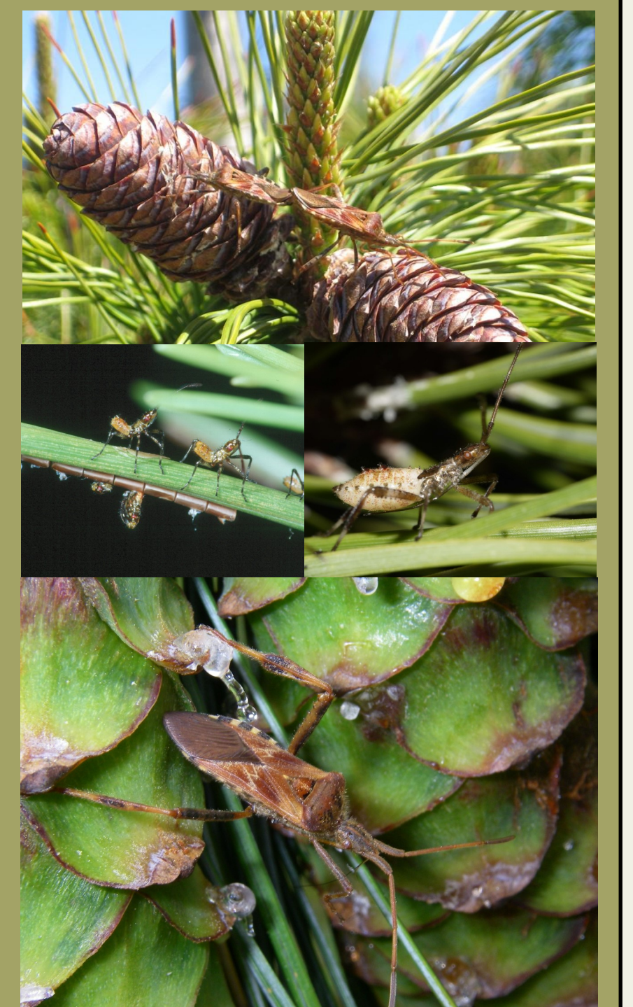
Top image: Mating Leptoglossus adults on Pw; Middle Left: First instar nymphs with eggs; Middle Right: Third instar nymph; Bottom: Adult Leptoglossus , note 'W' shape on wings and enlarged hind limb