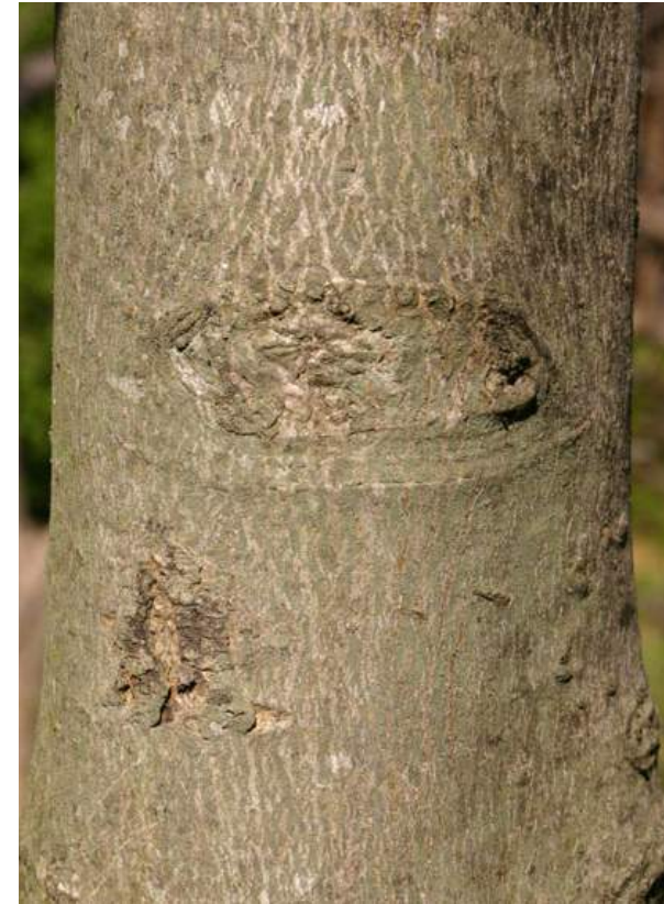
Brotherhood Way, San Francisco: September 3, 2015