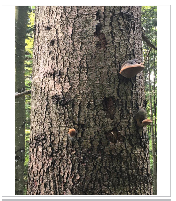
Figure 3. Biodegradation of Silver Fir Lesioned by Fomes fomentarius.