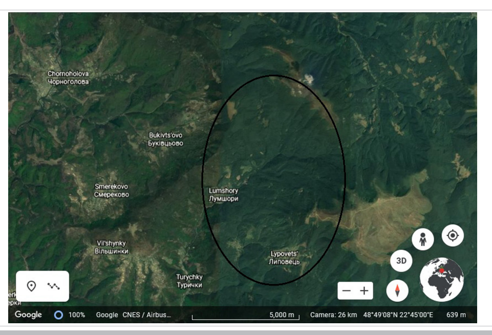
Figure 1. The Location of the Investigated Area.

Sampling plots of fir-beech stands were situated at the longitude 22°45′ E, latitude 48°49′ N, and altitudes from 400 to 950 m a.s.l. Dominant Silver fir trees were located in the wet mixed forest stands by establishing six quadratic sampling plots on a 50 m \times 50 m, where all silvicultural and dendrometrical characteristics were recorded. Forest types did not differ from each other in soil properties and the structure of the woody vegetation (Table 1).