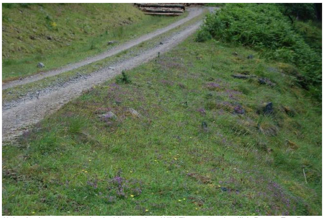
Upland calcareous grassland with abundant Wild Thyme, Lassintullich Forest, Tay Forest District. Jeff Waddell 23<sup>rd</sup> July 2010.