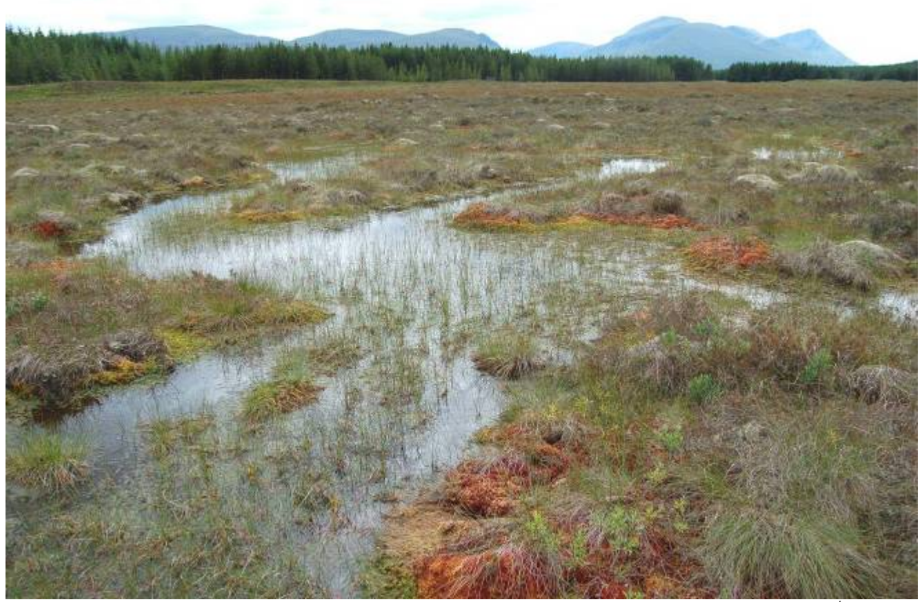
Blanket bog and pool system. Rannoch Moor, Tay Forest District.