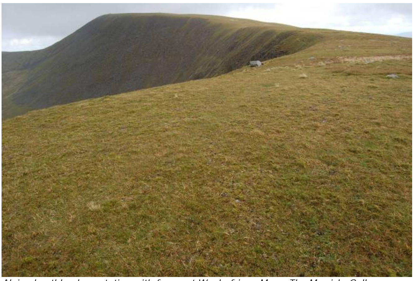
Alpine heathland vegetation with frequent Wooly-fringe Moss. The Merrick, Galloway Forest District. Jeff Waddell, 20<sup>th</sup> September 2011.