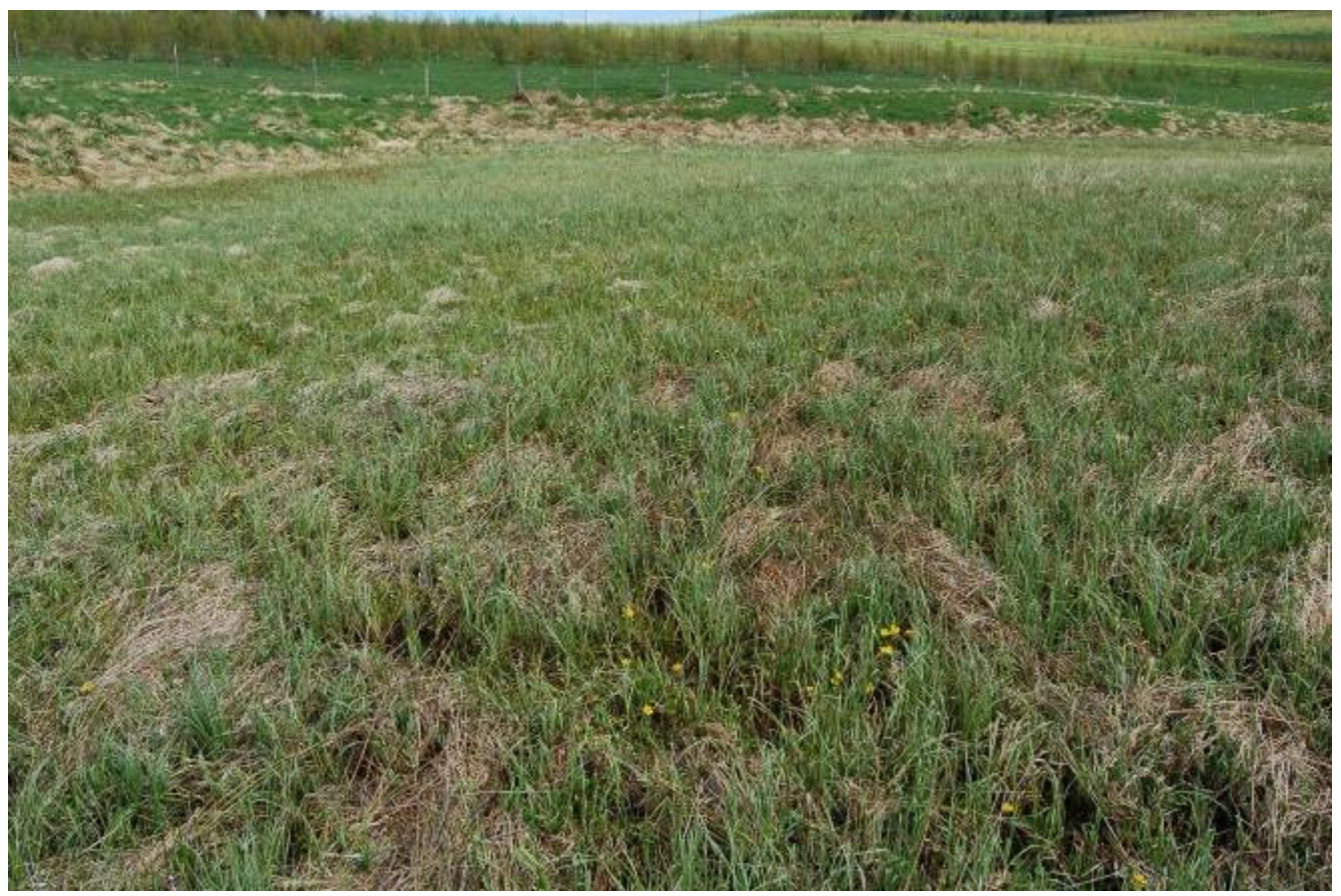
Valley mire fen, Old Merdrum, Clashindarroch Forest, Moray & Aberdeenshire Forest District. 19<sup>th</sup> May 2010.