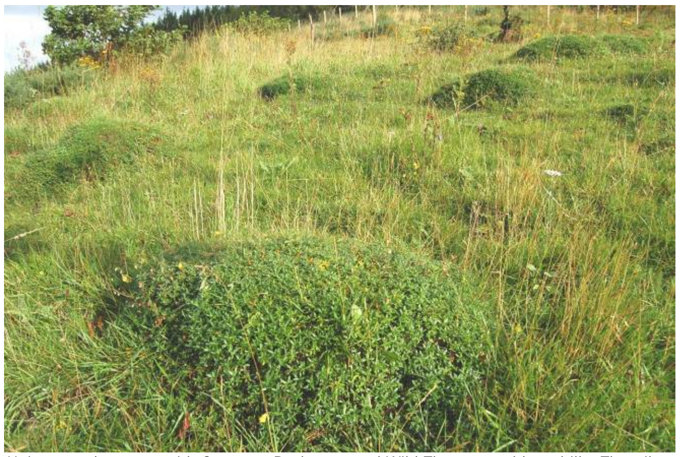
Unimproved pasture with Common Rock-rose and Wild Thyme on old ant hills. Thornilee Forest, Dumfries & Borders Forest District. Jeff Waddell, 12<sup>th</sup> September 2011.