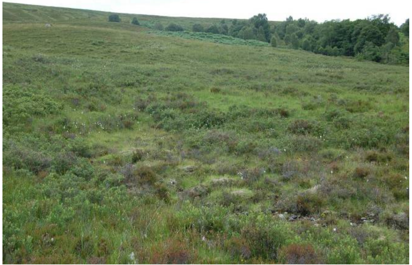
Flushed wet heath with locally frequent Broad-leaved Cottongrass, Glen Roy Forest, Lochaber Forest District. Jeff Waddell 9<sup>th</sup> July 2009.