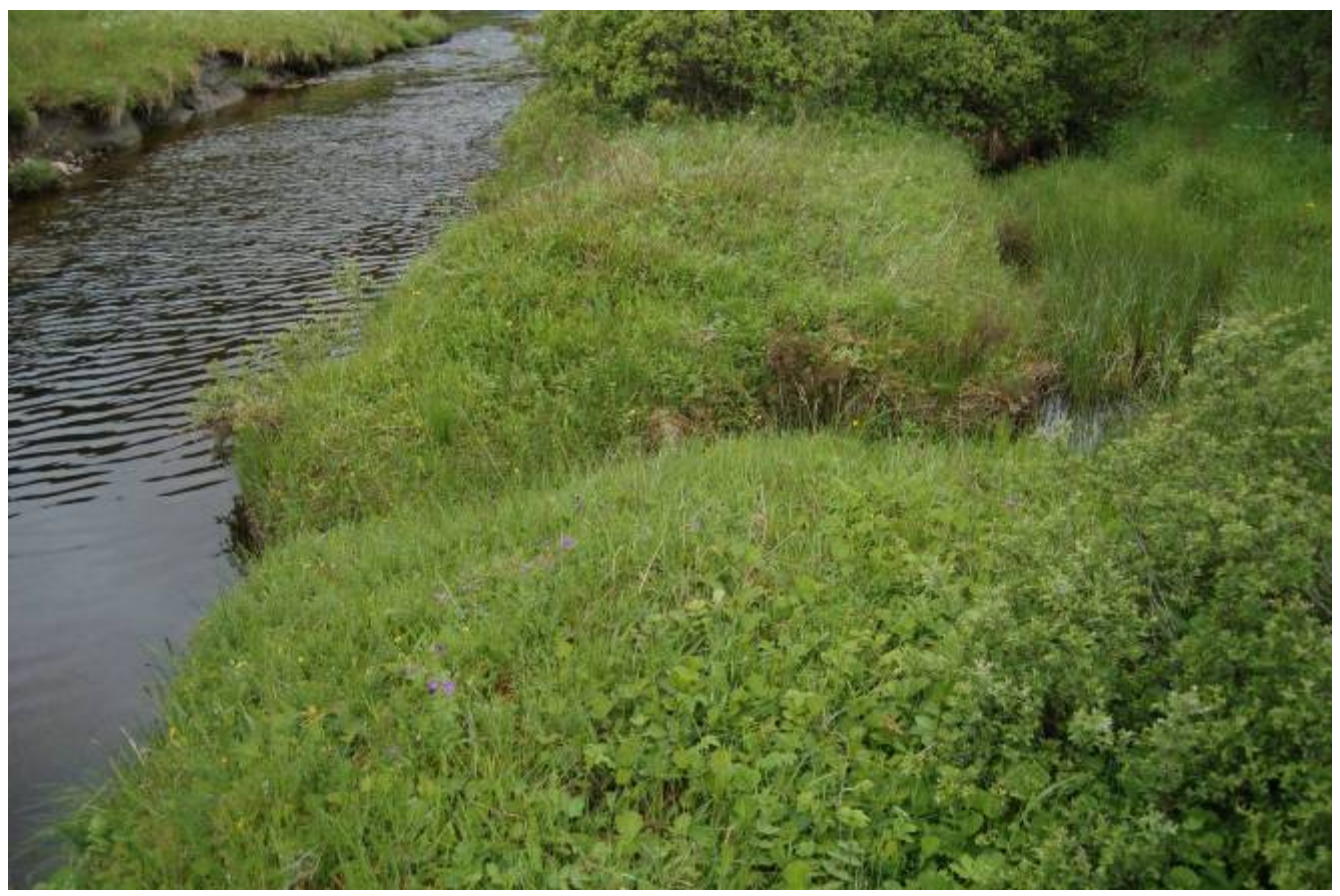
River bank with unimproved neutral grassland on alluvial soil. Wood Crane's-bill is frequent in upland hay meadow vegetation. Glen Righ Forest, Lochaber Forest District. Jeff Waddell, 15<sup>th</sup> June 2011.