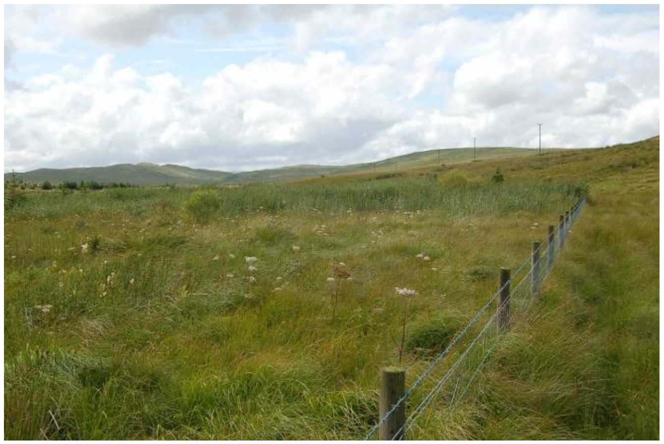
Basin mire sedge fen, Redfordgreen Forest, Dumfries & Borders Forest District. 5<sup>th</sup> August 2009.