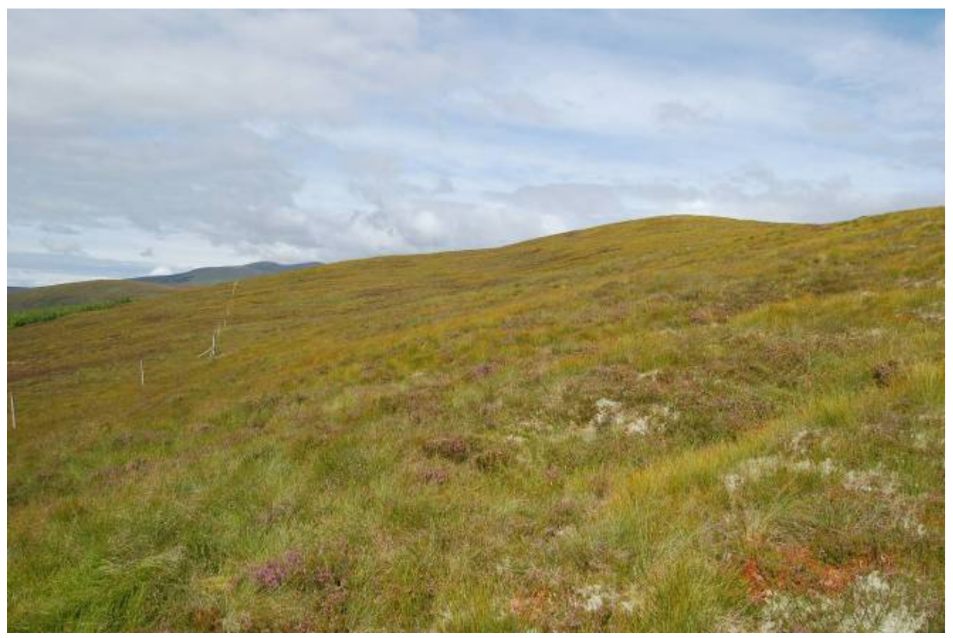
Wet heath with abundant Deer-grass, North Dalchork Forest, North Highland Forest District.