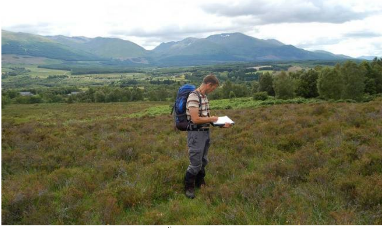
Scotland, Glen Roy Forest, Lochaber 9th July 2009.

An ecological contractor conducting open ground habitat survey for Forest Enterprise