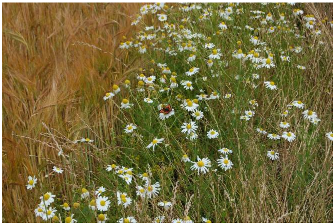
Arable field margin with Scentless Mayweed, Gourdie Forest, Tay Forest District.