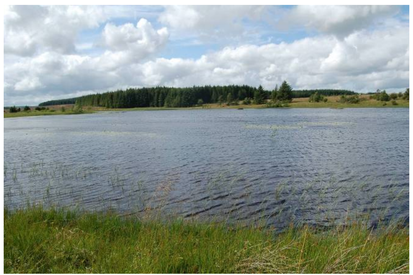
Crooked Loch, Redfordgreen Forest, Dumfries & Borders Forest District.