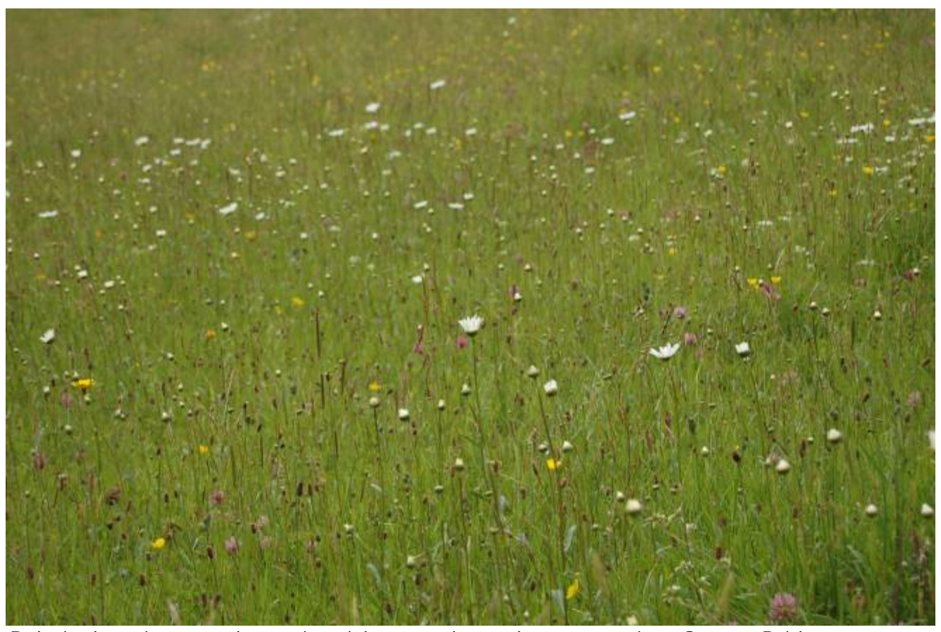
Relatively unimproved, species rich neutral meadow vegetation. Savary Bridge, Lochaline South Forest, Lochaber Forest District. Jeff Waddell, 9<sup>th</sup> June 2011.