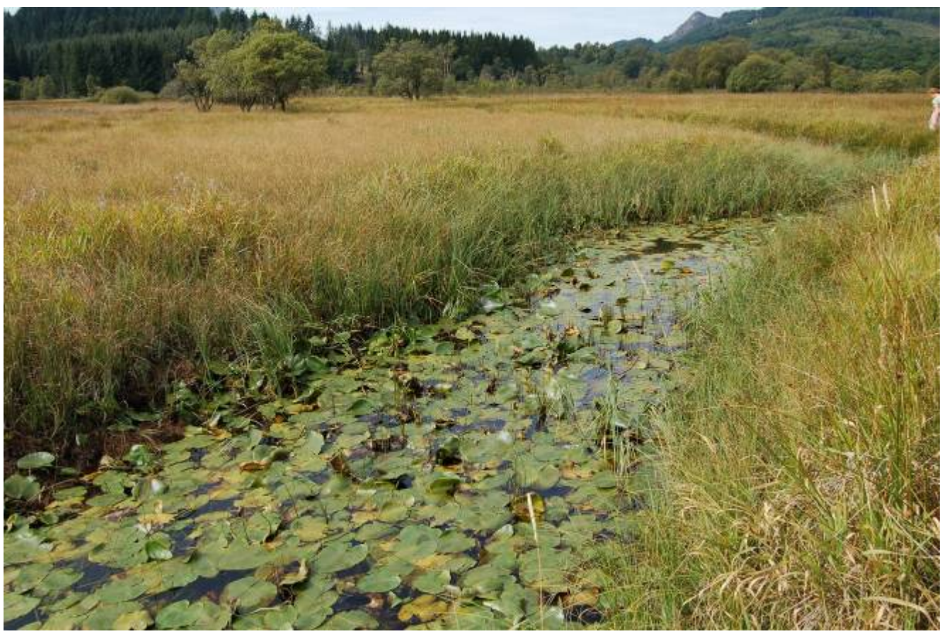
Floodplain fen, Blackwater Marshes SSSI, Achray Forest, Cowal & Trossachs Forest District. Jeff Waddell 1<sup>st</sup> September 2010.