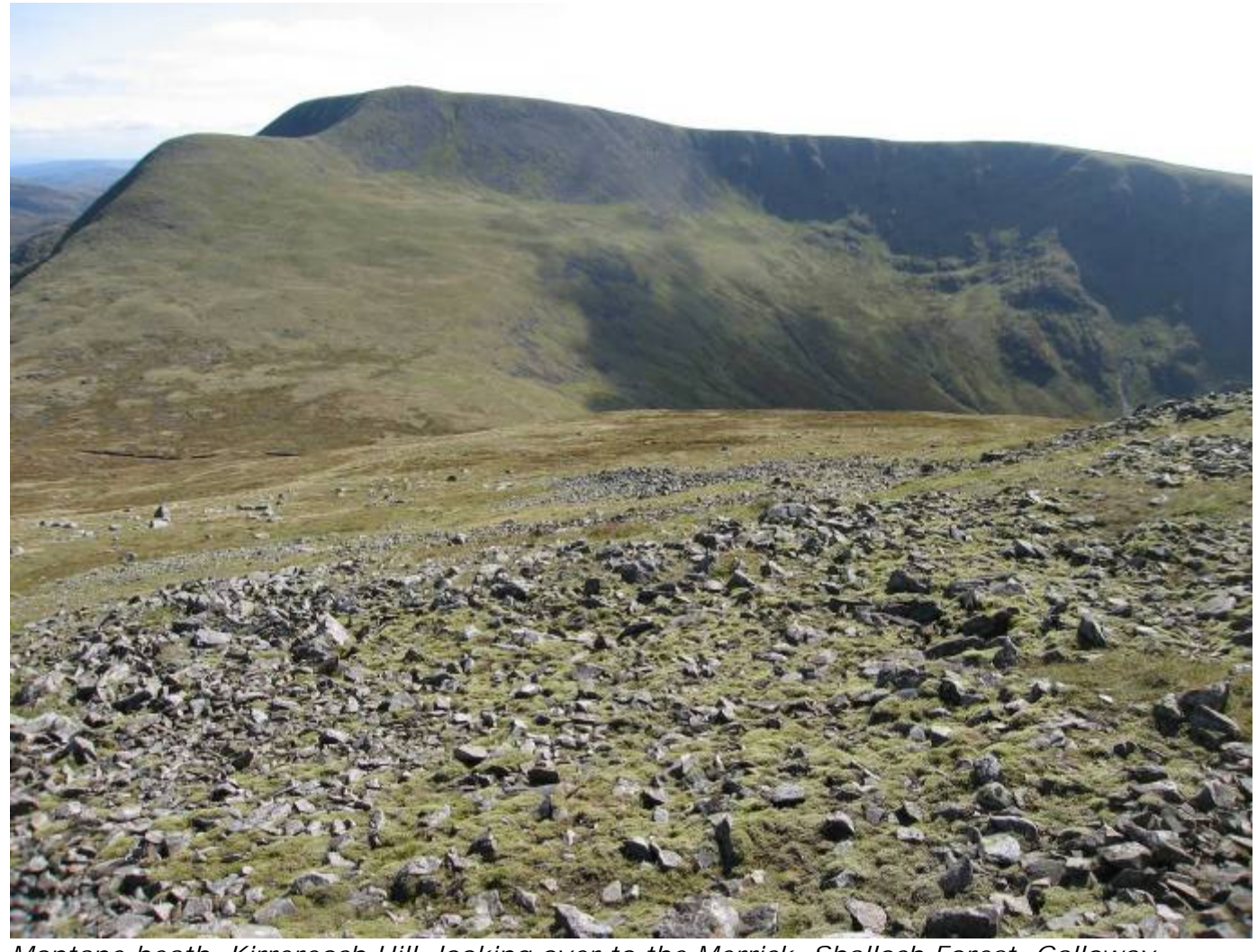
Montane heath, Kirrereoch Hill, looking over to the Merrick, Shalloch Forest, Galloway Forest District. 14<sup>th</sup> September 2009.