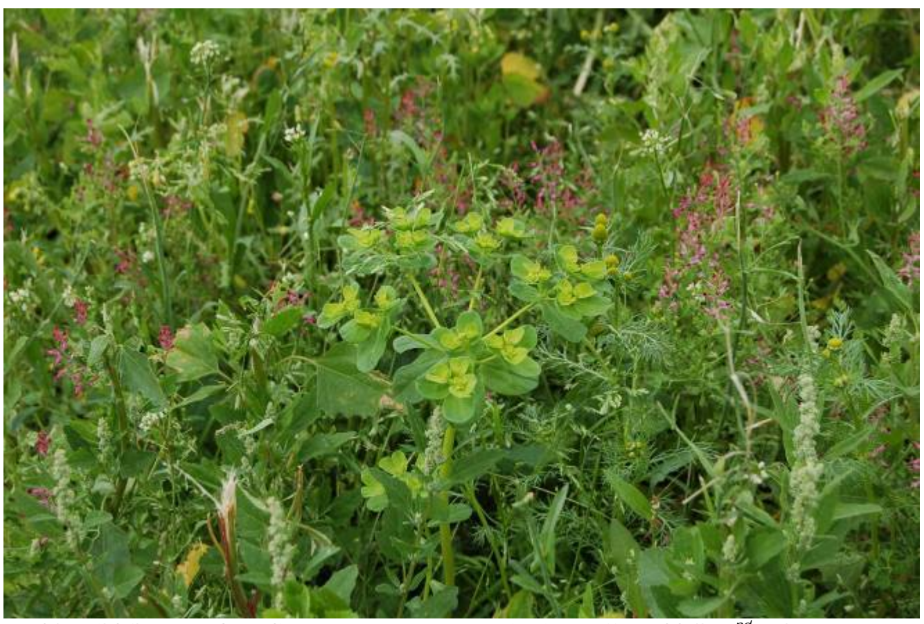
Arable wild flowers, Gourdie Forest, Tay Forest District. Jeff Waddell 22<sup>nd</sup> July 2010.