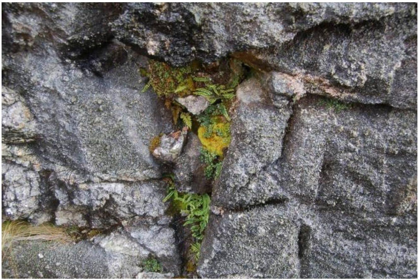
Spleenwort fern crevice vegetation, Glen Elg Forest, Inverness, Ross & Skye Forest District.