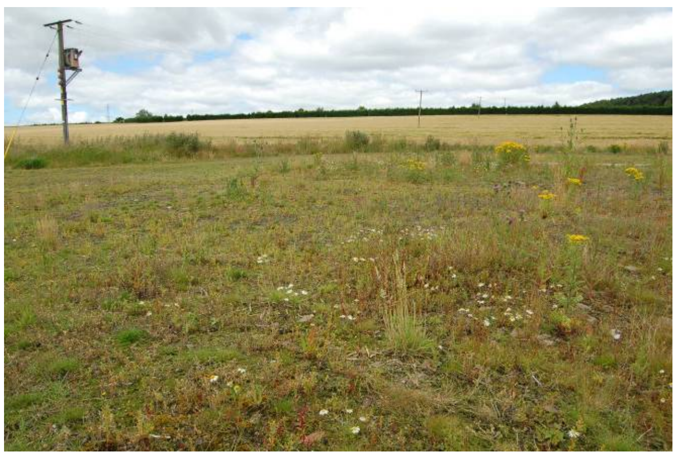
Site of old buildings with a rich ruderal flora, Gourdie Forest, Tay Forest District. Jeff Waddell 22<sup>nd</sup> July 2010.