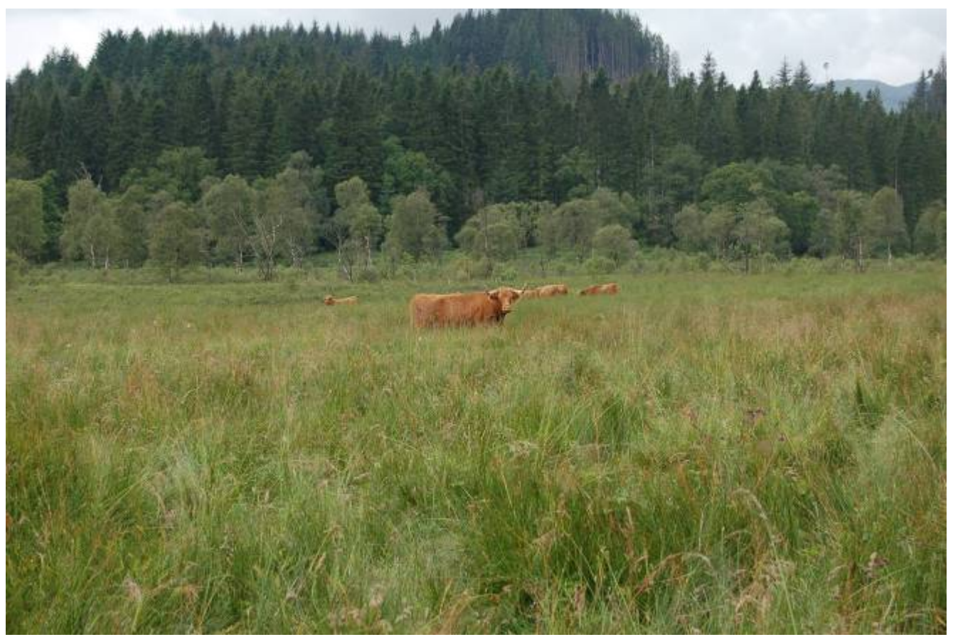
Conservation grazing of Purple Moor-grass and Rush Pasture using Highland Cattle, Blackwater Marshes SSSI, Cowal & Trossachs Forest District. Jeff Waddell, 21<sup>st</sup> July 2011.

agricultural advisor and a prioritised programme for conservation grazing will be enacted where feasible.