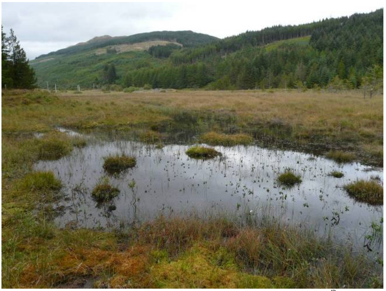
Extensive valley mire sedge fen, Glen Righ Forest, Lochaber. 15<sup>th</sup> September 2010.