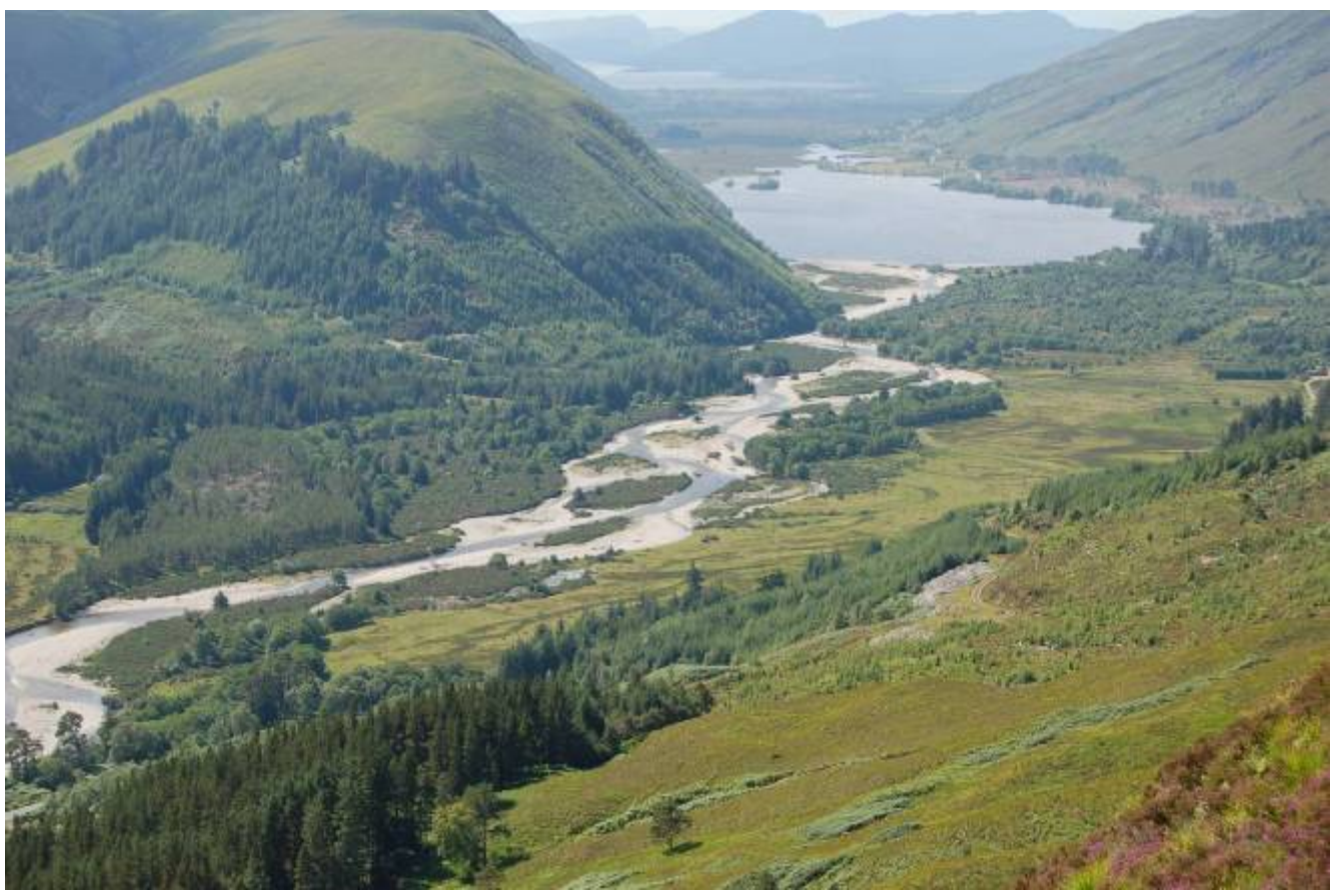
River Carron, Achnashellach Forest, Inverness, Ross & Skye Forest District.