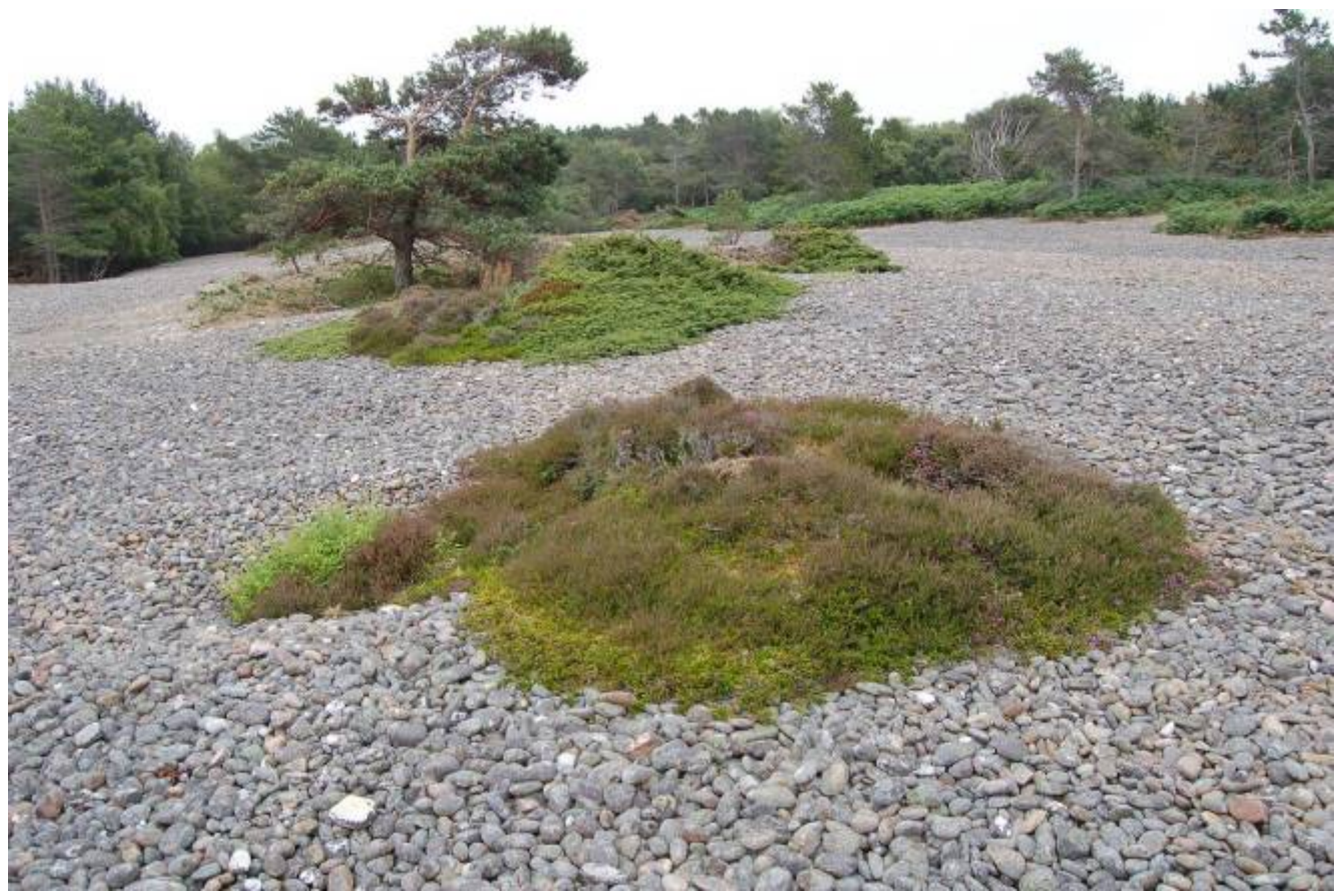
Stabilised banks of shingle, out with the reach of waves, with dry heathland, Juniper scrub and Scot's-pine woodland. Lossie Forest, Moray & Aberdeenshire Forest District. Jeff Waddell, 6<sup>th</sup> July 2011.