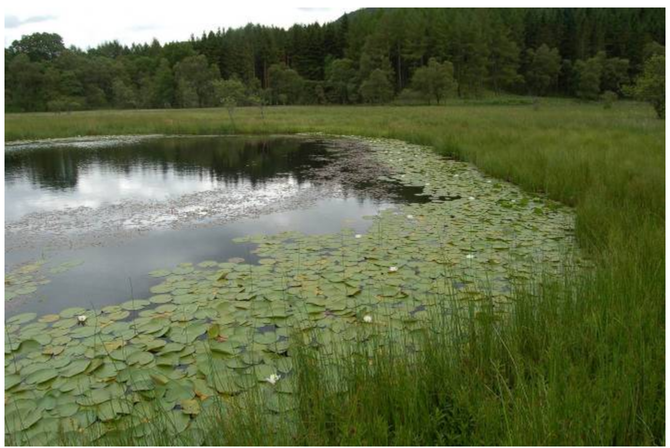
Pond in floodplain fen with White Water-lily, Strathyre Forest, Cowal & Trossachs Forest District. Jeff Waddell 8<sup>th</sup> July 2009.