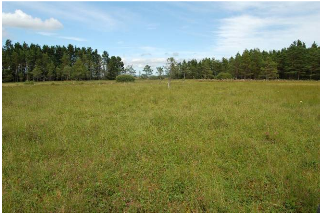
Basin mire sedge fen, Mortlach Moss SAC, The Bin Forest, Moray & Aberdeenshire Forest District. Jeff Waddell 21<sup>st</sup> July 2009.