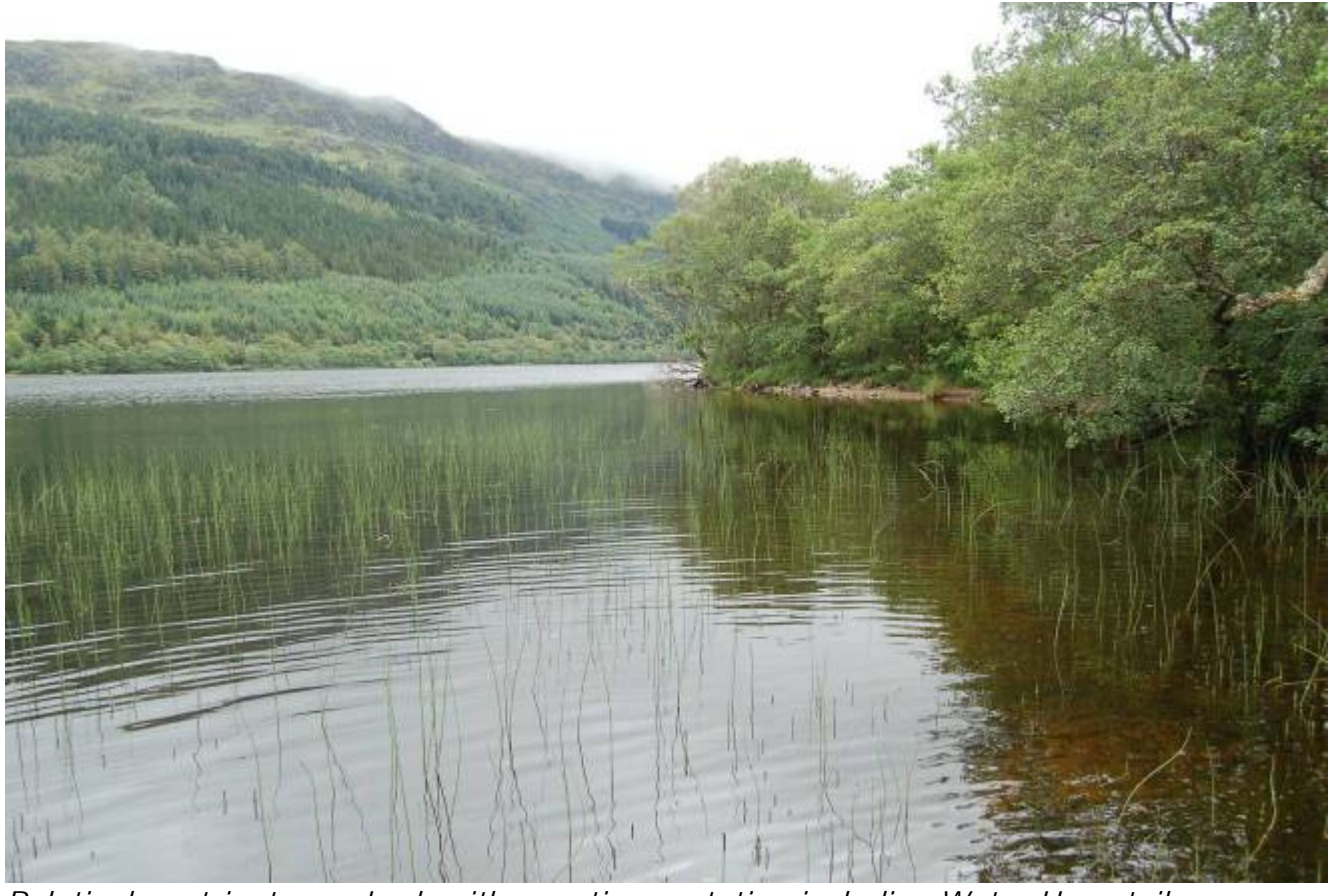
Relatively nutrient poor Loch with aquatic vegetation including Water Horsetail. Loch Eck, Cowal & Trossachs Forest District. Jeff Waddell, 20<sup>th</sup> July 2011.