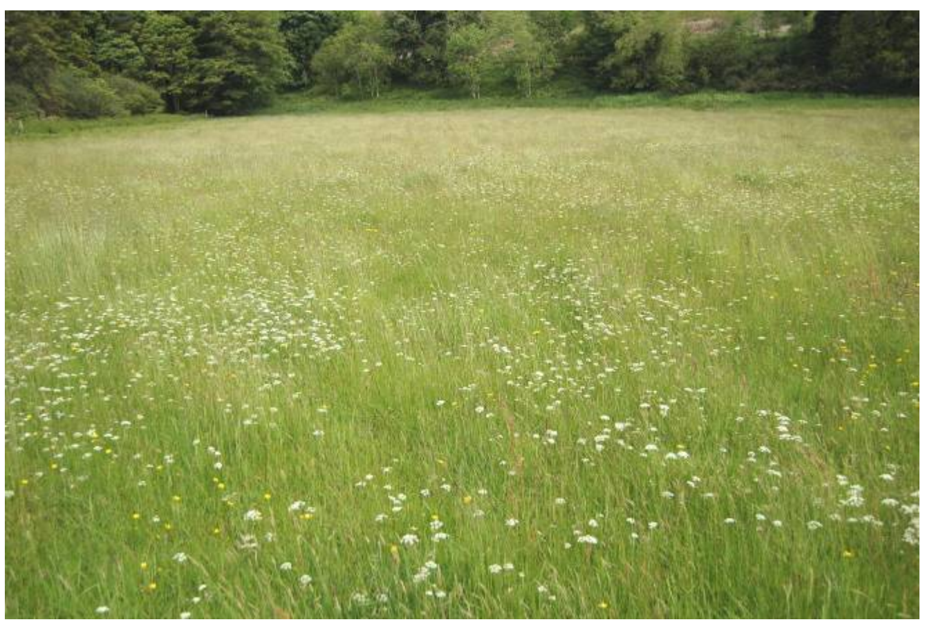
Relatively unimproved lowland enclosed grassland with abundant Pignut. Lochaline South Forest, Lochaber Forest District. Jeff Waddell, 9<sup>th</sup> June 2011.