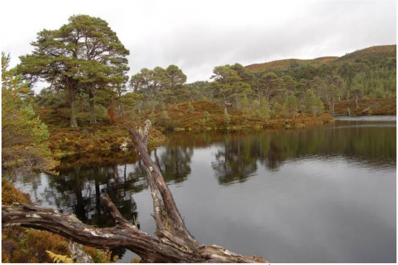
Oligotrophic or dystrophic loch, Glen Affric. Jeff Waddell 22<sup>nd</sup> September 2010.