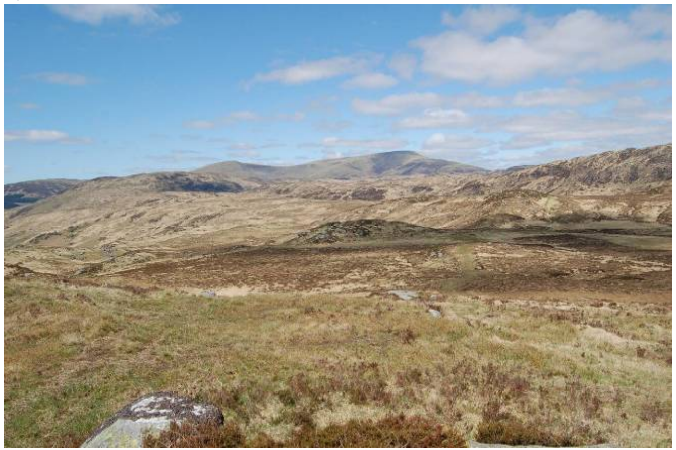
Extensive wet heath landscape with abundant Purple Moor-grass, Loch Trool Forest, Galloway Forest District. Jeff Waddell 2008.