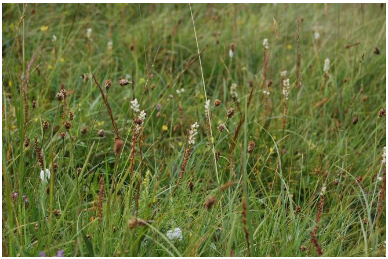
Upland calcareous grassland with frequent Alpine Bistort, Strathyre Forest, Cowal & Trossachs Forest District. Jeff Waddell 8<sup>th</sup> July 2009.