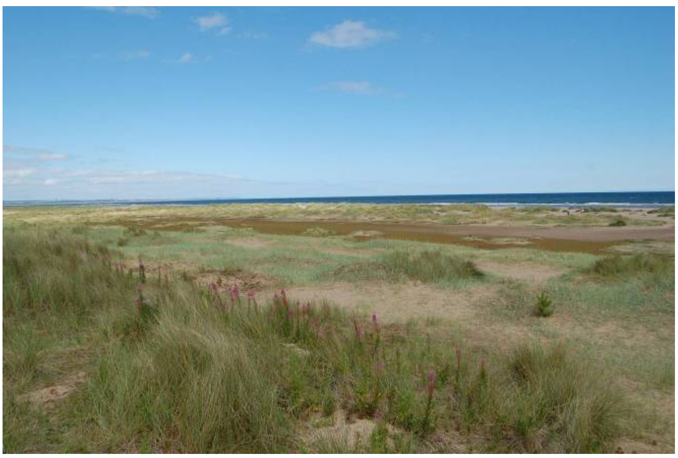
Mobile dunes with slack formation, Tentsmuir Forest, Tay Forest District. Jeff Waddell 22<sup>nd</sup> July 2010.