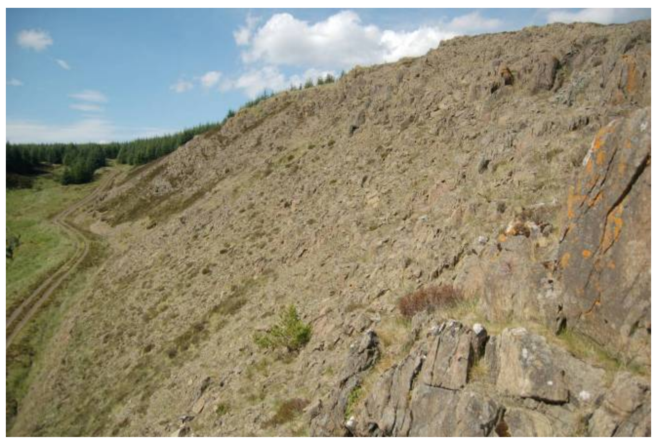
Extensive outcrop of serpentine rock with calaminarian grassland vegetation, Blackwater Forest, Moray & Aberdeenshire Forest District. Jeff Waddell, 4<sup>th</sup> July 2011.