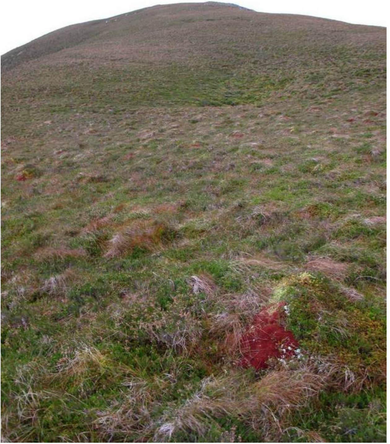
Heather-Hare's-tail Cottongrass Blanket Bog with deep peat on steep ground, Borgie Forest, North Highland Forest District. Colin Wells, 17<sup>th</sup> October 2010.