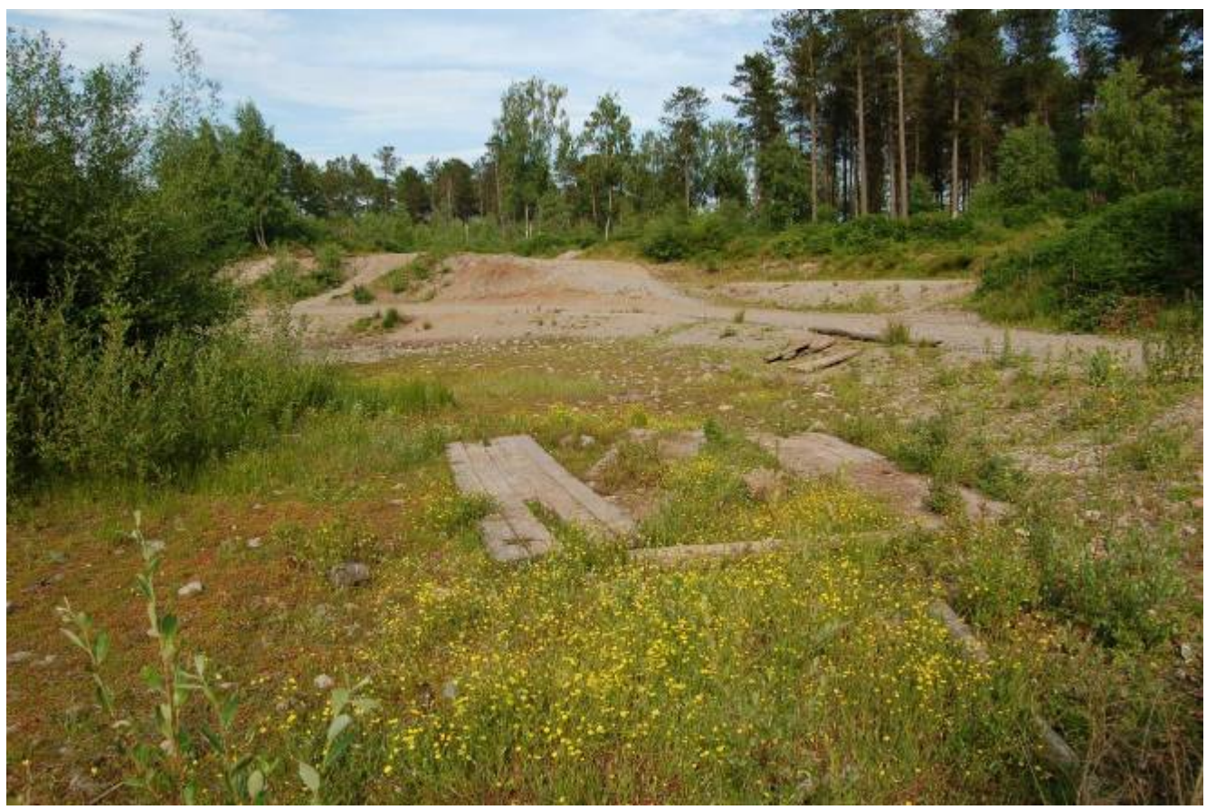
Disused sand quarry, Heathhall Forest, Dumfries & Borders Forest District.