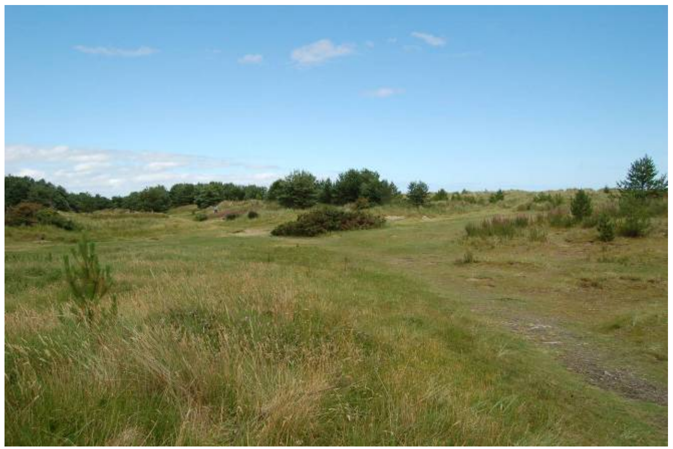
Fixed dunes with scrub and tree regeneration, Tentsmuir Forest, Tay Forest District. Jeff Waddell 22<sup>nd</sup> July 2010. Since this photo was taken tree regeneration and encroaching scrub has been removed from this area to improve the condition of the open dune habitats.