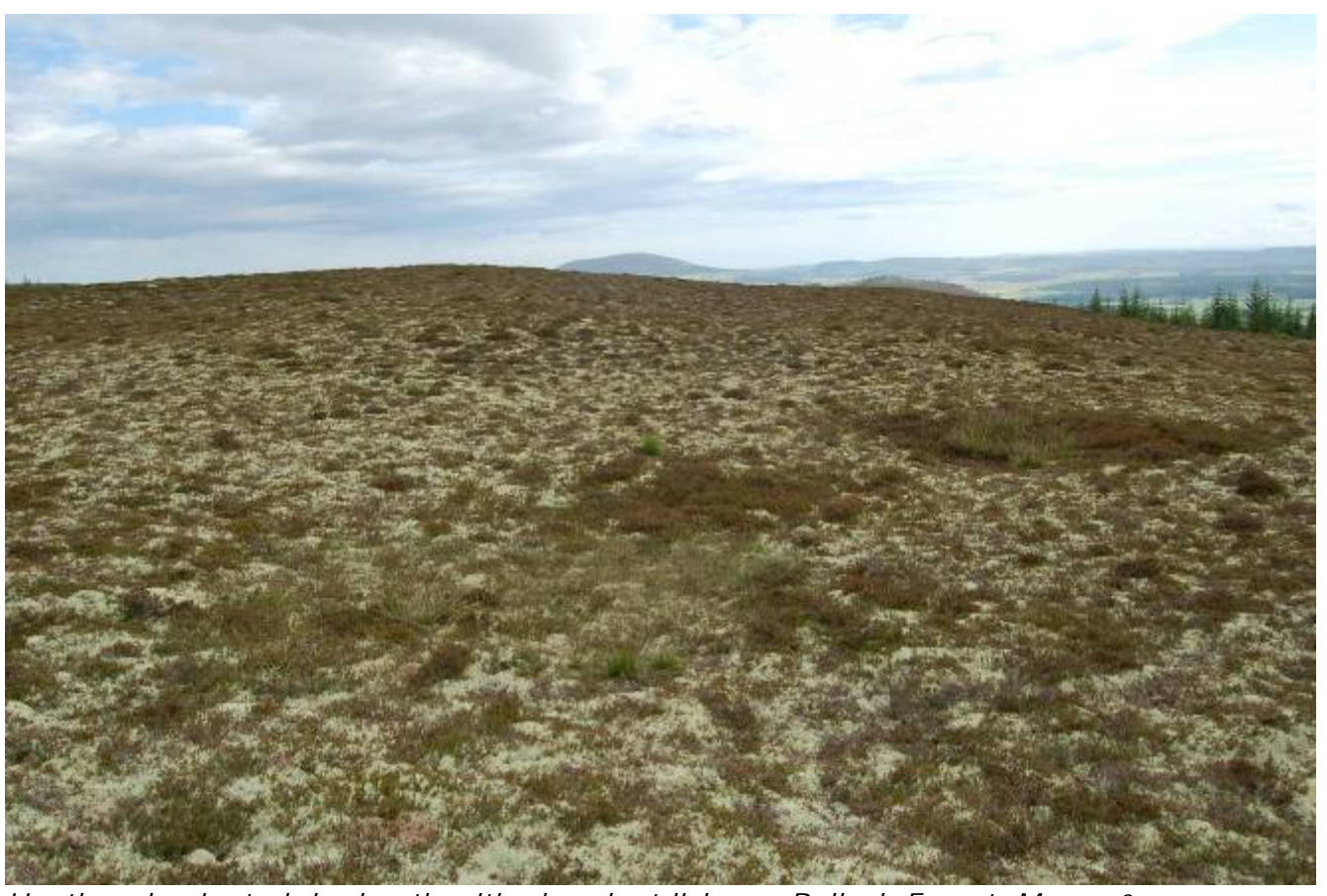
Heather dominated dry heath with abundant lichens, Balloch Forest, Moray & Aberdeenshire Forest District. 22<sup>nd</sup> July 2009.