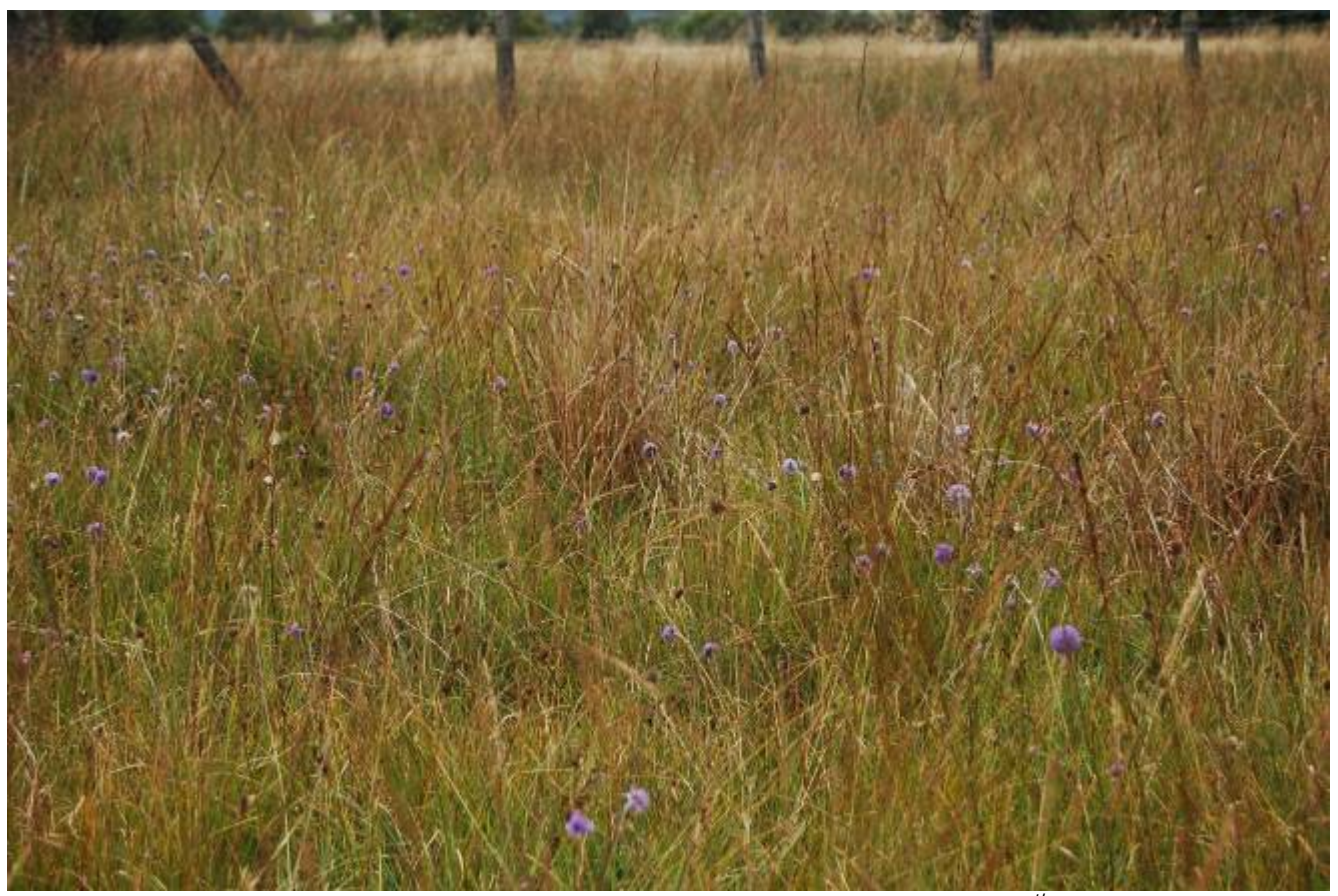
Lesmahagow Forest, Scottish Lowlands Forest District. Jeff Waddell 8<sup>th</sup> September 2008.