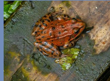
California Reg-legged Frog