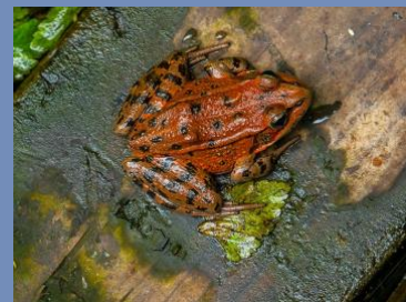
California Reg-legged Frog

All management recommendations assume that operators and land managers are following all applicable BMPs, laws, and regulations.