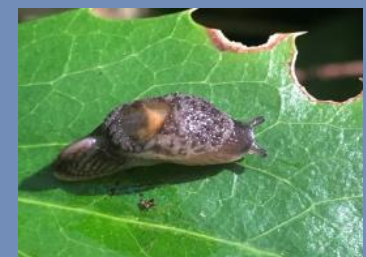
Keeled jumping slug

All management recommendations assume that operators and land managers are following all applicable BMPs, laws, and regulations.