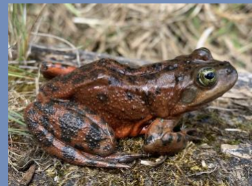
Oregon Spotted Frog