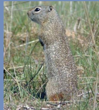
Northern Idaho Ground Squirrel