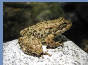
Southern Mountain Yellow- legged Frog