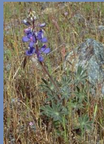
Shaggy Hair Lupine