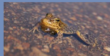
Sierra Nevada Yellow-legged Frog

All management recommendations assume that operators and land managers are following all applicable BMPs, laws, and regulations.