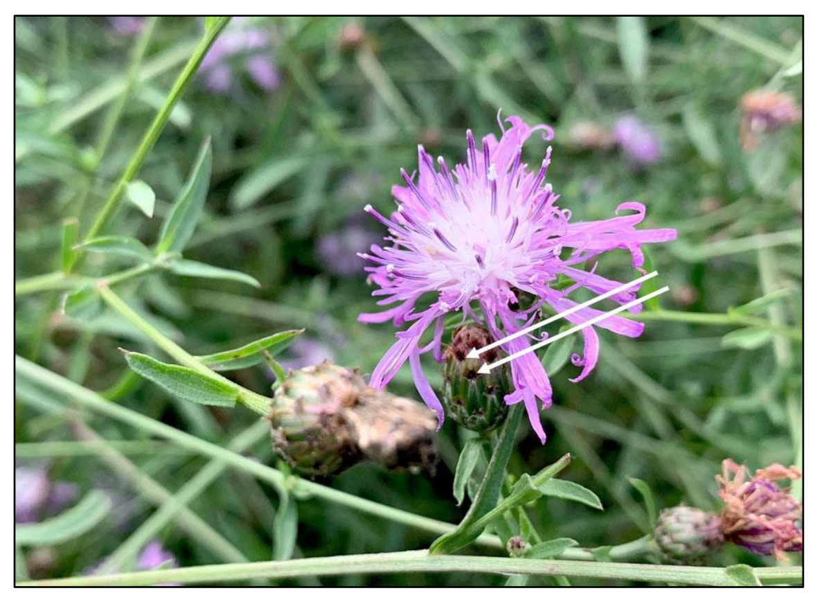
The arrows point to the spots on the bracts of the flower. These spots distinguish spotted knapweed from the similar diffuse and Russian knapweeds. This photo also shows the alternately-arranged lanceolate leaves on the upper stems.

Seeds: Seeds develop in erect, slender, green pods that turn pale brown when mature. The seeds are 0.1" long, oval, and shiny black or brown with pale, vertical lines. At the tip of each seed is a short, bristly pappus (a ring of fine feathery hairs) that enables wind dispersal. Seeds are also dispersed by seed-eating animals. Seeds can remain dormant for 5 or more years.