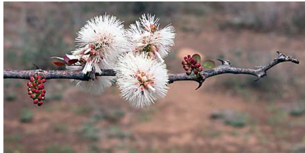
Branchlet with flowers.

Germination is epigeal. Seeds may be sown in pots or seed beds for later transplanting. Germination is usually quick with paracotyledons unfolding after 4-5 days