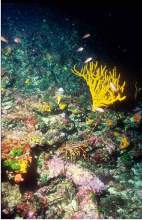
Coralligenous wall in Scandola (Corsica, France) at 48 meters depth.